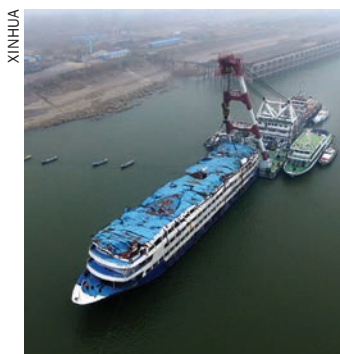
The ship Eastern Star

tigation team found that 36 local government and Communist Party officials and seven people from the shipping company should be given administrative punishments for flaws in management, which would likely include demotions and firings.