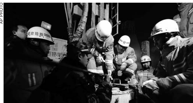
Rescuers try to contact the trapped people at a collapsed mine in Pingyi County

R ESCUERS using infrared cameras to peer into darkness at a wrecked mine in eastern China yesterday found eight surviving miners who were trapped for five days after a collapse so violent it registered as a seismic event.