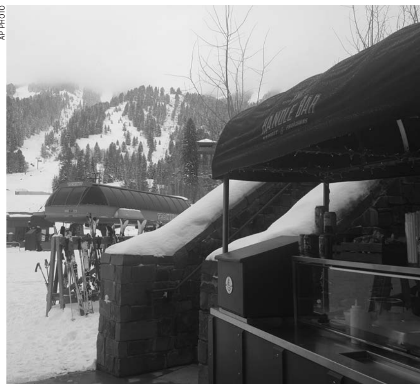
The Handle Bar at the Four Seasons Resort Jackson Hole, where a gourmet food cart steps from the ski area's lifts and gondolas

S KI resorts are upping the ante, finding new ways this season to pamper guests who barely want to leave the slopes.