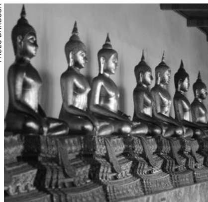
A Buddhist temple in Bangkok, Thailand

The value of merchandise exports dropped by 6.6 percent year-on-year. "This reflected both a decline in quantity and a decrease in export prices due to the economic slowdown in China and ASEAN coun-