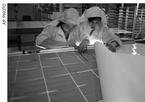
Workers assemble solar panels at a factory in Hefei, in central China's Anhui province

The move, which will come into effect on January 1, could help ease the mis-