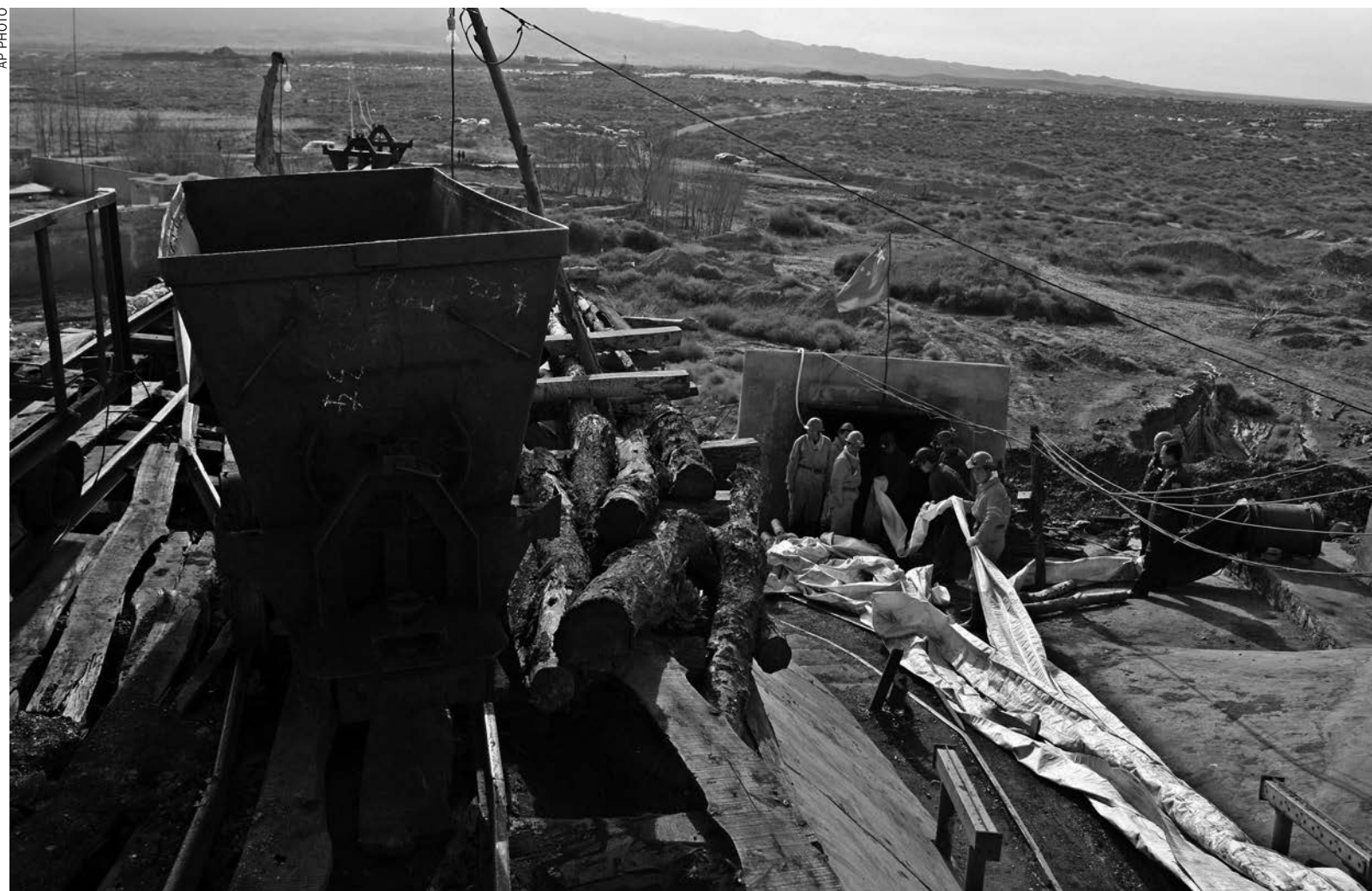
A coal mine in Jingtai county in northwest China's Gansu province

more than 21 percent and have at least 20 gigawatts of new wind power installations and 15 gigawatts of additional photovoltaic capacity next year, according to the NEA statement.