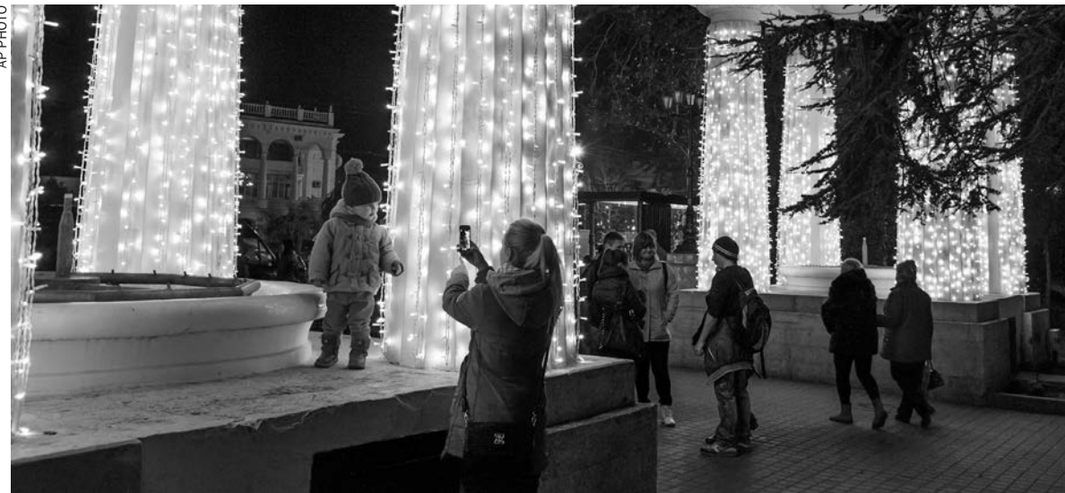
People take pictures at Nakhimov's Square in Sevastopol, Crimea

While Ukrainian nationalists and Crimean Tatars who oppose Russian annexation vengefully cheered the blackout, most of Crimea's people appear to see it as confirmation they did the right thing by voting to split off from Ukraine.