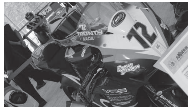
Russell Mountford's bike is exhibited in Macau ahead of the GP

"For me to be able to race at the level I have and on the circuits I have, I'm very proud to have done it. I have more than achieved all my goals through the years and I've always put 110