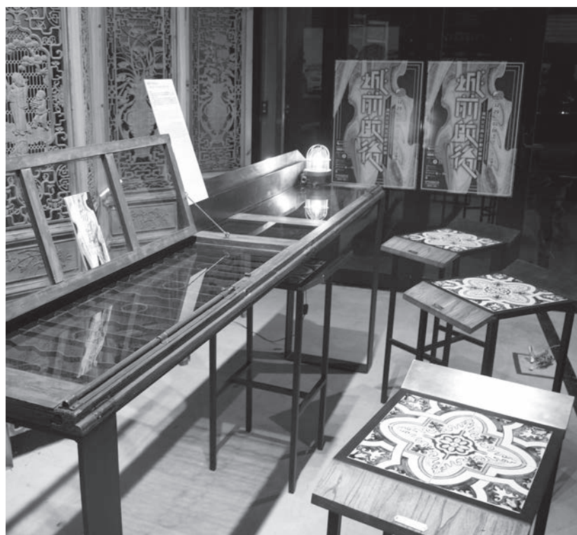
A drinks table and chairs with Portuguese-style tiles

In fact many of the pieces in this exhibition have been inspired by, and contain parts of,