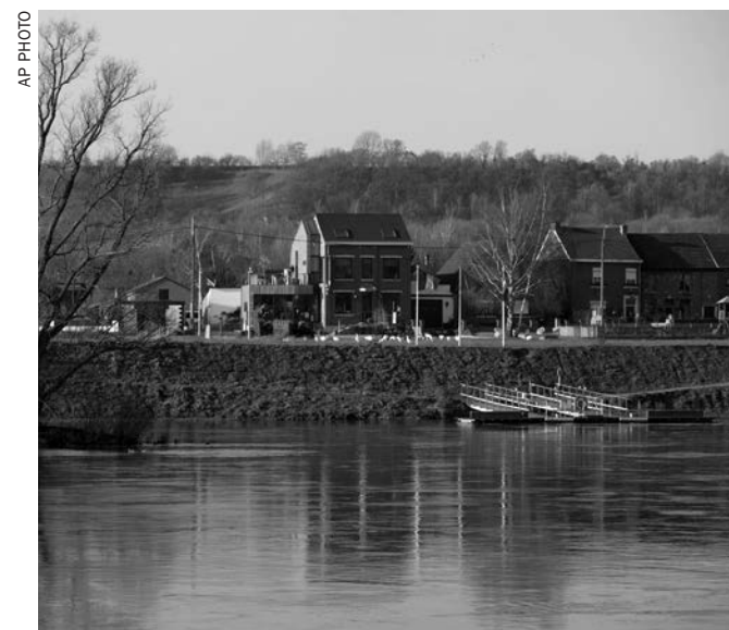
The Belgian and Dutch flags flap in the wind at the ferry port of Lanaye, Belgium

Preparatory work has been done and the two nations' parliaments should be able to complete a deal sometime in 2016, Neven said, almost two centuries after the 1843 border posts were set. And all with a smile on everyone's face, even though Belgium will get only a tiny part around a