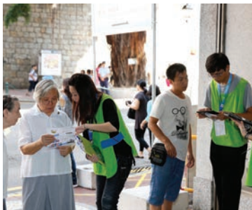
Staff assist electors during the latest AL election in Macau

Such activities are strictly banned during the campaign