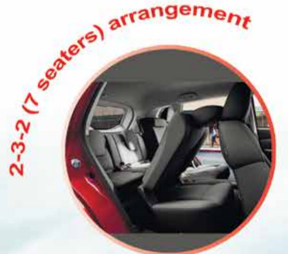
2-3-2 (7 seaters) arrangement