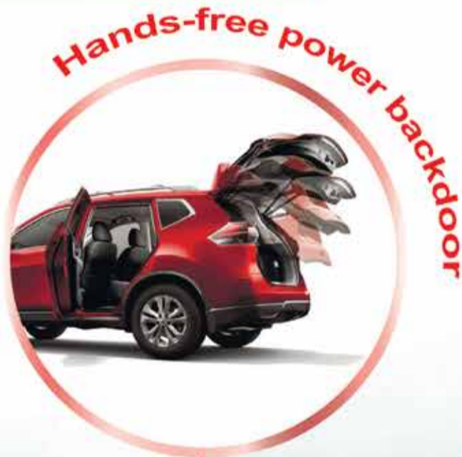
Hands-free power backdoor