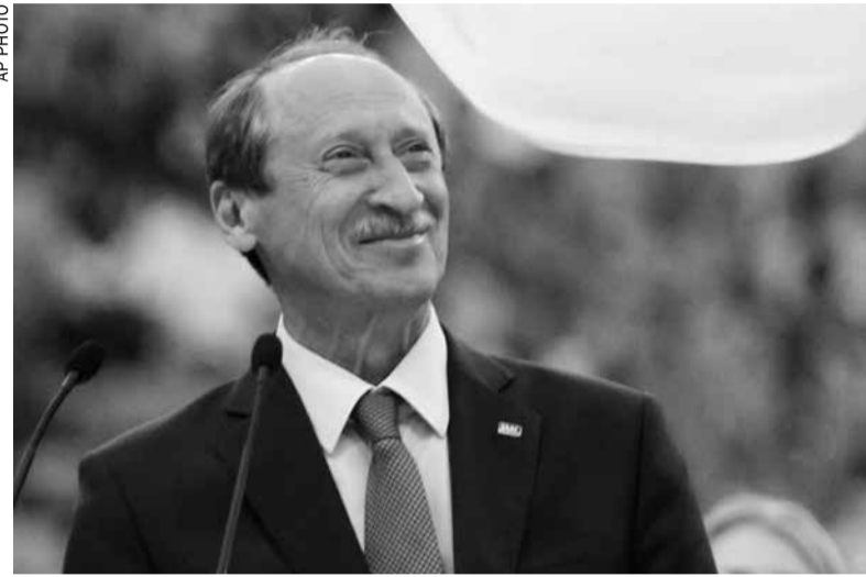
Russian Athletics Federation President Valentin Balakhnichev

Two internal IAAF papers before the London Olympics proposed not publishing doping sanctions for lesser-known Russians. That would have violated WADA rules and the notes themselves specified that the