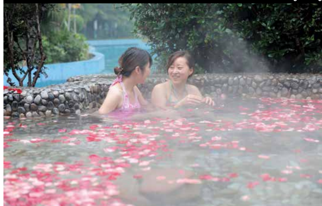
Two women brave the cold weather while bathing in a hot spring on Tuesday in Chuzhou, a city located in east China's Anhui Province.