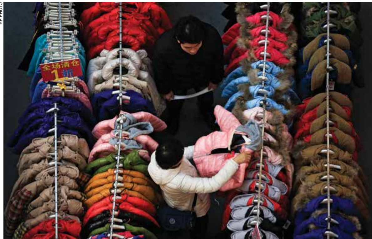
A salesperson tends to a woman selecting winter clothes at a store having promotion sale in a shopping mall in Beijing