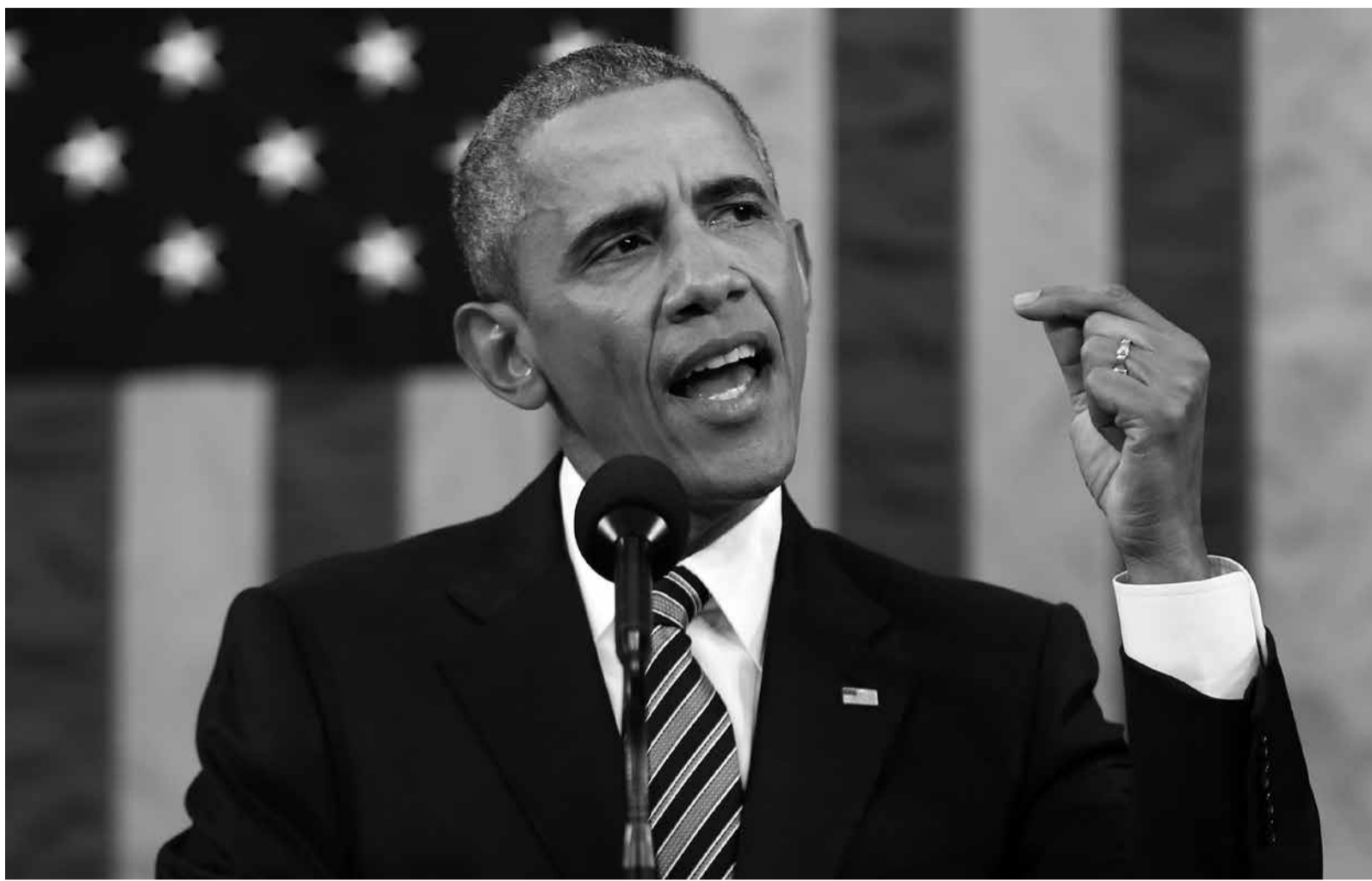
President Barack Obama