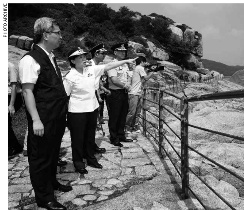
Wong Sio Chak inspects the coastal border

Meanwhile, the Judiciary Police will focus on information