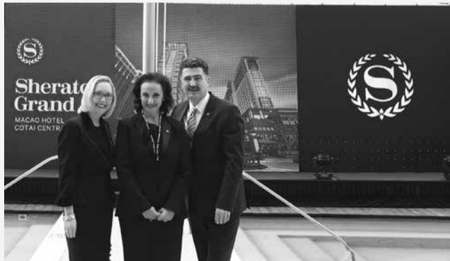
Senior executives at the newly-designated "Sheraton Grand Macao"

The Sheraton Macao Hotel located in Cotai Central has now become the Sheraton Grand Macao Hotel, as revealed in an announcement from the group. It signifies an eleva-