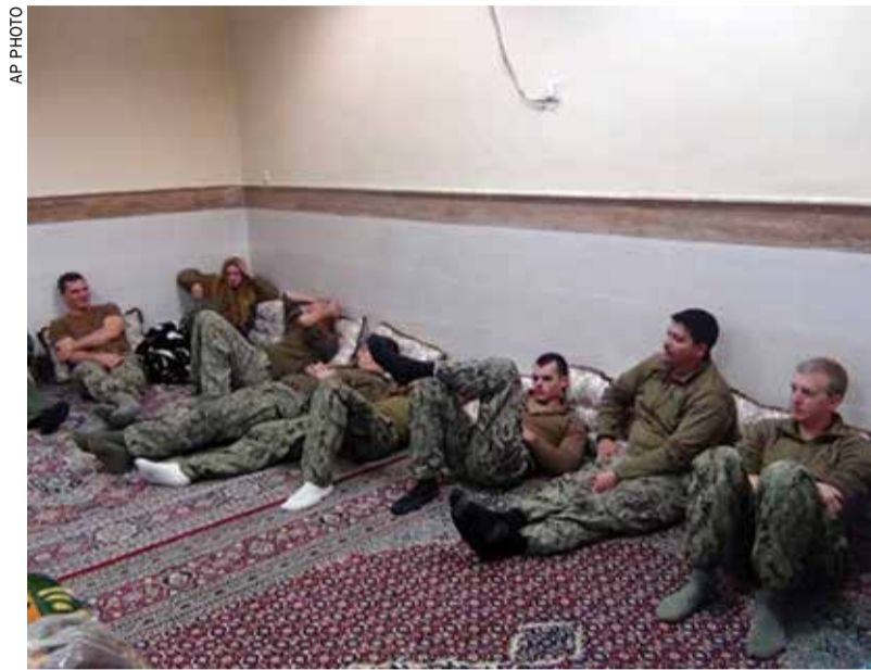
Detained American Navy sailors in an undisclosed location in Iran

circumstances that led to the sailors' presence in Iran," the U.S. statement said.