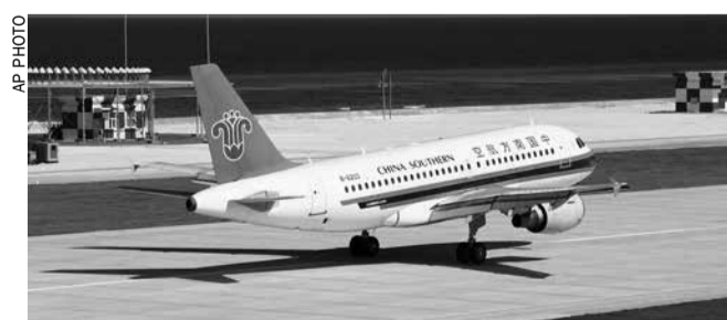
A China Southern Airlines jetliner lands at the airfield on Fiery Cross Reef, known as Yongshu Reef in Chinese, in the Spratly Islands

Vietnam and China both claim the Paracel Islands and the two along with the Philippines, Malaysia, Brunei and Taiwan claim all or parts of the Spratlys, which sit on potentially oil and gas rich resources and occupy one of the world's busiest shipping lanes.