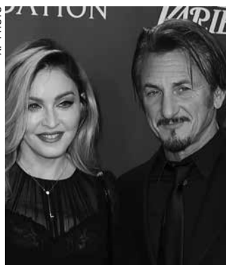
Madonna, left, and Sean Penn arrive at the 5th Annual Sean Penn & Friends HELP HAITI HOME Gala Benefiting at the Montage Hotel on Saturday in Beverly Hills, California

some controversial left-leaning opinions on world politics, has also reportedly said that he hopes his critics "die screaming of rectal cancer."