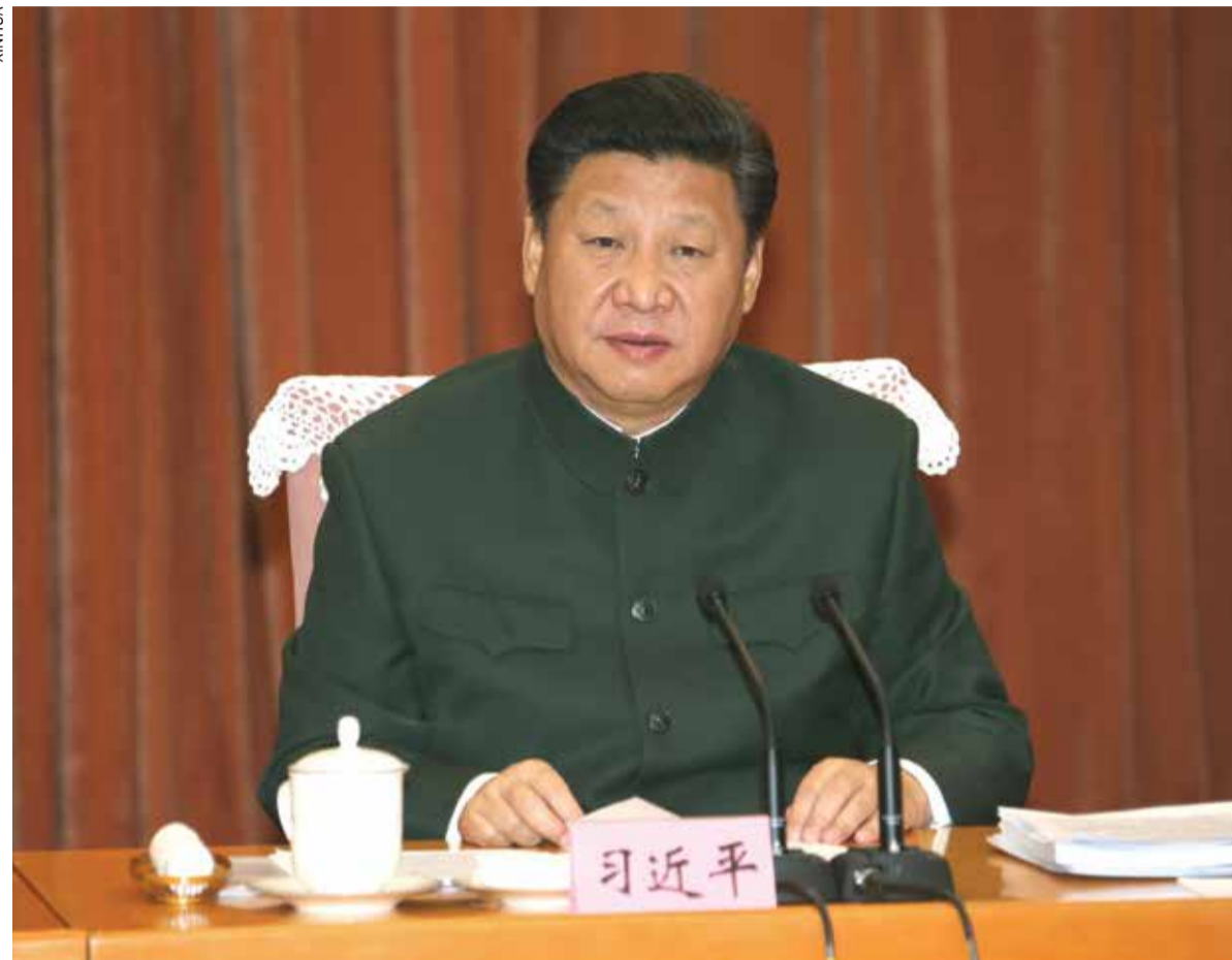
President Xi Jinping, also chairman of the Central Military Commission, makes remarks during a meeting with the new heads of the reorganized organs of the CMC this week, in Beijing

Xi warned soon after taking power in late 2012 that corruption threatened the legitimacy of the ruling Communist Party and pledged a relentless effort to stamp out graft at all level of Chinese society. The campaign