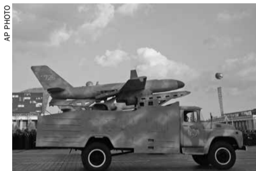
A drone is paraded in Pyongyang

S OUTH Korea yesterday fired 20 machine gun warning shots after a North Korean drone briefly crossed the rivals' border, officials said, the first shots fired in a Cold War-style standoff between the Koreas in the wake of the North's nuclear test last week.