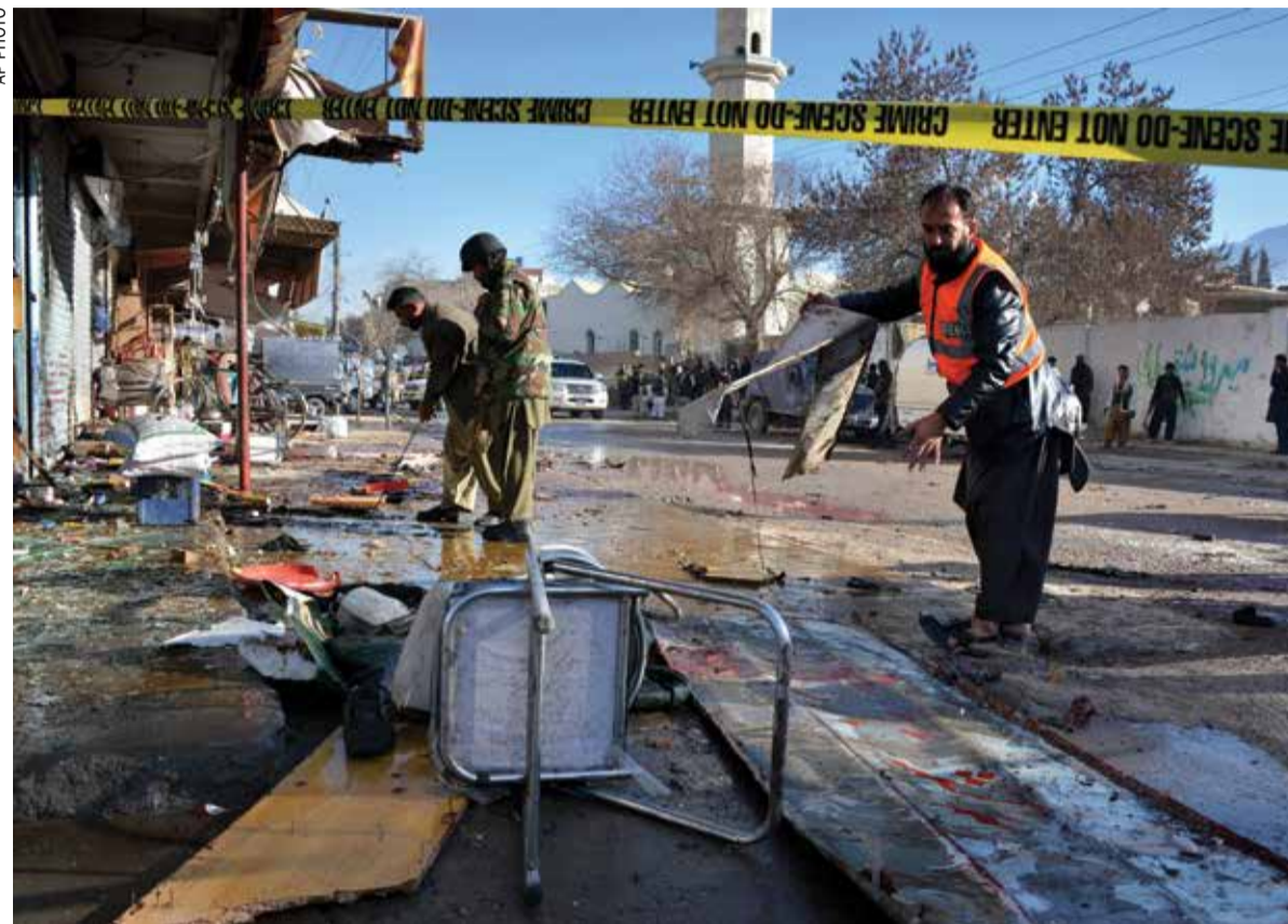
Pakistani security officials examine the site of suicide bombing in Quetta