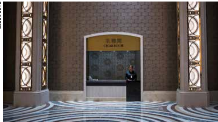
An employee stands at a cloakroom outside the casino floor at the Studio City casino resort

However, there is at least a 10 percent increase for each quarter when compared to the same quarter in 2014.