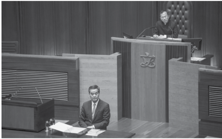
CY Leung listens to legislators during the Policy Address presentation

CY LEUNG said yesterday that the government is considering developing the HKSAR into a "smart city," which would include the expansion of free Wi-Fi services. Such services would be made available at bus stops and shopping centers. Hong Kong, which has ranked first globally in technology infrastructure for five consecutive years, currently has over 17,000 free Wi-Fi "hotspots". Leung wants to double the number of hotspots within three years to provide the free services at all public rental housing estates, public hospitals, markets, park, sitting-out areas, promenades and tourist spots. "The internet is of increasing importance to us," Leung said, adding that the speed of Wi-Fi connections should also be improved and security ought to be enhanced.