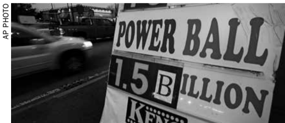
A look at the record USD1.5b Powerball drawing

T HE Powerball jackpot has climbed to over USD1.5 billion, easily surpassing all other lotteries to become the largest such prize in the world. The draw is due today at 11:59am (Macau time).