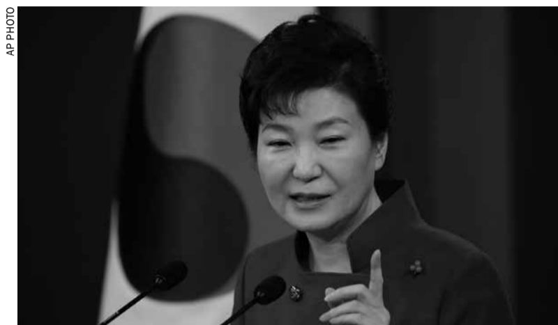
South Korean President Park Geun-hye

"Holding the hands of someone in a difficult situation is the mark of the best partner," Park said, referring to China and South Korea's need to punish the North. "I trust China, as a permanent member of the Security