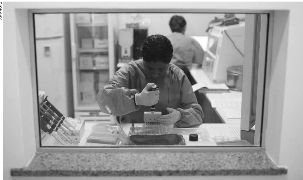
A graduate student works on analyzing samples to identify the Zika virus in a laboratory at the Fiocruz institute in Rio de Janeiro, Brazil

In any case, teams will scour Rio's Olympic and Paralympic sites daily, looking for stagnant waters that are the breeding grounds for the Aedes aegypti mosquito that transmits Zika, as well as dengue