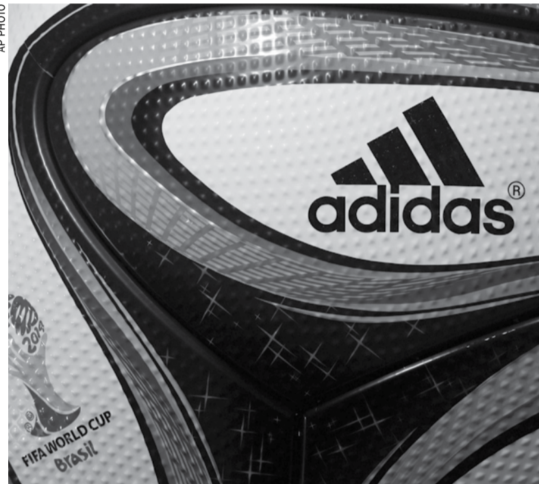
The Adidas logo on a FIFA World Cup soccer ball

Other IAAF leaders were at fault, too, the WADA panel's damning report said. They must have known of the nepotism that allowed Lamine Diack to turn the International Association of Athletics