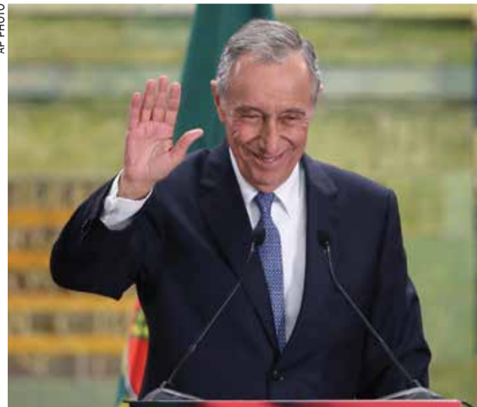
Marcelo Rebelo de Sousa