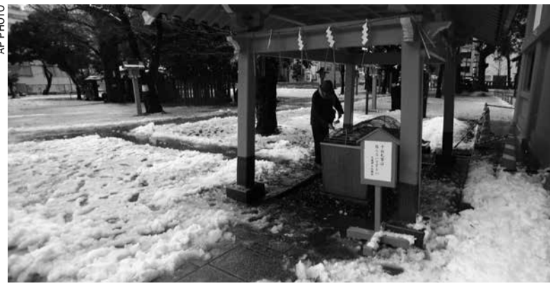
A temple in Tokyo

Japan is increasingly relying on tourism as businesses cut investment and households curb