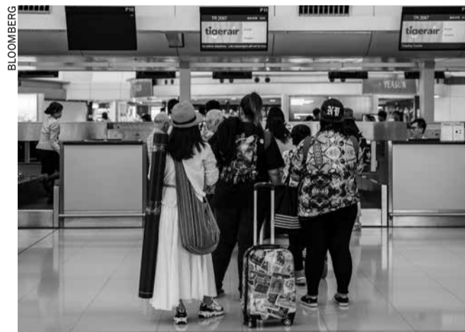
Customers stand in line at a Tigerair check-in counter at the Hong Kong airport