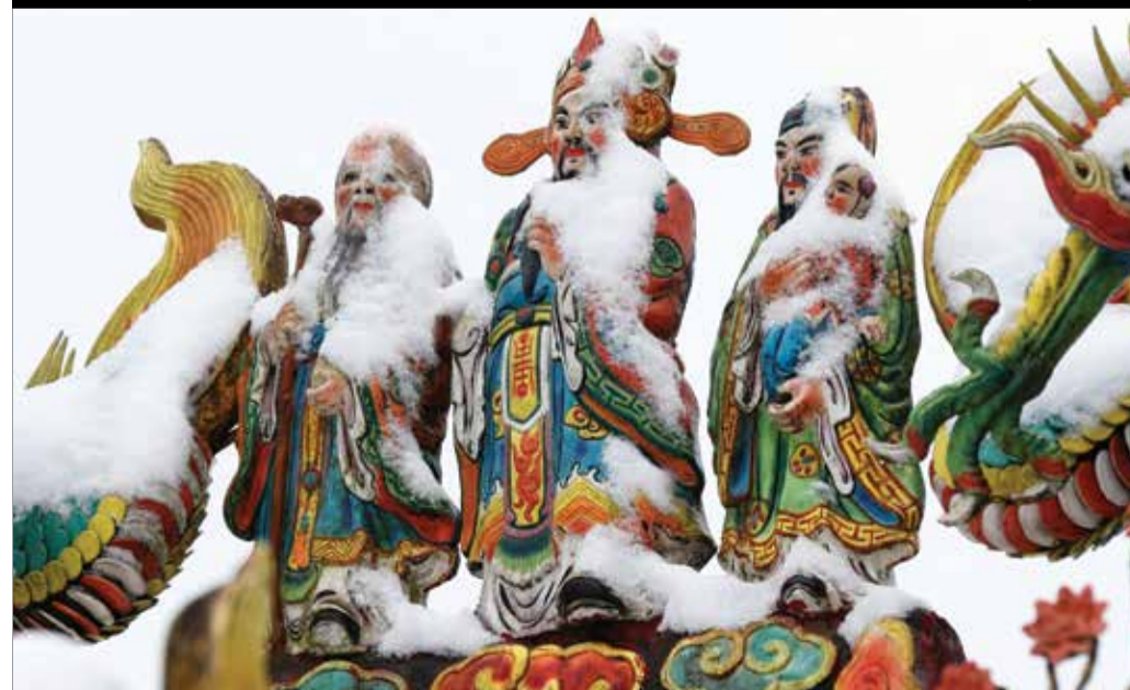
Frozen deities. Snow sits on the Chinese god statues at the Pinglin temple in the high mountain area of New Taipei City, yesterday. An unusually cold weather front that caused sudden drops in temperatures has been blamed for killing as many as 57 people in Taiwan's greater Taipei area (see more on page 3).