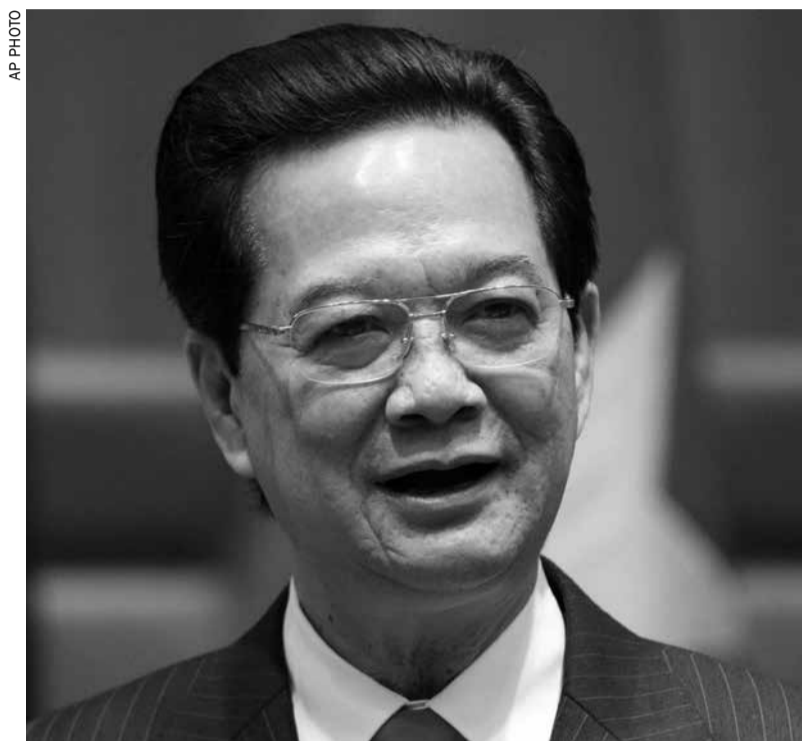
Vietnamese Prime Minister Nguyen Tan Dung

Several delegates at the congress said Dung decided on Sunday to abide by party rules that obliged him to refuse the nomination for a Central