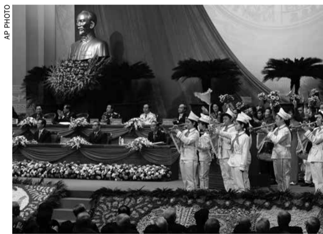
Communist Pioneers' league members play music to welcome delegates during the opening ceremony of the Communist Party of Vietnam's 12th Congress in Hanoi

MENDING TIES. China's Xi made a state visit to Vietnam in November 2015, during which he and Trong agree to limit their differences and maintain peace and stability. Xi said