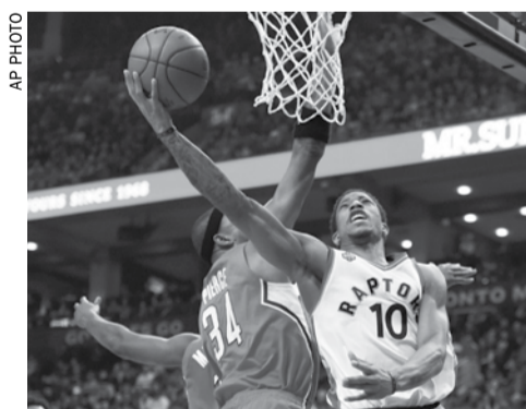
Toronto Raptors' DeMar DeRozan drives to the basket against Los Angeles Clippers' Paul Pierce

Trevor Ariza scored a season-high 29 for the Rockets, who trailed by one entering the fourth quarter, but hit 4 3-point-