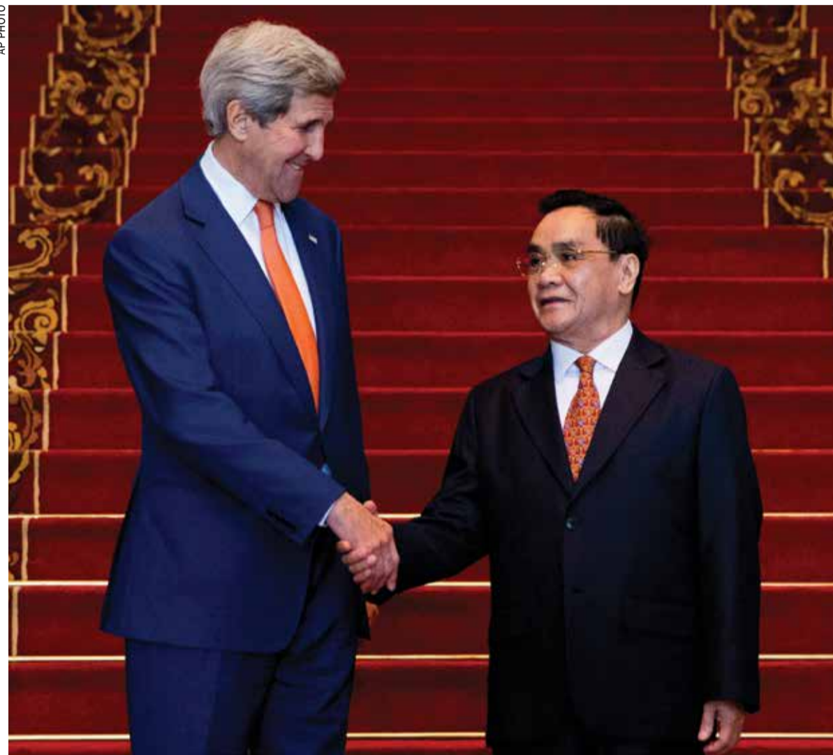
U.S. Secretary of State John Kerry (left) shakes hands with Lao Prime Minister Thongsing Thammavong after their meeting at the Prime Minister's Office in Vientiane, Laos

But other ASEAN nations are more pro-China, including Cambodia, which blocked ASEAN from reaching consensus on the South China Sea during its 2012 chairmanship of the group. Cambodia is Kerry's next stop on an around the world diplomatic marathon this week that will also take him to China.