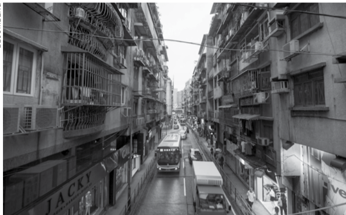
Traffic pass residential buildings in Macau

Gonçalves largely praised the agreement, particularly the part that pledges USD100 billion annually from 2020, which would assist developing countries in reaching their goals to reduce carbon emissions. "This