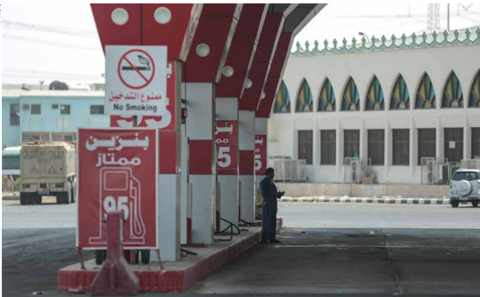
A worker waits for cars at a gas station in Mecca, Saudi Arabia