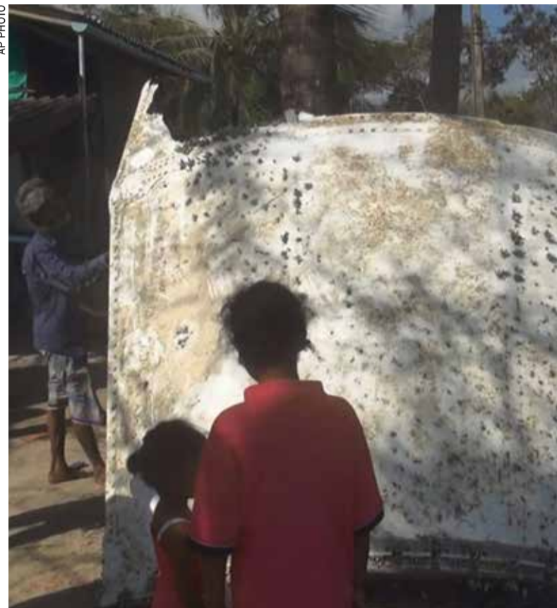
Thai people look at a large chunk of metal found on a beach in Nakhon Si Thammarat province, Thailand

Thai air force and civil aviation authorities said they were unaware of the statement from Japan, while the agency within the Transport Ministry that investigates aviation accidents was unavailable for