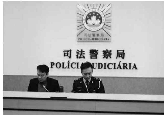
Yesterday's police press conference

All seemed to be running smoothly until, on January 12, the model returned to the house af-