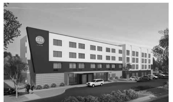
Artistic rendition of a Hilton Tru hotel

The hotels will be in a mix of markets including urban, airport and suburban. The areas include Atlanta, Dallas, Houston, Chicago, Denver, Portland, Oregon, Charlotte, North Carolina, San Antonio, Texas and Nashville, Tennessee.