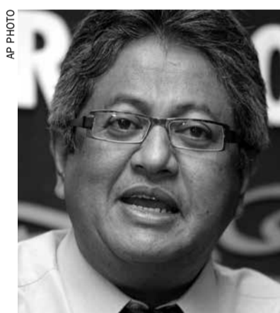
Malaysia's former Law Minister Zaid Ibrahim

Zaid dismissed a Cabinet minister's warning that the attor-