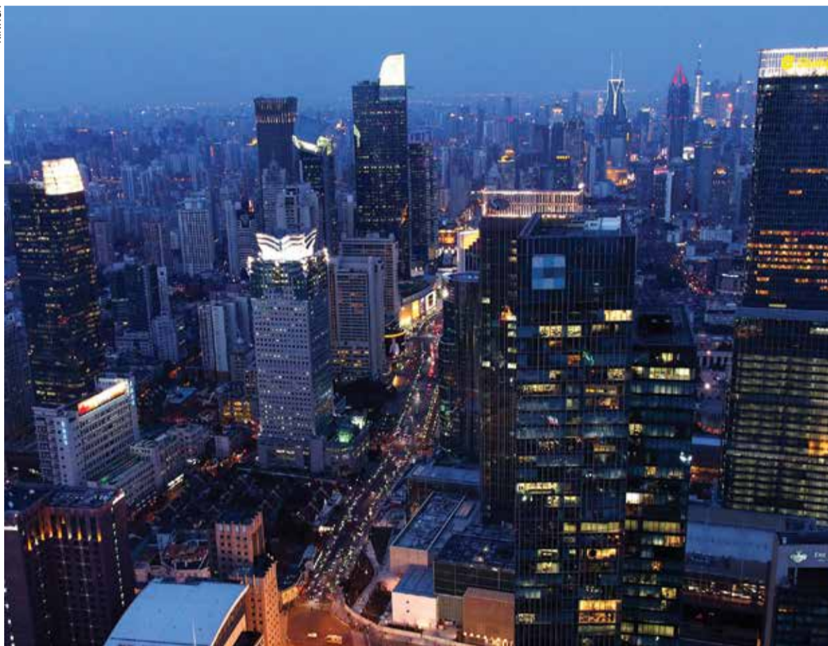
Buildings in downtown Shanghai, east China

A rising stockpile of unsold new homes is hampering government efforts to spur investment expanding at the slowest