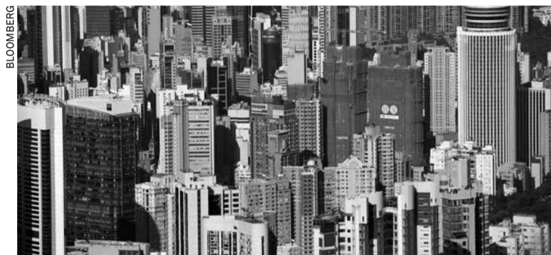
Commercial and residential buildings stand in Hong Kong

has been showing signs of weakening amid a rising supply of homes, higher short-term interest rates and slowing growth in China. Developers have been slow to make outright price cuts to move real estate while would-be buyers are delaying purchases in anticipation of further price declines, creating a standoff that could put more pressure on prices and drag down the city's economy.