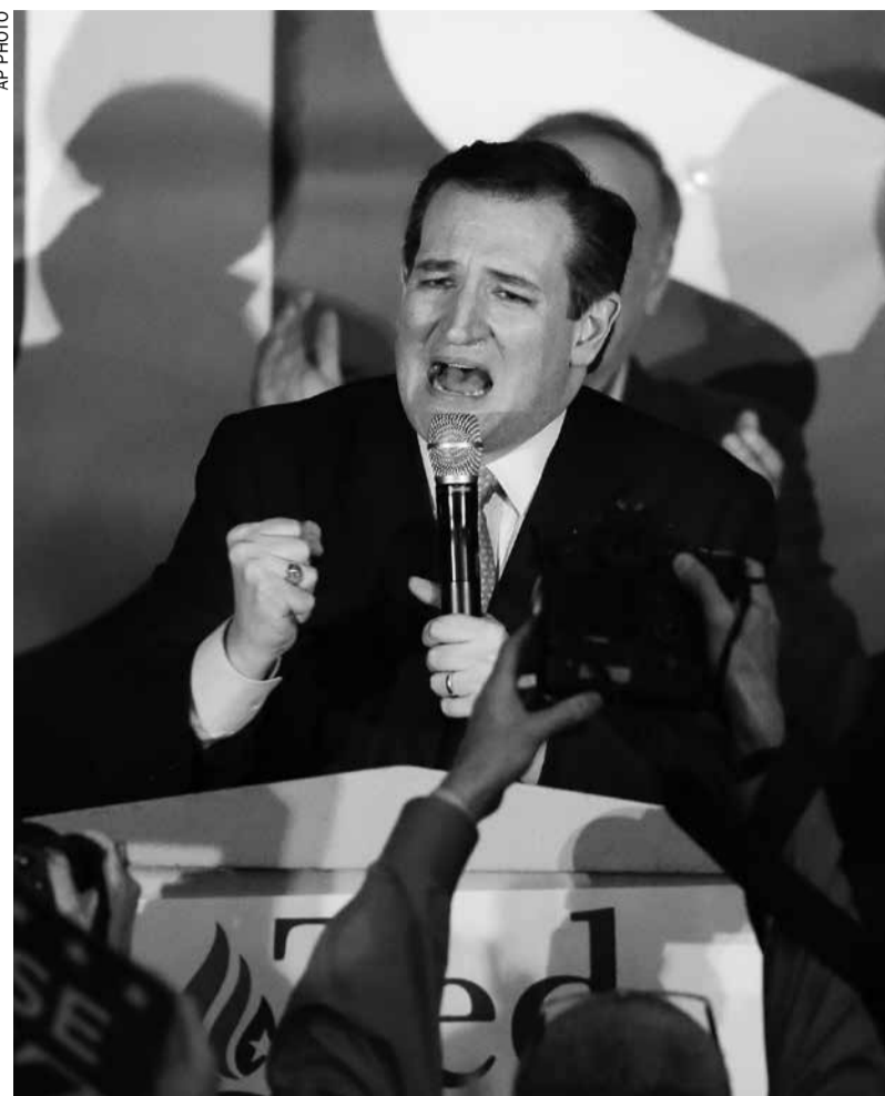
Sen. Ted Cruz (R)

In the Democratic race, nearly complete tabulations showed Clinton and Sanders in