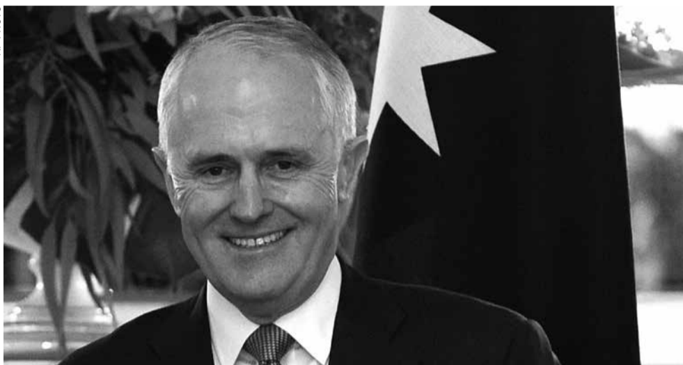
Australian Prime Minister Malcolm Turnbull

A double dissolution election can be called earlier to break a legislative dead lock after the Senate has twice rejected a