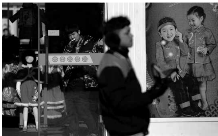
Children's clothing store at the Wangfujing shopping district in Beijing

Sales of jewelry, watches, clocks and valuable gifts were among the hardest hit, slumping 17 percent in December and 16 percent for the full year. Clothing and department store sales also