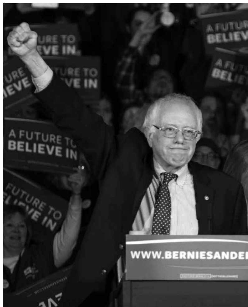
Sen. Bernie Sanders (D)