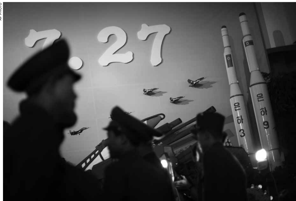
In this July 26, 2013, photo, North Korean soldiers are silhouetted against model versions of the Unha 3 space launch vehicle which successfully delivered North Korea's first satellite into Earth orbit, and the Unha 9, right, which would carry a lunar orbiter, on display at an annual flower show held in honor of national founder Kim Il Sung and his son Kim Jong Il

more formidable-looking Unha 9 rocket have since been displayed at various events in North Korea, including annual flower shows held in honor of national founder Kim Il Sung and his son, Kim Jong Il.