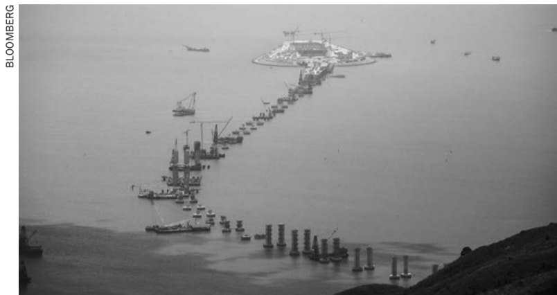
The under-construction Hong Kong-Zhuhai-Macau Bridge

The proposal addresses the concerns of the Hong Kong and