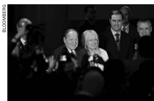
Sheldon Adelson (center left) and wife Miriam Adelson pose for photographs as they leave a news conference during the opening of the Sands Cotai Central resort in Macau

This time, the billionaire casino owner and his wife are keeping their cards closer to their chests. Mr. Adelson, preoccu-