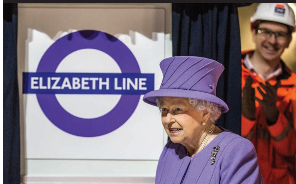
Queen's line. Britain's Queen Elizabeth II formally unveils the new Crossrail roundel sign for the "Elizabeth Line" which will open for passengers from December 2018. The Queen visited the site of the new Crossrail Bond street station in central London which is still under construction.