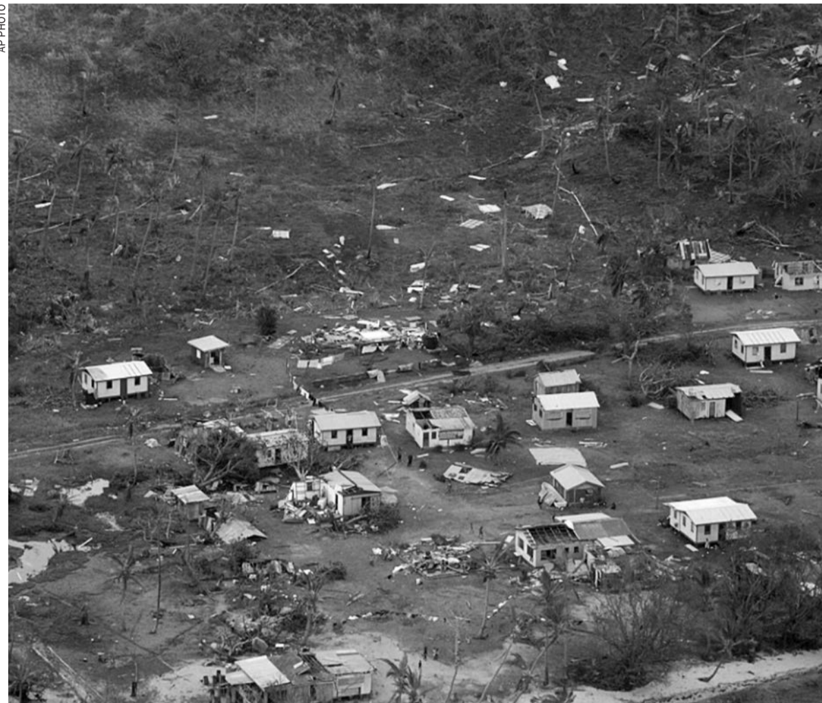
Camaged buildings at Nakama settlement in Fiji

She said one priority is to ensure children get back to school because studies have shown it helps them recover faster emotionally.