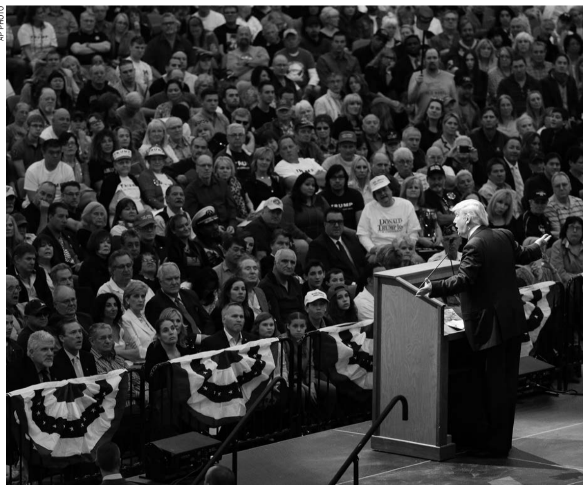
Republican presidential candidate Donald Trump speaks at a campaign rally Monday in Las Vegas

in the usual political circles to propel him to victory.