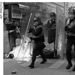
Riot police advance on protesters on a Mong Kok street