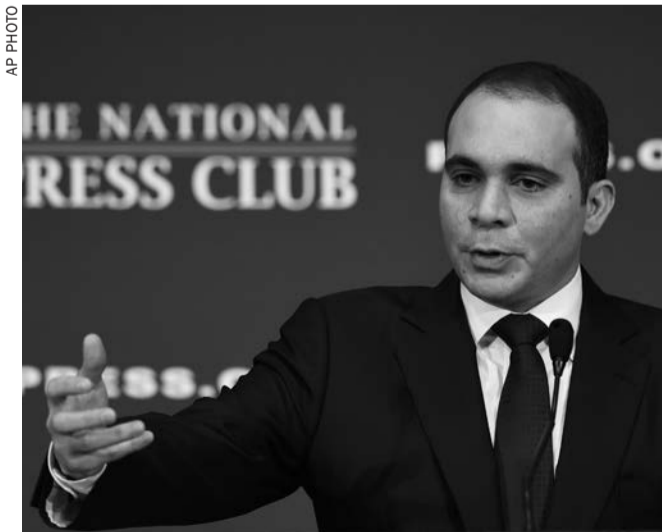
Presidential candidate Jordanian Prince Ali Al Hussein

"There's no difference," he said, "it sounds similar to me." AP