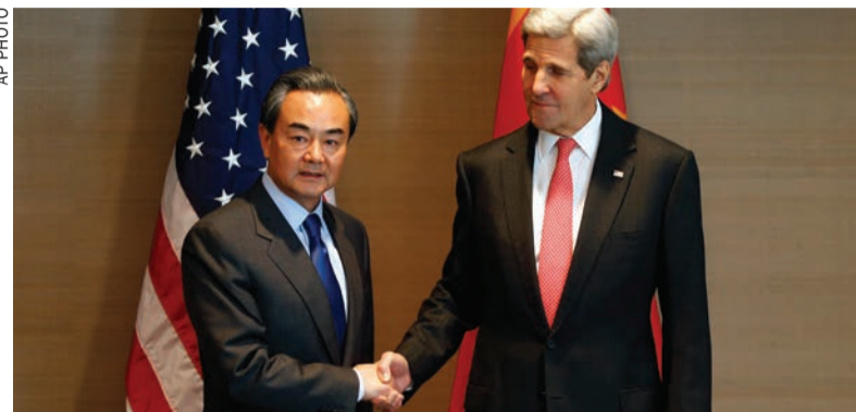
U.S. Secretary of State John Kerry (right), shakes hands with China's Foreign Minister Wang Yi

Korea, a neighbor and traditional ally of Beijing.