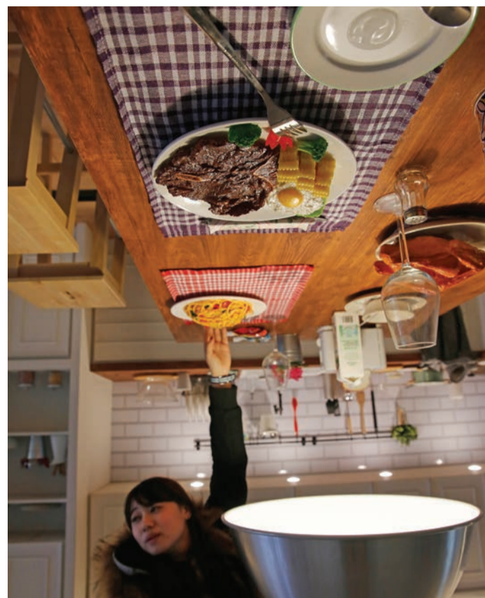
An upside-down house created by a group of Taiwanese architects at the Huashan Creative Park in Taipei