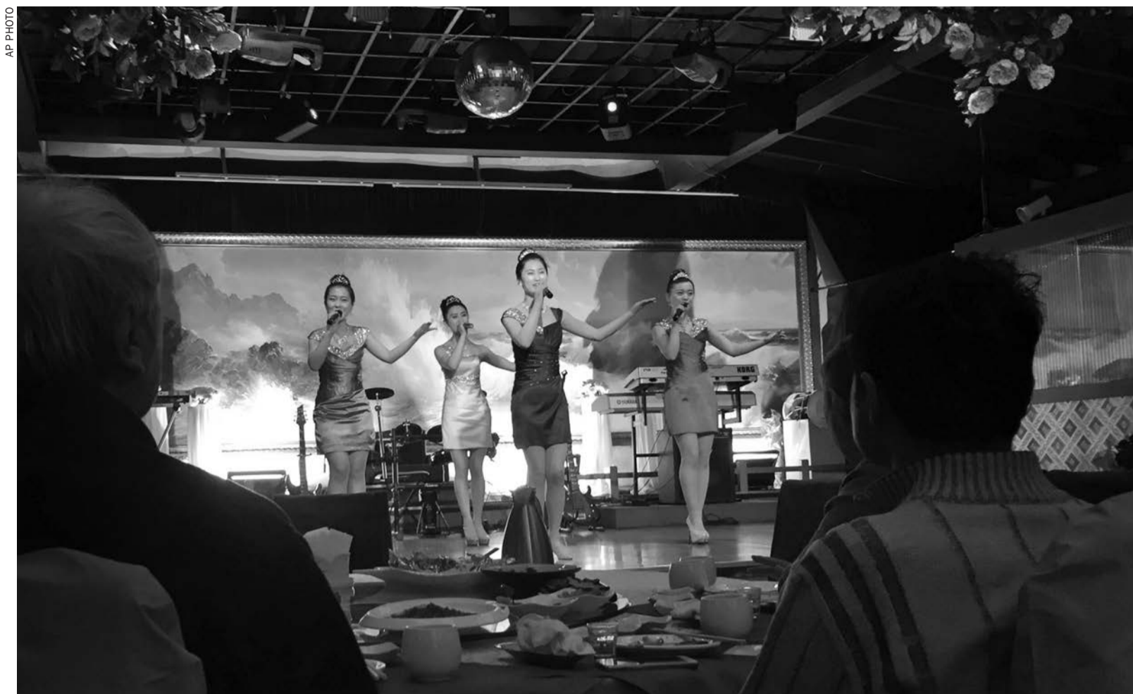
North Korean performers entertain customers at the Okryugwan restaurant in Beijing