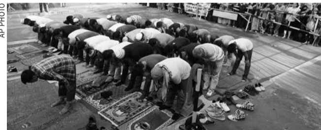
Filipino Muslims pray at the gates of the Philippine Congress during a protest on Feb. 3

A Philippine military official says up to 20 Muslim militants are believed to have been killed in three days of sporadic clashes that also left three soldiers dead in the country's south.