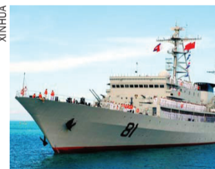
Chinese navy ship (CNS) Zhenghe entered the Sihanoukville Port of Cambodia

The Chinese naval visit follows by just a few days a goodwill visit by three ships from Japan's Maritime Self-Defense Force. Japan has maritime disputes of its own with China, with which it competes for influence throughout Asia.