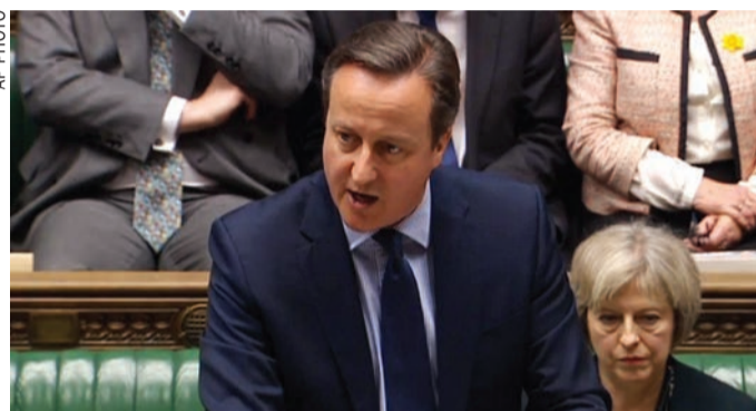
Britain's Prime Minister David Cameron addresses Members of Parliament