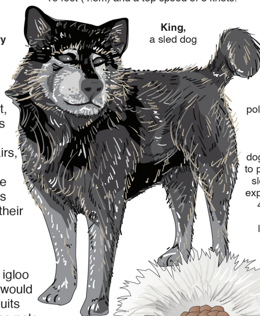
King, a sled dog

SOURCES: World Book Encyclopedia, World Book Inc.; http://www.matthewhenson.org ; http://www.biography.com ; http://www.enchantedlearning.com ; http://www.u-s-history.com