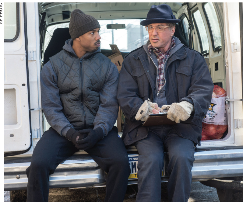
Michael B. Jordan (left) and Sylvester Stallone in a scene from "Creed"

But it's worth remembering: The lack of one didn't do much to dull the luster of Alfred Hitchcock, Cary Grant, Barbara Stanwyck, Akira Kurosawa, Ingmar Bergman, Fred Astaire, Joseph Cotton or Marilyn Monroe.