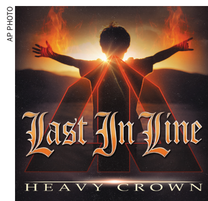
Last In Line, "Heavy Crown" (Frontiers SRL)

S ince the death of singer Ronnie James Dio in 2010, something of a cottage industry has sprung up, dedicated to keeping alive the memory and spirit of the vocalist who starred with Black Sabbath, Rainbow and his self-titled solo band. The newest development is seeing former Dio band members re-form; Last In Line, who took their name from the title of Dio's second solo album, consists of original Dio members Vivian Campbell on guitar, Vinny Appice on drums, and bassist Jimmy Bain (who died just weeks before the album was released). With vocalist Andrew Freeman, the band channel's Dio's spirit and music on tracks that sound like they came straight from early '80s Dio recording sessions. Sometimes they reach too far for familiarity — the album is full of references to dreamers, demons and starlight (all staples of Ronnie Dio's songwriting), and some of the song structures seem lifted directly from past Dio hits, including the bridge from "Holy Diver" in which the band rapidly starts and stops playing while Campbell rips a solo.