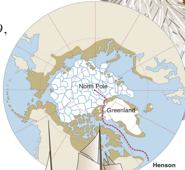
Henson and Peary's 1909 route to the Pole

Despite several failed attempts, on April 6, 1909, Matthew Henson and Robert Peary, along with four Inuit men, were credited as the first people in history to reach the North Pole.