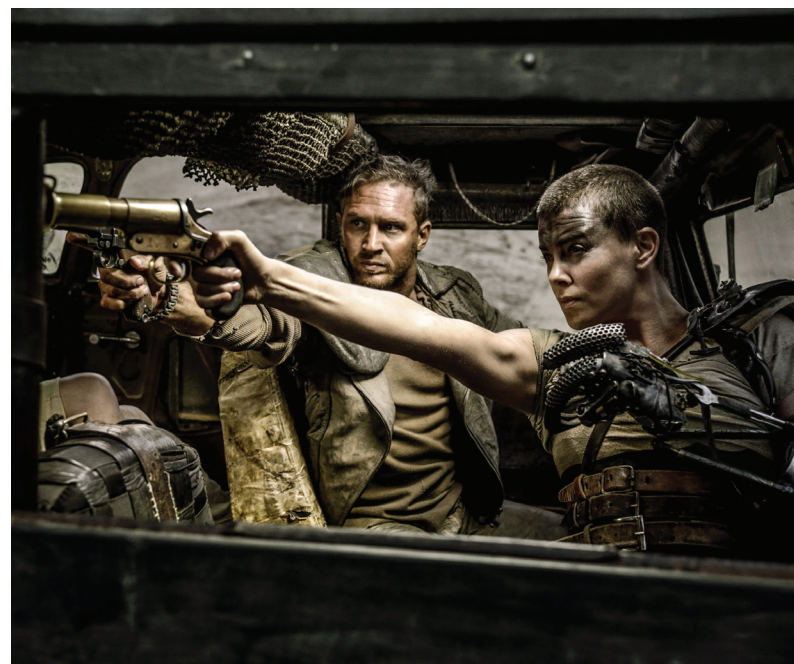
Tom Hardy (left) and Charlize Theron in a scene from "Mad Max: Fury Road"