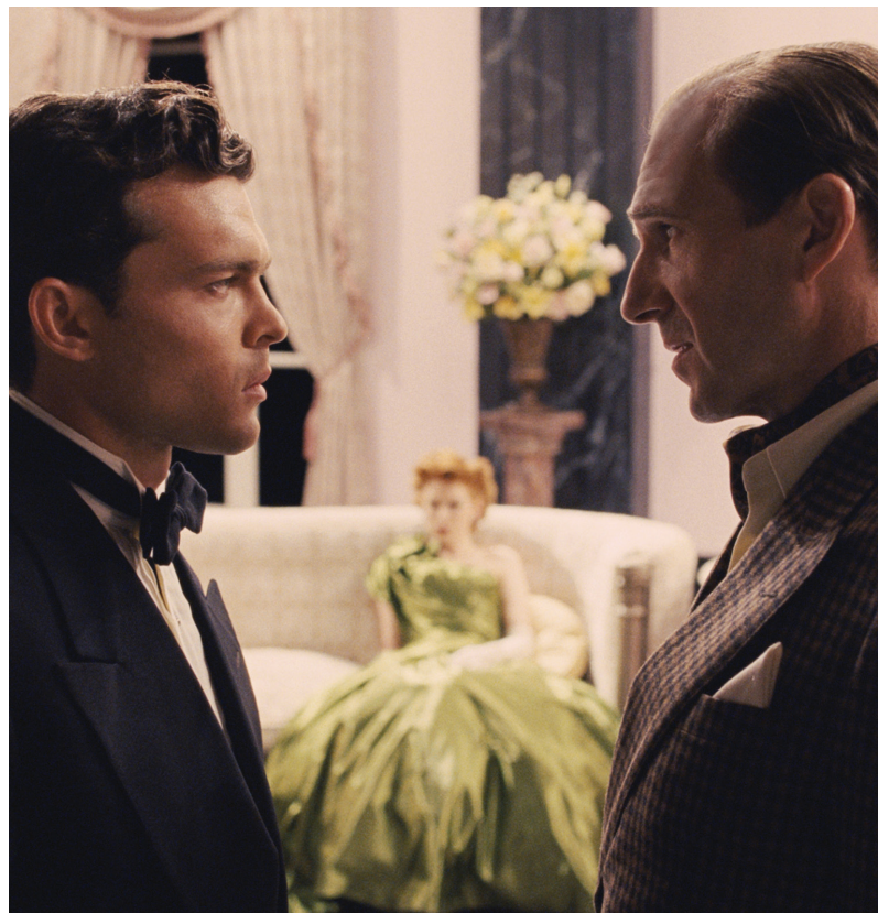
Alden Ehrenreich (left) as rising star Hobie Doyle speaks with Ralph Fiennes as director Laurence Laurentz in "Hail, Caesar!"

In the Coen brothers' recent 1950s Hollywood satire, "Hail, Caesar!" Ralph Fiennes' ascot-wearing British director Laurence Laurentz is helming a stuffy drawing room drama full of tuxedoed men and ballroom-gowned women. The movie, "Merrily We Dance," Laurentz declares is a "prestige picture." But it's clear that the Coens think so-called "prestige pictures" can be just as much a joke as any other type of movie. In its day, "Merrily We Dance" would have been destined for Oscars.