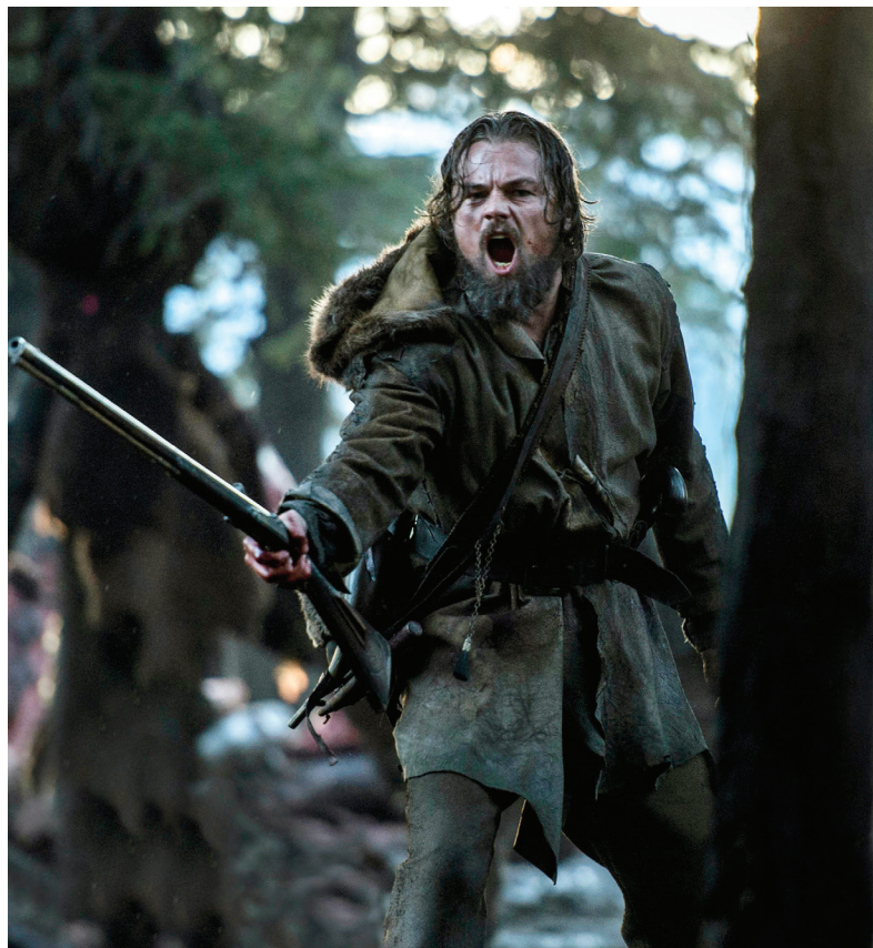
Leonardo DiCaprio as Hugh Glass, in a scene from the film, "The Revenant"