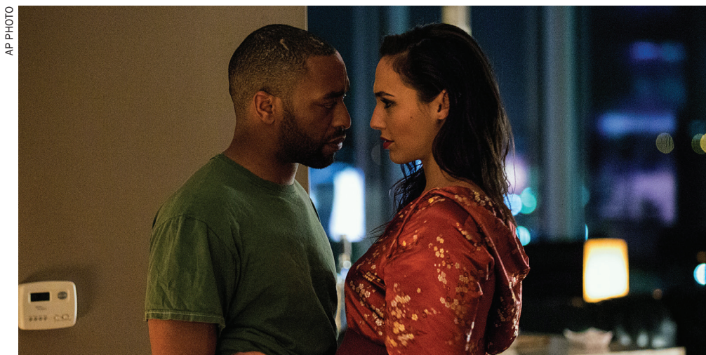
Chiwetel Ejiofor (left) and Gal Gadot

"Triple 9," an Open Road Films release, is rated R by the Motion Picture Association of America for "strong violence and language throughout, drug use and some nudity." Running time: 115 minutes. ★★★