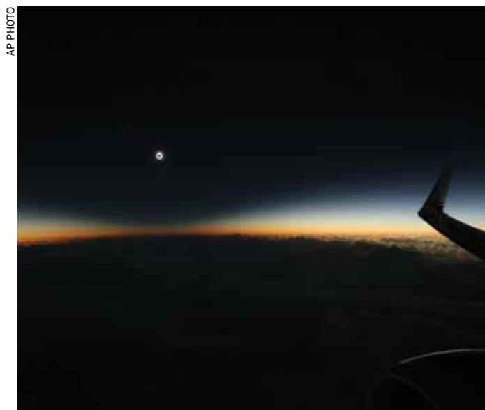
The full shadow of the moon during the total solar eclipse on Tuesday