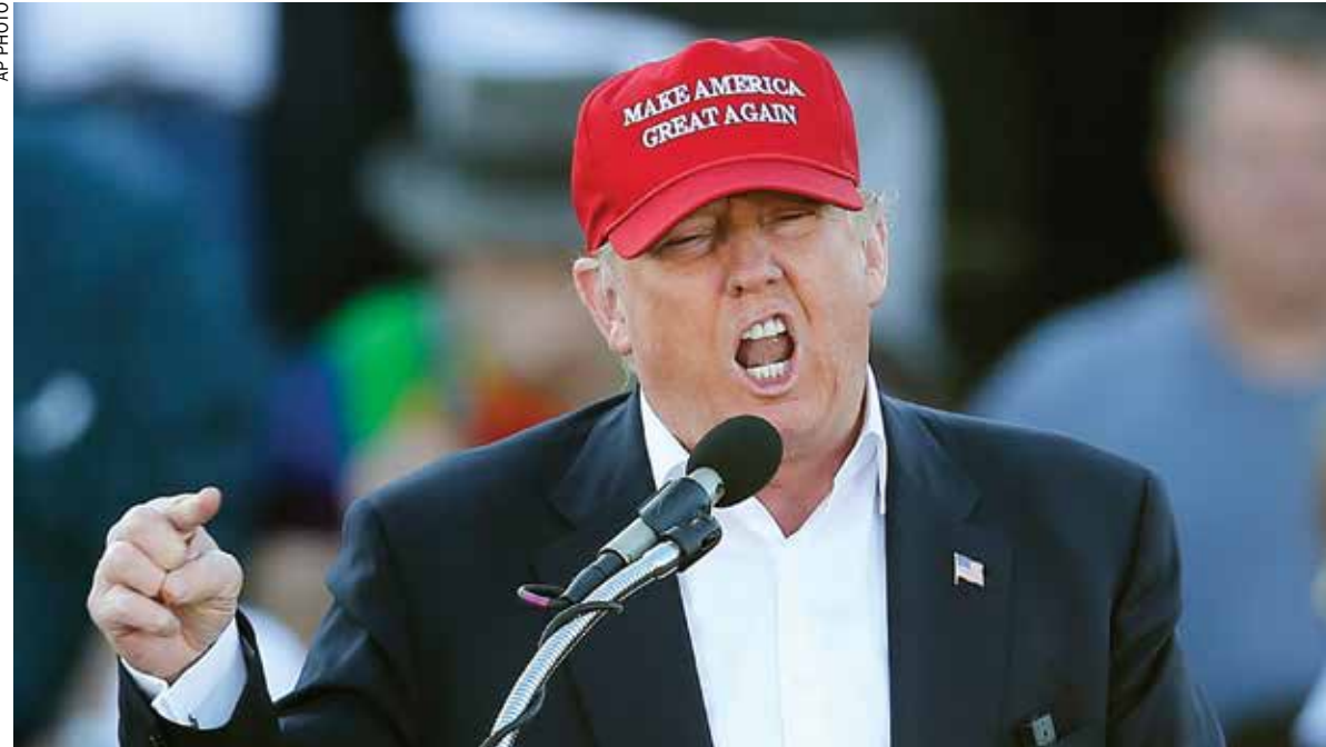
Republican presidential candidate Donald Trump