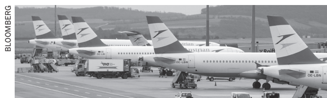
Austrian Airlines AG passenger aircraft sit on the tarmac at Vienna International Airport

"With 48 business class and 260 [economy] seats this will further increase the importance of Hong Kong as an Asia hub for Austrian companies in the region and will attract