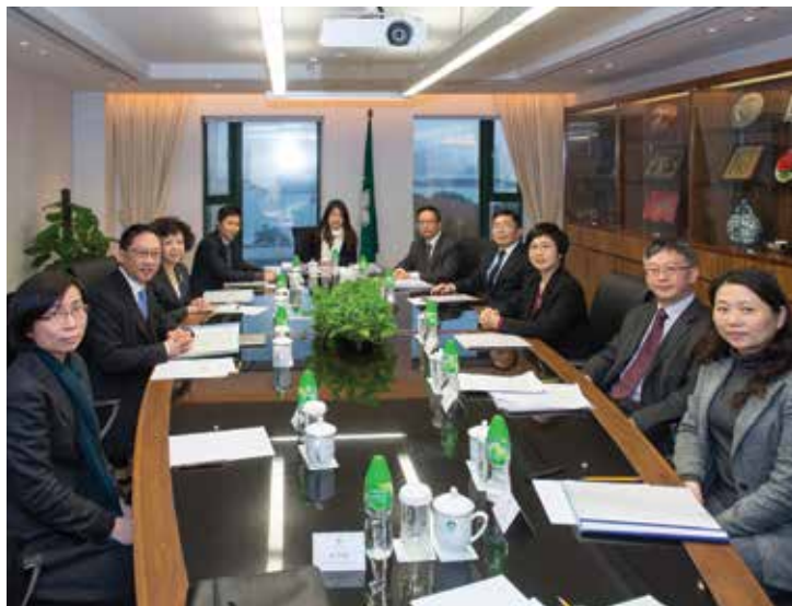
Sonia Chan (right side, center) met with Rimsky Yuen (second left)

Regarding the arrangements for the extradition of criminals between both SARs, Sonia Chan said during the meeting that "such requests would be handled on a case-by-case basis once a cooperation agreement is in force." She added that "such requests might be made retrospectively in relation to court sentences already han-