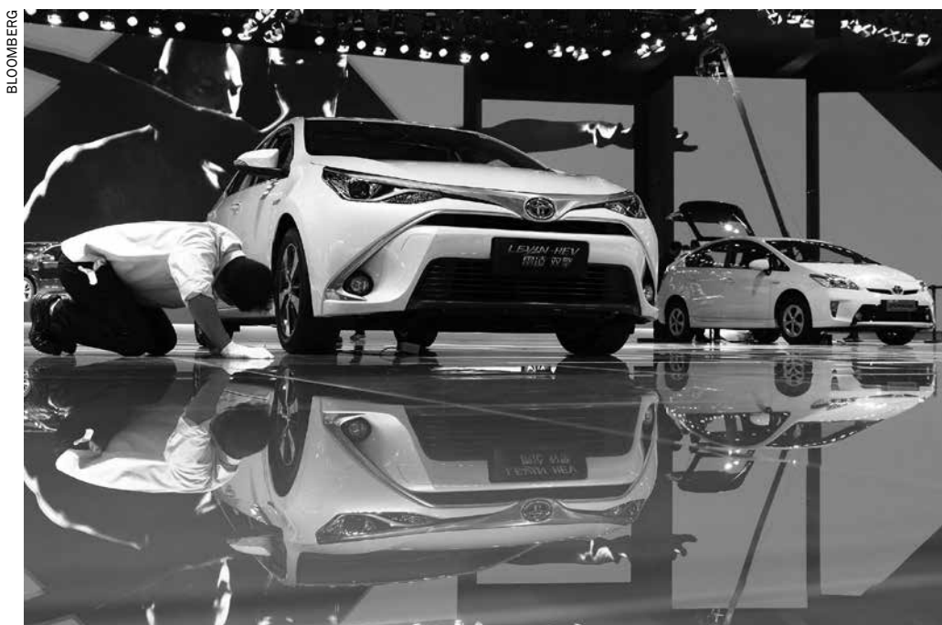
A worker looks at a Toyota Motor Corp. Levin hybrid electric vehicle (left) at the 16th Shanghai International Automobile Industry Exhibition