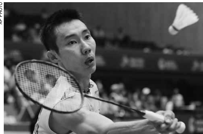
Lee Chong Wei

In the women's event, Carolina Marin's title defense almost tripped up in the first round. The Spaniard won her first meeting with Bae Yeon-