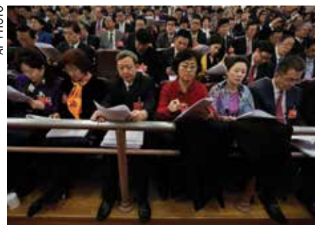
Delegates read the work report delivered by Chinese Premier Li Keqiang during the opening session of the annual National People's Congress

CHINA'S inflation accelerated to 2.3 percent in February, driven by a jump in food prices, but fell below the government's official target for the year.