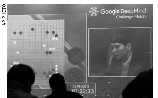
South Korean professional Go player Lee Sedol, right, appears on the screen during the second match of the Google DeepMind Challenge Match

Lee, 33, brimmed with confidence two weeks ago but that confidence was mis-