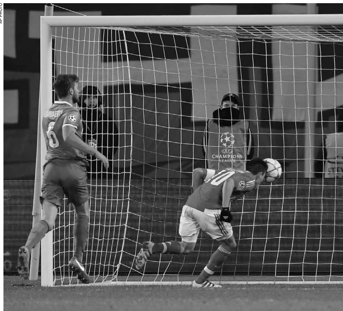
Benfica's Nico Gaitan, right, scores his side's first goal during their Champions League Round of 16 second leg soccer match between Zenit and Benfica at Petrovsky stadium in St. Petersburg, Russia

The win followed a last-minute victory for Benfica in the first leg in Lisbon, where Jonas scored the only goal in the 92nd-minute. It was also a repeat of a two-leg win over