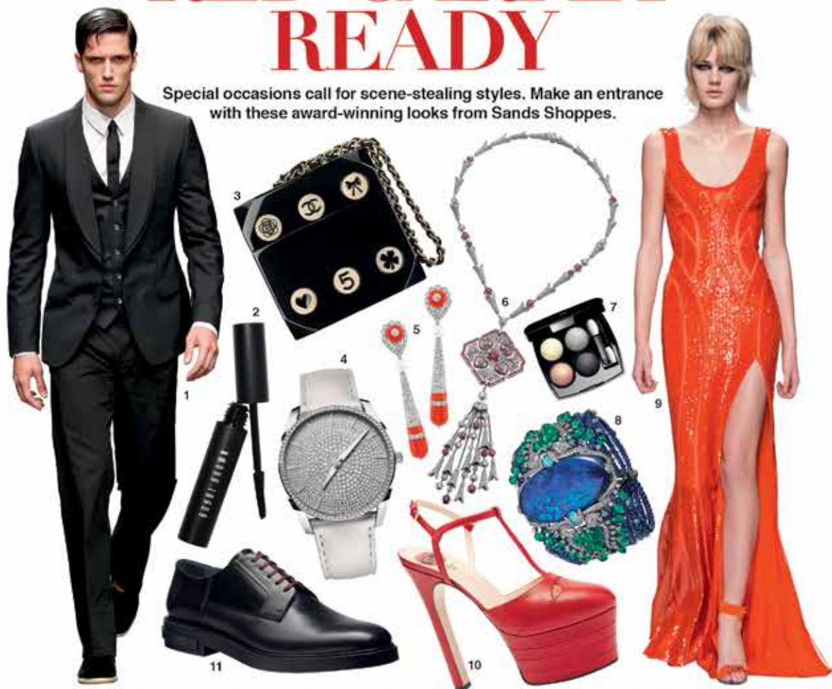
1. Dolce & Gabbana Runway look 2. Bobbi Brown Mascara 3. Chanel Chain bag 4. Parmigiani Watch 5. Van Cleef & Arpels Earrings 6. Bulgari Necklace 7. Chanel Eye shadow 8. Cartier Bangle 9. Atelier Versace Runway look 10. Gucci Pumps 11. Dior Shoes

Special occasions call for scene-stealing styles. Make an entrance with these award-winning looks from Sands Shoppes.