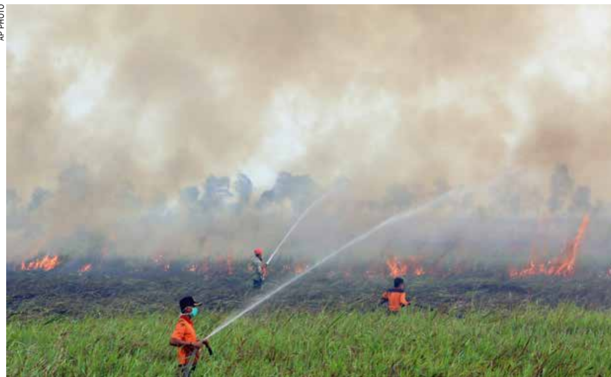
In this September 5, 2015, file photo, firemen spray water to contain burning wildfire in Ogan Ilir, South Sumatra

Forest fires have been an annual problem in Indonesia since the mid-1990s, causing a toxic haze that often drifts into neighboring countries such as Malaysia, Singapore and Thailand. Last year's fires, which covered 2.1 million hectares (8,100 square miles), were considered one of the country's worst envi-