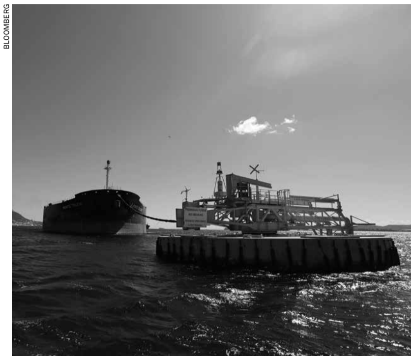
The Monte Toledo oil tanker delivers a consignment of Iranian oil to an offshore pumping station refinery near Algeciras, a few miles from Gibraltar, on March 6. The tanker became the first to deliver Iranian crude into Europe since mid-2012, when Brussels imposed an oil embargo

Iran wants to boost output by 1 million barrels a day this year after international sanctions on its oil industry were lifted in January. Production was 3 million barrels a day in February, accor-