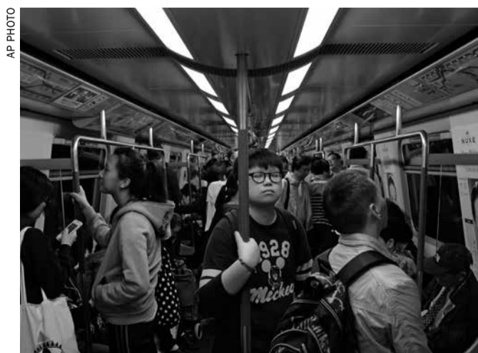
A passenger takes a rest on the subway train in Hong Kong

MTR, three-quarters owned by the government, has been criticized