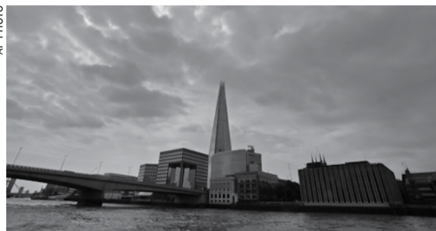
The Shard as seen from the river Thames in London

Witnesses say a base jumper has safely parachuted from the European Union's tallest building, the Shard in London, and evaded police by jumping on the subway.