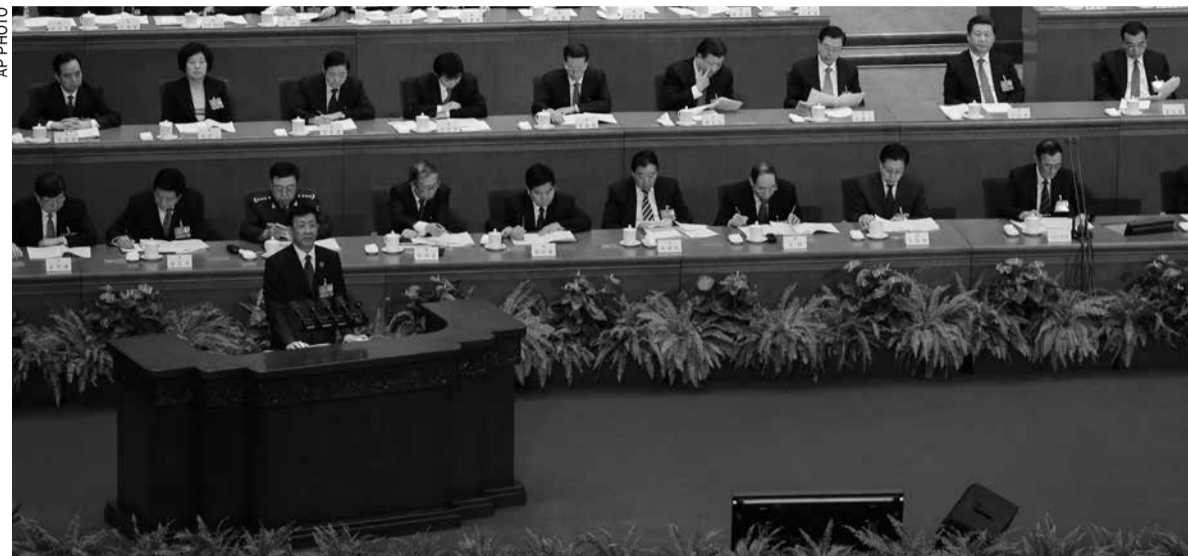
China's Supreme People's Procuratorate top prosecutor Cao Jianmin speaks at a plenary session of the National People's Congress

Those include agents of foreign governments, civil socie-