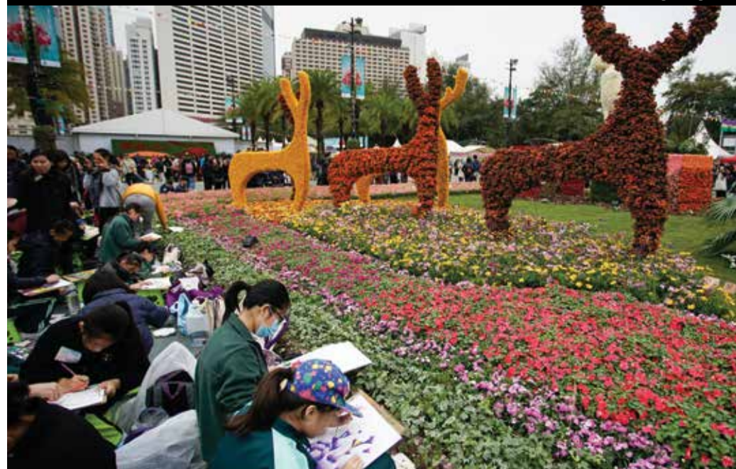
Visitors draw pictures of flowers during the ongoing Hong Kong Flower Show. Organized by the Hong Kong Leisure and Cultural Services Department, the event will be held until March 20 at Victoria Park.