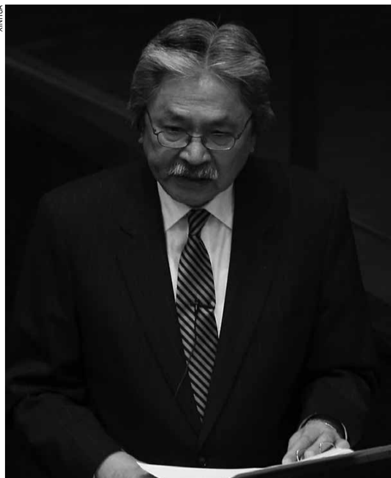
John Tsang, financial secretary of the Hong Kong Special Administrative Region

Moody's also said the strong political link embedded in the one country, two systems policy creates the risk that Hong Kong's institutions will lose some independence over time as China grows. Ahead of the 2017 election for Hong Kong's chief executi-