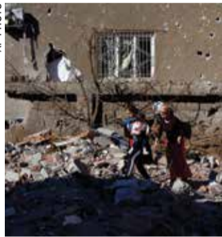
Two women walk among the debris of a ruined house in Cizre, Turkey

Hakkari province, which borders Iraq and Iran, said a new 24-hour curfew would take effect in the town Yuksekova, adding that entering and leaving the town would also be banned. The announcement came as news reports said dozens of tanks had been deployed to the town.