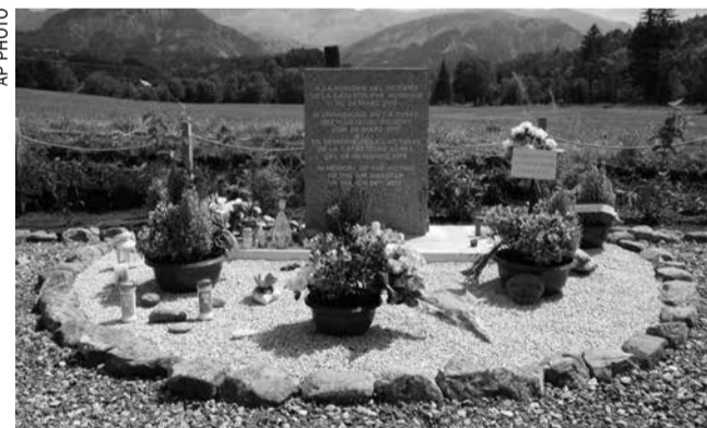
A stone slab erected as a monument, set up in the area near where a Germanwings aircraft crashed in the French Alps

"The reluctance of pilots to declare their problems