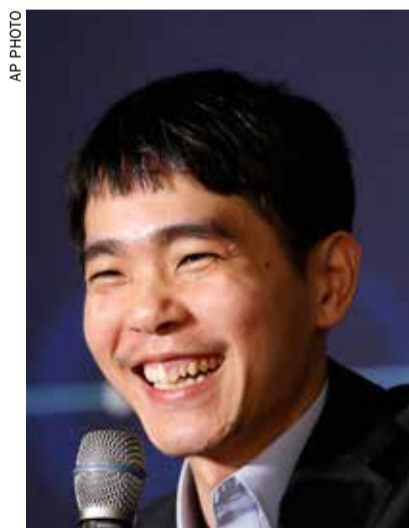
Korean professional Go player Lee Sedol

Lee had said earlier in the series, which began last week, that he was unable to beat AlphaGo because he could not find any weaknesses in the software's strategy.