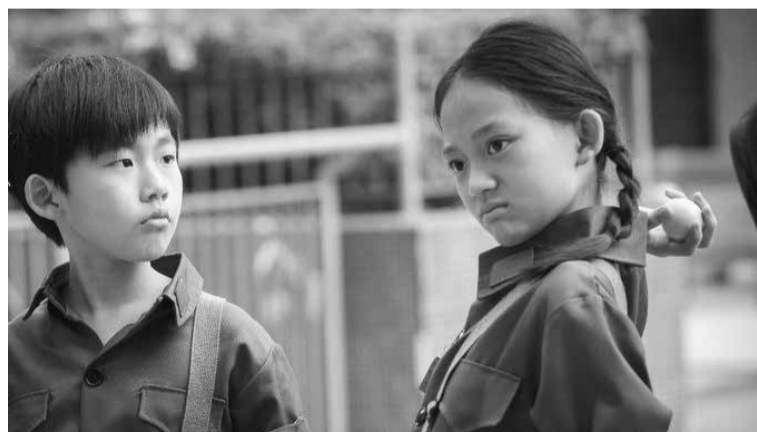
A still from the independent Hong Kong film, Ten Years

THE controversial dystopian film "Ten Years," hailed as a timely insight into the mainland's increasing intrusion into Hong Kong's political autonomy, has largely disappeared from movie theaters, leaving private showings as the only opportunity left for people to see the Hong Kong budget film.