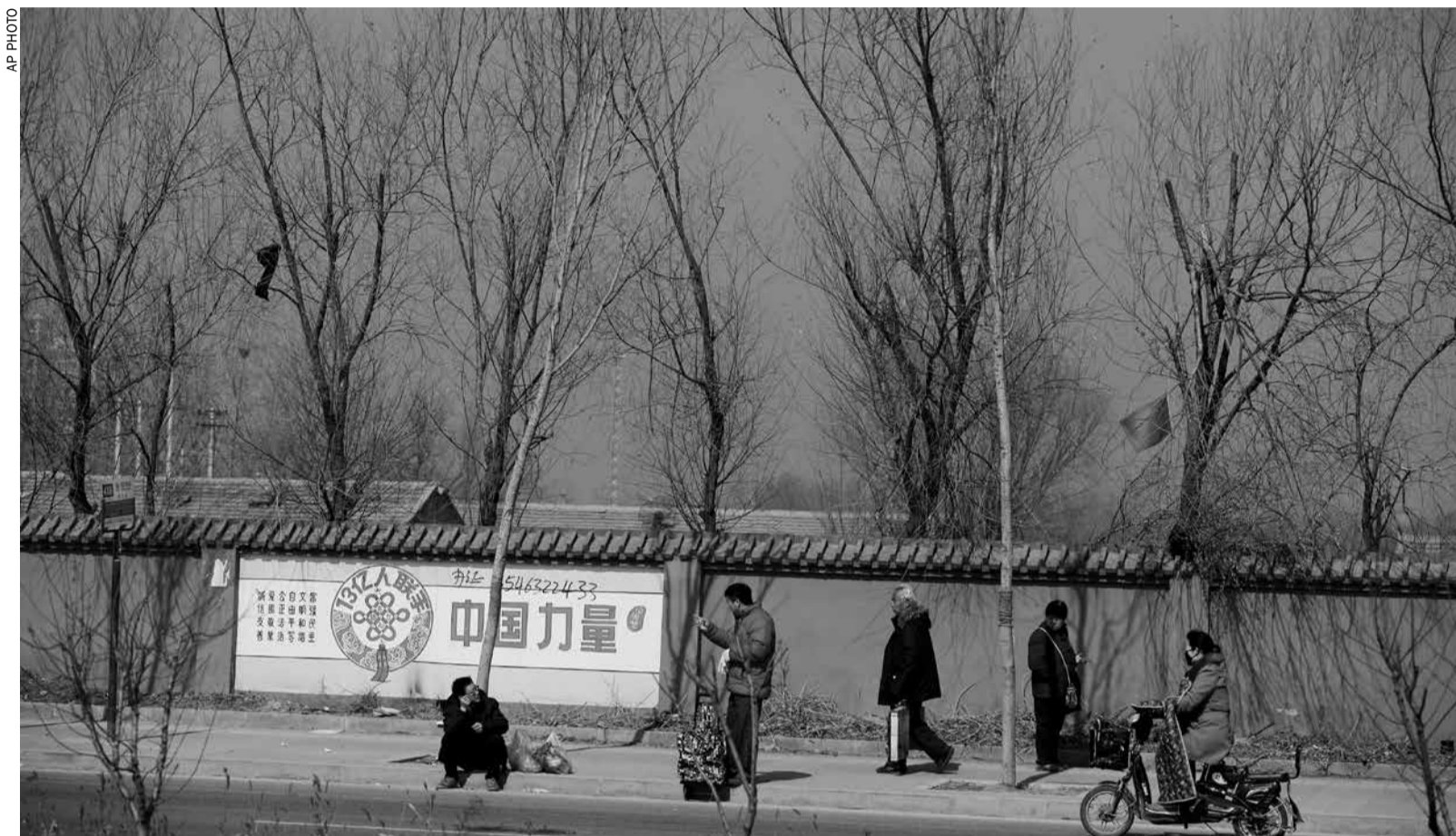
People wait for buses near a wall mural with the words "1.3 billion people united" and "China power" on the outskirts of Beijing