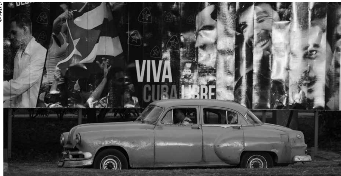
A taxi driving a classic American car passes a billboard that reads in Spanish: "Long live free Cuba" in Havana

to Cuba. The Starwood hotel chain says it soon expects to get U.S. approval to manage hotels in Cuba.