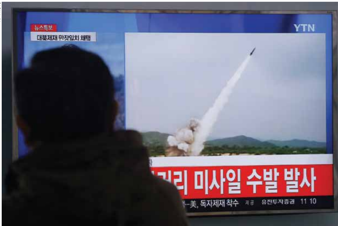
A man watches a TV news program showing footage of the missile launch conducted by North Korea, at Seoul Railway Station

The latest tensions began in January, when North Korea conducted its fourth nuclear test before launching a long-range rocket.