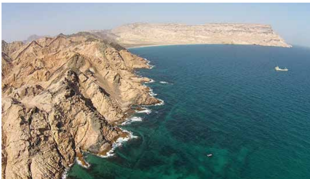
The expedition ship is seen at the Ghubbat ar Rahib bay, the excavation area of the wreck site of the Portuguese explorer Vasco da Gama’s ship, Esmeralda