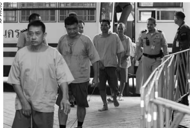
Prisoners are escorted by Thai correction officers from a bus to the Criminal Court on their arrival in Bangkok