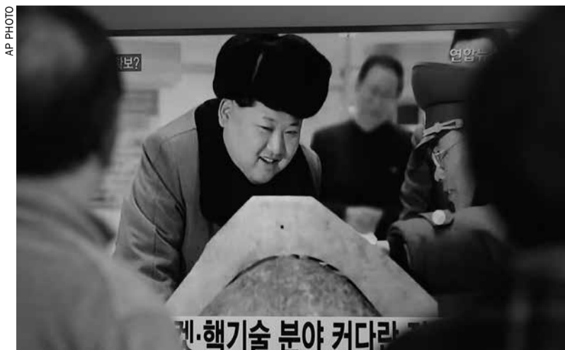
People watch a TV screen showing North Korean leader Kim Jong Un during a news program, at Seoul Railway Station