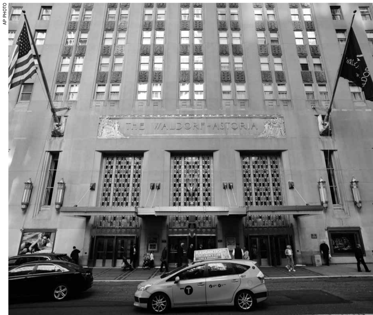
A taxi passes in front of the fabled Waldorf Astoria Hotel in New York

Anbang started with a single outlet in Beijing. Its biggest shareholder, at 20 percent, was state-owned car maker Shan-