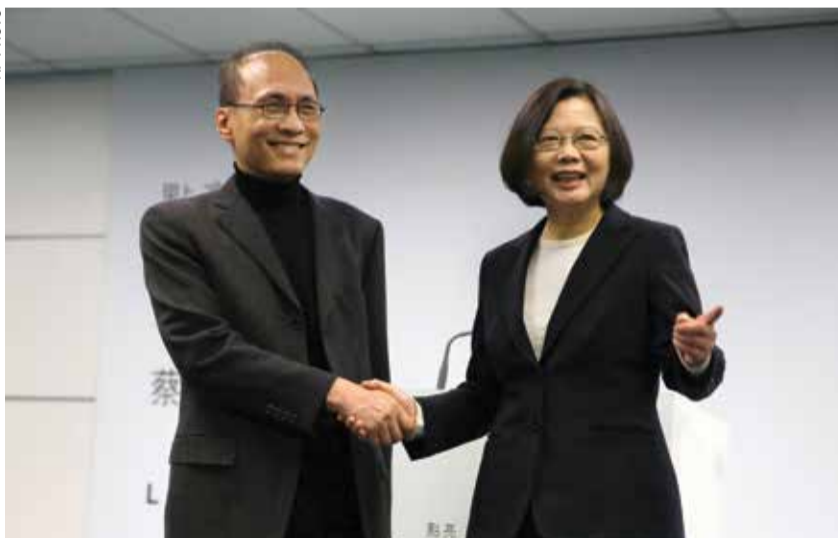
Taiwan's President-elect Tsai Ing-wen poses with former Finance Minister Lin Chuan – her choice for premier – at the Democratic Progressive Party headquarters in Taipei

ble peace and robust economic exchanges between the sides. However, China says it isn't satisfied with that stance and insists she endorse Beijing's claim that the two are part of a single Chinese nation.