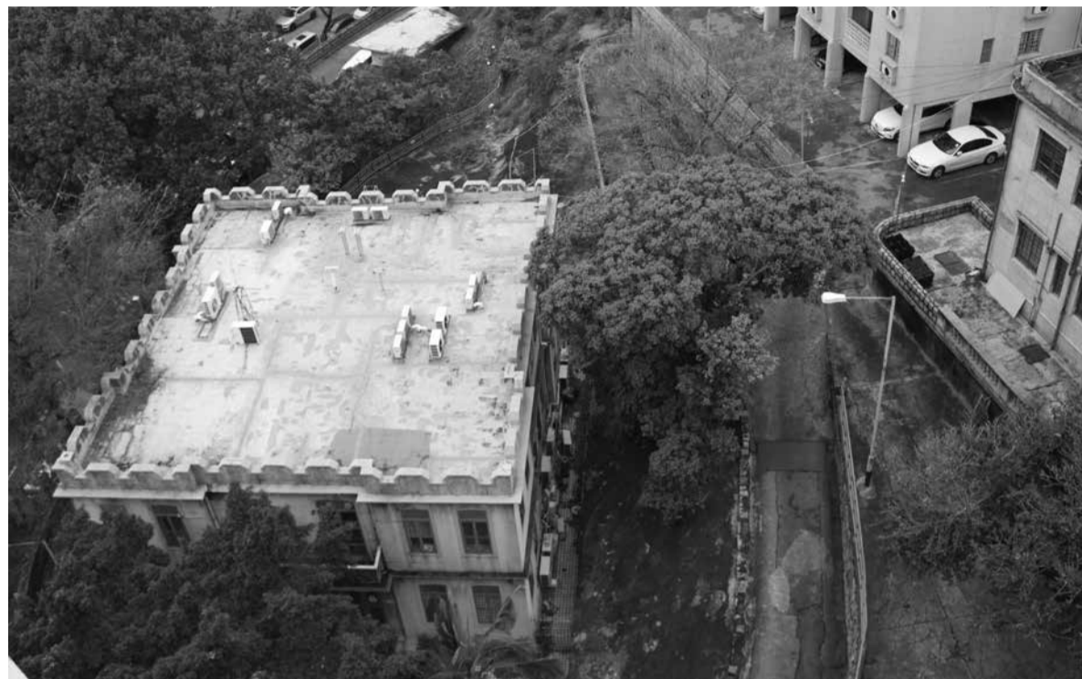
This building is expected to be demolished to give place to the infectious diseases facility

“The government has already made the decision. [The fact that there has been no consultation implies] there is dirty business behind the decision,” he told reporters on the roof of a residential building overlooking one of the historic structures to be demolished.