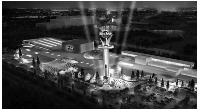
This undated illustration shows what the proposed Hard Rock Casino Meadowlands in East Rutherford, N.J., would look like

Applications would be accepted only from casino operators presently licensed in the state. The process would be open to other operators if 60 days pass without bids. The bidders must be willing