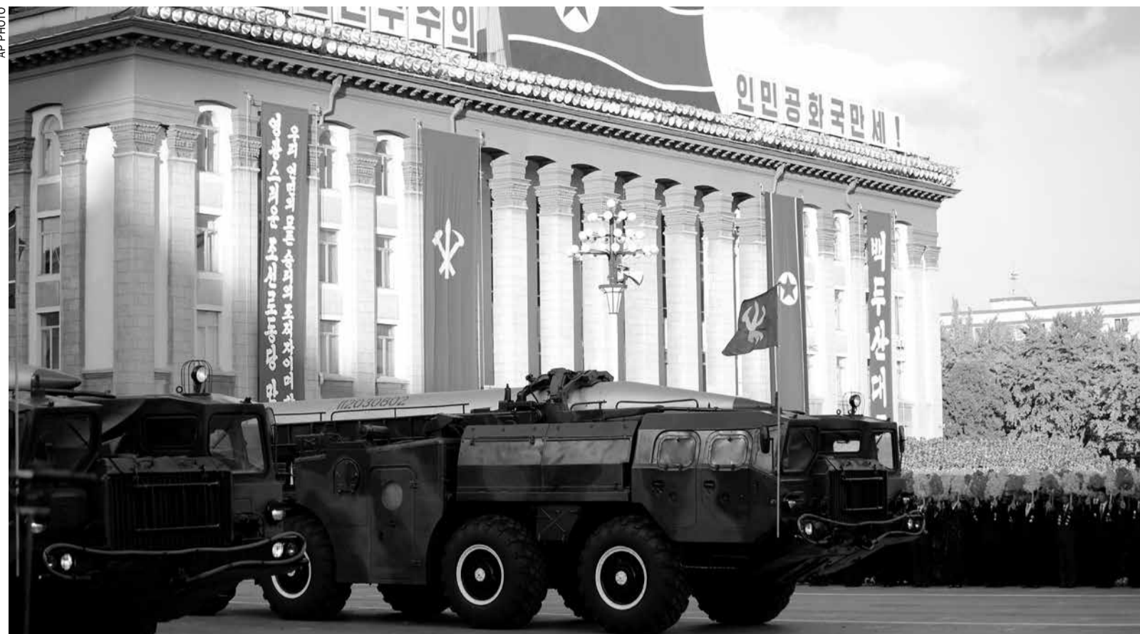
Missiles are flaunted during a military parade during celebrations to mark the 70th anniversary of North Korea's Workers' Party

North Korea's most likely candidate for an intercontinental ballistic missile is generally known as the KN-08 — in North Korea it's called the Hwasong. The three-stage rocket has an estimated range of 5,000-6,000 kilometers (3,100-3,700 miles), longer if