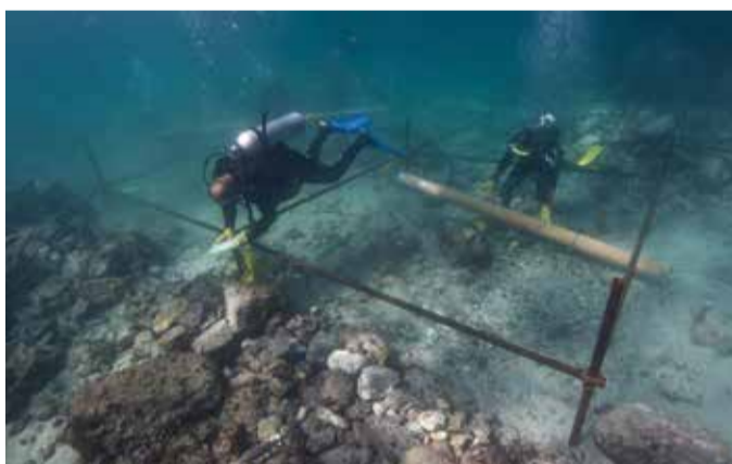
Divers excavate the wreck site