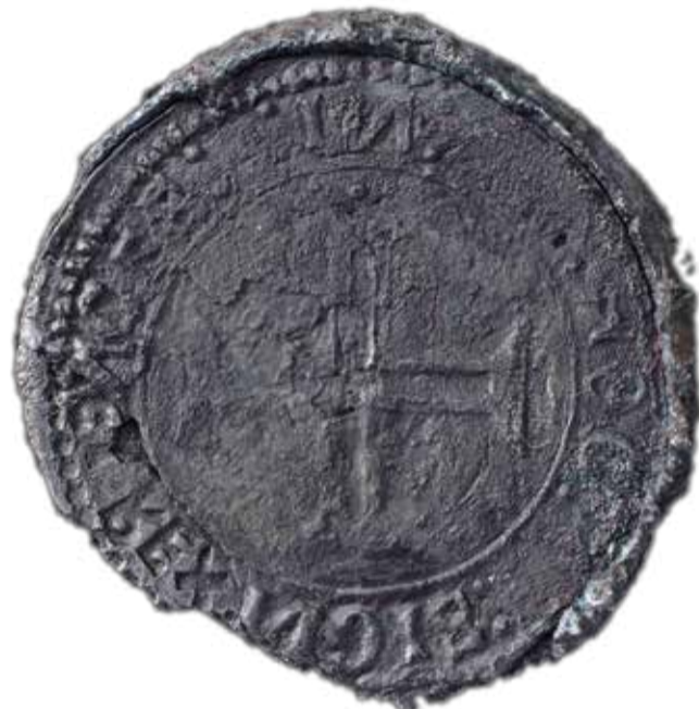
A rare silver coin called an Indio discovered from the debris of the explorer Vasco da Gama’s ship, Esmeralda