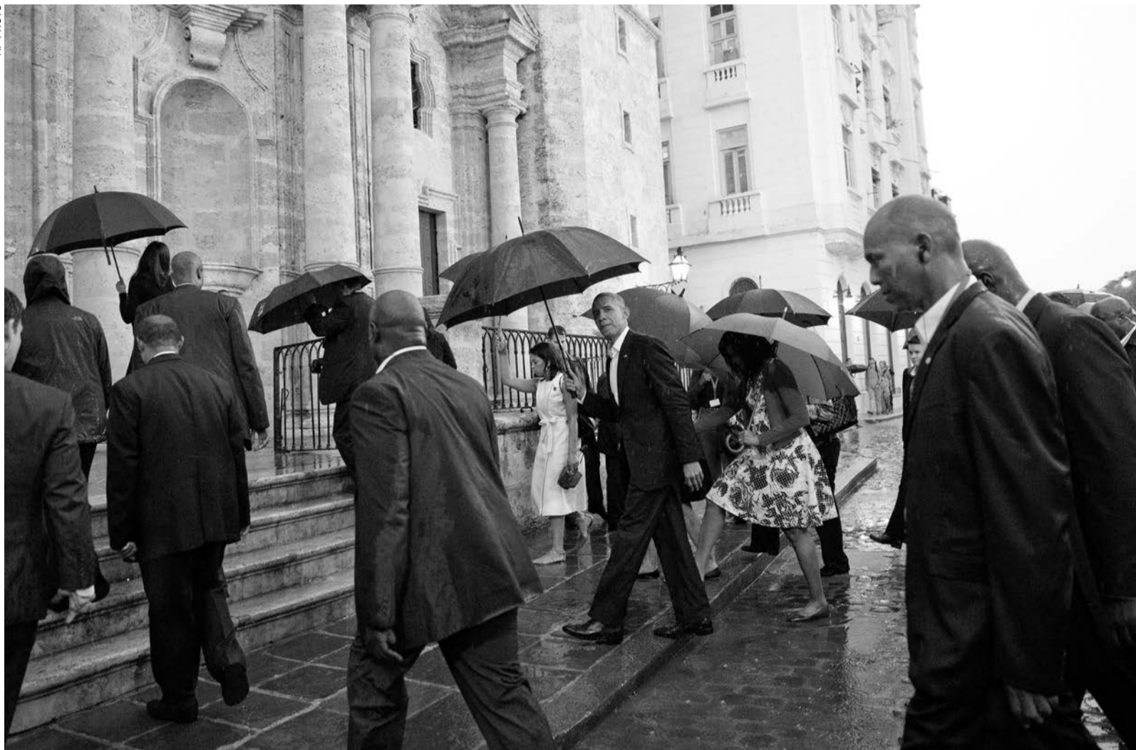
President Barack Obama (center) and first lady Michelle Obama, visit la Catedral de La Habana in Havana on Sunday. Obama's trip is a crowning moment in his and Cuban President Raul Castro's ambitious effort to restore normal relations between their countries

to announce while visiting here that Google has made arrangements to upgrade Internet access on the island.