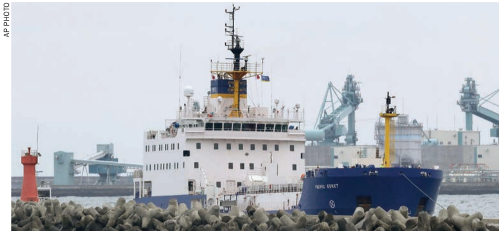
The Pacific Egret, one of the two British ships that arrived in Japan, is anchored at a port in the village of Tokai, northeast of Tokyo, to transport a cache of plutonium worth dozens of atomic bombs to the U.S.

The Pacific Egret docked first and appeared to be loading the plutonium, with the second ship standing by off-shore, according to media reports and Japanese and international anti-nuclear groups.