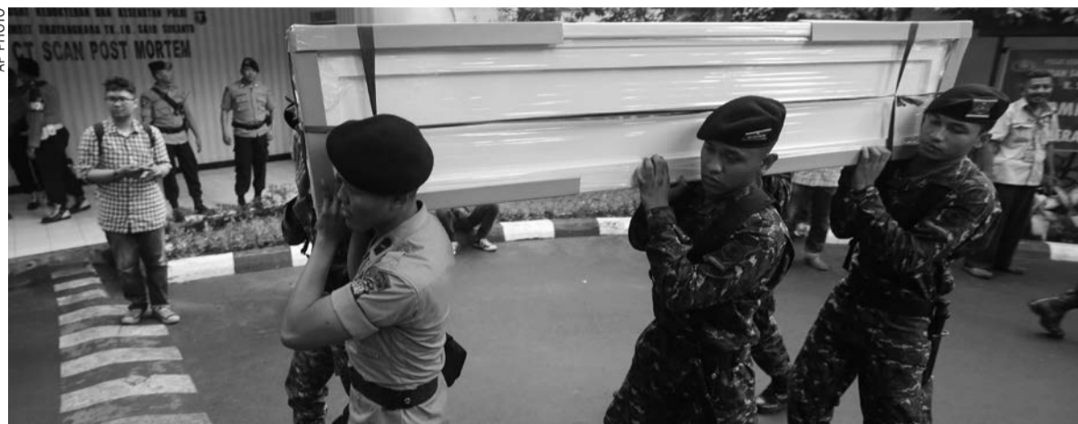
Indonesian police officers and soldiers carry one of the coffins prepared for the victims of a military helicopter that crashed in Poso, Central Sulawesi

T HE death toll from an Indonesian military helicopter crash rose to 13 on yesterday, the military said, with the discovery of the body of a missing soldier.