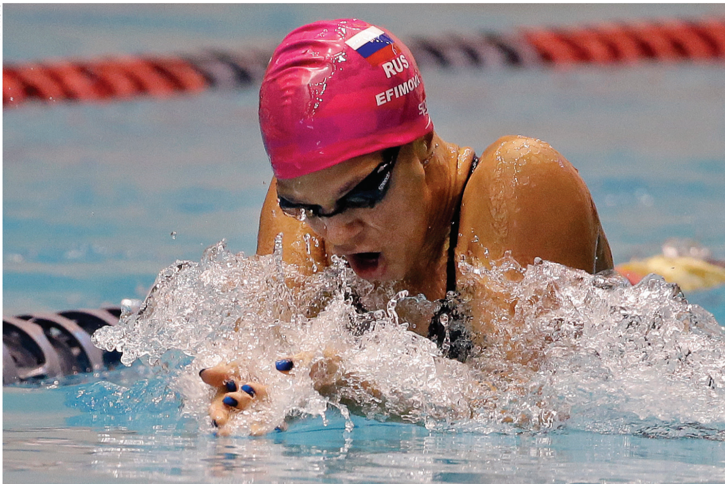
In this Dec. 4, 2015, file photo, Yulia Efimova swims in the women's 100-meter breaststroke during a preliminary race in the U.S. Winter Nationals swimming event in Washington state