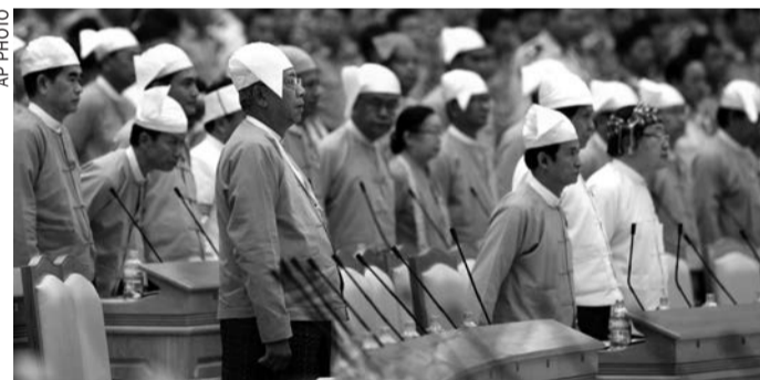
Htin Kyaw, newly elected president of Myanmar, attends a session in parliament in Naypyitaw yesterday

In his first speech to parliament since having his nomination confirmed last week, Htin Kyaw, who will formally take office on April 1, said that currently "a lot of different ministries scattered around" are doing duplicate work, and that he intends