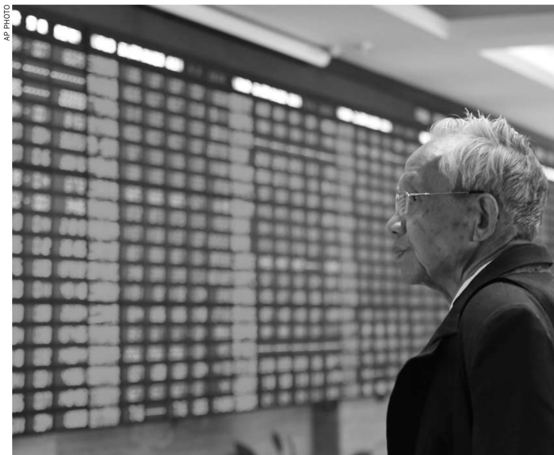
In this file photo an investor looks at the stock price monitor at a private securities company in Shanghai

CHINA'S benchmark stock index rallied above the 3,000 level for the first time in two months and turnover surged after policy makers loosened controls on margin lending.