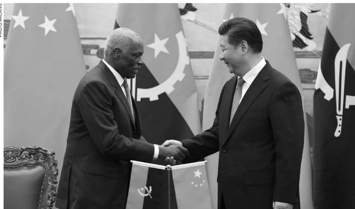
Angolan President Jose Eduardo dos Santos (left) shakes hands with Chinese President Xi Jinping at the Great Hall of the People in Beijing in June last year

creation and employment, which the government estimates at 365,000 jobs.