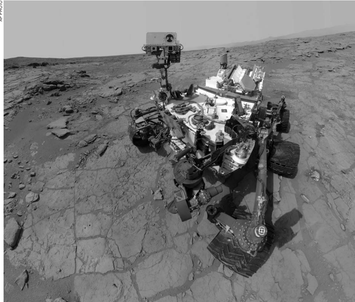
In this file photo NASA's Curiosity rover is shown. The car-sized rover has been exploring the surface of Mars since landing on August 6, 2012

ZHENG YONGCHUN CHINA NATIONAL ASTRONOMICAL OBSERVATORY