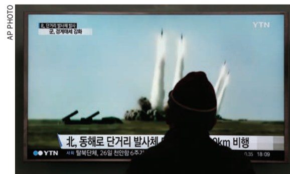
A man watches a TV screen showing file footage of the missile launch conducted by North Korea, at Seoul Railway Station in Seoul

South Korean defense officials say North Korea doesn't yet have functioning intercontinental ballistic missiles.