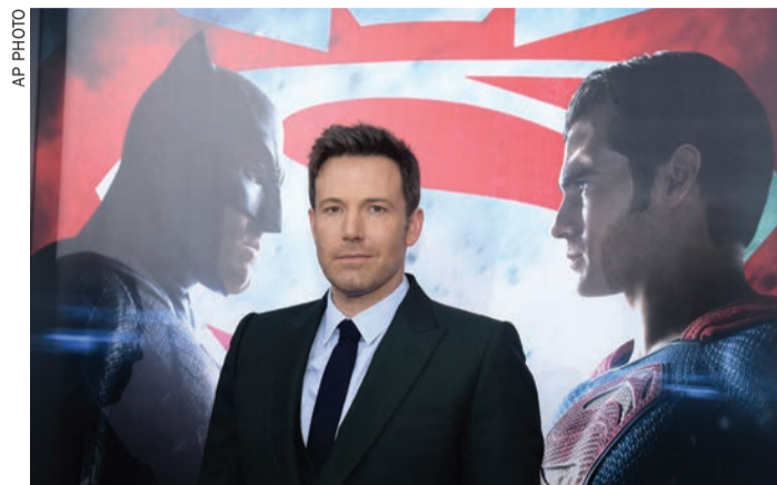
Ben Affleck attends the premiere of "Batman v Superman: Dawn of Justice" at Radio City Music Hall

The latest offer from Anbang and its partners was worth $83.67 for each Starwood share. Starwood stockholders would have received $78 in cash for each share they own plus $5.67 in stock for a spinoff of a vacation business.