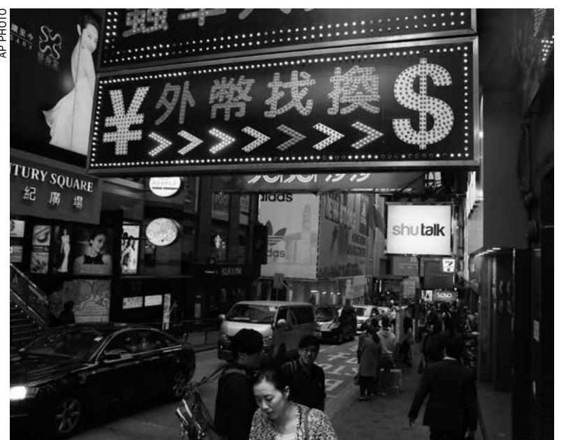
In this March 2 file photo, people walk beneath a sign for foreign currency exchange in Hong Kong. China and Hong Kong are emerging as a global hub for money laundering, with criminals from around the world slipping their dirty money into the region's great tides of legitimate trade and finance

"For us it's a blind spot," said Angelini. "What happens after that is a black hole." AP