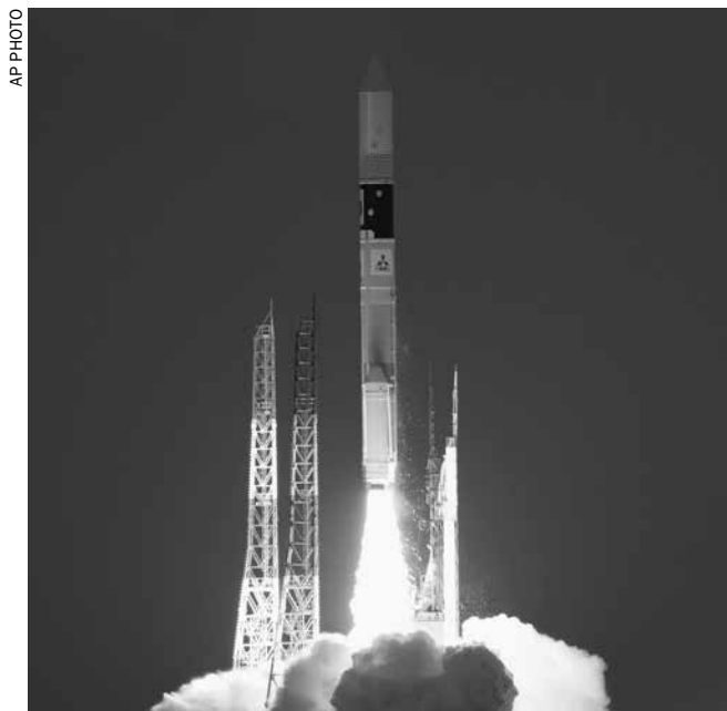
An H-2A rocket carrying an X-ray astronomy satellite called "Hitomi", is launched from the Tanegashima Space Center in Kagoshima Prefecture last month