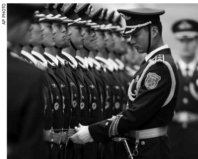
A Chinese People's Liberation Army soldier checks a line of an honor guard as they prepare for a welcome ceremony for visiting German President Joachim Gauck outside the Great Hall of the People in Beijing

A Defense Ministry notice viewed yesterday said both the regular army and the paramilitary People's Armed Police would be covered under the ban. It identified no specific fields but is thought to mainly target military art troupes, publishing houses and hospitals that