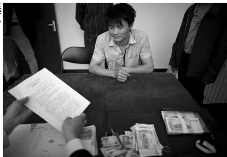
In this May 19, 2011, file photo, a lawyer (front) hands over legal documents to a migrant worker (center, back) whose delayed wages were claimed through lawsuits with free legal aid at Beijing Zhicheng Migrant Workers' Legal Aid and Research Center in Beijing