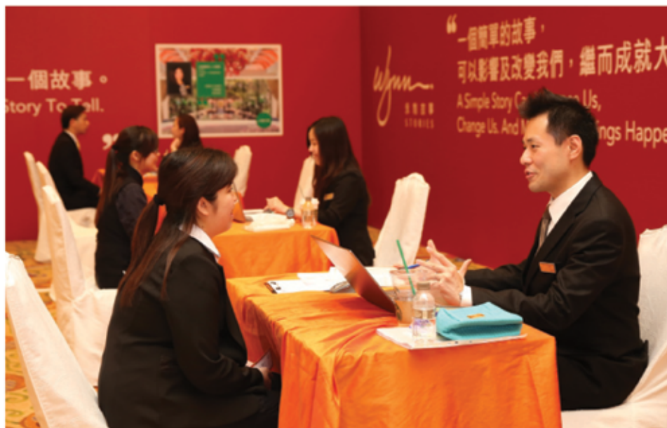
Wynn Palace has been working with several local associations in order to organise job fairs. There has been an overwhelming response by the public.