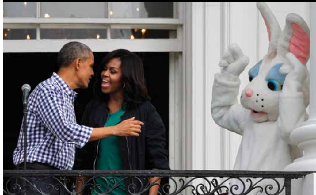
Whitehouse Easter. President Barack Obama turns to embrace first lady Michelle Obama, after thanking her during his remarks, as the Easter Bunny reacts, during their final White House Easter Egg Roll at the White House in Washington, yesterday.