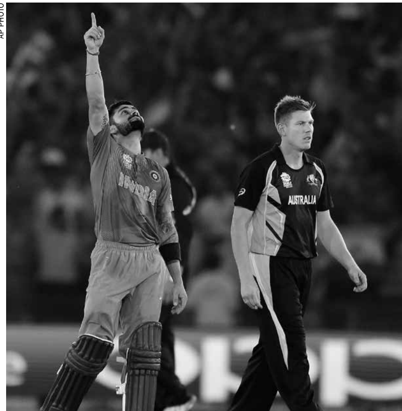
India's Virat Kohli (left) celebrates as he walks with Australia's James Faulkner after winning by six wickets during their ICG World Twenty20 2016 cricket match in Mohali on Sunday

Kohli batted himself in with Yuvraj and then took the initiative, smashing 19 off the 18th over bowled by James Faulkner and 16 off the 19th from Nathan Coulter-Nile,