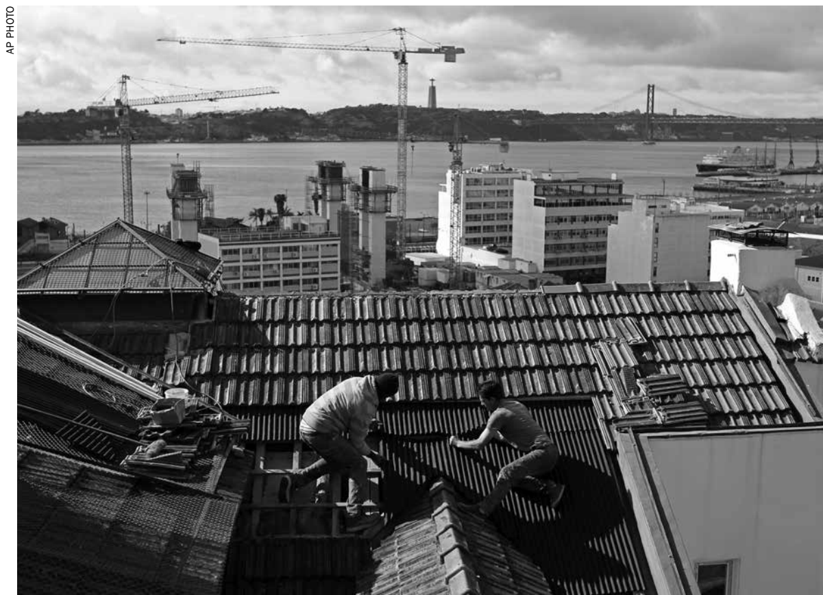
In this Feb. 28, 2014 file photo, construction workers repair the roof of a building in Lisbon. The country's construction sector collapsed amid the financial crisis, which saw the state take a 78 billion-euro bailout in 2011

blic works project in austerity-minded Portugal last year was a measly 89,000 euros (currently $99,000), according to sector association AECOPS. Public investment is being cut by a further 5.6 percent this year as the government strives to meet the eurozone's demand for a budget deficit below 3 percent, from an expected 4.3 percent last year.