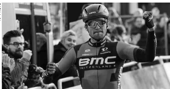
Belgium's Greg Van Avermaet of the BMC Racing Team jubilates as he wins the Belgian cycling classic Omloop Het Nieuwsblad in Gent

world title last September in Richmond, Virginia, posted his first victory in the rainbow jersey.