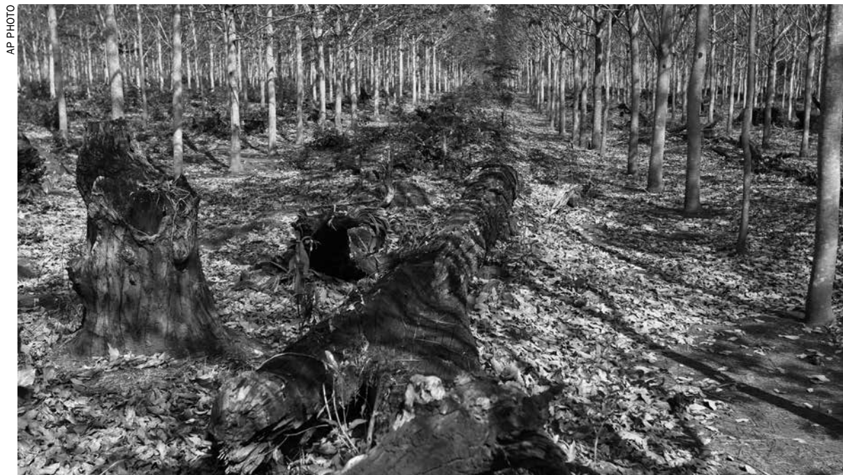
The remains of trunks and stumps from old forests that were cut down to make way for a rubber plantation operated by Socfin-KCD, a European-Cambodian joint venture, near Bousra commune, Monduliri province