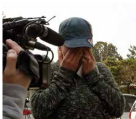
A representative of sex workers wipes her tears after listening to a judgment at the Constitutional Court in Seoul

Critics of the anti-prostitution laws say they limit women's freedom over their bodies. They also say that tougher punishment has made sex work more dangerous for women by