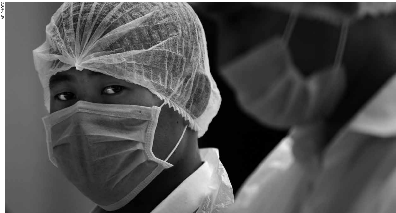
In this Sunday, May 3, 2015 file photo taken during a government organized media tour, cafeteria food servers work at a government-run accommodation facility for laborers, in Doha

Amnesty compiled the 52-page report based on interviews from February to May last year with 132 construction workers at the Khalifa International Stadium, one of several arenas that will host World Cup matches. The London-based group also interviewed 99 migrants doing landscaping work in a surrounding sports complex that is not directly related to the games, and three other gardeners working elsewhere.