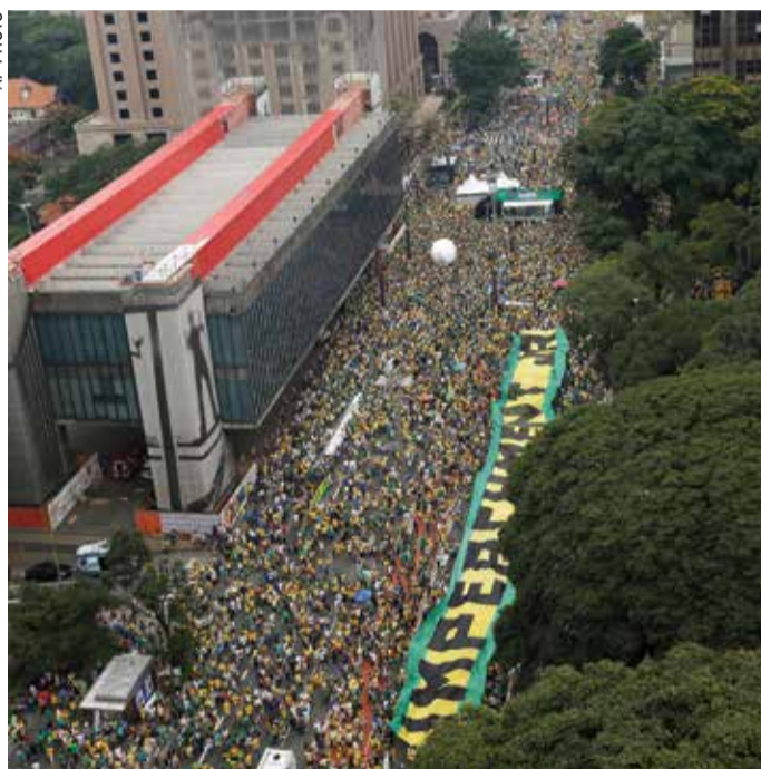
Demonstrators march along Paulista Avenue holding a giant banner that reads in Portuguese: "Impeachment now" during a protest against Brazil's President Dilma Rousseff in Sao Paulo