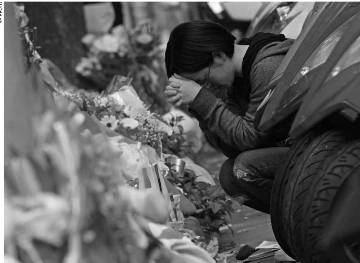
A woman prays in front of a makeshift memorial offered with flowers and stuffed animals for a girl who was killed on Monday by a knife-wielding assailant outside a subway station in Taipei

But the attack triggered debate about whether to keep the death penalty as a deterrent against violent crime. Legislators have been discussing reforms to the punishment, which had been effectively suspended