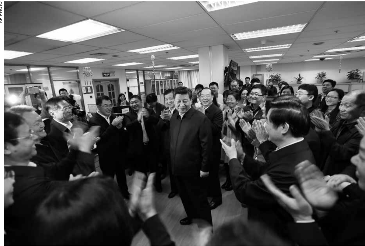
In this Feb. 19, 2016 file photo, people applaud as Chinese President Xi Jinping (center) talks with editors in the general newsroom of the People's Daily in Beijing

Xi's critics are accusing him of amassing too much power and of betraying the party's recent tradition of collective decision-making. Other common themes of the recent criticism include Xi's anti-corruption campaign, which