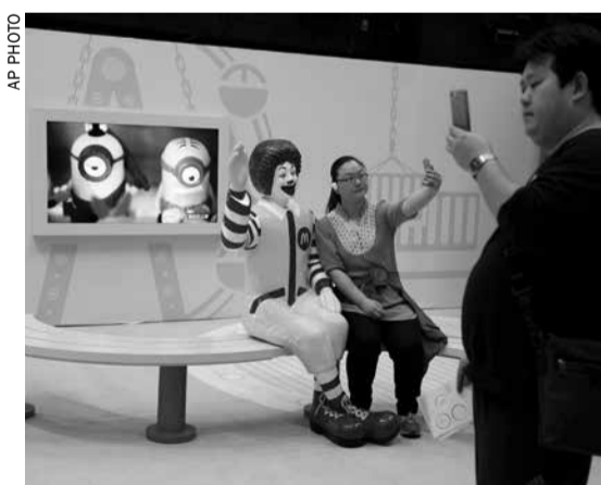
Visitors take photos at an exhibition showcasing the toys given out by McDonald's in the past 25 years in mainland China, in Beijing

McDonald's, based in Oak Brook, Illinois, is overhauling its business under CEO Steve Easterbrook after acknowledging it failed to keep up with changing tastes. The total number of global