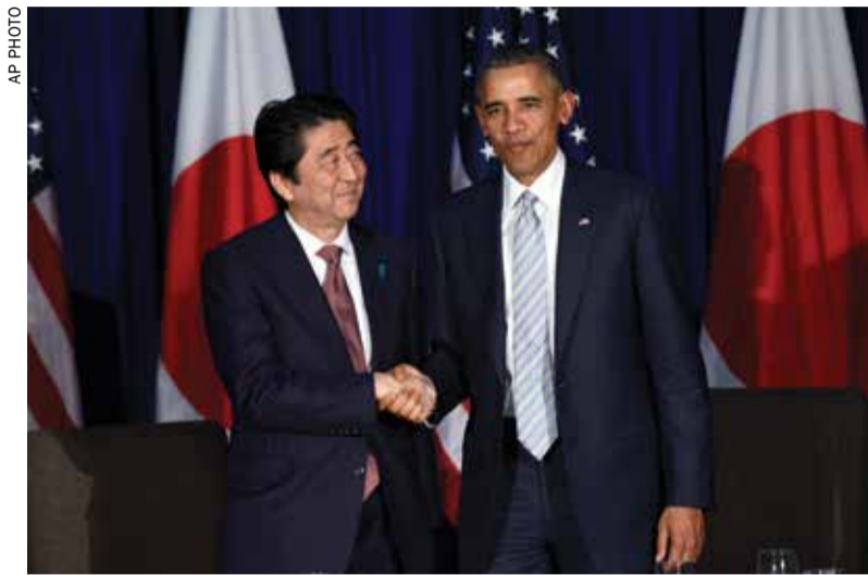
In this Nov. 19, 2015 file photo, President Barack Obama shakes hands with Japanese Prime Minister Shinzo Abe in Manila, Philippines

China's influence over the North will be front and center later in the day when Obama sits down with Xi. The White House said that meeting was also an opportunity for Obama to press U.S. concerns about human rights