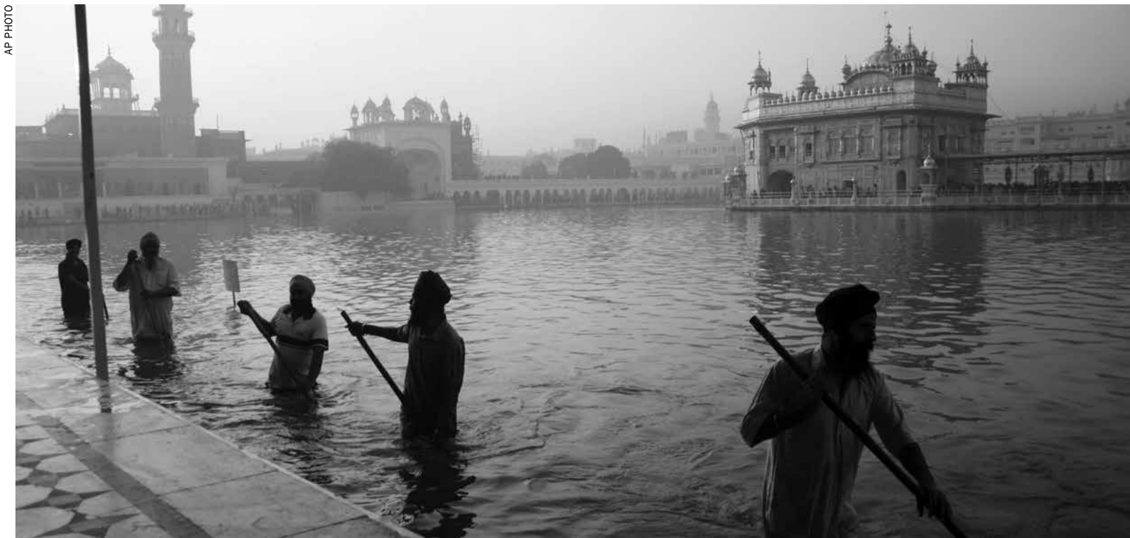
In this Nov. 17, 2013, file photo, Indian Sikh devotees clean the tank early in the morning at the Golden Temple, on the birth anniversary of Guru Nanak, the first Sikh Guru in Amritsar