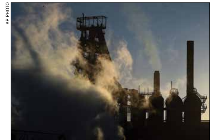
The sun sets as smoke and steam rises from the Tata steel plant in Port Talbot, Wales, after the steel giant confirmed plans to sell its UK assets

Trade union GMB, which represents British steelworkers, said the government should consider taking over the industry to protect jobs, while opposition Labour Party leader Jeremy Corbyn, who has also called for nationalizing the plants, said the Prime Minister had offered no solutions.