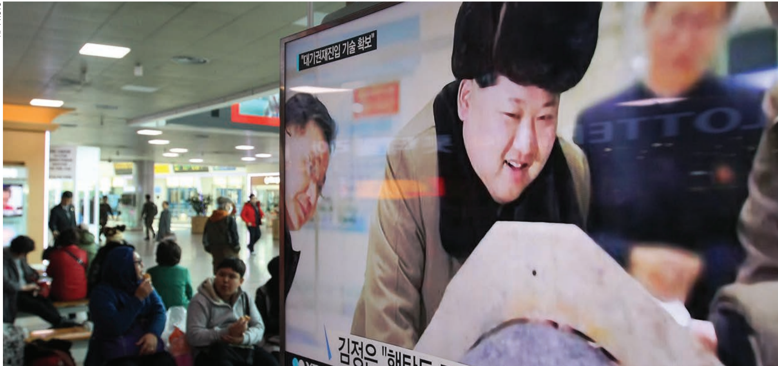
A TV screen shows North Korean leader Kim Jong Un during a news program, at Seoul Railway Station