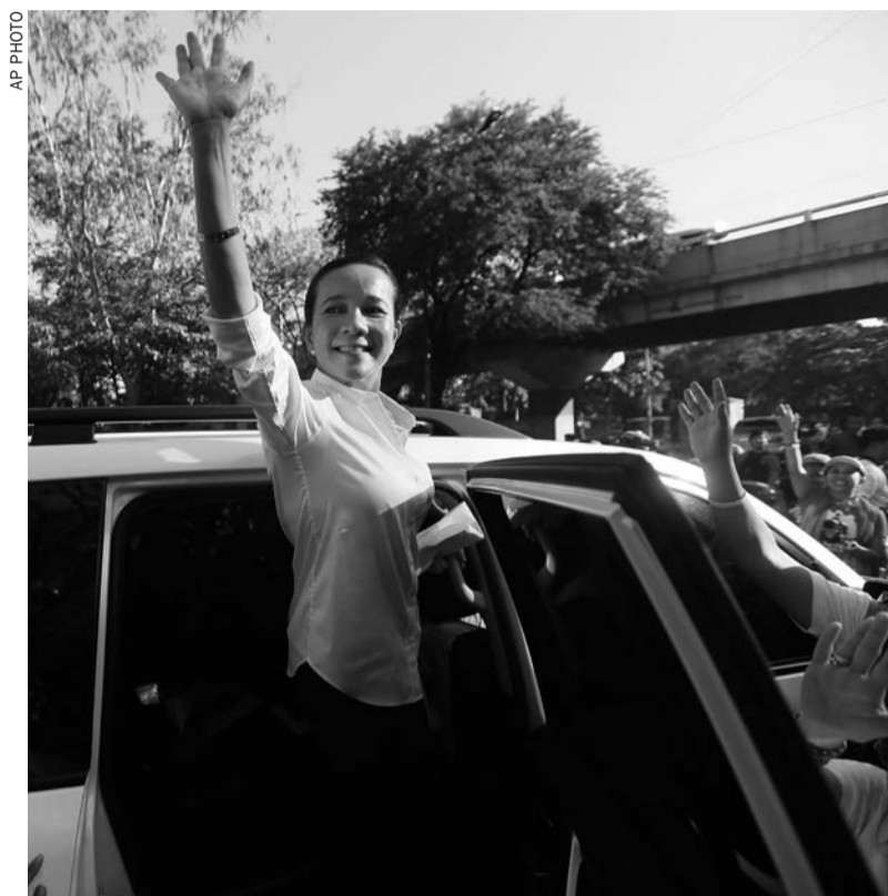
Presidential candidate Sen. Grace Poe waves to her supporters following a rally to mark the 105th International Women's Day in Manila, Philippines

His daughter is pledging to fight real-life poverty and despair — and her father's public image is a huge asset in her campaign.