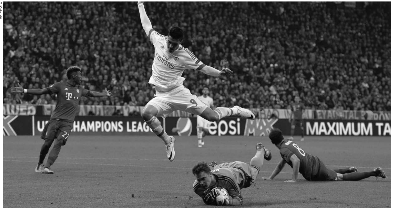
Benfica's Raul Jimenez leaps over Bayern goalkeeper Manuel Neuer during the Champions League quarterfinal first leg soccer match between FC Bayern Munich and Benfica Lisbon at the Allianz Arena in Munich

Bayern kept attacking, with Douglas Costa testing Ederon from the right. Ederon was