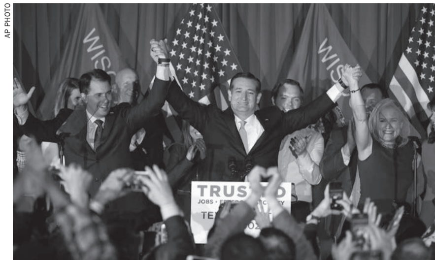
Republican presidential candidate Sen. Ted Cruz, R-Texas, raises hands with Wisconsin Gov. Scott Walker (left), and his wife Heidi (right), during a primary night campaign event in Milwaukee

At a raucous rally in Wyoming, Sanders cast his victory as a sign of mounting momentum for his cam-