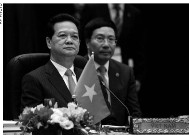
Vietnam's Prime Minister Nguyen Tan Dung

Dung's departure was a mere formality after he lost a leadership battle during the ruling Communist Party's congress in January. Dung lost to Nguyen Phu Trong, who was re-elected party general secretary for a se-