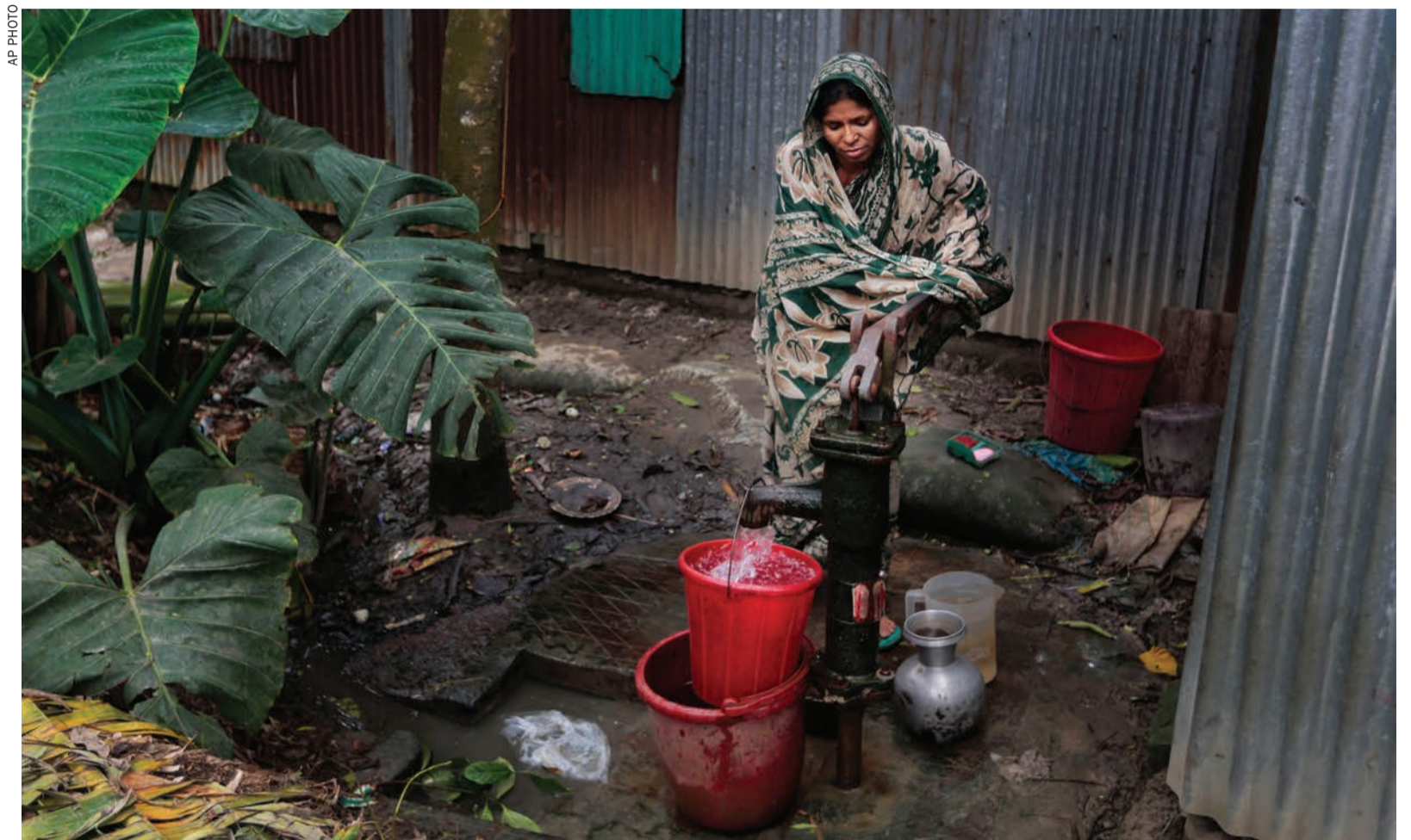
A Bangladeshi woman collects arsenic-tainted water from a tube-well in Khirdasdi village, in the outskirts of Dhaka

Human Rights Watch based its report on a survey of about 125,000 government wells dug from 2006 to 2012 specifically to give villagers safer options, after an earlier survey of 5 million wells found millions exposed to water that exceeded Bangladesh's arsenic contamination limit of 50 parts per billion. Bangladesh's limit, which is the same as in neighboring India, is far higher than the World Health Organization's recommended limit of 10 ppb.