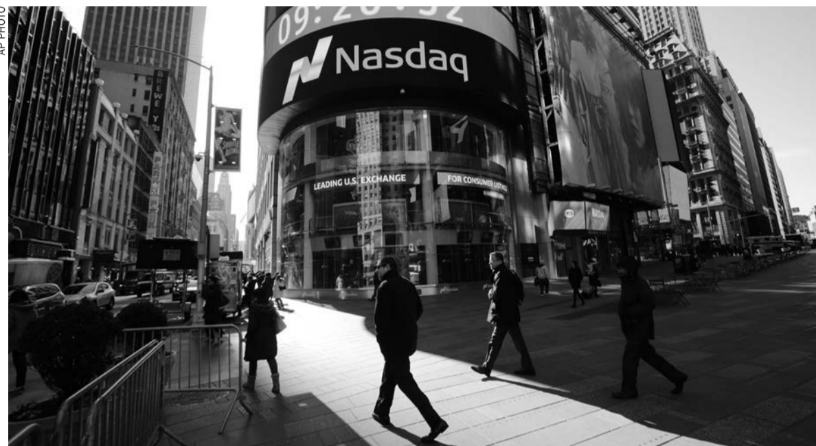
People walk past the Nasdaq MarketSite in New York

A report due next week will also probably show inflation climbed to 2.4 percent in March. While below the government's 3 percent target, it may be enough to give it pause before easing monetary policy. An official factory gauge last week showed improving conditions for the first time in eight months, while industrial profits halted a seven-month losing