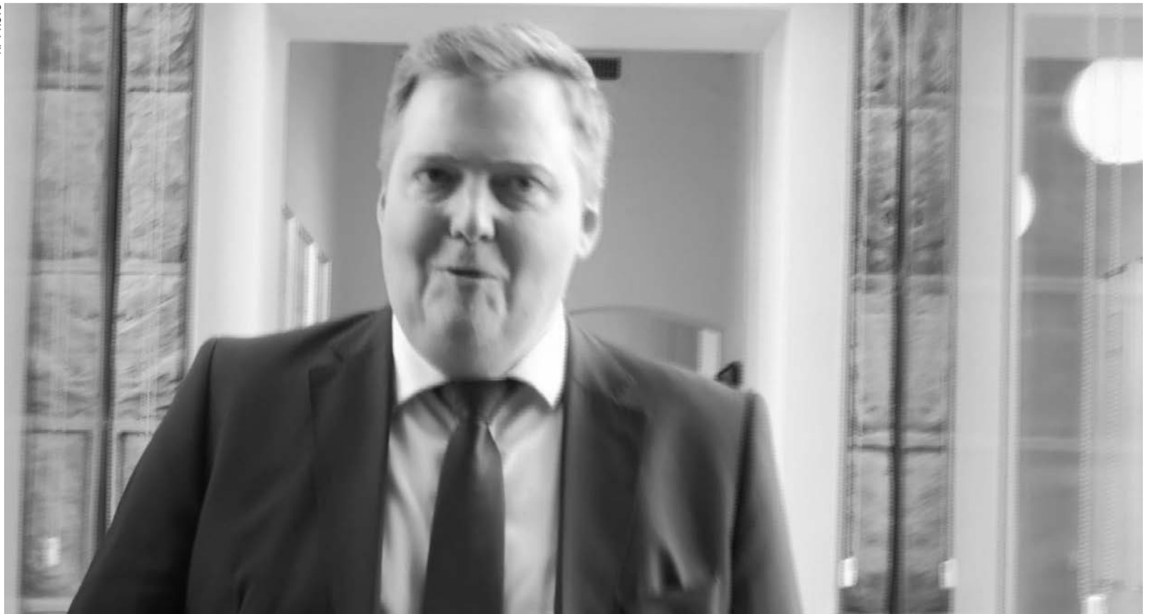
Iceland's Prime Minister Sigmundur David Gunnlaugsson