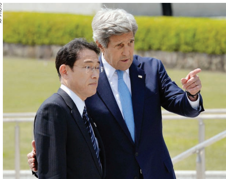
Japan's Foreign Minister Fumio Kishida (left), and U.S. Secretary of State John Kerry talk after offering wreaths at the cenotaph at Hiroshima Peace Memorial Park in Hiroshima

Kerry's appearance, just footsteps away from Ground Zero, completed an evolution for the