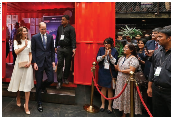
Britain's Prince William (second left), and his wife Kate (left), the Duchess of Cambridge, arrive at young entrepreneurs' event in Mumbai

William and Kate will then head back to India, where they'll wind up their tour with a visit to the Taj Mahal, retracing the steps of a 1992 visit to the monument of love by William's mother, the late Princess Diana.