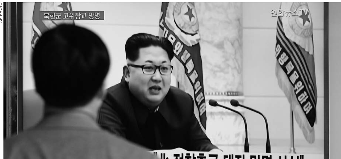
A man watches a TV news program showing file footage of North Korean leader Kim Jong Un at Seoul Railway Station in Seoul

Bureau before fleeing to South Korea, according to Seoul's Defense and Unification