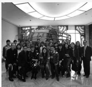
world's highest figure-eight Ferris wheel.

Twenty-six lecturers and students majoring in design toured the 5,000-seat Studio City Event Center and the House of Magic, unlocking the secrets of the magic show from backstage. According to a press release, the delegation was briefed on the design, construction and operation of the Batman Dark Flight, the world's first flight simulation ride based on the "Batman" franchise. The tour concluded at the Golden Reel, the