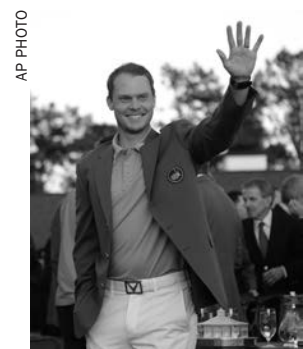
Sheffield's Danny Willett (pictured) joined three-time winner Nick Faldo as the only Englishmen to win the Masters. Sunday was a huge day for several of his countrymen, too. Five

English players had top-10 finishes at Augusta National. Lee Westwood tied Texan Jordan Spieth for second at 2-under 286, three shots behind Willett. Paul Casey was fourth at 1 under, Matthew Fitzpatrick was in a three-way tie for seventh for even par, and Justin Rose tied for 10th at 1 over. It was a cocktail of seasoned vets like Casey, Westwood and Rose mixed with up and comers, including Fitzpatrick, 21 and Willett, 28. "I hope we're not changing the guard just yet," Casey said. "Give us another five years or so." In fact, Willett, Casey and Fitzpatrick seemed in perfect synch in the final round. All shot 67s. Nobody was better over those final 18 holes than the three Englishmen.