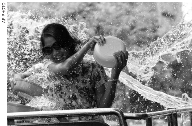
A Thai woman splashes water on people from the back of a truck during the Songkran water festival to celebrate the Thai New Year in Bangkok

The Tourism Authority of Thailand expects this year's holiday to generate more than 15 billion baht (USD427 million) for the tourism sector and attract half a million visitors in a