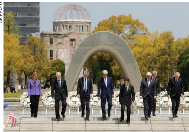
G7 foreign ministers walk together after placing wreaths at the cenotaph at Hiroshima Peace Memorial Park in Hiroshima

"In this historic meeting, we reaffirm our commit-