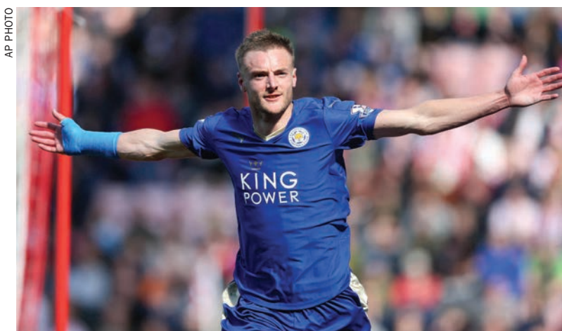
Leicester City's Jamie Vardy celebrates his goal during the English Premier League soccer match against Sunderland at the Stadium of Light, Sunderland, England

Both teams had penalty appeals waved away - Sunderland after Patrick van Aanholt's cross struck Robert Huth's arm