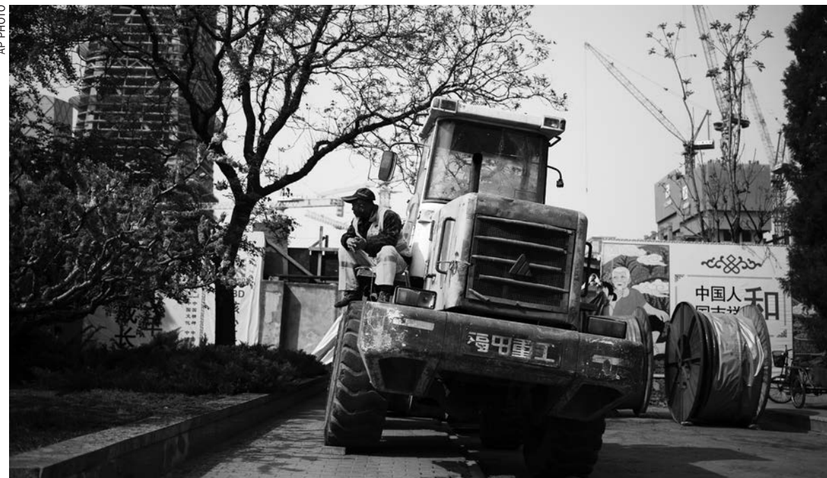
A worker takes his break on a bulldozer parked near a construction site at the Central Business District of Beijing

But he cautioned that "it's a very volatile time for the global