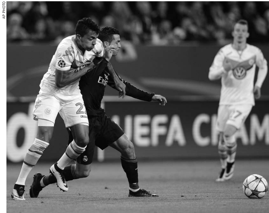
Wolfsburg's Luiz Gustavo (left), and Real Madrid's Cristiano Ronaldo challenge for the ball during the Champions League first leg quarterfinal soccer match between VfL Wolfsburg and Real Madrid in Wolfsburg

Madrid has failed to reverse a first-leg loss the last eight times it needed to, including five times when the return match