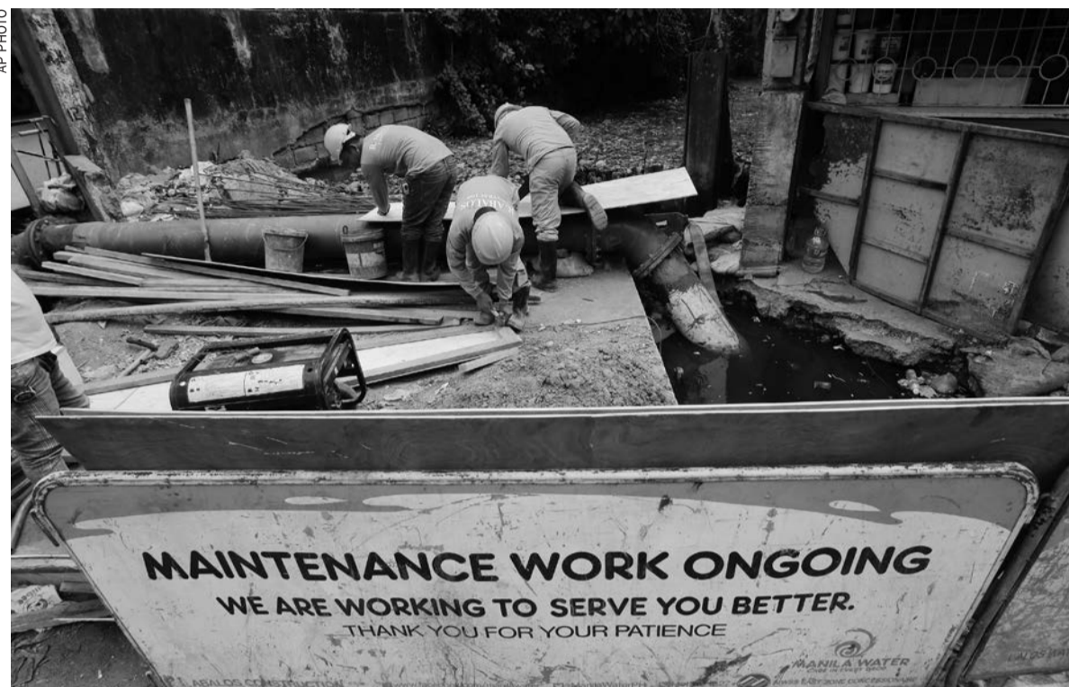
Filipino subcontractors of Manila Water Co. covers a pipe next to a garbage filled creek in suburban Mandaluyong, east of Manila