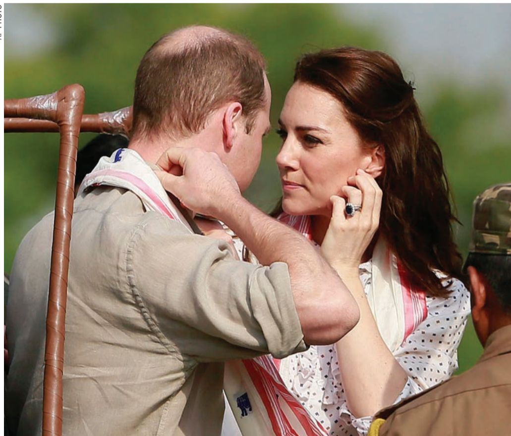
Britain's Prince William (left) and Kate, the Duchess of Cambridge