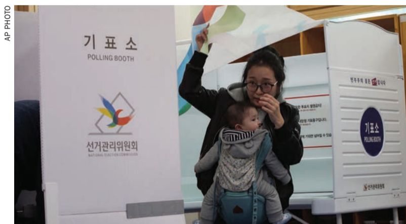
A local resident with her child comes out of a polling booth to cast her ballot for parliamentary elections at a polling station in Seoul

But exit polls by three national television networks unveiled after voting ended at 6 p.m. showed Saenuri managing 118 to 147 seats in the 300-seat assembly. The networks projected the main opposition Minjoo Party winning 97 to 128 seats, and the People's Party, a new party created mostly