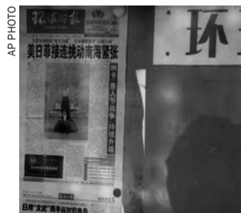
A Chinese man is reflected in glass as he reads China's nationalistic tabloid Global Times' front page article with a headline that reads: "the U.S., Philippine and Japanese military steer tension in the disputed South China Sea"

Lu's statement issued Tuesday and posted on the ministry's website said the G-7 countries should have focused on global economy instead of "hyping up maritime