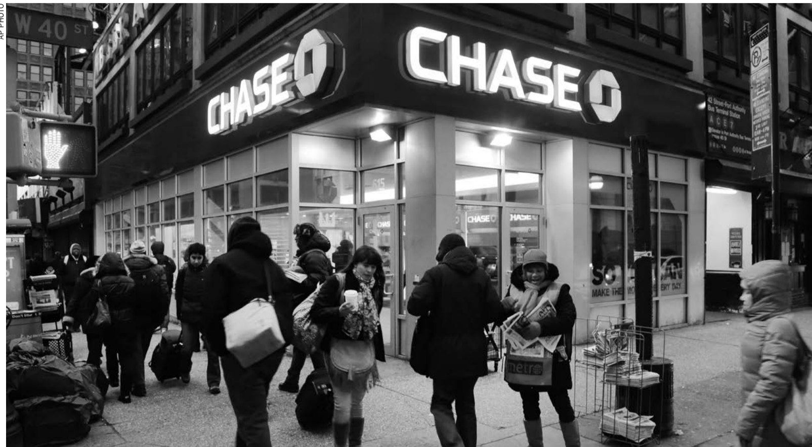
People walk past a branch of Chase Bank, in New York

In their 18-month review, the Fed and the FDIC also found weaknesses that must be addressed in the plans of Goldman Sachs and Morgan Stan-