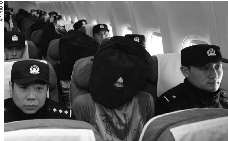
Chinese suspects involved in wire fraud (center), sit in a plane as they arrive at the Beijing Capital International Airport in Beijing

Analysts say China's specific goal is to extract concessions from Taiwanese President-elect Tsai Ing-wen, who has refused to endorse Beijing's position that Taiwan and the mainland are part of a single Chinese nation. The sides split