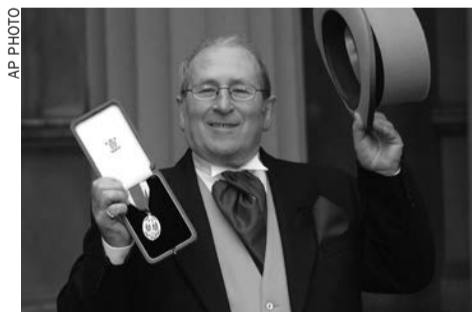
British playwright Arnold Wesker

"There were quarrels and they were upsetting, but in a strange way there was so much love around, it overshadowed the distress," he told the BBC's "Desert Island