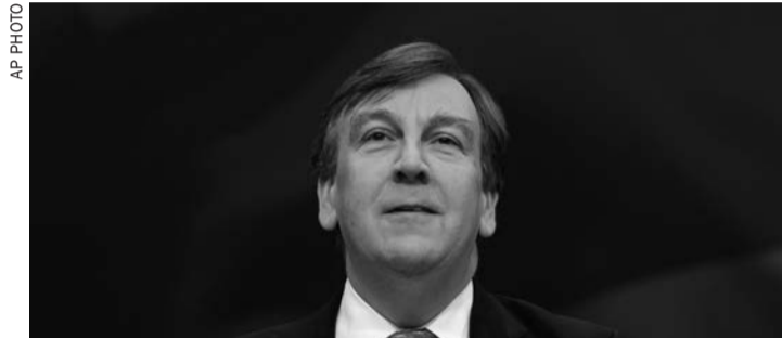
John Whittingdale, Culture Secretary

was a bit embarrassing at the time," Whittingdale said in a statement. "The events occurred long before I took up my present position and it has never had any influence on the decisions I have made as culture secretary."