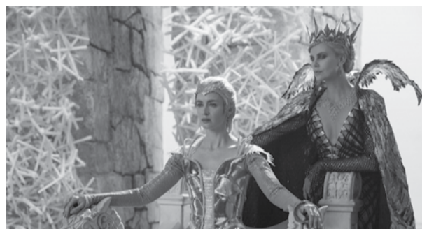
THE HUNTSMAN: WINTER'S WAR

ROOM 1 (2D) 2.30, 6.30, 9.30 pm (3D) 7.30 pm