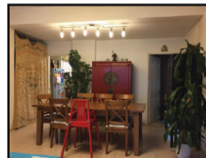
Family apartment in Hellene Gardens (Ref: 16020571) 1,663sq. ft. HKD 7.8M Rate: HKD 4,690sq ft

Good size open plan living & dining area. The kitchen has been renovated a few years ago enclosing the original balcony, maids room & toilet.