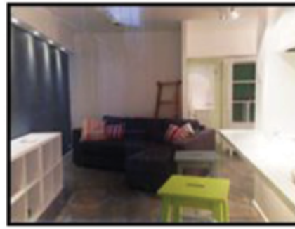
Modern Apartment Old Taipa - Nam Long (Ref: 16020564) 820sq. ft. HKD 12,800

Convenient location close to banks, restaurants and shops, walking distance to Cotai Strip. Available from end of April 2016