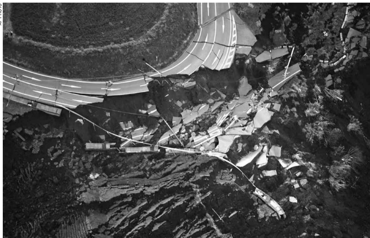
In this aerial photo, the landslide caused by the earthquake disrupts the road in Minamiaso town

The hardest-hit town appears to be Mashiki, on the eastern border of Kumamoto city, where 20 people died.