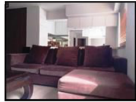
Rent Houston Court (Ref: 15110549) 740sq. ft. HKD11,800

Newly renovated 2 bedroom apartment. 1 x Double bedroom. 1 x Box guest room with large wardrobe. Modern shower room. Open plan kitchen / living area. Renovated throughout; electric, plumbing, kitchen cabinets, bathroom, double glaze windows & A/C all new. New white goods in kitchen.