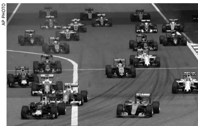
Daniel Ricciardo and Nico Rosberg of Germany lead the field into turn one at the start of the Chinese Formula One Grand Prix

Rosberg started on pole position and led nearly the entire race by a wide margin to win his third race to start this season