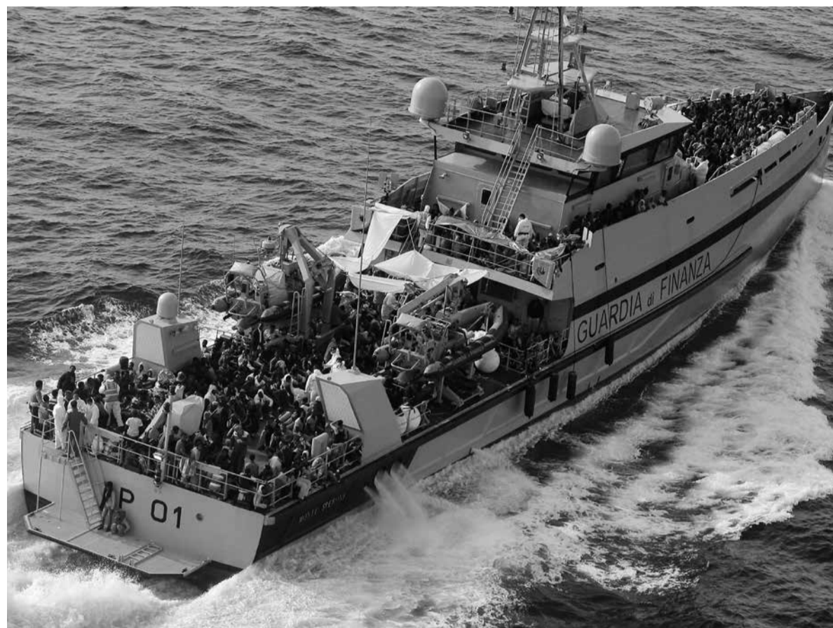
Rescued migrants are seen aboard MP01 ship of the Italian border police in the Mediterranean Sea

Most of those 24,000 migrants were scooped up by Italian coast guard and EU vessels from recklessly overloaded vessels that were left drifting, engines dead, between Libya and Italy in a body of water dubbed the Lampedusa