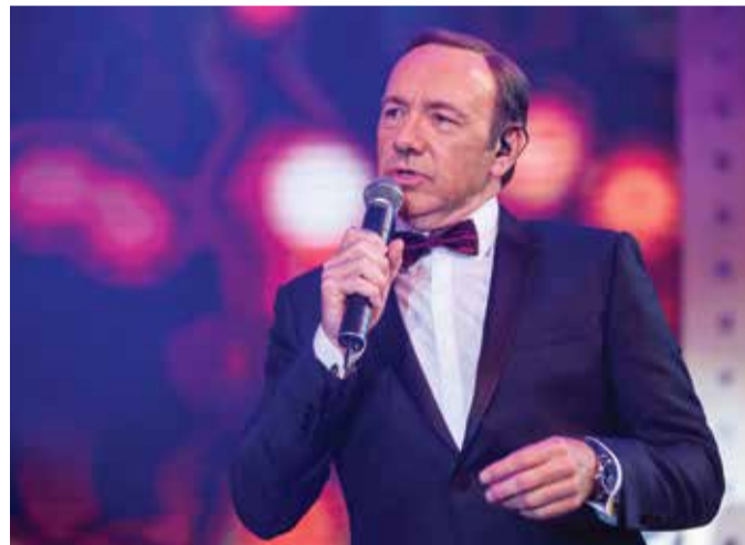
Kevin Spacey pictured in Macau

AMERICAN actor Kevin Spacey recently recounted his visit to Macau in 2014, describing how the overwhelming response in China to the political drama "House of Cards" has turned the actor into an instantly recognizable personality in Macau.