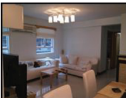
Kam Long, Lilau Square, Macau (Ref: 15085452) 1,100sq. ft. HKD 4.9M Rate: HKD4,454sq ft

Originally two apartments renovated in 2004, this owner redesign the properties into a lovely 3 bedroom apartment with one spacious bathroom.