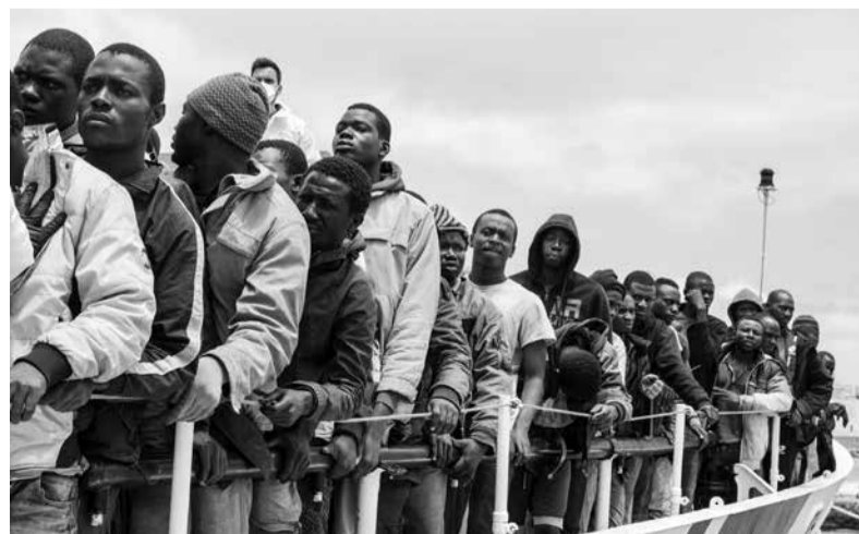
Migrants wait to disembark from the Italian Coast Guard ship Peluso, onto the tiny Italian island of Lampedusa

"Europe cannot solve the problem in the central Mediterranean on its own. It needs a stable government in Libya," Soda said. "Until that day comes, this migrant route will keep producing tragedies."