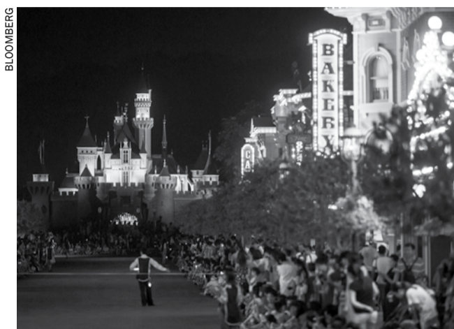
The Sleeping Beauty Castle stands illuminated at night at Walt Disney Co.'s Disneyland Resort in Hong Kong

"It is important for the company to maintain a solid foundation for sustainable, long-term growth," Disney said. "We regularly make operational adjustments to ensure we deli-