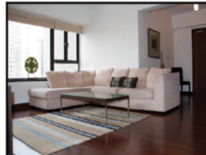
Manhattan F Unit, Central Taipa (Ref: 16020569) 1,720sq. ft. HKD 21,500

Newly furnished apartment in Taipa's latest complex. Fully furnished inc. linens & kitchen ware. Open kitchen inc. built in Siemens appliances. Spacious living area with 3 metre L shape sofa bed. Good size balcony for two. Two bedrooms & one Bathroom.