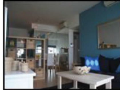
One Central, Tower 7, Unit E Macau (Ref: 15090533) 1,300sq. ft. HKD 26,000

Large master bedroom with en suite bathroom. Two guest bedrooms (one single & one double). Each bedroom has plenty of free standing storage. Open plan living / dining room. Galley style modern kitchen with built white goods. Small laundry balcony. Resort style facilities; lap pool kids pool, kids playroom, playground, private kitchen, BBQ terrace, sauna, steam, 1500 sq ft gym, golf simulator, work out room.