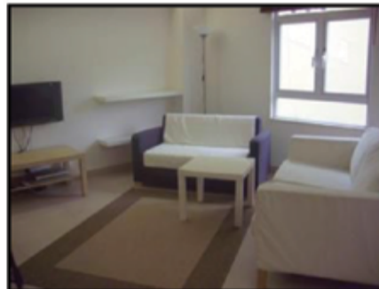
Studio in Soi Cheong (Ref: 16020568) 600sq. ft. HKD 8,250

Great size double bedrooms built in wardrobe in bedroom. Fourth floor of a walk up building very close to cafes, shops, banks, bus stop, a unique chance to live in Central Macau.