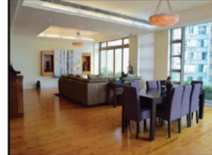
La Baie Du Noble (Ref: 15090541) 3,700sq. ft. HKD 45,000

Premier Apartment Building. Central Location. Bright & Airy. Newly furnished / Colour Palette Grey Blues, White & Yellow. Modern Fitted Kitchen galley style. Available from December 2015. Newly furnished. Excellent club facilities.