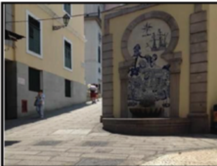
Tai Nin – Macau (Ref: 15090536) 850sq. ft. HKD 8,500

Lovely furnished one bedroom apartment near Senado Square. Bright open planned living room, dining room and kitchen.