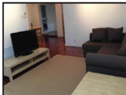
Jou Fai Kuok, St Pauls Ruin's Macau (Ref: 15075447) 570sq. ft. HKD 3.88M Rate: HKD 6,188sq ft

One bedroom apartment in Heritage Area of Macau. A five minute from the Ruins of St Pauls. Renovated 3 years ago. Good size master bedroom with built in wardrobes. Modern shower room with built in under counter cabinet.