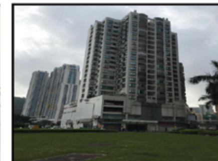
Car Park Space in Chun Leong - Taipa (Ref: 15050514) 0sq. ft. HKD 1.8M

Views from the living room across the tennis courts. Price includes one parking space.