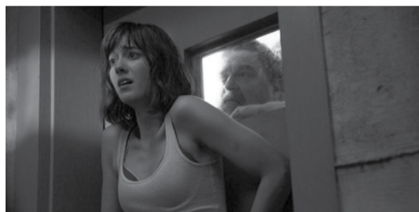
10 CLOVERFIELD LANE

Director: Cedric Nicolas-Troyan Starring: Chris Hemsworth, Charlize Theron, Emily Blunt Language: English (Cantonese) Duration: 114min