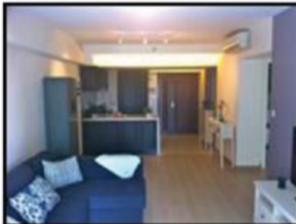
The Buckingham, Mid Floor (Ref: 16020558) 1,350sq. ft. HKD 18,000

The apartment has a modern open plan kitchen, dining & living area, good size master bedroom with built in storage, separate walk in shower room, second bedroom has built in cabinets could be a large office or small double bedroom.