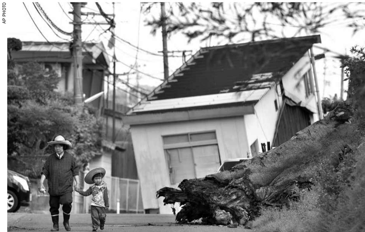
People walk near a fallen tree and house damaged by an earthquake in Mashiki