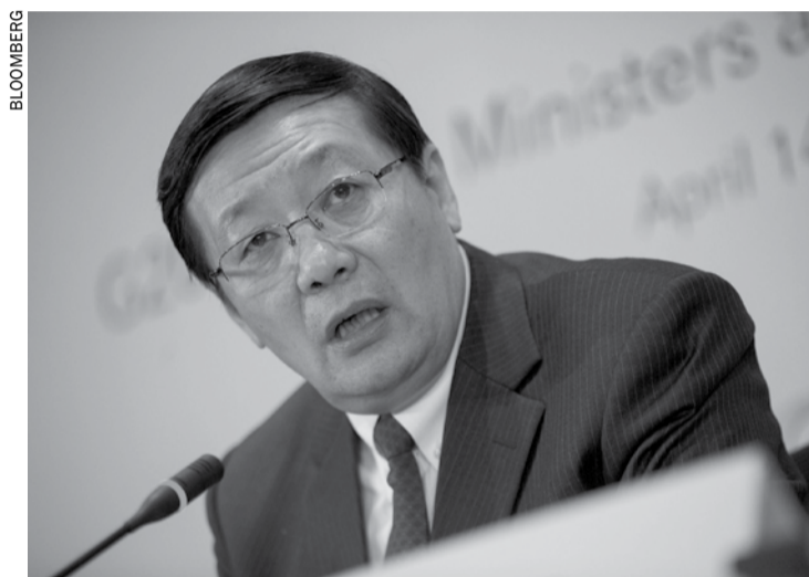
Lou Jiwei, China's finance minister

Lou's comments were China's strongest against the credit-rating agencies, after the