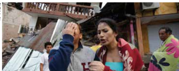
A woman cries as she stands next to house destroyed by the earthquake in the Pacific coastal town of Pedernales

Vice President Jorge Glas said there were deaths in the cities of Manta, Portoviejo and Guayaquil — all several hundred kilometers from the center of the quake struck shortly after nightfall Saturday.