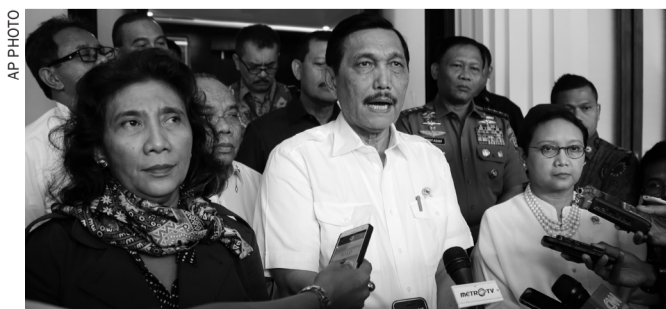
Coordinating Minister for Politics, Legal and Security Affairs Luhut Pandjaitan (center)

Coordinating Minister for Politics, Legal and Security Affairs Luhut Pandjaitan said Indonesia will