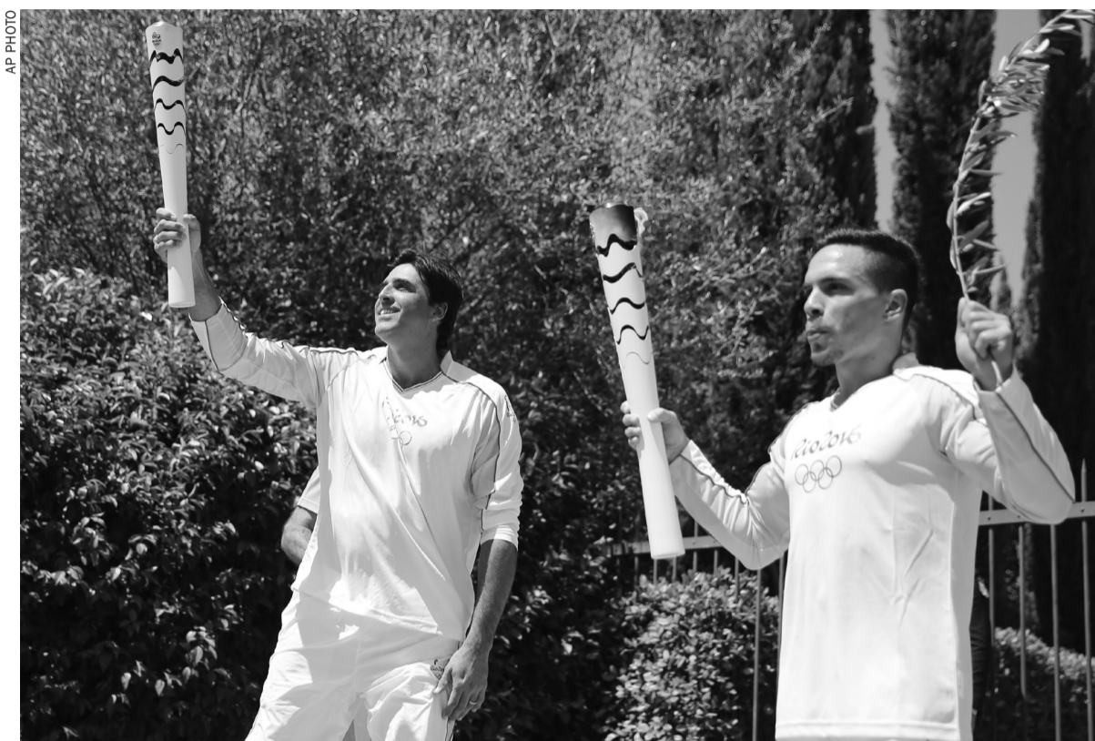
Former Brazilian volleyball player Giovane Gavio (left), and Greek gymnast Eleftherios Petrounias (right), show off their torches with the Olympic flame

a message of hope in troubled times — and indeed the flame will carry this message into all corners of Brazil and, indeed, all the world," he said. "Despite the difficulties that Brazil is facing today, the flame is a timeless reminder that we are all part of the same humanity."