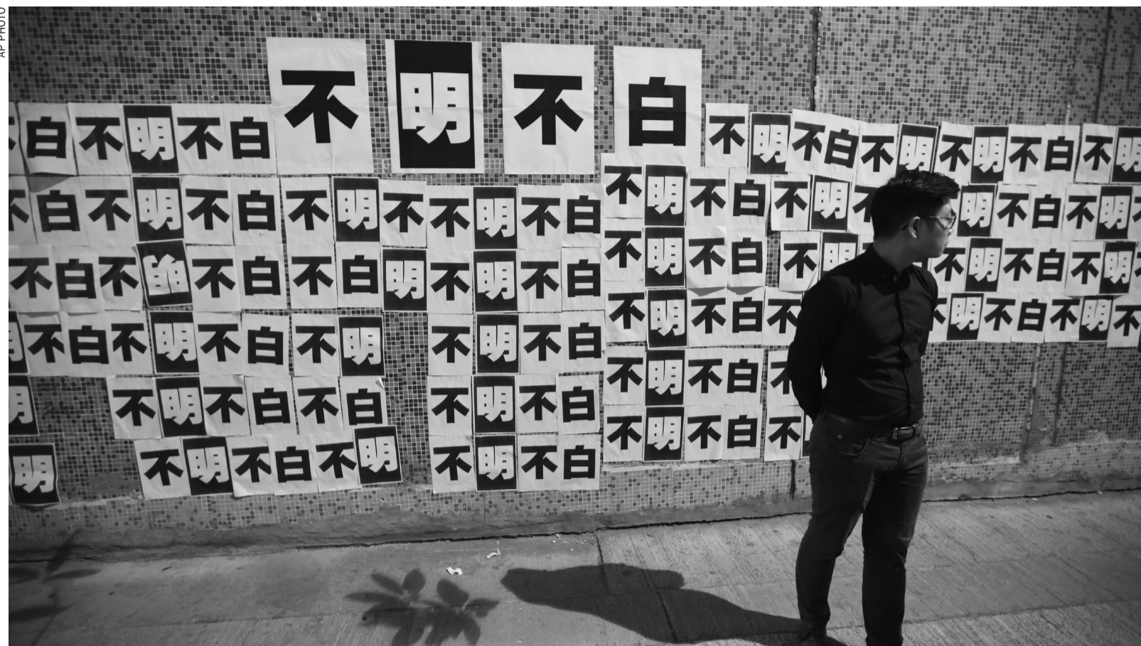
A man walks past placards in Chinese which read "Cannot comprehend" outside the Ming Pao newspaper's office building