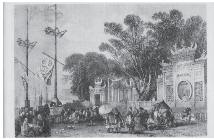
Auguste Borget's painting depicts A-Ma Temple, Macau