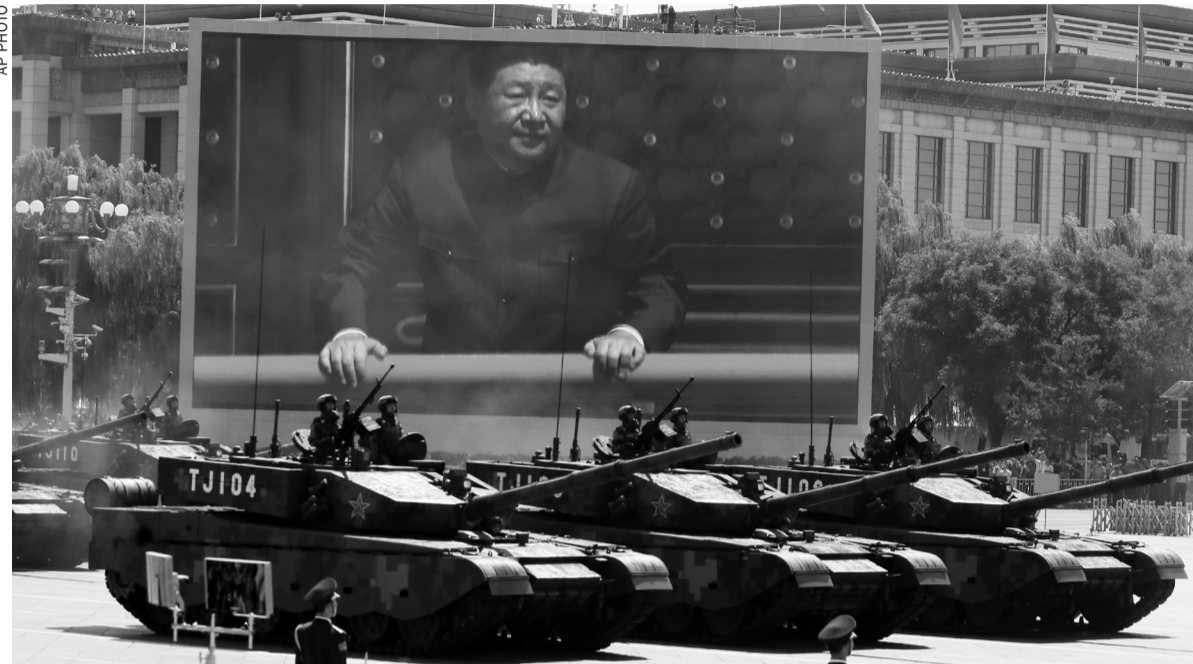
Chinese President Xi Jinping is displayed on a screen as Type 99A2 Chinese battle tanks take part in a parade commemorating the 70th anniversary of Japan's surrender during World War II held in front of Tiananmen Gate