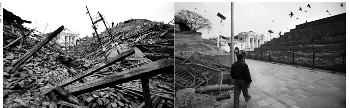
In this combination of two photos (on left), debris is seen at Durbar Square after an earthquake of magnitude-7.8, in Kathmandu