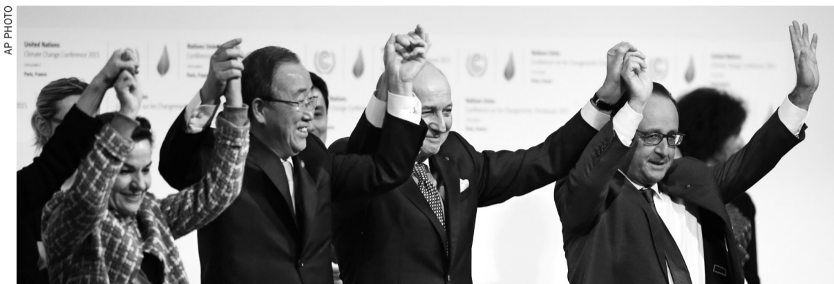
French President Francois Hollande (right), French Foreign Minister and president of the COP21 Laurent Fabius (second right), United Nations climate chief Christiana Figueres (left), and United Nations Secretary General Ban Ki-moon hold their hands up in celebration after the final conference at the COP21, the United Nations conference on climate change