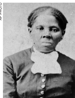
Harriet Tubman, between 1860 and 1875

The new image on the $5 bill will include civil rights leader Martin Luther King Jr., who gave his famous “I have a dream” speech on the steps of the memorial in 1963, and Marian Anderson and Eleanor Roosevelt. Anderson, an African-American opera singer, gave a concert at the memorial