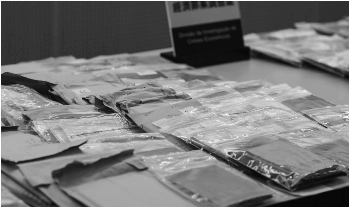
Some of the documents apprehended by the police