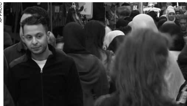
This file image taken from video and first released on Wednesday April 13, 2016 shows Salah Abdeslam (left) the fugitive from the Nov. 13 Paris attacks

"That means be judged for facts and acts that he committed but not for