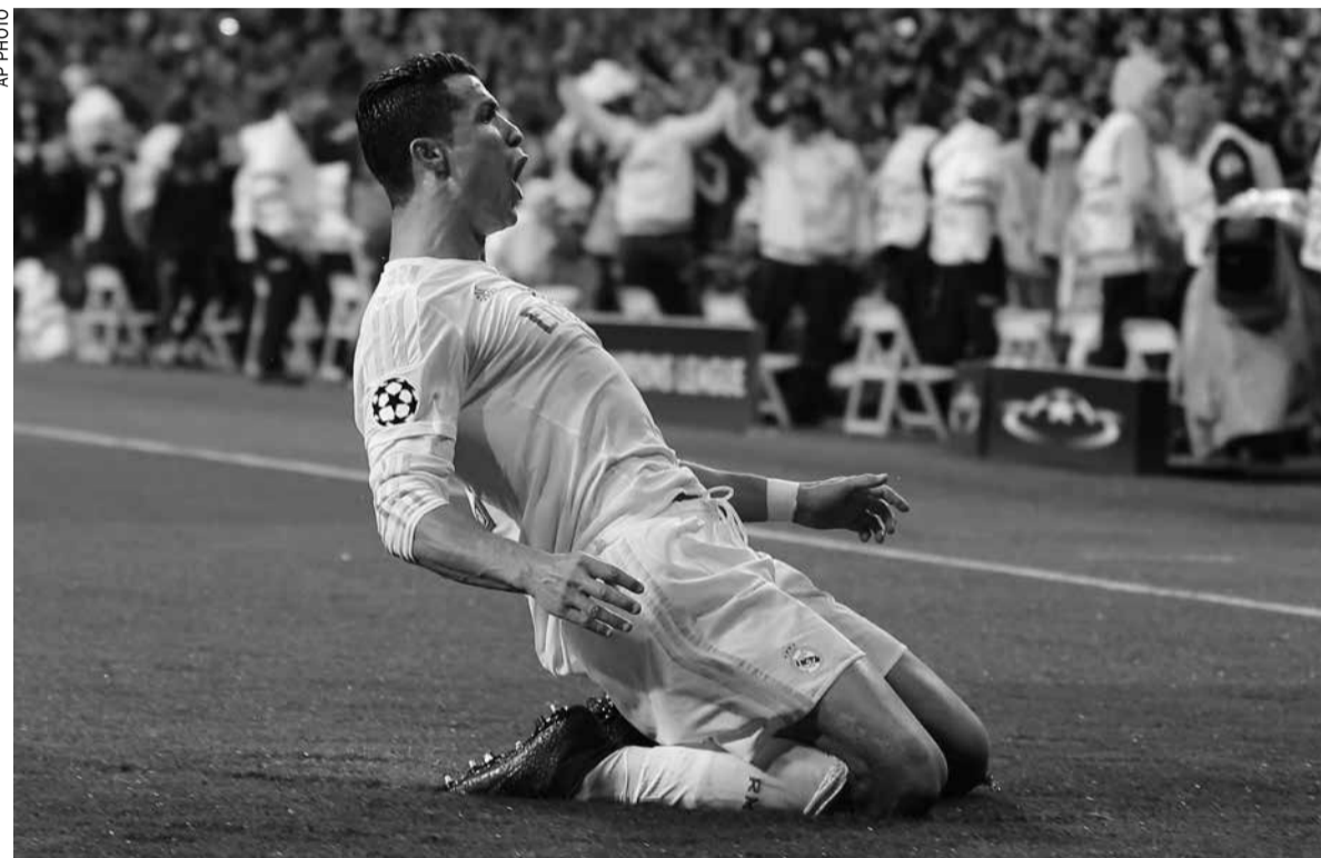
Real Madrid's Cristiano Ronaldo celebrates scoring his third goal during the Champions League 2nd leg quarterfinal soccer match between Real Madrid and VfL Wolfsburg at the Santiago Bernabeu stadium in Madrid

Zidane said he was unsure if Ronaldo and Benzema, who have scored 74 goals between them this season, will be fit for the second leg. "We have to take it day by day," the Frenchman said.