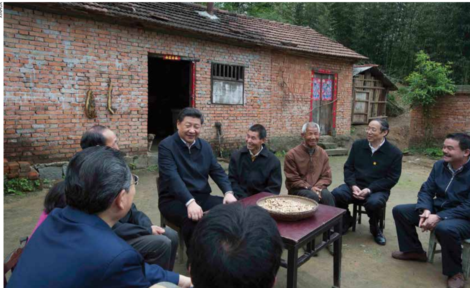
President Xi Jinping talks with villagers on poverty alleviation work in a village, in Anhui province

ged there won’t be a repeat of widespread layoffs that accompanied a similar overhaul in the 1990s, around 1.8 million workers in the steel and coal sectors alone are expected to be lose their jobs. State-ow-