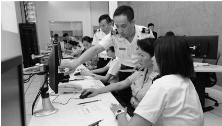
Police officers manage the typhoon drill

A typhoon drill was conducted yesterday by the Civil Protection Operational Center, during which the commissioner-general of the Unitary Police Service (SPU) disclosed plans for the merge of departments and the expansion of the operational center.