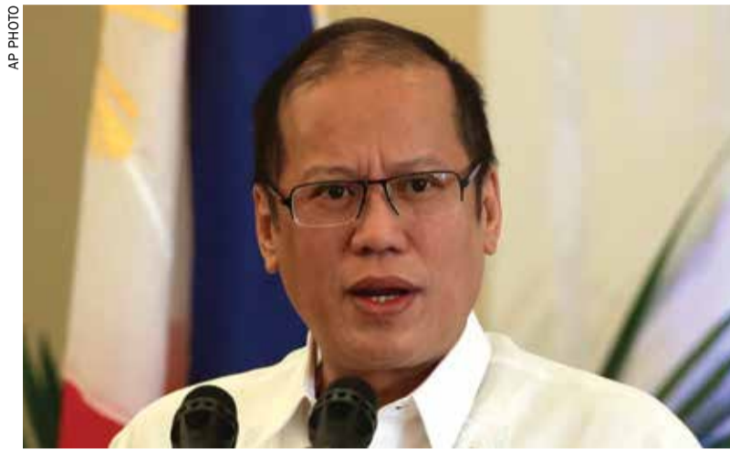
President Benigno Aquino III

While he has forged a peace pact with a larger Muslim re-