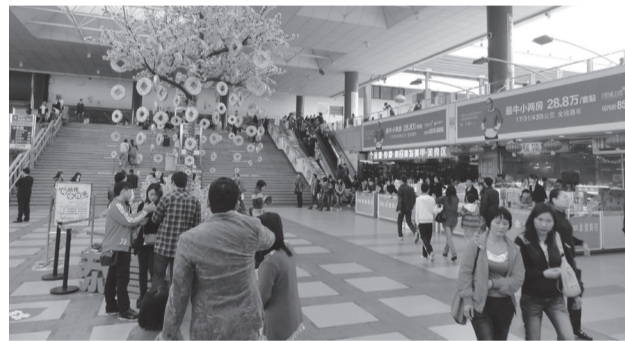
Gongbei Port, Zhuhai

L AST Monday, the Guangdong Intellectual Property Office (GDIPO) presented its annual report regarding the province's protection of intellectual property. The report says that over 697,000 counterfeit products were exported to Macau and Hong Kong from mainland provinces, according to an arti-