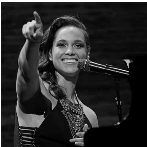
Singer Alicia Keys performs at the coffee company's annual shareholders meeting in Seattle

surprise for sure 'cause that's ... part of the fun of it," Keys said in a phone interview from New York yesterday.