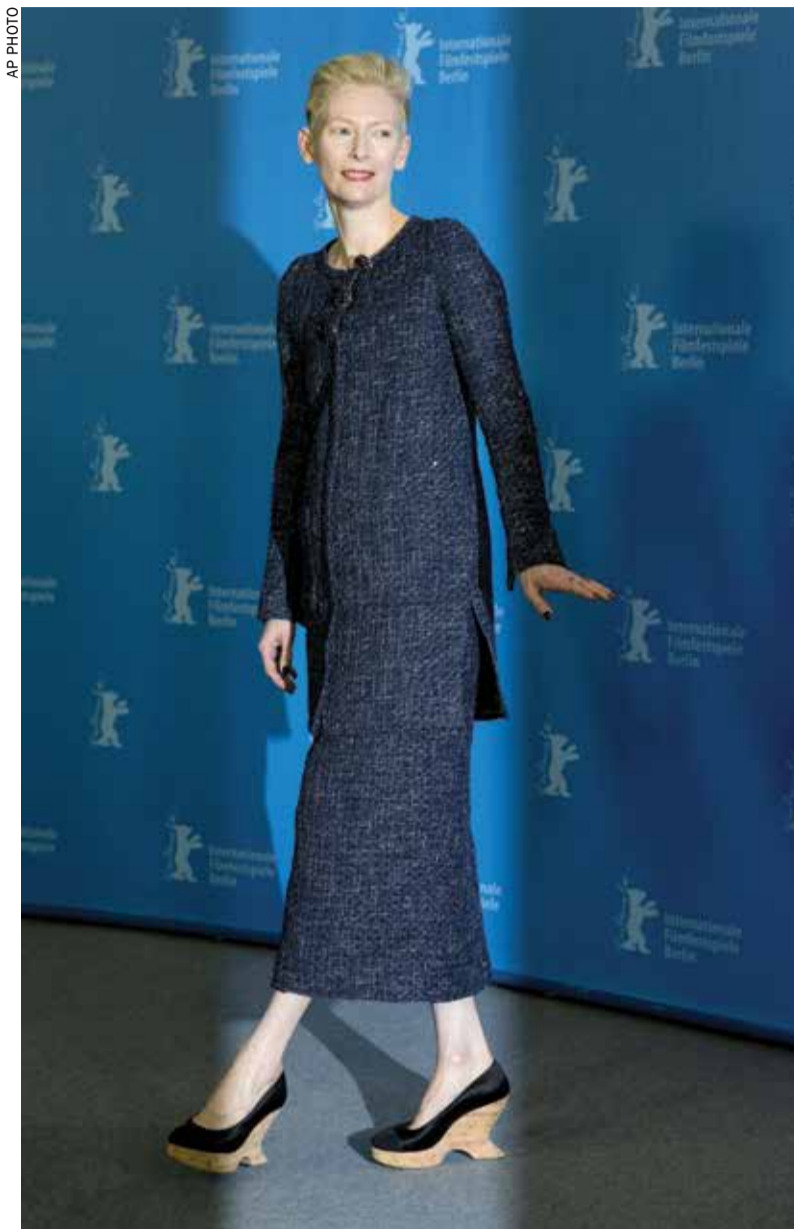
Actress Tilda Swinton

rickson instead decided to "make one of the most powerful characters in the Marvel universe a woman."