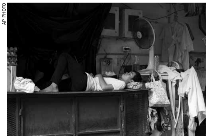
Restaurant workers sleep under a fan during a break in central Bangkok

The heat wave has also fueled a new record for