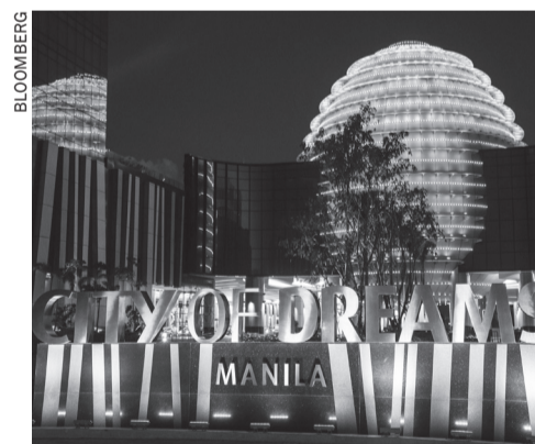
Signage for the City of Dreams Manila casino resort