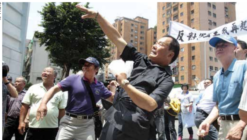
In protest of the Japanese coast guard recently detaining a Taiwanese fishing boat, fishermen hurl eggs outside of the Japan representative office in Taipei

S CORES of Taiwanese fishermen protested yesterday outside Japan’s representative office in Taipei to demand an apology over the seizure of one of their fishing boats by the Japanese coast guard.