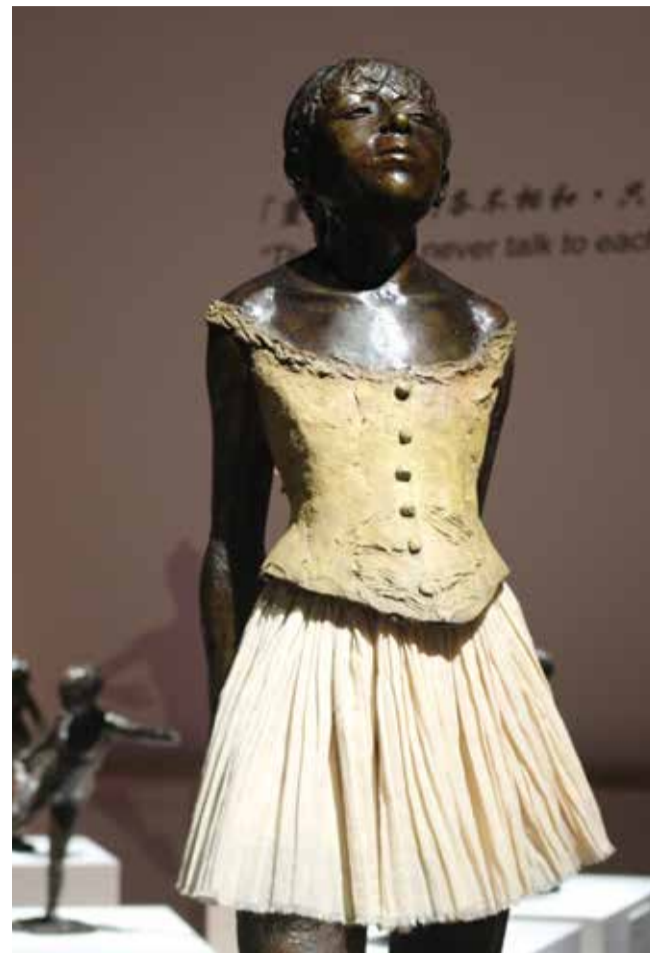
Dega's famous sculpture, “Little Dancer Aged Fourteen”

“This collection of 74 works belongs to the foundation [...] and unfortunately we don’t have any of Degas’s paintings. We could not get paintings from museums in China