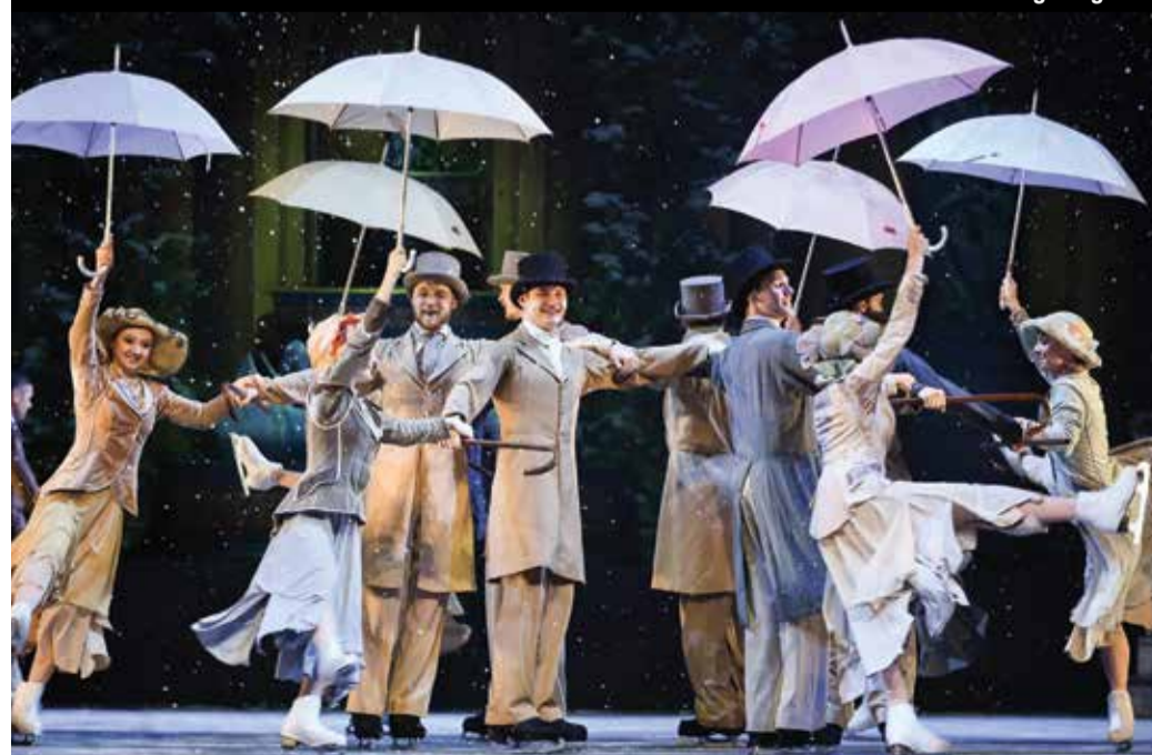
Ballet on ice. Actors perform ballet "Swan Lake on Ice" in Hong Kong.