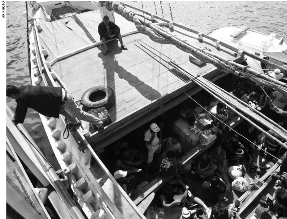
Iranian asylum seekers who were caught in Indonesian waters while sailing to Australia sit on a boat at Benoa port in Bali

O'Neill's announcement, which gave no timeframe for the facility's closure, follows a ruling by the nation's Supreme Court on Tuesday that said the detention of the men at Manus was a violation of their constitutional right to personal liberty. Australian officials have been