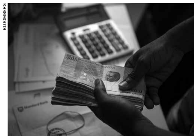
The Angolan Kwanza