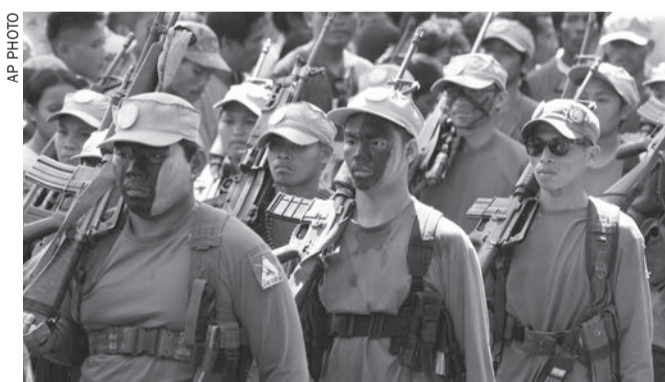
Members of the communist New Peoples Army have their faces painted to hide their identity during the celebration of the 42nd anniversary of the Communist Party of the Philippines at Mt. Diwata

"The CPP and the revolutionary forces welcome the possibility of joining presumptive President Duterte in an alliance government, whether in the form of assigning Cabinet