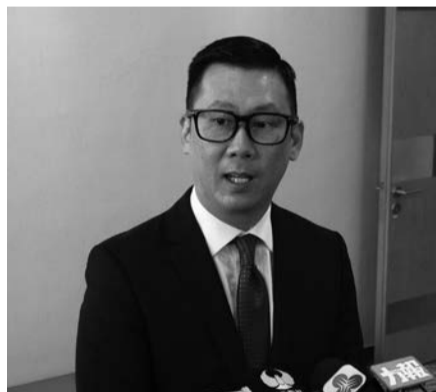
Paulo Martins Chan

Chan claimed that in 2016, the Macau government would be constantly working to optimize Macau's economic structure, and to promote cooperation with neighboring regions. He said that the government is seeking "to accelerate the promotion of regional cooperation in order to develop strong economic relationships and to create opportunities for tourism integration." Staff reporter