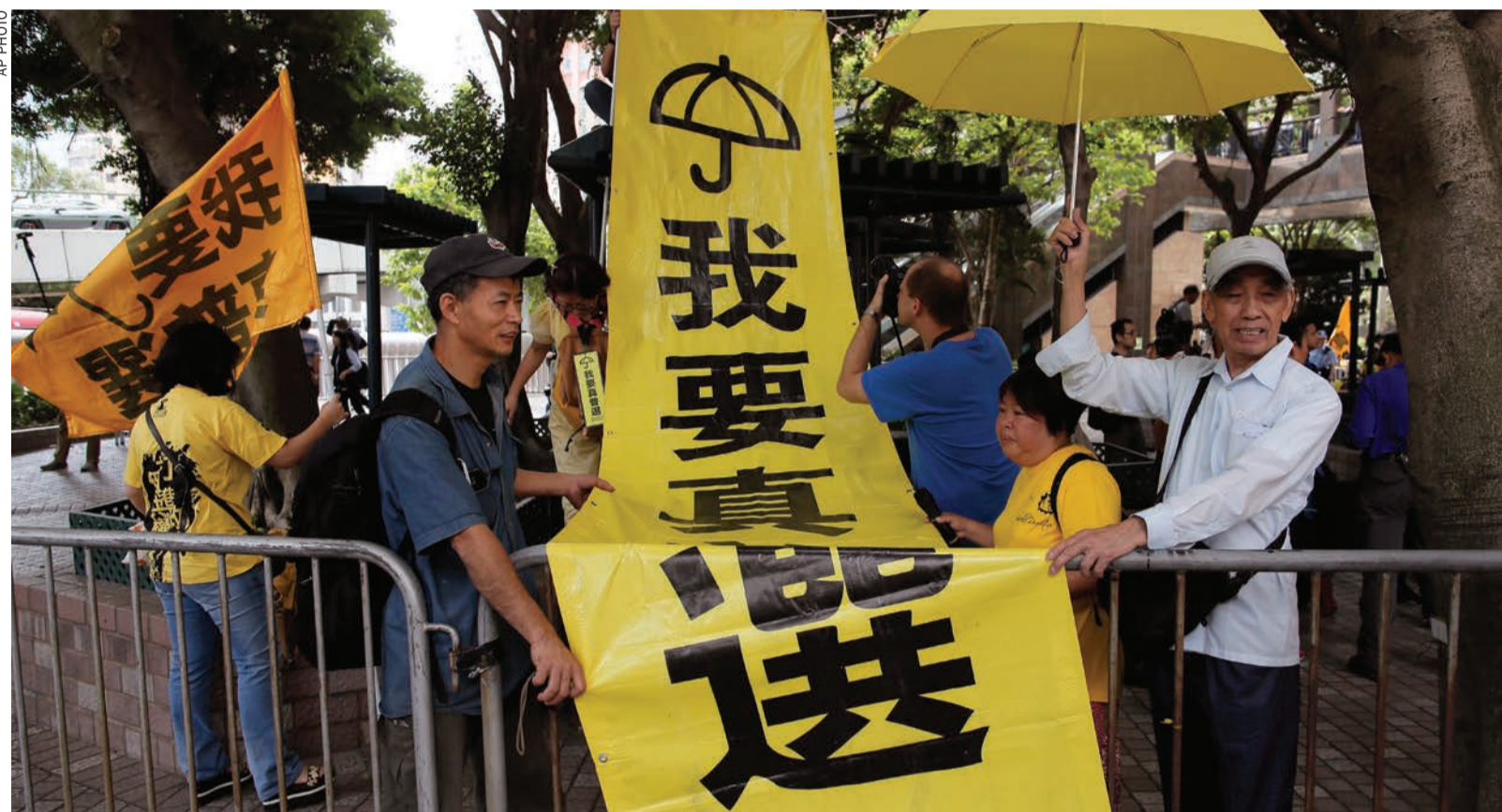
Pro-democracy activists raise a huge banner, which says "I want genuine universal suffrage" in Chinese words, outside the convention center where the Chinese Communist Party's third-highest ranking official, Zhang Dejiang, gave a speech during a visit to Hong Kong

In 2014, thousands of residents took to the streets to show their opposition to Beijing's decision to handpick candidates running for the city's top job of chief executive. Riot police clashed frequently with protesters at that time,