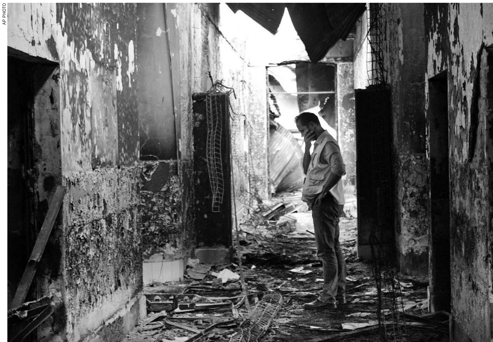
In this Oct. 16, 2015, file photo, an employee of Doctors Without Borders, MSF, walks inside the charred remains of the organization's hospital after it was hit by a U.S. airstrike in Kunduz