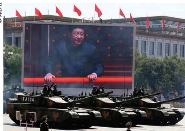
In this Thursday, Sept. 3, 2015 file photo, Chinese President Xi Jinping is displayed on a screen as Type 99A2 Chinese battle tanks take part in a parade commemorating the 70th anniversary of Japan's surrender during World War II held in front of Tiananmen Gate in Beijing

ded WZ-10 attack helicopters — China's most powerful — along with ZTD-05A amphibious assault vehicles, Type-96 main battle tanks and HJ-9 anti-tank missile launchers.