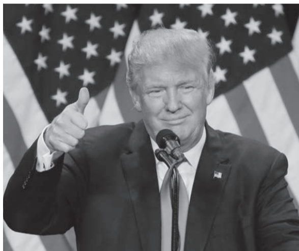
Republican presidential candidate Donald Trump

out of international aid-for-disarmament negotiations with the U.S. and other nations in 2008.