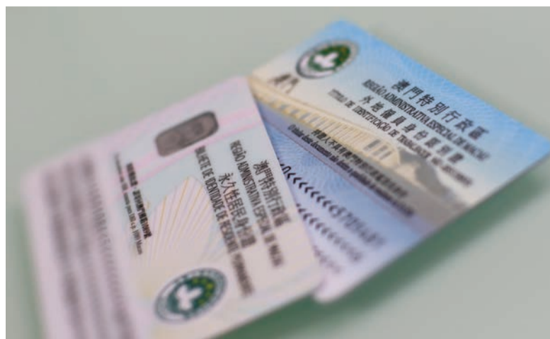
DSAL will assume the responsibility for dealing with applications for work permits, commonly know as "blue cards" (right) from May 28

The DSAL will continue to be headed by one director, who will be assisted by two deputy directors. The office will comprise six departments and twelve divisions.