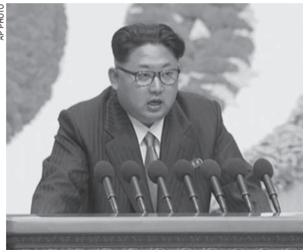
North Korean leader Kim Jong Un

It was unclear whether Trump was referring to bilateral talks between the U.S. and North Korea or a face-to-face meeting. But either would mark a significant departure from the current situation. There has been little dialogue between the U.S. and North Korea since Pyongyang pulled