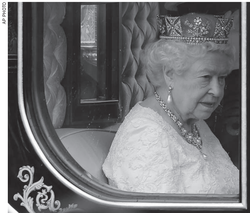
Britain's Queen Elizabeth II travels in a carriage from Buckingham Palace towards the Houses of Parliament in London

The annual State Opening of Parliament is steeped in centuries-old symbolism of the power struggle between Parliament and the British monarchy. In a display of regal wealth and finery, the queen traveled from Buckingham Palace in the horse-drawn Diamond Jubilee State Coach, and delivered the speech — written for her by the government — wearing the Imperial State Crown, studded