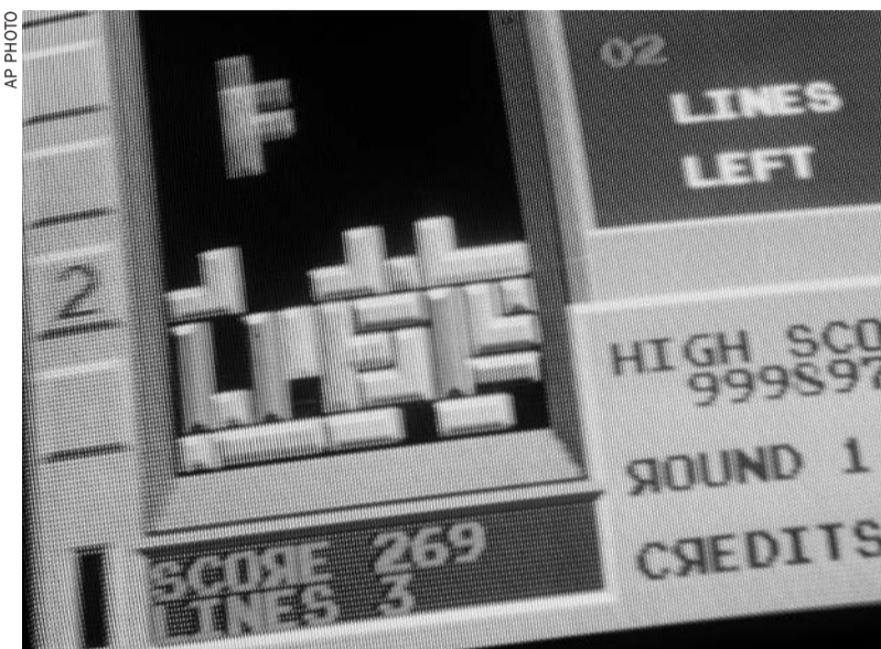
The puzzle video game Tetris at Barcade in the Brooklyn section of New York

The video game requires players to arrange and clear bricks that fall faster and faster into a rectangular matrix at the bottom of the screen before they run out of space. Tetris has survived the transition from desktop to console to smartphone better than most other popular video games from the 1980s, such as Pac-Man. Whether it will survive the transition to the