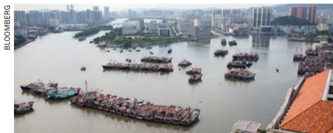
Fishing boats sit in the Inner Harbor

ice will be transferred to the DSAL. The Human Resources Offices' budget will now also be allocated to the DSAL.