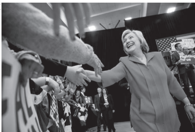
Democratic presidential candidate Hillary Clinton (center), arrives to speak at a 'get out the vote' event at Transylvania University in Lexington