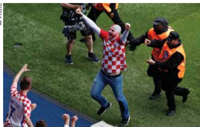
Stewards try to restrain a Croatian fan who entered the field to celebrate as Croatia's Luka Modric scored his side's first goal during the Euro 2016 Group D soccer match against Turkey

Euro 2016 already has a few of these to savor. Luka Modric's 25-meter volley is the pick so far, with his instinctive shot from a long clearance securing Croatia's 1-0 victory over Turkey. Dimitri Payet's late winner for France against Romania was not far behind, while Ireland's Wes Hoolahan scored with