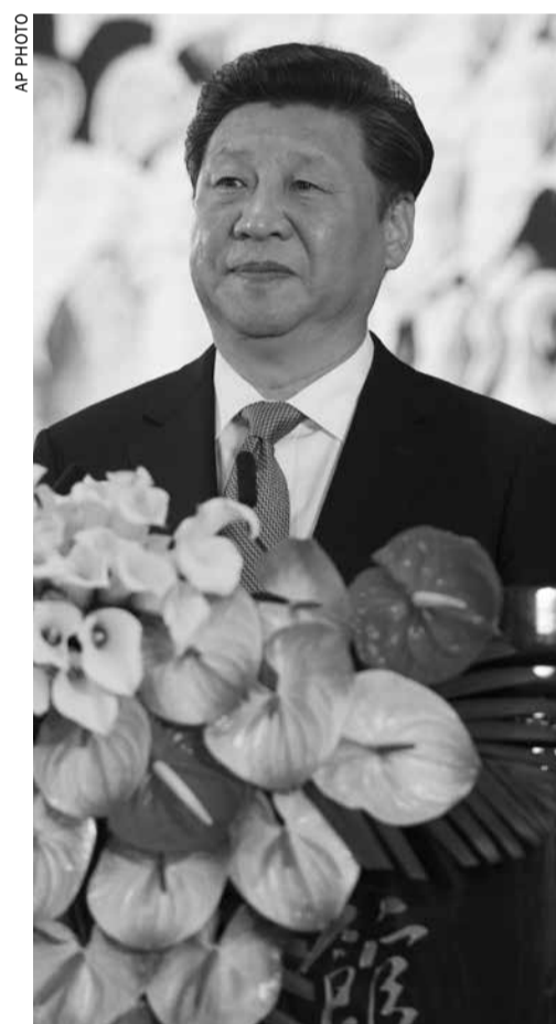
Chinese President Xi Jinping

That the Hague panel is headed by a former diplomat from China's old nemesis, Japan, makes it even more worthy of derision, Chinese critics say. In addition, within the context of what China perceives as a relentless U.S. campaign to contain its rise to prominence, Beijing officials see an American plot behind the case. "We don't understand why the U.S. has been so active in backing the arbitration behind the scene," said Liu, the vice foreign minister. "As time goes by, I believe the plot will eventually come to light."