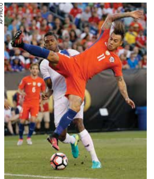
Chile's Eduardo Vargas (right) falls after battling with Panama's Roderick Miller for the ball during the first half of a Copa America Group D soccer match

Defending Copa America champion Chile had several other scoring chances, including an Arturo Vidal header saved by Panama goalkeeper Jaime Penedo in the first half. AP