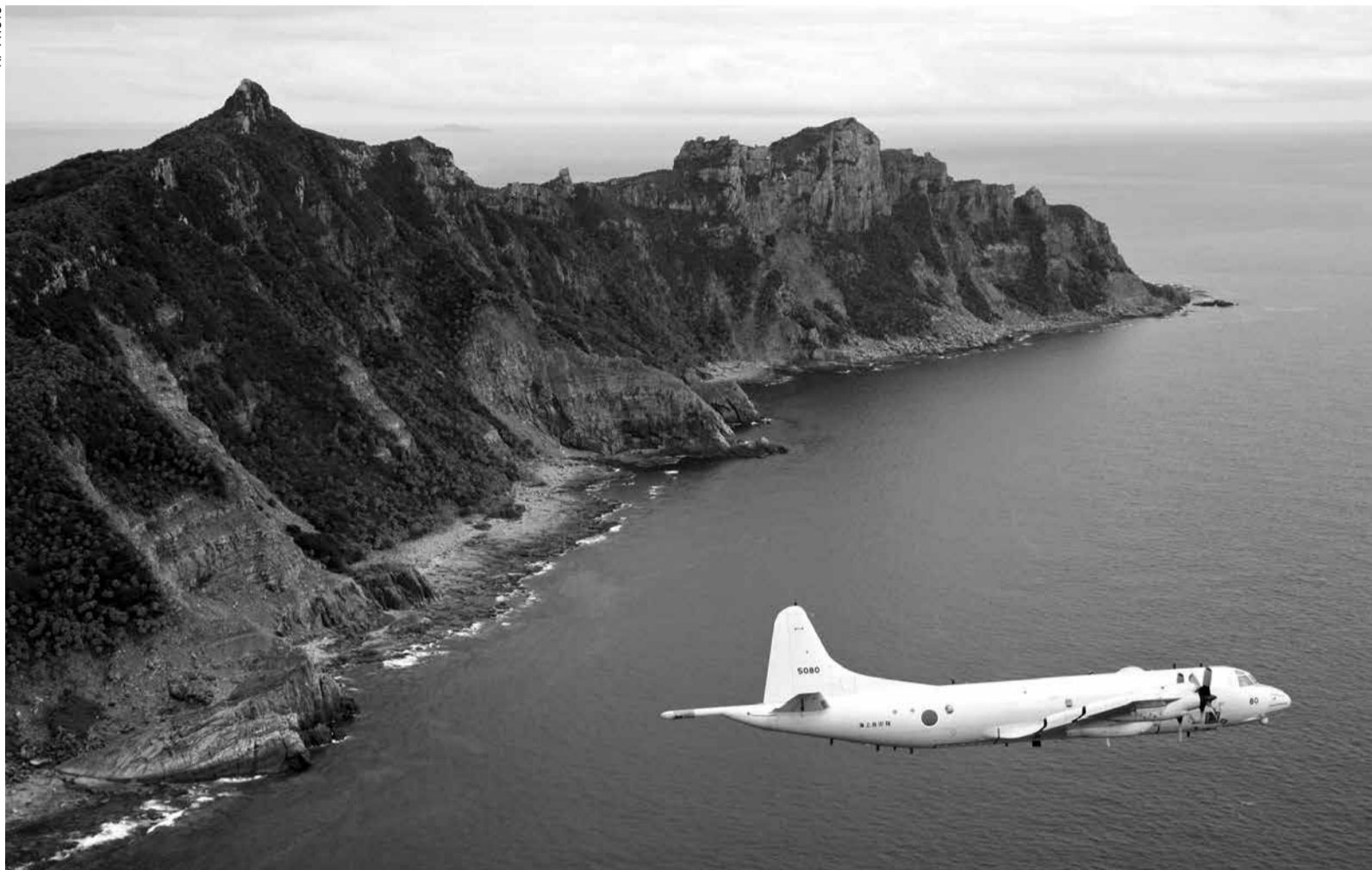
Japan Maritime Self-Defense Force P-3C Orion surveillance plane flies over the disputed islands, called the Senkaku in Japan and Diaoyu in China, in the East China Sea

and "it is rational and legal for Chinese warships to sail in waters under [Chinese] juris-