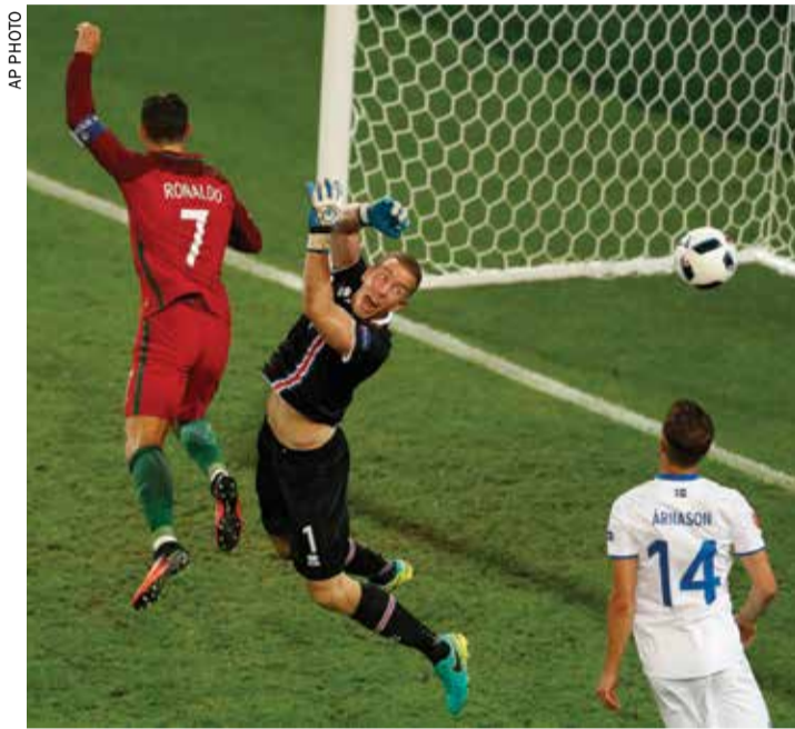
Portugal's Cristiano Ronaldo (left) jumps for a ball with Iceland goalkeeper Hannes Halldorsson during the Euro 2016 Group F soccer match between Portugal and Iceland at the Geoffroy Guichard stadium in Saint-Etienne

Even his trademark free kicks came to nothing on a