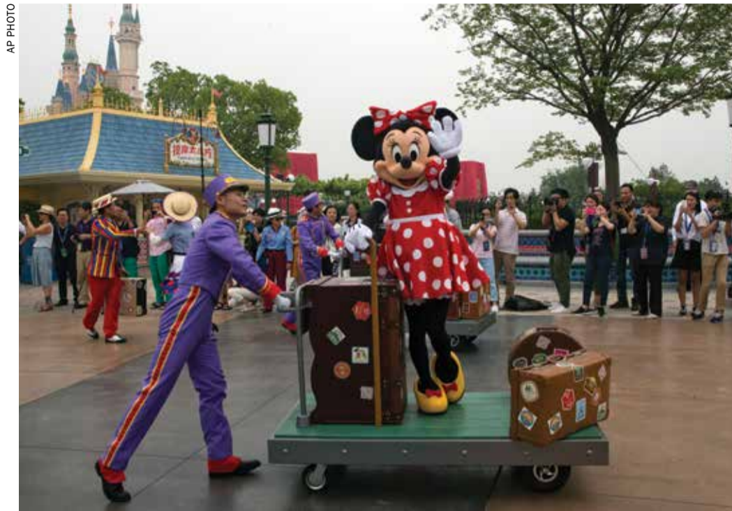
Minnie Mouse takes part in a parade on the eve of the opening of the Disney Resorts in Shanghai

One of the borrowers told the newspaper that she first borrowed 500 yuan from an on-line loan provider with a weekly interest rate of 30 percent. She kept taking out new loans to pay off old ones, and her debt snowballed to 55,000 yuan when the lender demanded a nude photo of her as a guarantee for new loans.