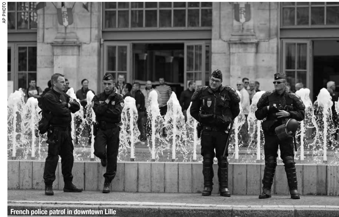
French police patrol in downtown Lille