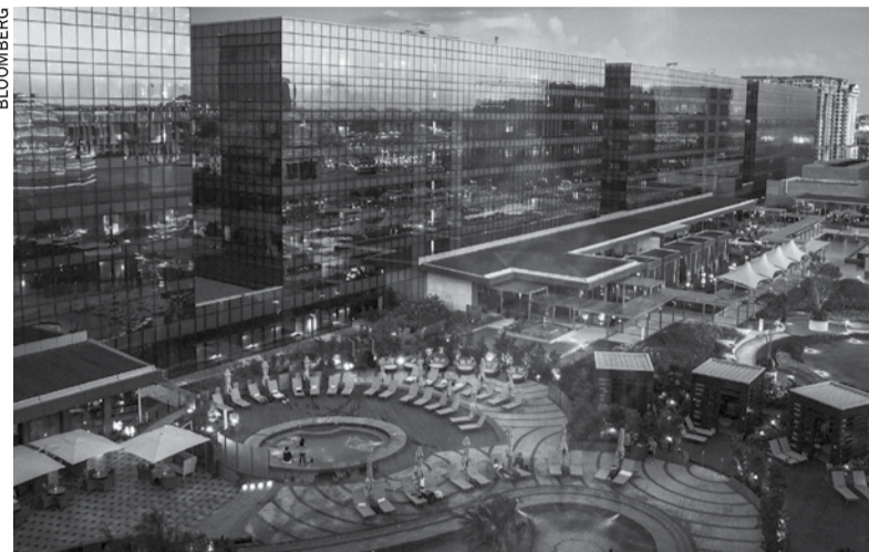
Gardens and swimming pools are seen from one of the rooms in the Crown Towers at the City of Dreams Manila casino resort

"This new corporate structure, well positions Crown for the next decade as we continue to grow our business and meet the needs of the emerging Asian middle class," Packer said in a separate e-mail statement. The billionai-