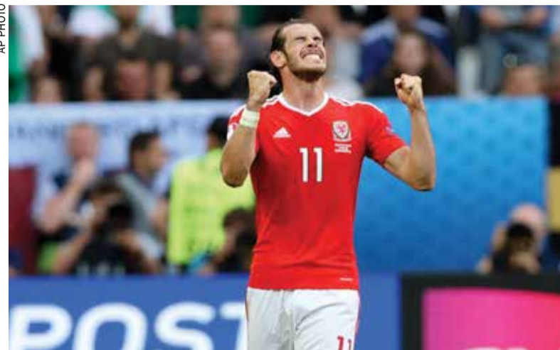
Wales's Gareth Bale celebrates at the end of the Euro 2016 Group B soccer match between Wales and Slovakia, at the Nouveau stadium in Bordeaux

"We know that Wales don't like us," Wilshere said. "Do we like