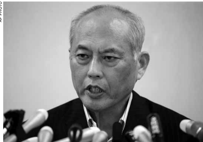
Tokyo Gov. Yoichi Masuzoe

He initially balked at the high cost of the games, and successfully lobbied to have some events moved to existing facilities instead of bui-