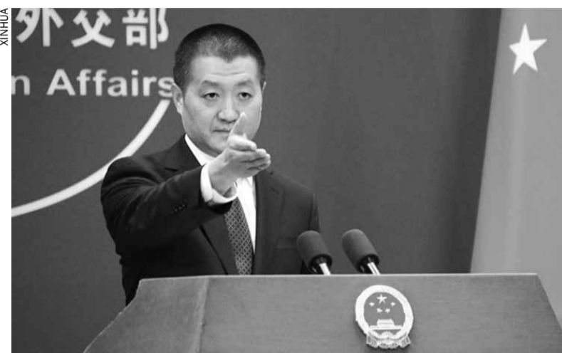
Chinese Foreign Ministry spokesperson Lu Kang

While the original statement made no direct accusations against China, it referred to sensitivity over land reclamation in a nod to China's creation of man-made islands and the building of airstrips and other infrastructure. The moves are widely seen as an effort to strengthen China's claims to virtually the entire South China Sea by changing its actual geography and boosting