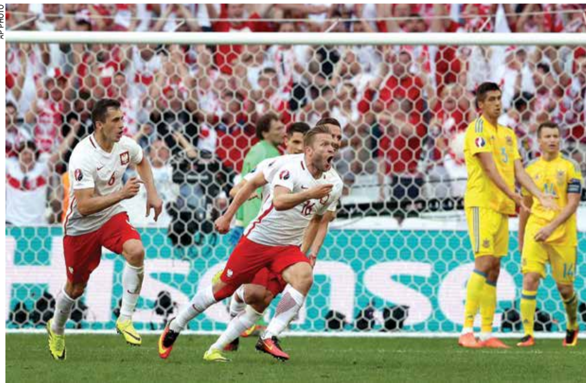
Poland's Jakub Blaszczykowski (front) celebrates after scoring the opening goal during the Euro 2016 Group C soccer match against Ukraine at the Velodrome stadium in Marseille

five teams whose place in the knockout rounds was sealed by 1-0 wins for Germany and Poland in Group C, over Northern Ireland and already eliminated Ukraine, respectively.