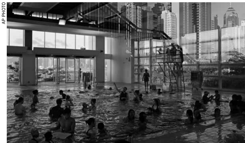
People swim yesterday in a pool in Hong Kong

Rocquemont attributes the significant change in ranking to fluctuations in exchange rates this year. The U.S. dollar strengthened against a weakened Angolan Kwana, contributing to