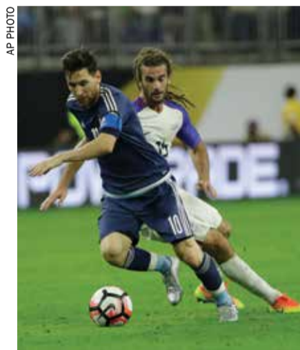
Argentina midfielder Lionel Messi gets the ball past United States midfielder Kyle Beckerman during a Copa America Centenario semifinal soccer match, in Houston

Argentina will seek its first major title since the 1993 Copa — and its first since Messi's debut in 2005 — when it plays Chile or Colombia