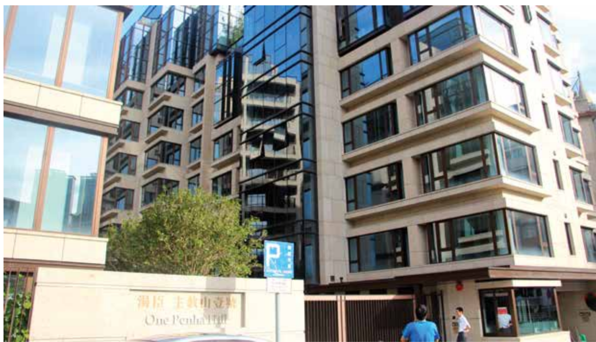
Developments like “One Penha Hill” (pictured) seem to be ready to lodge new owners

“Oscar Crescent” is expected to generate “tremendous revenue” once several developments and facilities that are currently under construction are finished. This claim was supported by the fact that the upcoming Hong Kong-Zhuhai-Macau Bridge, Macau Light Rail Transit (LRT), and the development of new hotels in Cotai, according with the same promoter figures, will bring around 45,000 new people to live in that area.