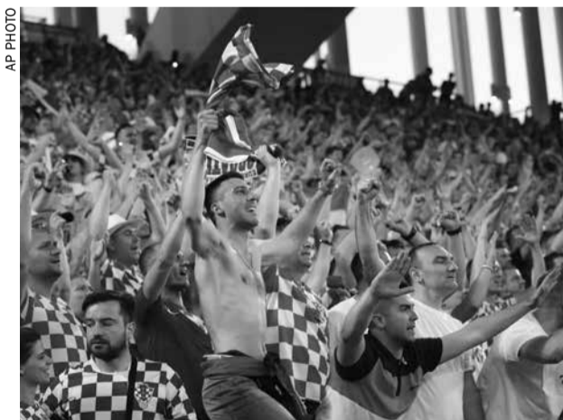
Fans celebrate during a Euro 2016 match

T HE Euro 2016 football tournament is contributing to a further slowing of Macau's gross gaming revenue (GGR), according to Japanese brokerage Nomura.