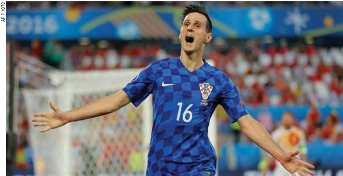
Croatia's Nikola Kalinic celebrates after scoring his side's first goal during the Euro 2016 Group D soccer match against Spain at the Nouveau Stade in Bordeaux

"It's not the best path for us, but you never know where the danger will be," Spain coach Vicente Del Bosque said. "We wanted to advance in first place but we are prepared to overcome this."