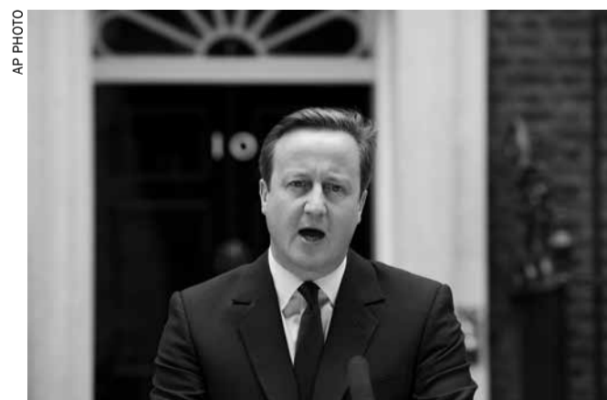
British Prime Minister David Cameron makes a statement appealing for people to vote to remain in the European Union outside 10 Downing Street in London

Much of the debate has hinged on the economy. From the international banks in the skyscrapers of Canary Wharf to the traditional home of Britain's financial industry in the City of London, business has largely awaited the referendum with trepidation and cau-