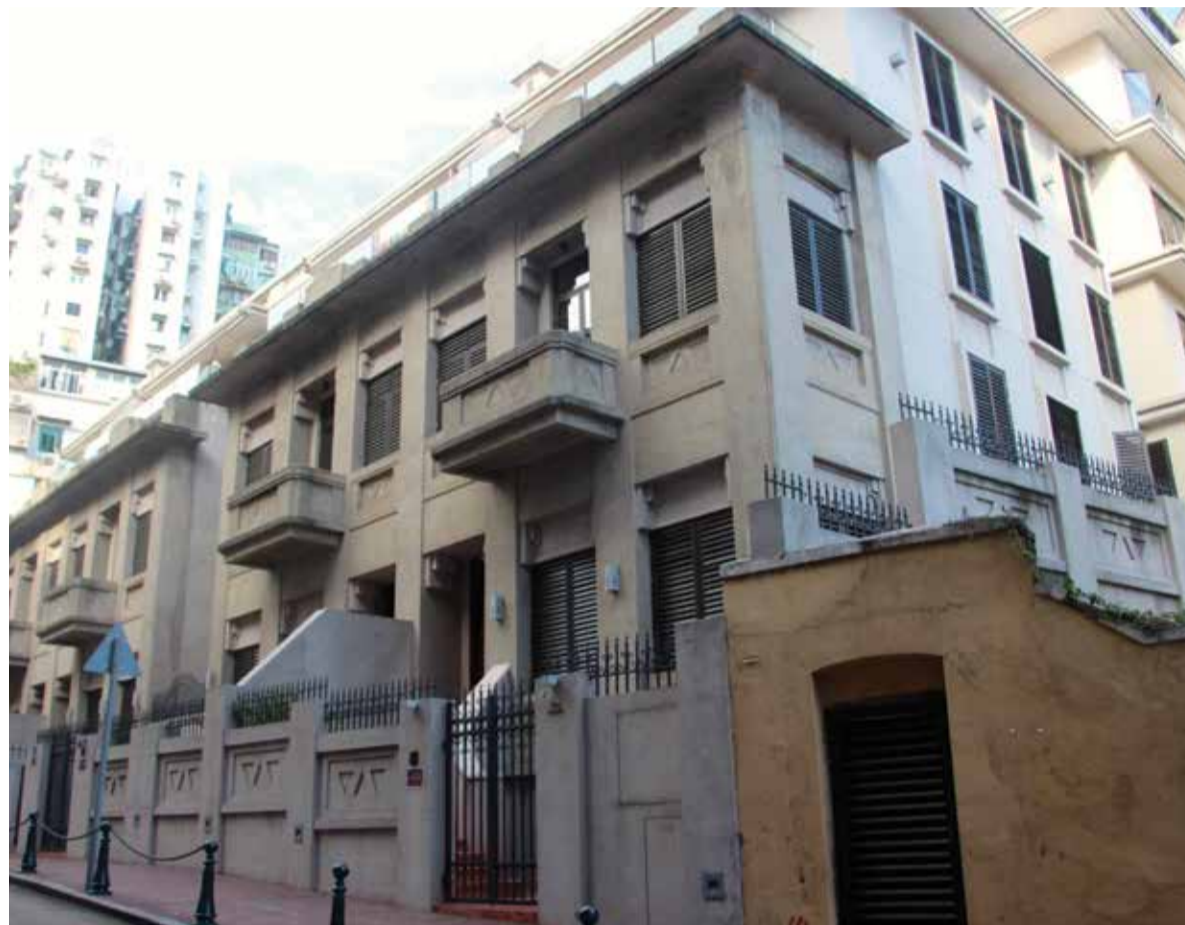
“The Fountainside” is located close to the Lilau Square and Mandarin House

According to Wong, some of the factors that come into play in Macau are the stabilization of the number of overseas workers, as well as a change