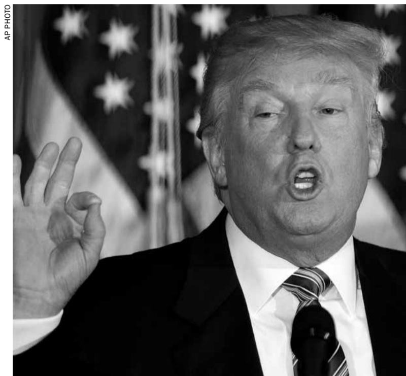
AP PHOTO Republican presidential candidate Donald Trump

"What's worse for the Republican Party — this is the calculation — one week of absolute chaos and all sorts of recriminations or four and a half months of this looming, rolling catastrophe?" conservative Milwaukee radio host Charlie Sykes said on his Tuesday show. Some delegates are appalled