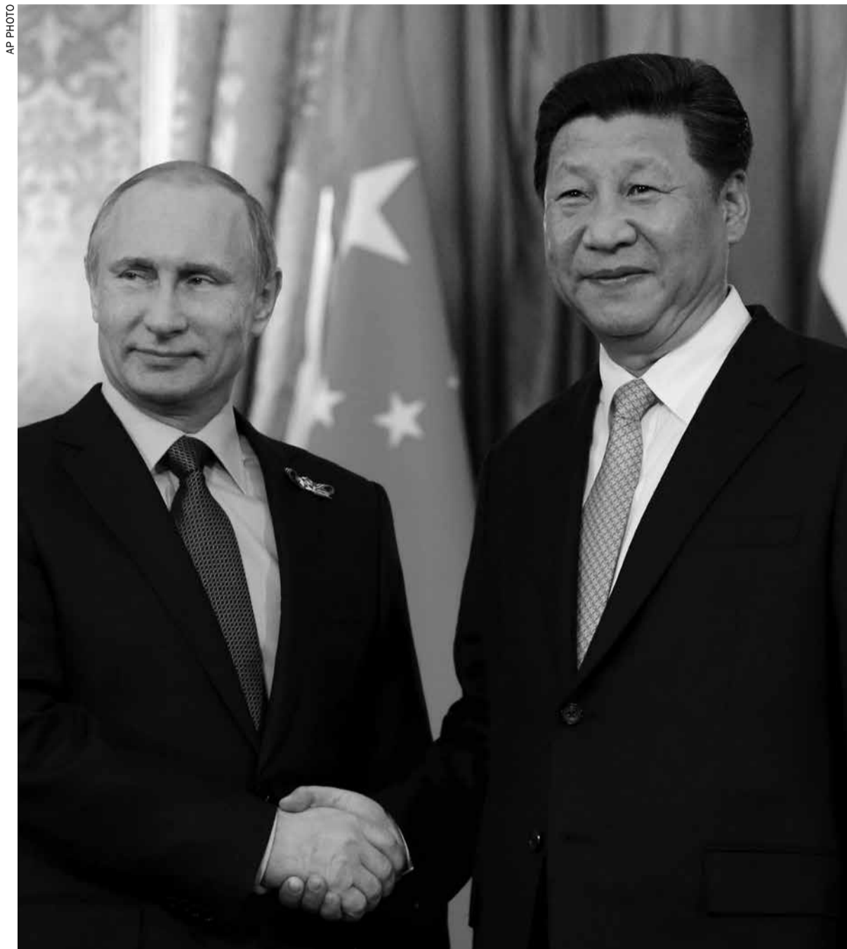
In this Friday, May 8, 2015 file photo Russian President Vladimir Putin (left) shakes hands with his Chinese counterpart Xi Jinping during their meeting in the Kremlin in Moscow

A key factor behind Russia-China trade dropping from nearly $100 billion a year in 2014 to just over $60 billion