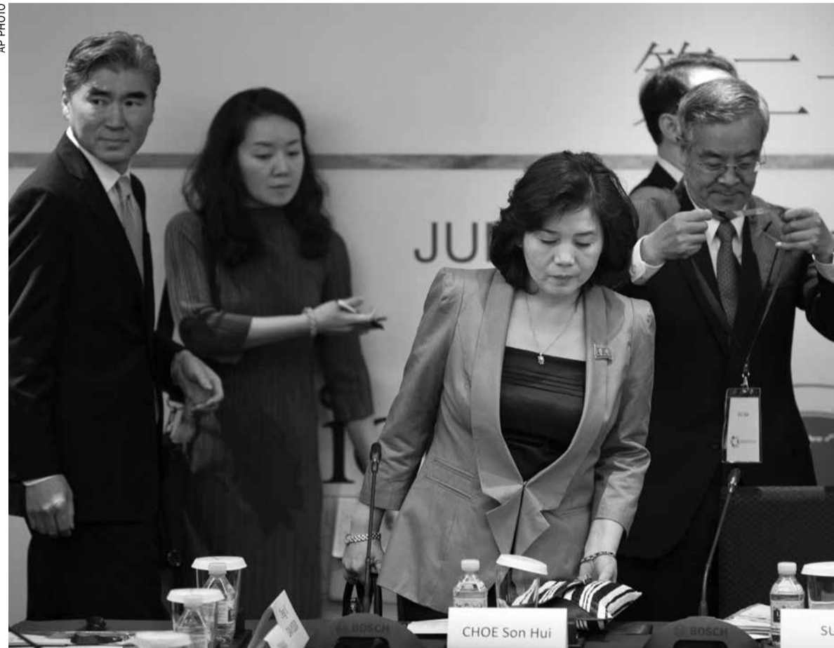
Choe Son Hui (third from left) deputy director general of the Department of US Affairs of North Korea Foreign Ministry, prepares to sit as Sung Kim, special representative for North Korean Policy of the U.S. Department of State (left) arrives to attend the 26th Northeast Asia Cooperation Dialogue in Beijing

The U.S. and its partners want Pyongyang to recommit