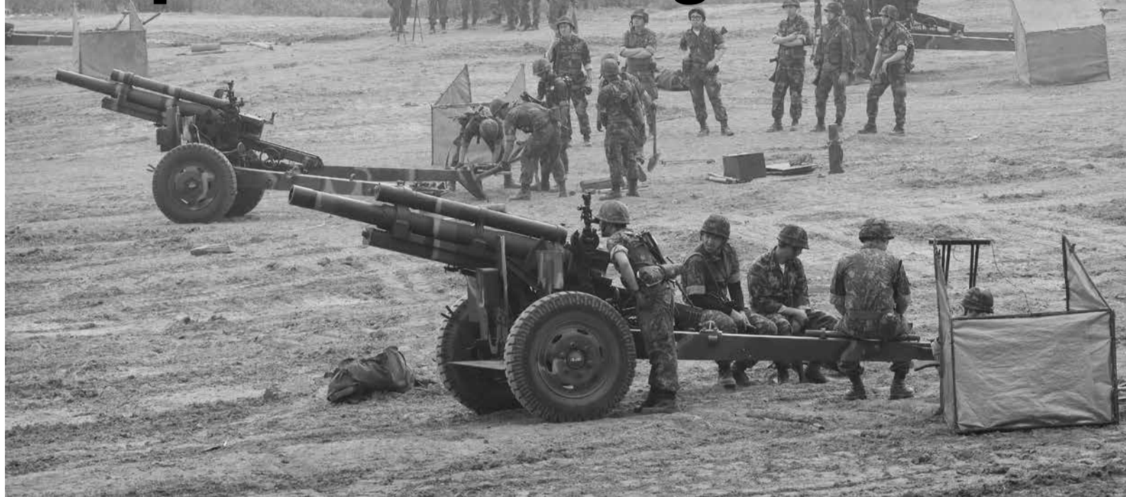
South Korean army soldiers prepare to fire 105mm howitzers during an exercise in Paju