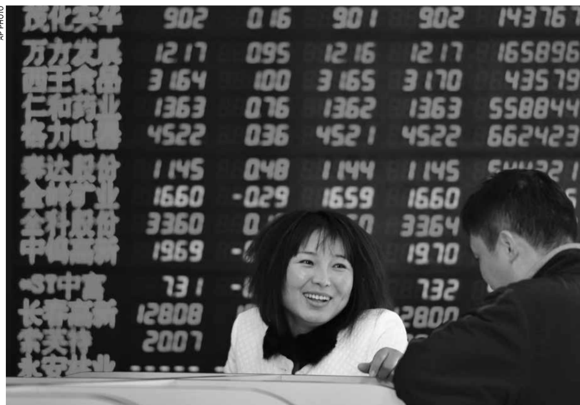
A woman smiles as she chats at a brokerage house in Fuyang in central China's Anhui province

"Investors tend to be more positive regarding the U.K. referendum now, which is contributing to the advance in