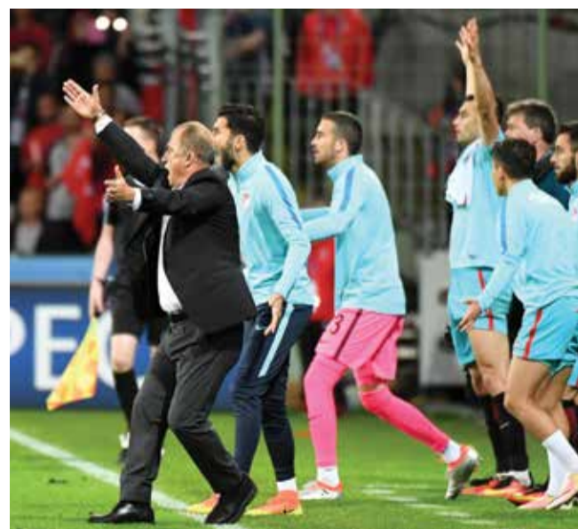
Turkey coach Fatih Terim (left) celebrates after the final whistle when his team won 2-0 in the Euro 2016 Group D soccer match against the Czech Republic at the Bollaert stadium in Lens

Spain has six points, Turkey has three and the Czechs are eliminated