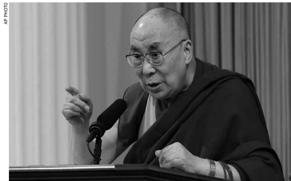
The Dalai Lama

The self-effacing Nobel Peace Prize laureate wore an honorary medal on a thick chain and a white university visor during the talk punctuated by his hearty chuckles.