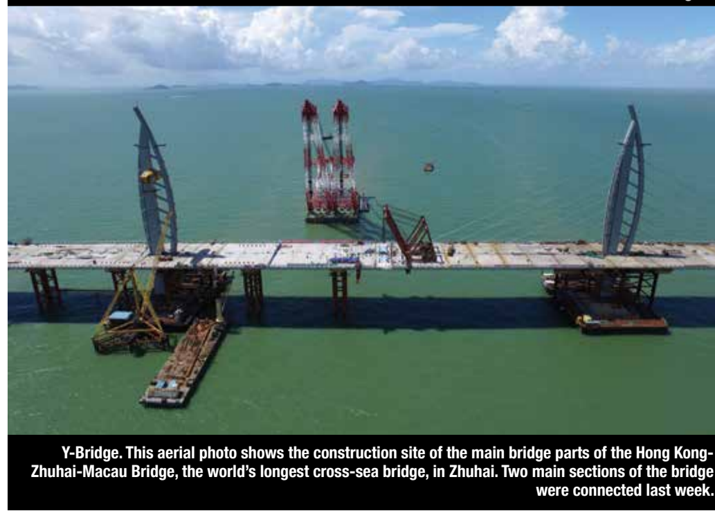
Y-Bridge. This aerial photo shows the construction site of the main bridge parts of the Hong Kong-Zhuhai-Macau Bridge, the world's longest cross-sea bridge, in Zhuhai. Two main sections of the bridge were connected last week.