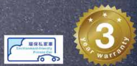
Photo shown here may be different from Macau specifications

新康恒集團有限公司屬下日產澳門總代理 新康誠汽車有限公司 XIN KANG CHENG MOTORS LTD