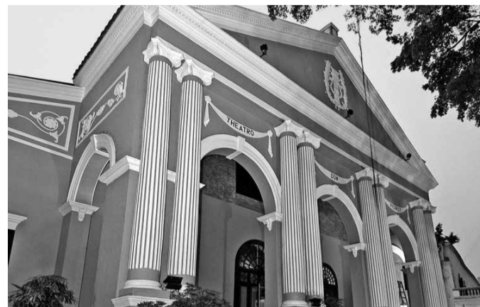
Dom Pedro V Theatre