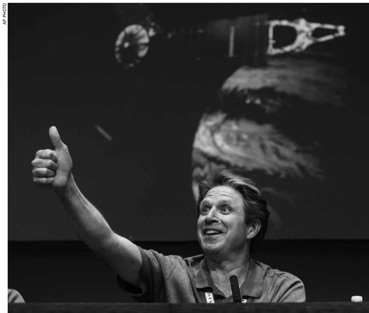
Scott Bolton speaks in a post-orbit insertion briefing at NASA's Jet Propulsion Laboratory following the solar-powered Juno spacecraft entered orbit around Jupiter

The spacecraft's camera and other instruments were switched off for arrival, so there weren't any pictures at that key moment. Scientists have promised close-up views of the planet when Juno skims the cloud tops during the 20-month,