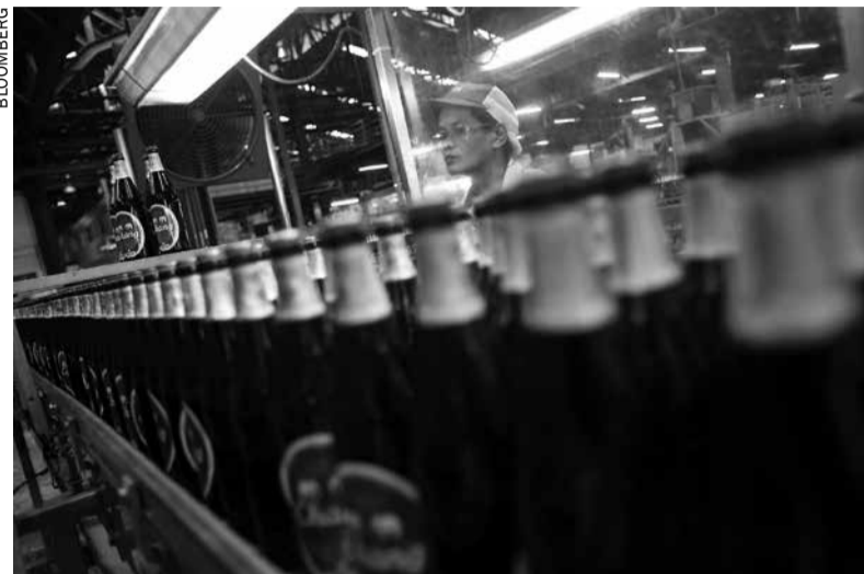
A worker checks bottles of Chang beer on the production line at the Beer Thip factory, a factory of the Thai Beverage Pcl group

with growth of 1 percent to 3 percent for Singapore, whose economy is among the most vulnerable in Asia to swings in global demand. More than 90 percent of Thai Beverage's revenue came from Thailand in 2015, data by Bloomberg show.