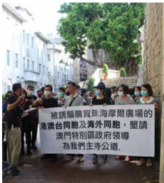
The petitioners display a banner close to the government headquarters