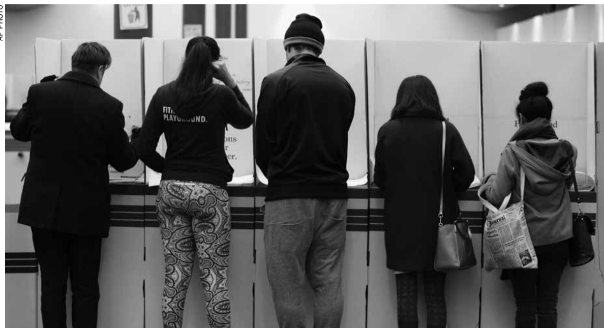
Voters fill in their ballots at a polling station at Town Hall in Sydney

with a ballot paper and pencil, Australia is a special case because compulsory voting led to extraordinarily large voter turnouts. Plus Australian politics had become more volatile, with bigger swings and more alternative candidates to the major parties, Glance said.