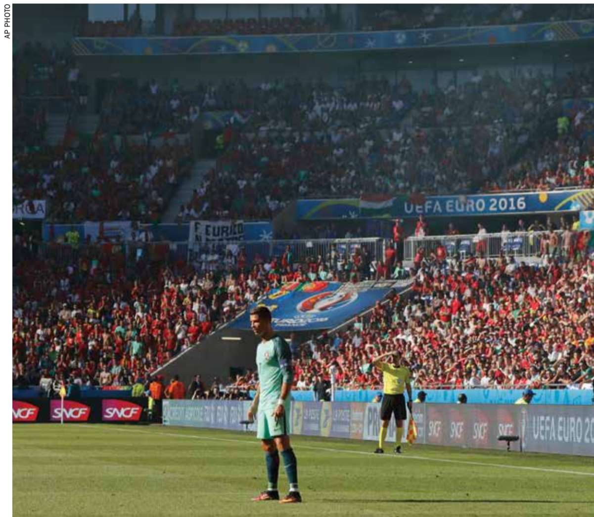
Portugal's Cristiano Ronaldo stands on the pitch during the Euro 2016 Group F soccer match

"We are going to take on an excellent opponent, which has more victories and scored more goals than we have, but we believe we are going to win."