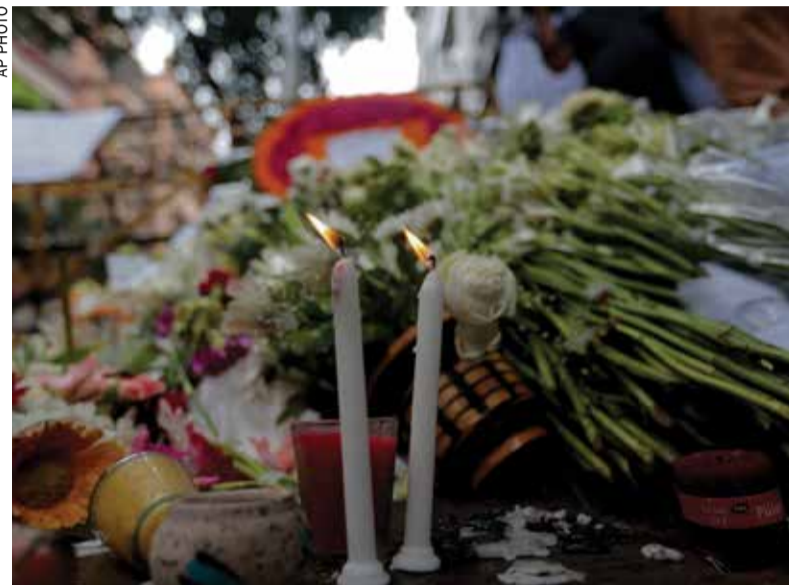
People offer flowers and light candles to pay their respects to the victims of the attack on Holey Artisan Bakery