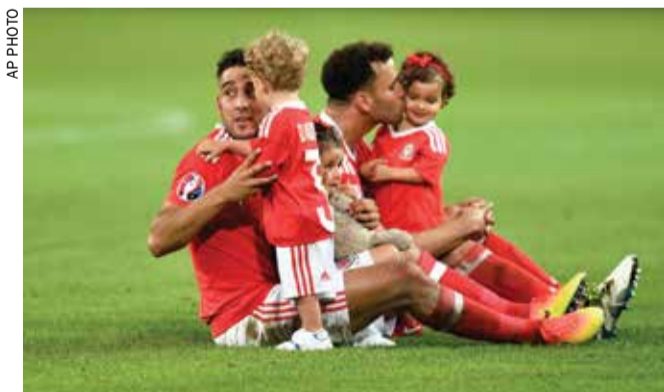
Wales' James Chester (left) and Wales' Hal Robson Kanu play with their children on the pitch at the end of the Euro 2016 quarterfinal soccer match

Nor has it been all gloom on the pitch. Nani and Quaresma have picked up some of the scoring slack for Ronaldo, 18-year-old Renato Sanches is one of the tournament's sensations, and Pepe has played masterfully in defense.