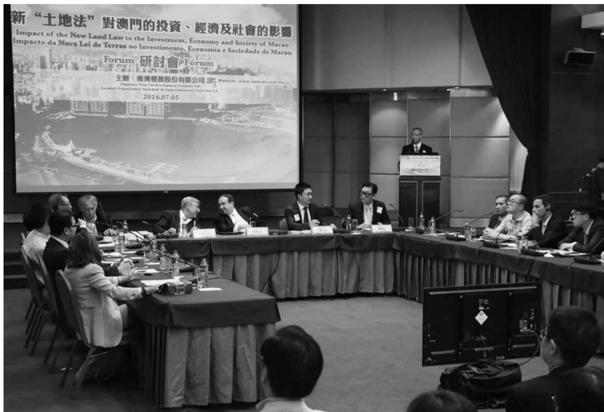
Aspect of yesterday's event