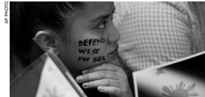
A protester has her cheek painted with a slogan outside the Chinese Consulate

T HE Philippines' new president says Manila is ready to talk to China, not go to war, if an arbitration tribunal rules in its favor in a case it brought against Beijing's claims in the South China Sea.