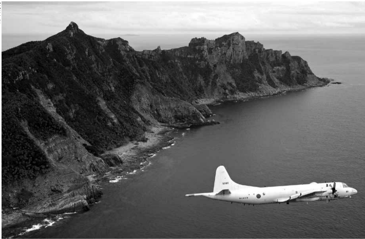
Japan Maritime Self-Defense Force P-3C Orion surveillance plane flies over the disputed islands, called the Senkaku in Japan and Diaoyu in China

in the Chinese defense ministry announcement," he said. "There is no evidence whatsoever that fire-control radar was locked on."