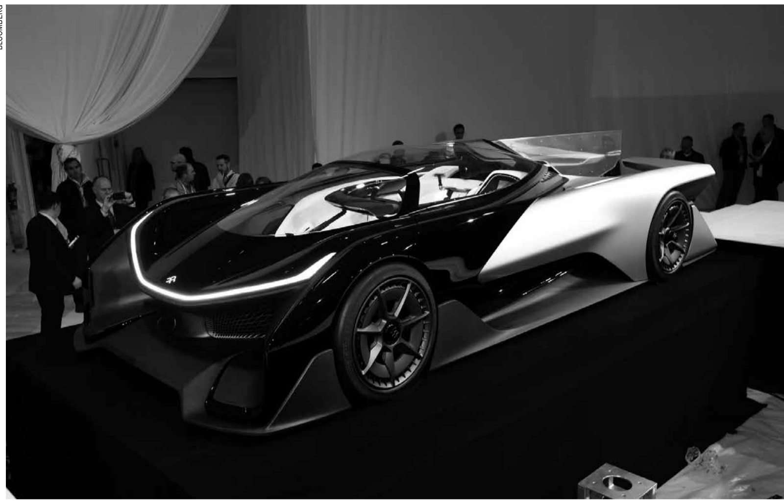
Faraday Future Inc. FFZero1 concept vehicle

Faraday, whose 1,000-horsepower concept car has drawn comparisons to the Batmobile, says it has the full support of Ne-