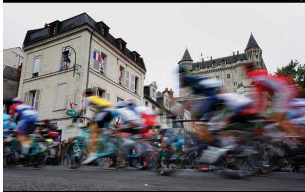
Le tour. The pack rides during the fourth stage of the Tour de France cycling race over 237.5 kilometers with start in Saumur and finish in Limoges, yesterday [Macau time].