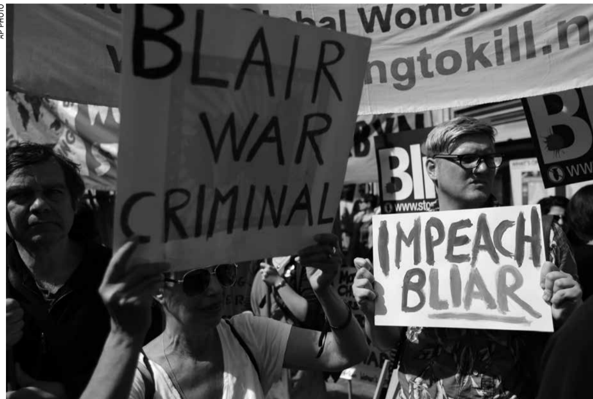
Protesters hold placards outside the Queen Elizabeth II Conference Centre in London, shortly before the publication of the Chilcot report into the Iraq war

He said that Blair "destroyed our country" and should be prosecuted as a war criminal.