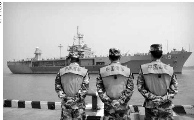
In this May 6, 2016, file photo, soldiers from the Chinese People's Liberation Army (PLA) Navy watch as the USS Blue Ridge arrives at a port in Shanghai

T HE flagship newspaper of China's ruling Communist Party yesterday warned Washington that there would be a "price" to pay if it crosses China's "bottom line" by meddling in disputes over the South China Sea.