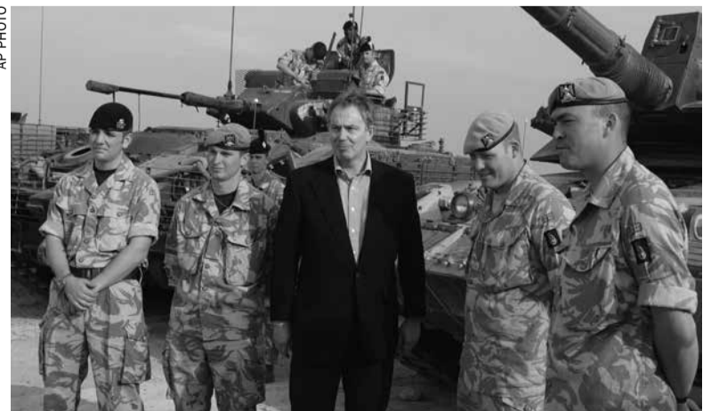
Britain's then-Prime Minister Tony Blair meets soldiers at Shaibah logistics base, Basra, Iraq

Chilcot criticized spy chiefs who failed to ensure their partial intelligence about Saddam's weapons was not hardened into certainty by government spin. He said they also failed to consider "that Iraq might no longer have chemical biological or nuclear weapons" — which turned out to be the case.