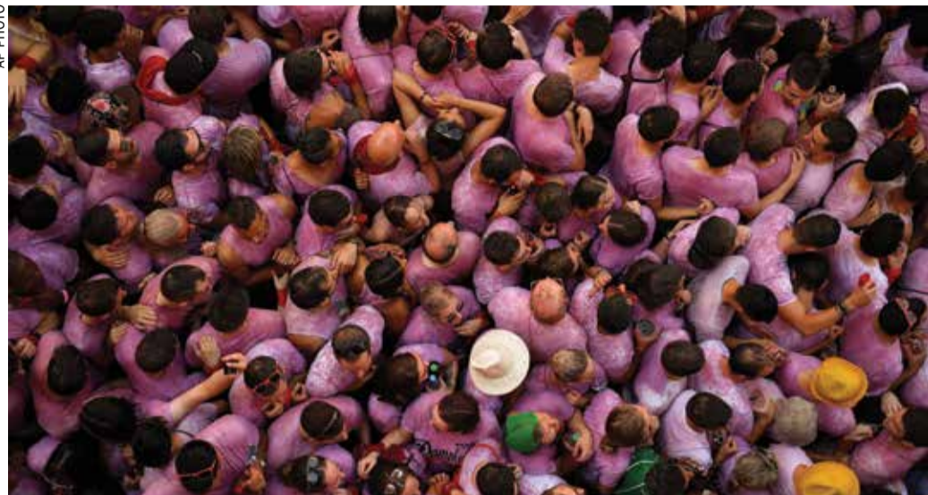
People gather during the launch of the 'Chupinazo' rocket, to celebrate the official opening of the 2016 San Fermin Fiestas, in Pamplona

RAMADAN As Muslims around the world celebrate the end of Ramadan, many are struggling to comprehend a wave of attacks that killed 350 people across several continents during the holy month and made urgent the question of what drives the militants to ever more spectacular violence against civilians. The diverse, high-profile targets underline the warnings of many experts: the Islamic State group, especially when on the defensive at home, will metastasize far beyond its theater of operations.