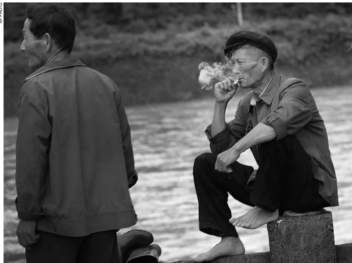
North Korean men sit and smoke by a river in the North Pyongan Province

North Korea has toyed with the idea of pushing harder to get smokers to kick the habit before — Ri's humble anti-smoking center has been arou-