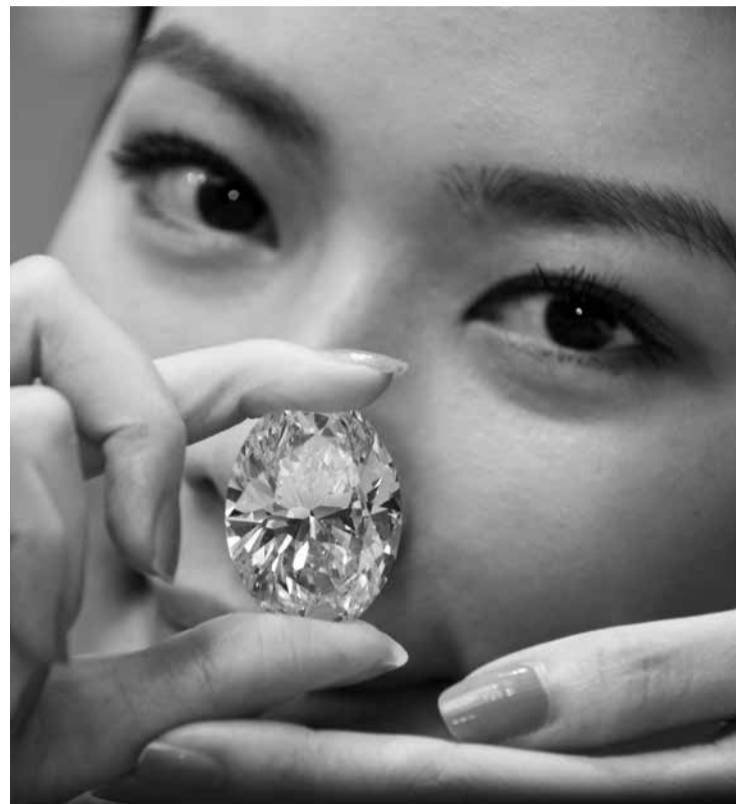
Diamonds are forever