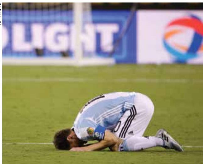
Argentina’s Lionel Messi