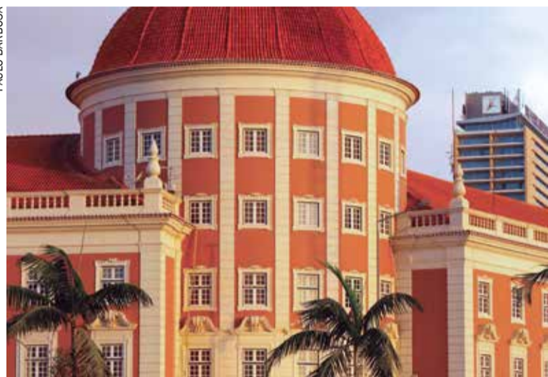
National Bank of Angola headquarters

The Monetary Policy Committee of the Angolan central bank said in the statement that the increase in the key interest rates of the National Bank of Angola is intended to encourage savings, and called on financial system operators to find innovative and attractive solutions to promote savings by economic agents in general and by families in par-