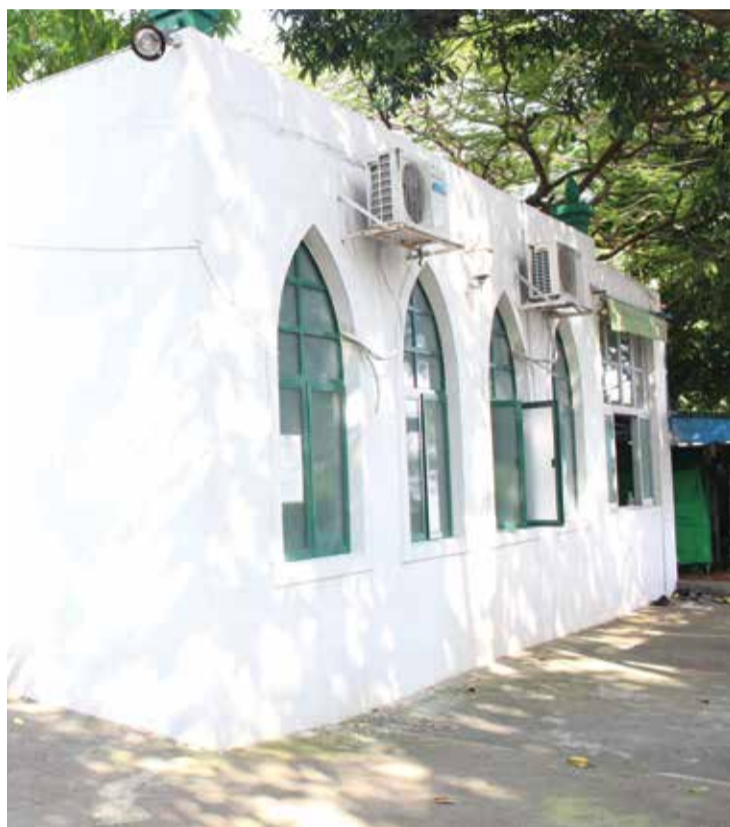
The prayer house of the Macau Mosque