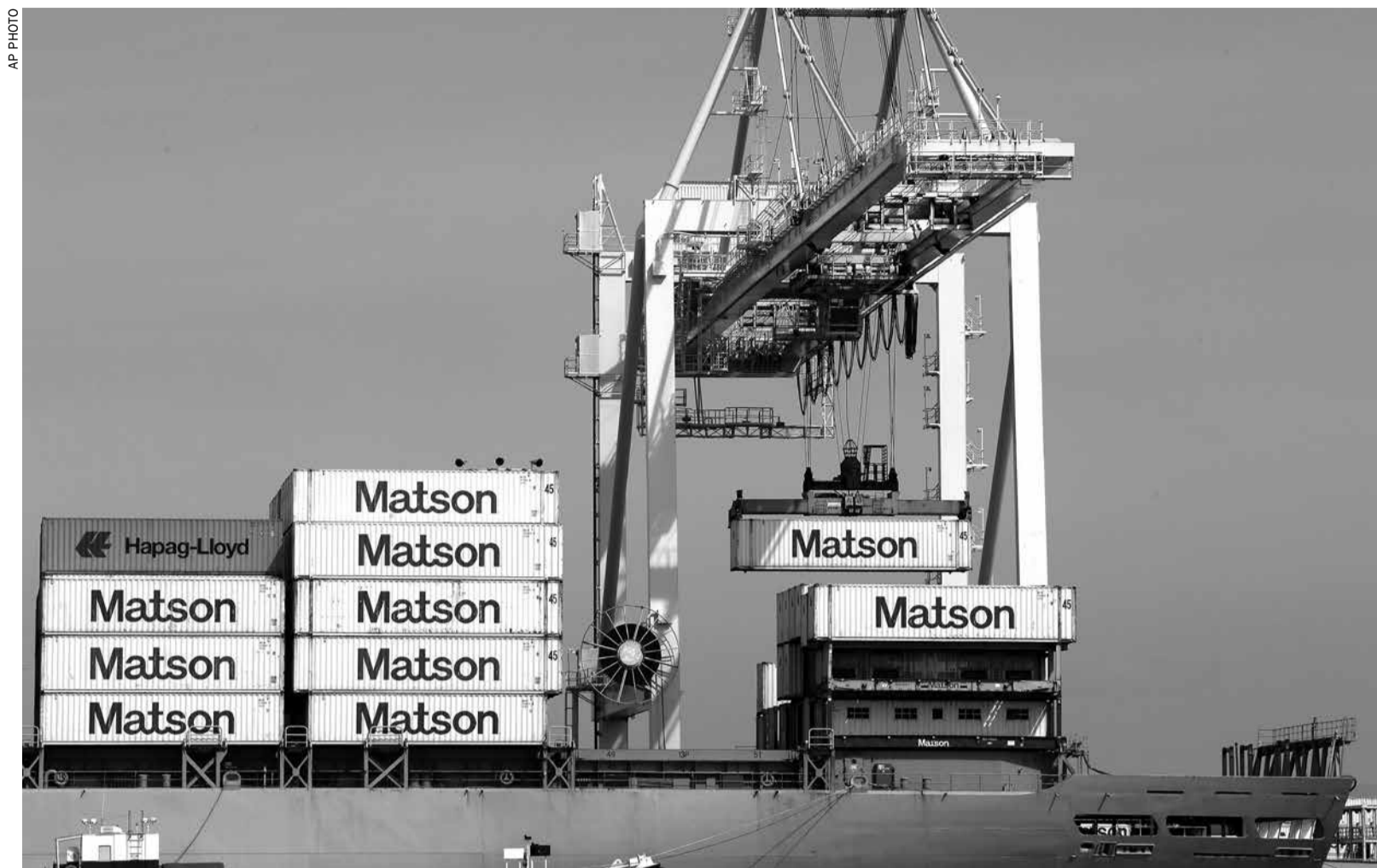
Shipping containers are unloaded at the Port of Oakland in Oakland, Calif.

Trump has sought to tap into the economic anxiety of Americans who have seen jobs disappear in an increasingly global economy. In a recent trade speech, Trump said he would exit from the North American Free Trade Agreement with Canada and Mexico if it was not renegotiated, kill the pending Trans-Pacific Partnership trade agreement and take a more aggressive approach to