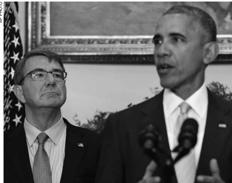
Defense Secretary Ash Carter listens (left) as President Barack Obama makes a statement on Afghanistan from the Roosevelt Room of the White House in Washington

The White House says Obama will arrive with words of reassurance that the departure — whenever it occurs — won't disrupt the decades-old trans-Atlantic ties that bind. He'll emphasize that Britain's exit, which does not affect its membership in NATO, only makes the 28-member military alliance more essential and its cooperation with the European Union more important. And amid leaders' anxiety about whether his possible successor, Republican Donald Trump, would retrench from Europe, Obama will make the case for stronger alliances