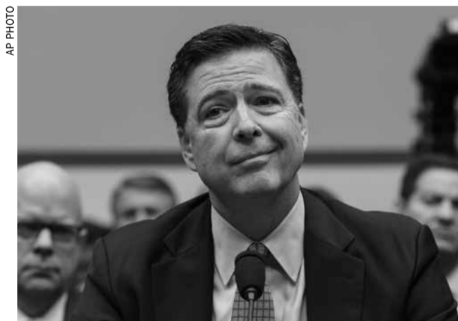
FBI Director James Comey testifies on Capitol Hill in Washington

Committee chairman, Rep. Jason Chaffetz, R-Utah, told Comy that