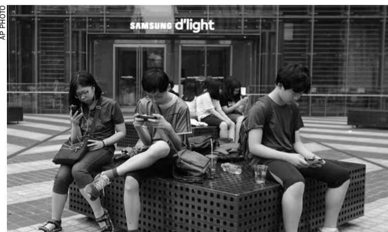
Middle school students use their smartphones in front of Samsung Electronics showroom in Seoul

The most important drive behind its forecast-beating earnings was smartphones. In recent weeks, analysts revised up their forecasts on Samsung Electronics saying that Samsung's mobile business performed better