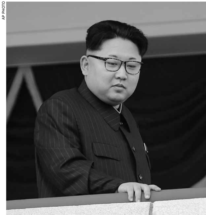
North Korea's leader Kim Jong Un

This action coincides with the release of a State Department report, mandated by Congress, on human rights abuses in North Korea. Administration officials said it was intended