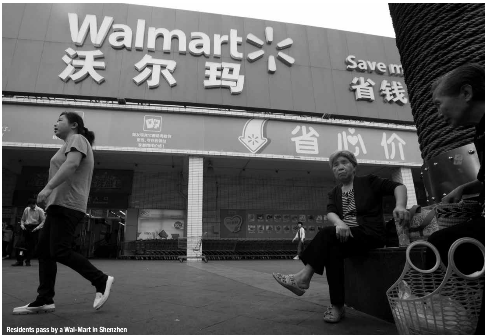
Residents pass by a Wal-Mart in Shenzhen