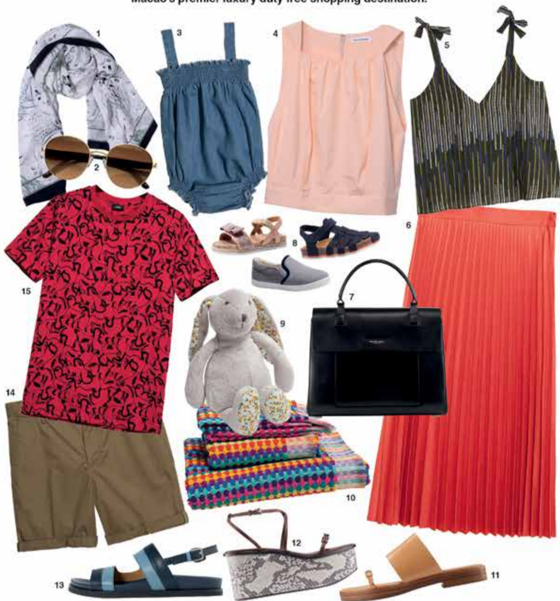
1. Club Monaco Scarf 2. Michael Kors Sunglasses 3. Zara Home Children's playsuit 4. Club Monaco Top 5. H&M Top 6. Zara Skirt 7. Michael Kors Handbag 8. Zara Home Children's shoes 9. Zara Home Children's toy 10. Zara Home Towels 11. Michael Kors Sandals 12. Michael Kors Platform sandals 13. H&M Sandals 14. H&M Shorts 15. H&M T shirt

The summer sales have landed, offering savvy spenders spectacular savings on the hottest high street fashion and discounts from designer brands, all at Sands Shoppes, Macao's premier luxury duty free shopping destination.