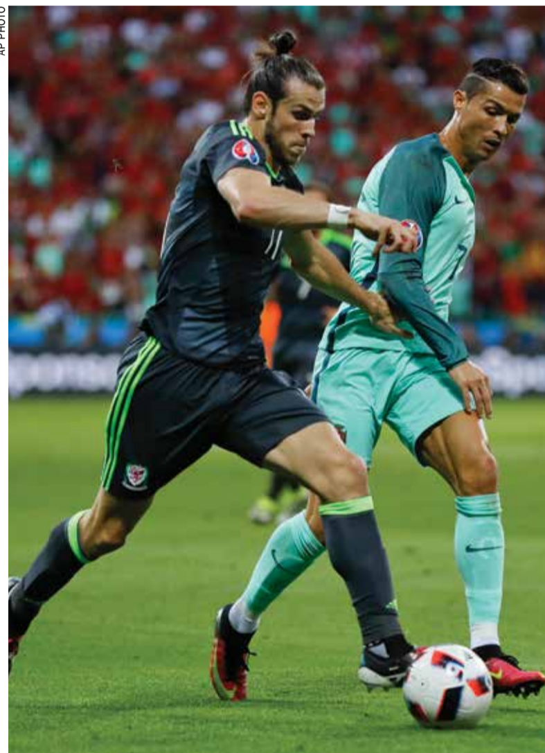
Wales's Gareth Bale (left) and Portugal's Cristiano Ronaldo compete for the ball during the Euro 2016 semifinal soccer match between Portugal and Wales, at the Grand Stade in Decines-Charpieu

Competing in its first tournament since the 1958 World Cup, Wales — a rugby-mad na-