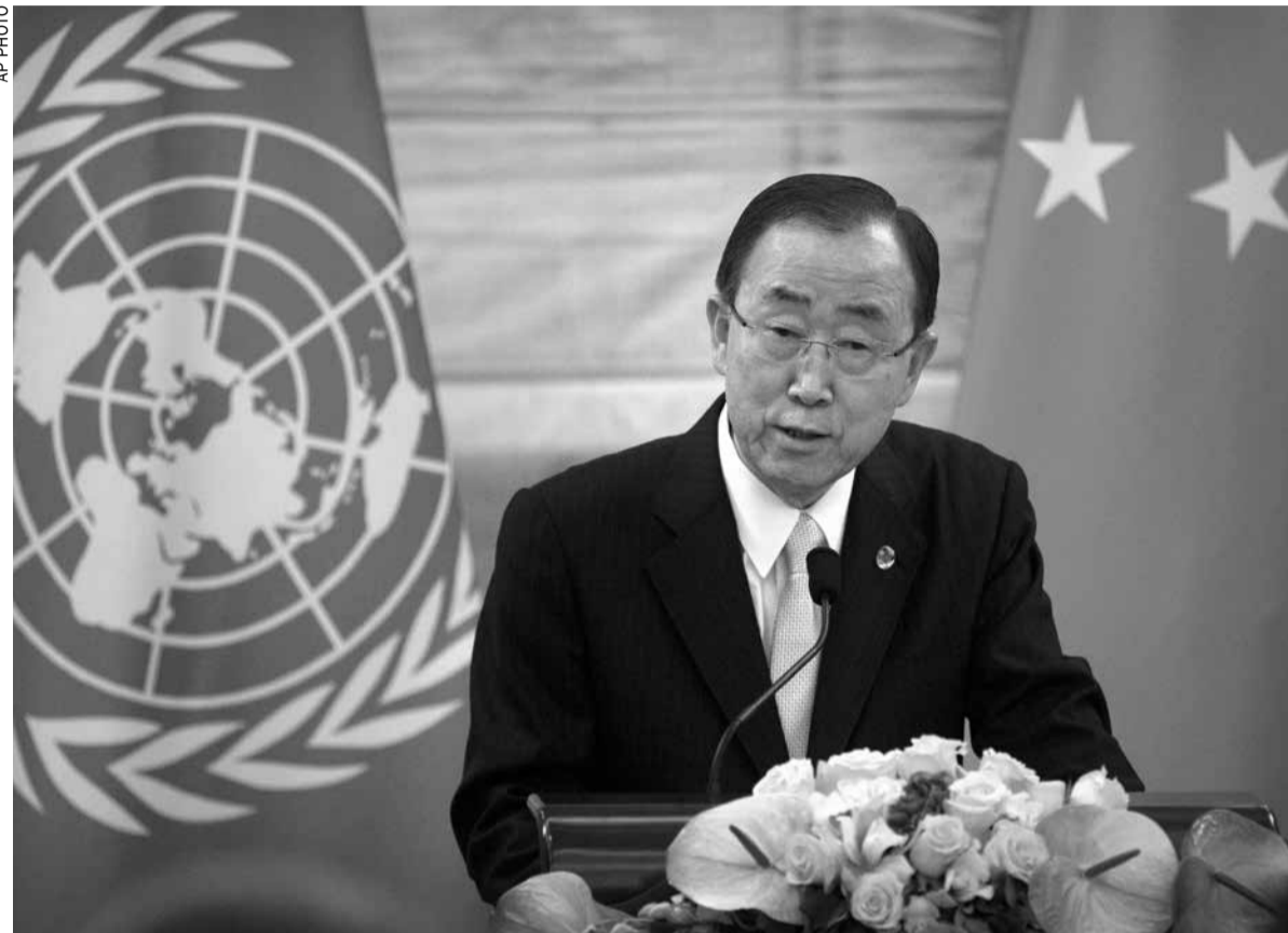
U.N. Secretary-General Ban Ki-moon speaks during a joint press conference with Chinese Foreign Minister Wang Yi at the Diaoyutai State Guesthouse in Beijing

anniversary of a crackdown in China on human rights lawyers and activists in which more than 200 were detained or questioned. One year on, around two dozen are still detained, including several who could face life imprisonment after