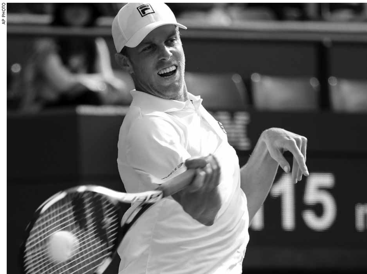
Sam Querrey, of the U.S., returns to Novak Djokovic, of Serbia, during their men's singles match on day six of the Wimbledon Tennis Championships in London

Stephens' tournament is done a year after she won the Citi Open. The 23-year-old American said it was just one of those matches for her and took all