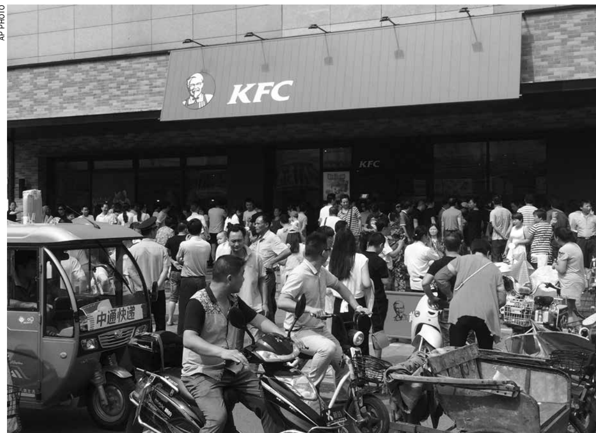
Motorists watch people gather to protest outside a KFC restaurant outlet in Baoying county