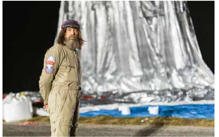
Russian adventurer Fedor Konyukhov