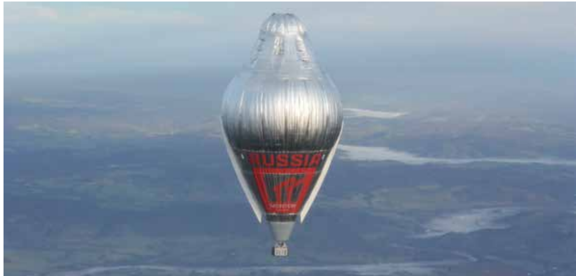
Fedor Konyukhov floats at more than 6,000 meters above an area close to Northam in Western Australia