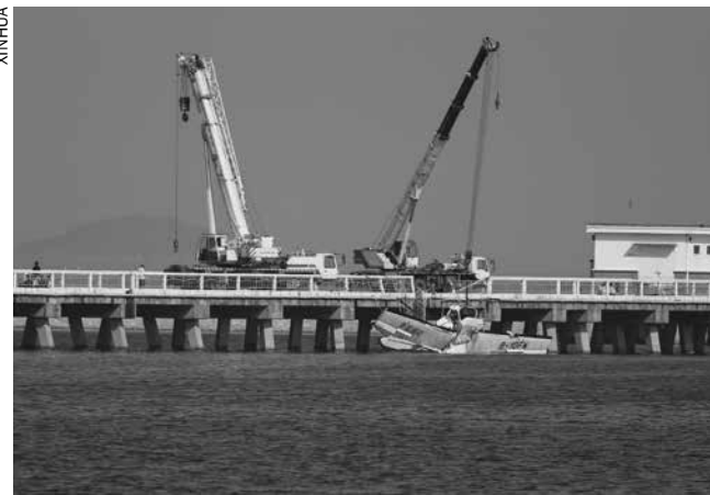
The wreckage of an amphibian plane being retrieved from the water by a crane in Shanghai

paganda official Song Wanjun, told local media that he and three other passengers were in the rear cabin and survived by escaping through the rear emergency exit.