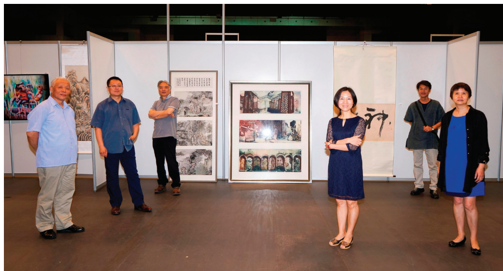
Group photo of the members of the jury in front of the awarded works

UGANDA A Ugandan-led rebel group operating in Central Africa abducted 498 civilians and killed 17 others in the first half of this year, a watchdog organization said yesterday, suggesting a resurgence of the group whose leader is the target of an international manhunt.