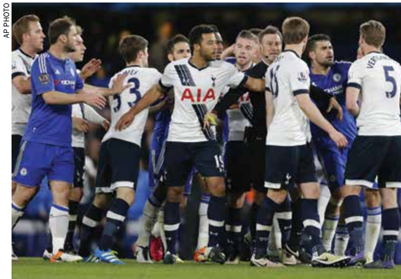
Referee Mark Clattenburg talks with Chelsea and Tottenham players during an English Premier League soccer match at Stamford Bridge stadium on May 2

It's a delicate balancing act for the league, which doesn't want to see the intense com-