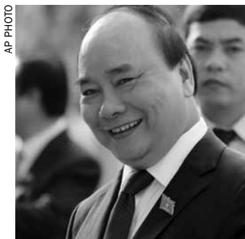
Vietnamese Prime Minister Nguyen Xuan Phuc

"There is still some chance" for the economy to reach its growth target this year if government ministries and provinces redouble efforts to boost output in industries from agriculture to manu-