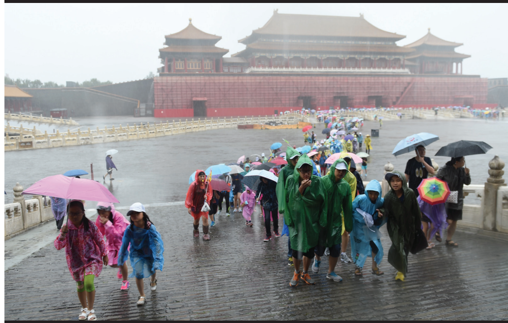
Tourists visit the Forbidden City during heavy rain. Beijing's meteorological bureau issued an orange alert for rainstorm yesterday noon.