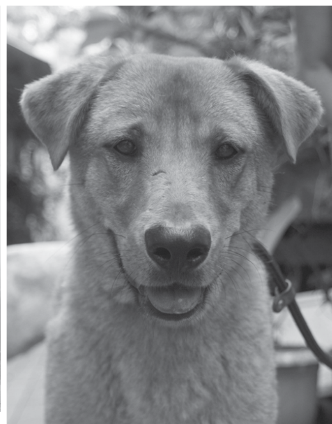
Anu, the male dog up for adoption

and usually warrants different approaches from the volunteers.