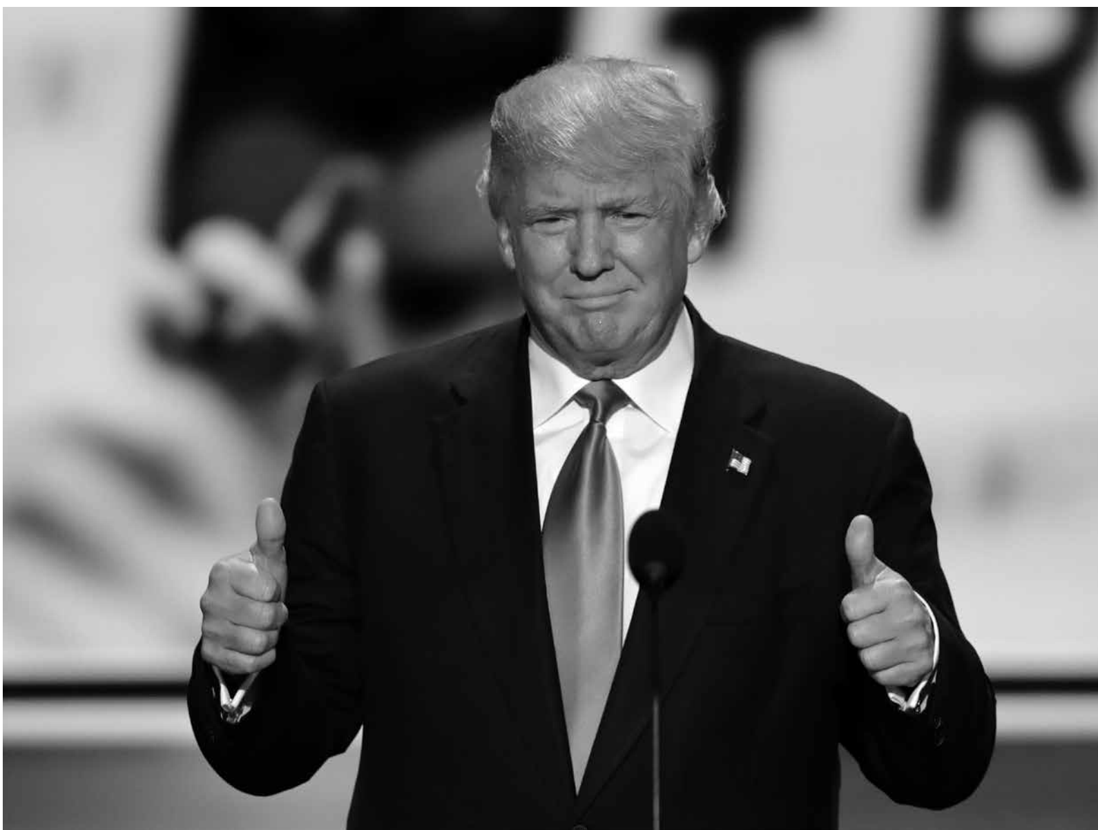
Republican Presidential Candidate Donald Trump