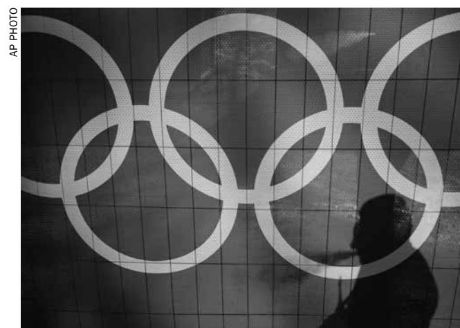
In this February 15, 2014 file photo the shadow of a man is cast on the Olympic rings as he smokes at the Rosa Khutor Alpine Center, at the 2014 Winter Olympics in Krasnaya Polyana, Russia

"The CAS award is difficult to understand," Johnsrud Sundby said. "CAS finds the rule to be unclear and the degree of fault is light. Still I am severely punished. I have always been careful with my medication and