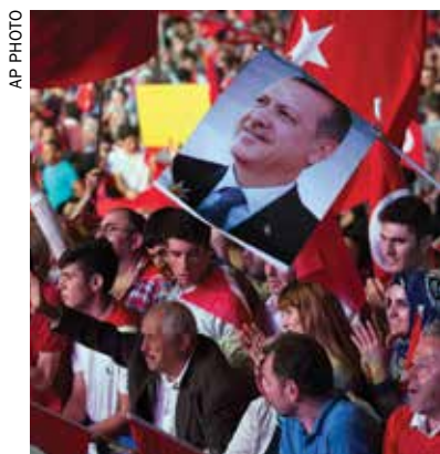
Government supporters wave Turkish flags and hold a picture of Turkish President Recep Tayyip Erdogan

Following the National Security Council meeting in Ankara, Erdogan will also gather with ruling AK Party government ministers as well as the full cabinet. A presidential official on Tuesday des-