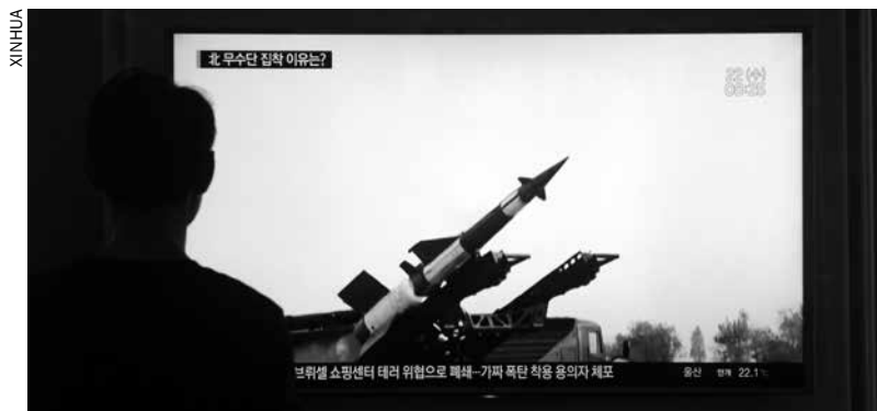
People at a train station in Seoul watch the news that North Korea test-fired ballistic rockets