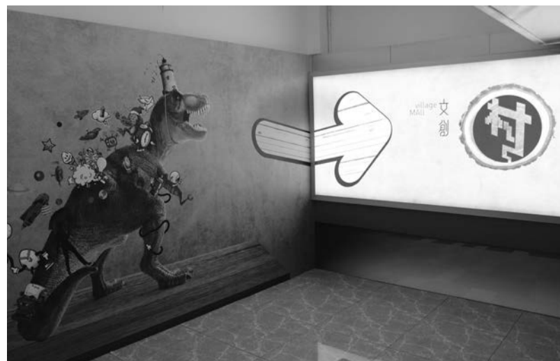
A sign at the entrance to Village Mall