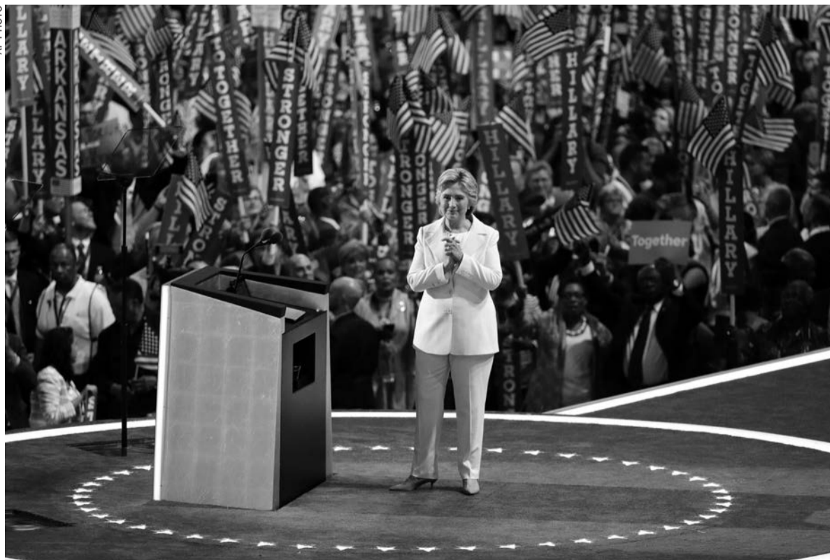
Democratic presidential nominee Hillary Clinton reacts after speaking during the final day of the Democratic National Convention in Philadelphia

But Trump has hardly suffered during this campaign for struggling with political traditions. And if Clinton doesn't get a boost after four days of validations from Democrats' most popular stars, it could be a troubling sign for her presidential hopes.