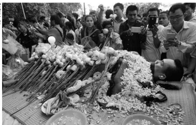
The body of Cambodian government critic Kem Ley is covered by the Cambodian National flag as flowers are placed during a funeral ceremony in Phnom Penh

Legal papers filed with the Phnom Penh Municipal Court show that a lawyer for Prime Minister Hun Sen is suing Cambodia National Rescue Party leader Sam Rainsy for remarks he posted on Facebook linking the authorities to the July 10 killing of Kem Ley. His party