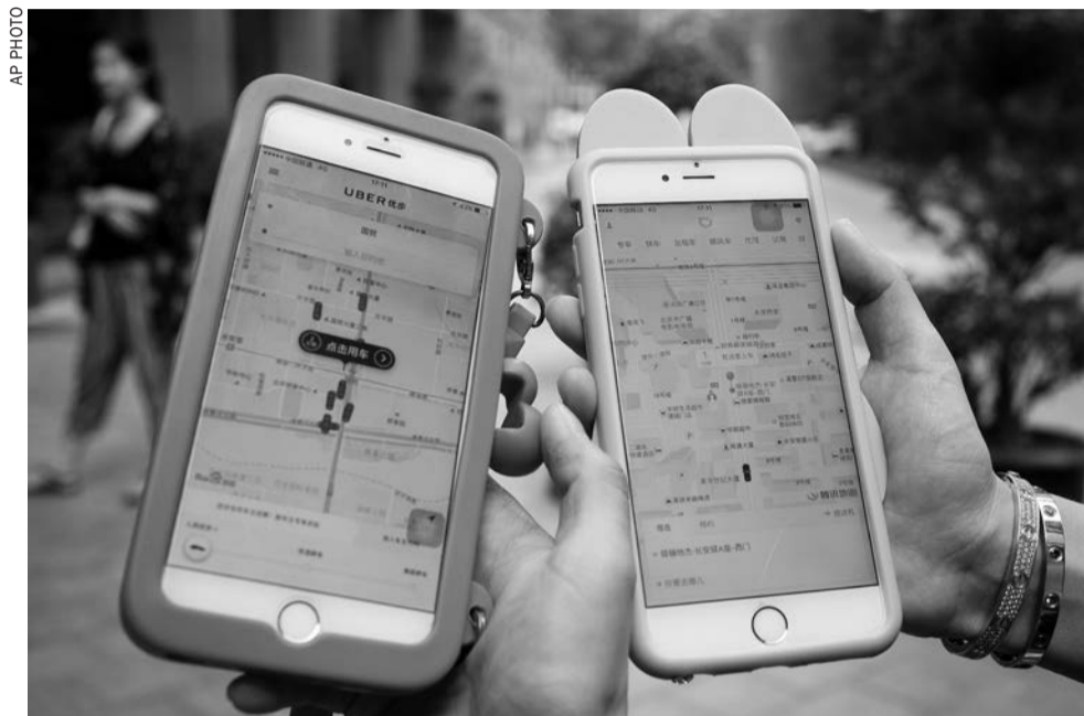
Women holding their smartphones show the ride-hailing apps Uber Technology (left), and Didi Chuxing at a residential compound in Beijing