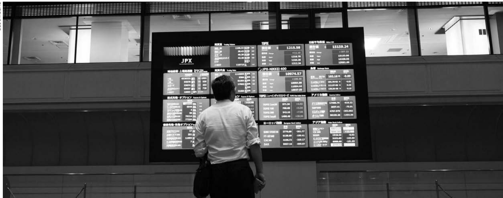
A visitor looks at an electronic board displaying market indices at the Tokyo Stock Exchange last week

deeper cut to its negative interest rate, along with stepped up buying of Japanese government bonds. Instead, the big news