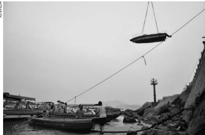
A boat is hoisted ashore to take shelter from the upcoming Typhoon Nida in Shenzhen

By 7 p.m. yesterday afternoon, with Typhoon Nida estimated to be about 330km east-southeast of Macau and forecasted to