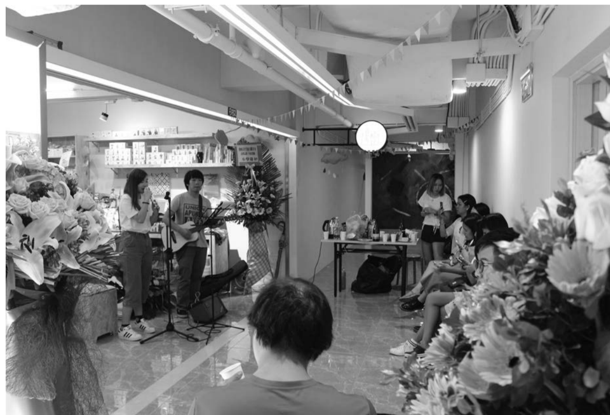
Musicians perform on Binshu Studio's opening night, yesterday

However, the new center on Rua do Campo aims to prima-