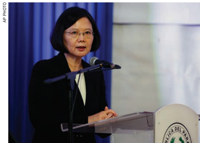
Taiwan's President Tsai Ing-wen talks during a ceremony at the Gen. Andres Rodriguez school in Asuncion, Paraguay

T AIWAN'S president yesterday apologized on behalf of the government to the island's aboriginal peoples for 400 years of conquest and colonization, saying the facing of difficult historical facts was necessary for society to move forward.