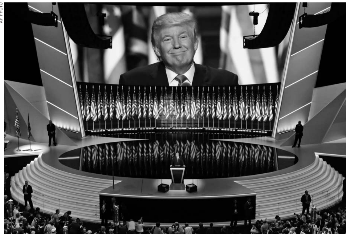
Republican presidential candidate Donald Trump smiles as he addresses delegates during the final day session of the Republican National Convention in Cleveland

be optimistic about her ability to tackle the nation's pressing problems.