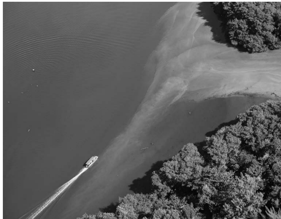
An aerial view shows sewage moving into the canals that rim the Barra de Tijuca neighborhood near Olympic Park