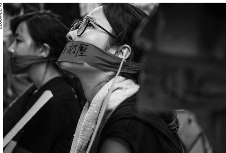
Demonstrators wear red bandanas across their mouths as they sit in protest during a rally in Hong Kong