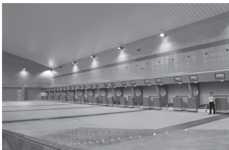
Luggage check in