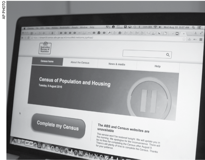
The web page of the Australian Bureau of Statistics shows that it is unavailable in Sydney