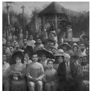
Easterners meet westerners, by Lio Man Cheong

The exhibition is open daily from August 17 to September 7. Admission is free.