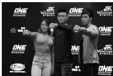
Some of the fighters pictured recently in Hong Kong during a promotional event

According to a statement from the organizers, ONE Cham-