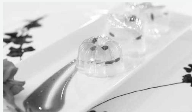
Chrysanthemum pudding with goji berry

Sands Macao's signature Chinese restaurant Golden Court has enhanced its recently launched dim sum menu with additional delicacies such as new hot pot