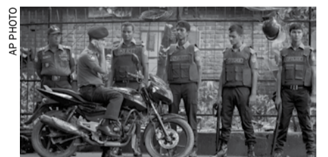
Bangladeshi policemen stand guard outside a special court as a verdict against people involved in war crimes is announced