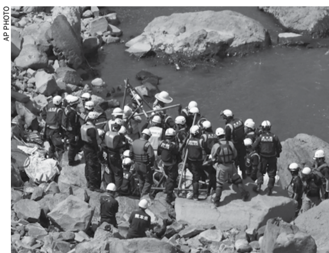
Police officers and firefighters work to retrieve a wrecked car that may hold the final victim of two deadly earthquakes that hit southern Japan nearly four months ago

Hikaru Yamato, 22, was driving home in a yellow Aqua when the magnitu-