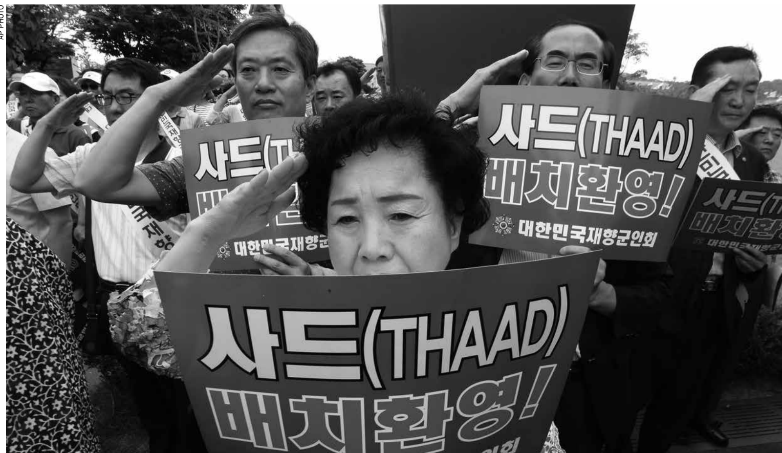
Members of the Korean Veterans Association salute during a rally to support a deployment of the Terminal High-Altitude Area Defense, or THAAD, in front of the Defense Ministry in Seoul

"If South Korea willfully deploys the system, there will be a larger impact on relations and in trade. Economic ties will in-