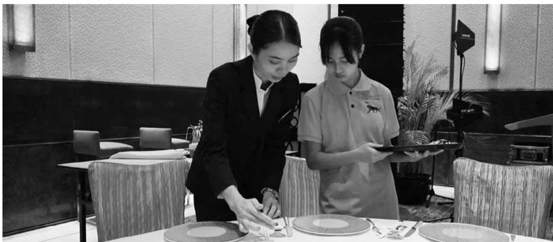
A total of 75 local students gain hands-on experiences