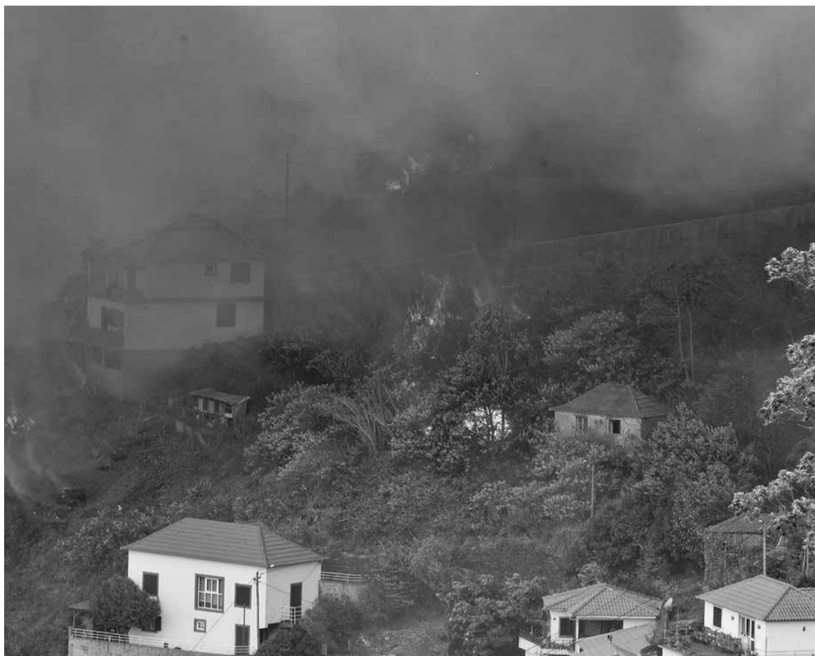
A forest fire rages near houses in Curral dos Romeiros, on the outskirts of Funchal

forecast is for cooler temperatures and a drop in the wind speed, which authorities hope will help extinguish the fire.