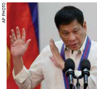
Philippine President Rodrigo Duterte