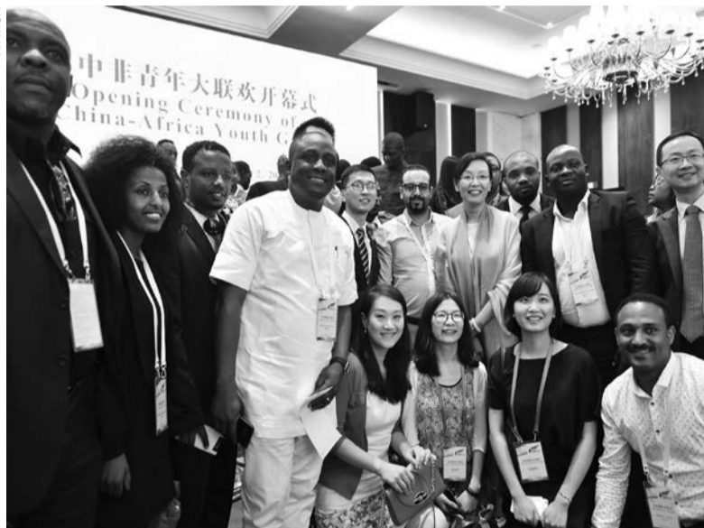
Youths from China and Africa take a group photo after the opening ceremony of 2016 China-Africa Youth Gala held in Guangzhou on Aug. 2. A total of 188 youths from 18 African countries and nearly 200 youths from Guangdong attended the gala

Dollar asserts that Africa's demographics are heading in the opposite direction, with much resemblance to China before the economic reforms 35 years ago: half of the population is less than 20 years old, so the working-age population will in-