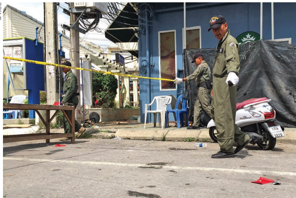
Investigators work at the scene of an explosion in the resort town of Hua Hin, 240 kilometers (150 miles) south of Bangkok

political opponents of the military government. The comments suggested the perpetrators were linked to supporters of former Prime Minister Thaksin Shinawatra, who was ousted in a 2006 military coup. His supporters and opponents have since then carried out a sometimes-violent struggle for power. The army in 2014 toppled an