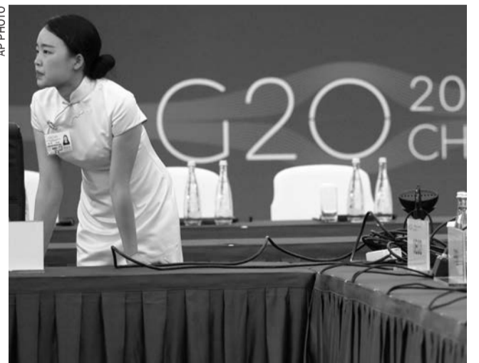
Hostess prepares for the G20 Finance Ministers and Central Bank Governors Meeting in Chengdu

The consensus among members is to "focus on economic development and not be distracted by