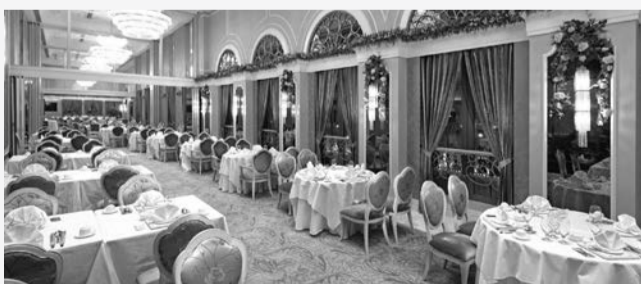
Elegant Seafood Restaurant

Smilin, the travel and gourmet brand under Ctrip, one of China's largest travel service providers, has named five restaurants at Sands Resorts Cotai Strip Macao as "Smilin Excellence" or "Smilin One-Star" in a recent inaugural award ceremony, according to a statement from Sands China.