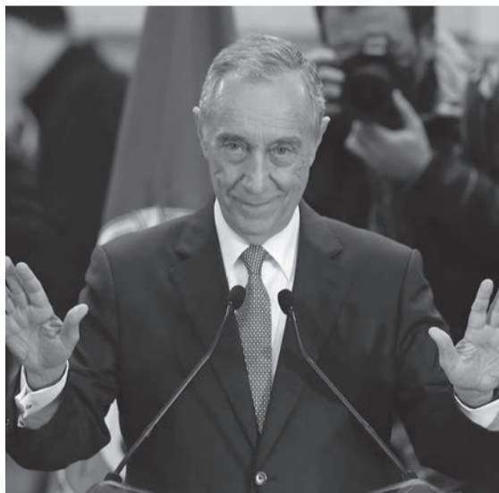
Marcelo Rebelo de Sousa

C HUI Sai On will lead a delegation on a visit to Portugal, following an invitation by the Portuguese President, Marcelo Rebelo de Sousa. The trip will take place from September 10 to 15.