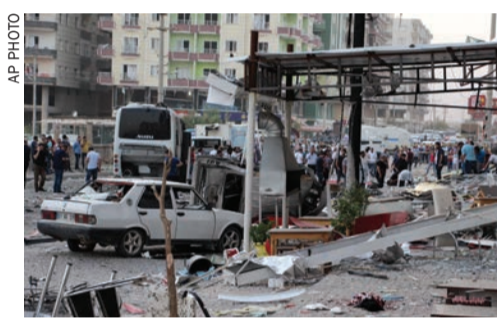
Police search an area after a bomb attack in Mardin

Clashes between the PKK and Turkey's security forces resumed last year after a