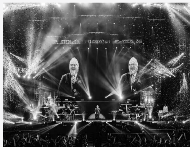
Studio City's second summer concert "Han Hong Macau Concert 2016" took

the stage at the Studio City Event Center (SCEC) on Saturday, attracting thousands