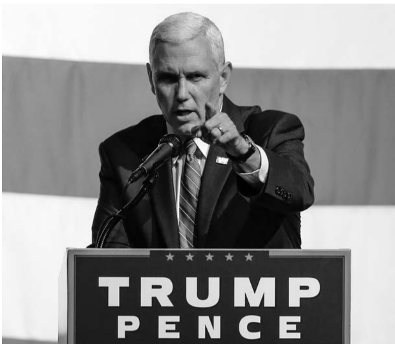
Republican vice presidential candidate Indiana Gov. Mike Pence speaks during a campaign stop in Council Bluffs, Iowa

Pence supporter and outspoken in his distaste for Trump. "He's had to put together a message of their hopes and dreams for the country if they are elected, while also trying to Band-Aid over some of the mistakes that are being made by Donald at the top of the ticket."