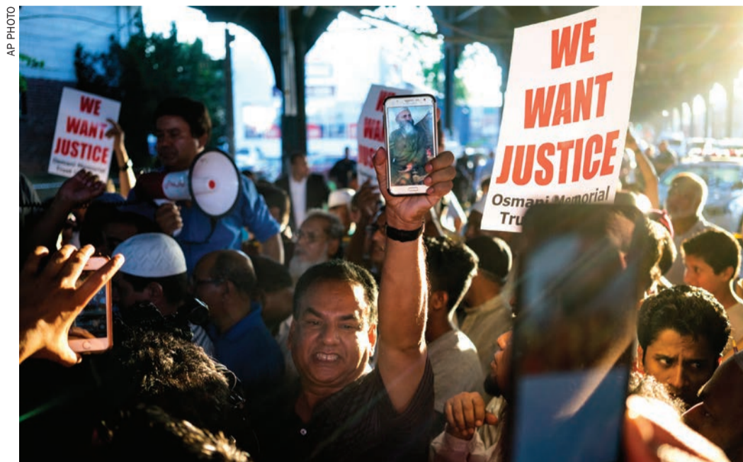
People gather for a demonstration, near a crime scene after the leader of a New York City mosque and an associate were fatally shot in a brazen daylight attack as they left afternoon prayers

Jordan is an overwhelmingly Muslim and deeply conservative country. The Amman prosecutor's office banned further reporting in a statement published yesterday, citing public safety concerns.