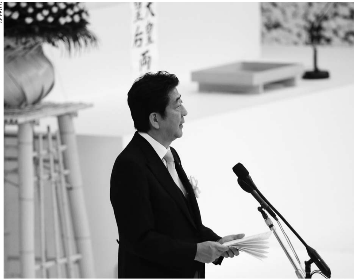
Japan's Prime Minister Shinzo Abe

Abe also visited the Chidorigafuchi National Cemetery for