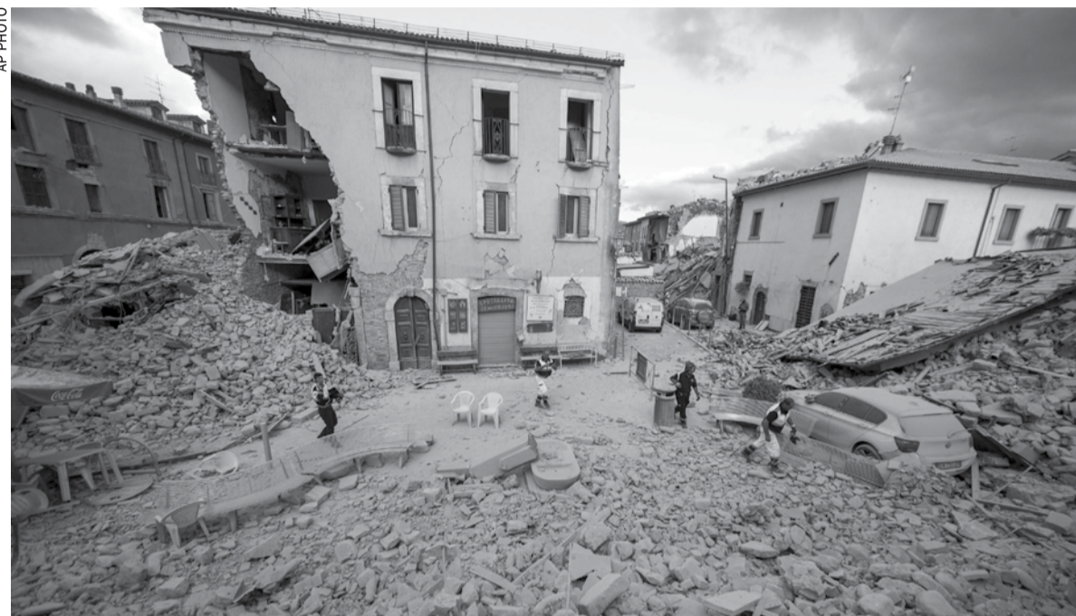
The side of a building is shown collapsed following an earthquake in Amatrice

re's nothing left," she said, too distraught to give her name. "I don't know what we'll do."