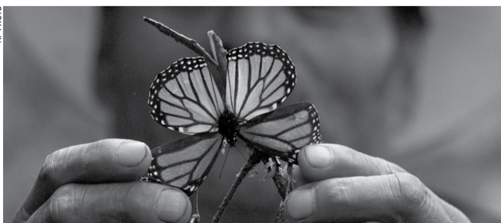
In this Nov. 12, 2015, file photo, a guide holds up a damaged and dying butterfly at the monarch butterfly reserve in Piedra Herrada

"This points up just how fragile these forests are, and how fragile the monarchs are, and it makes clear the importance of