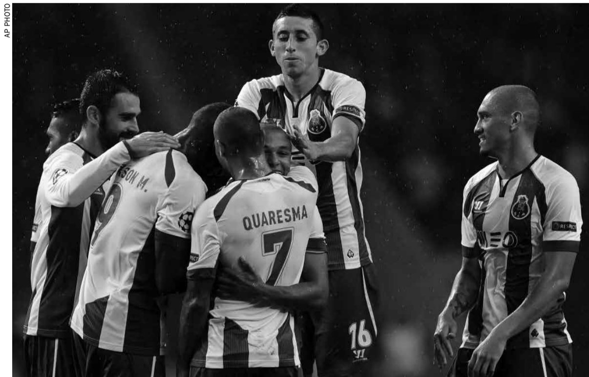
Porto players celebrate a goal during a Champions League group stage match two years ago against FC BATE Borisov, where they won 6-0

Italian clubs have failed in the playoffs for five of the last six seasons, typically leaving Serie