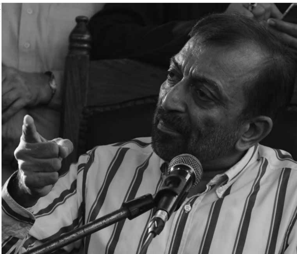
Farooq Sattar, leader of the Muttahida Qaumi Movement, or MQM, addresses a news conference in Karachi on Tuesday

Paramilitary troops detained MQM leaders and sealed its offices, extending a crackdown that began in 2013 as security forces sought to restore order in a city that generates almost half of Pakistan's revenue. The MQM aims to represent descendants of Muslims who moved from India to Pakistan after their independence from Britain in 1947. Protests by its followers – often triggered by statements by Hussain, who has lived in London since 1992 – have over the years triggered