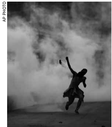
A Kashmiri protester throws a tear smoke shell on government forces as he reacts to Sunday's killing of a young man in Srinagar on Monday

Clashes were also reported in at least two places in the northern Bandipore area, where a woman was injured.