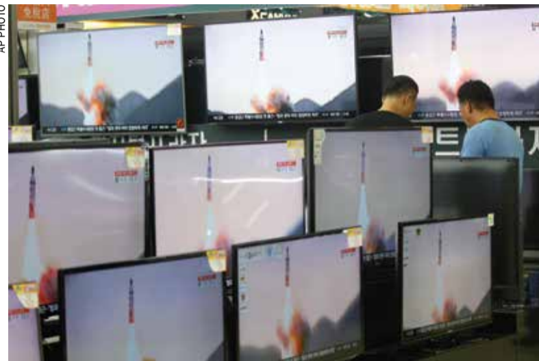
TV screens show a North Korean ballistic missile that Pyongyang claims to have launched from underwater, at the Yongsan Electronic store in Seoul yesterday

The North's acquiring the ability to launch missiles from submarines would be an alarming development because missiles fired from submerged vessels