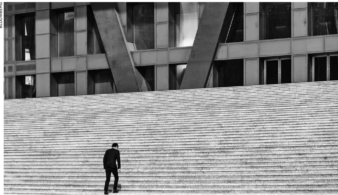
A man walks up a flight of stairs towards the entrance of the Shenzhen Stock Exchange building in Shenzhen

■ ICBC, China's largest lender, slid 2 percent after a momentum indicator rose to levels only seen during one period in the past five years