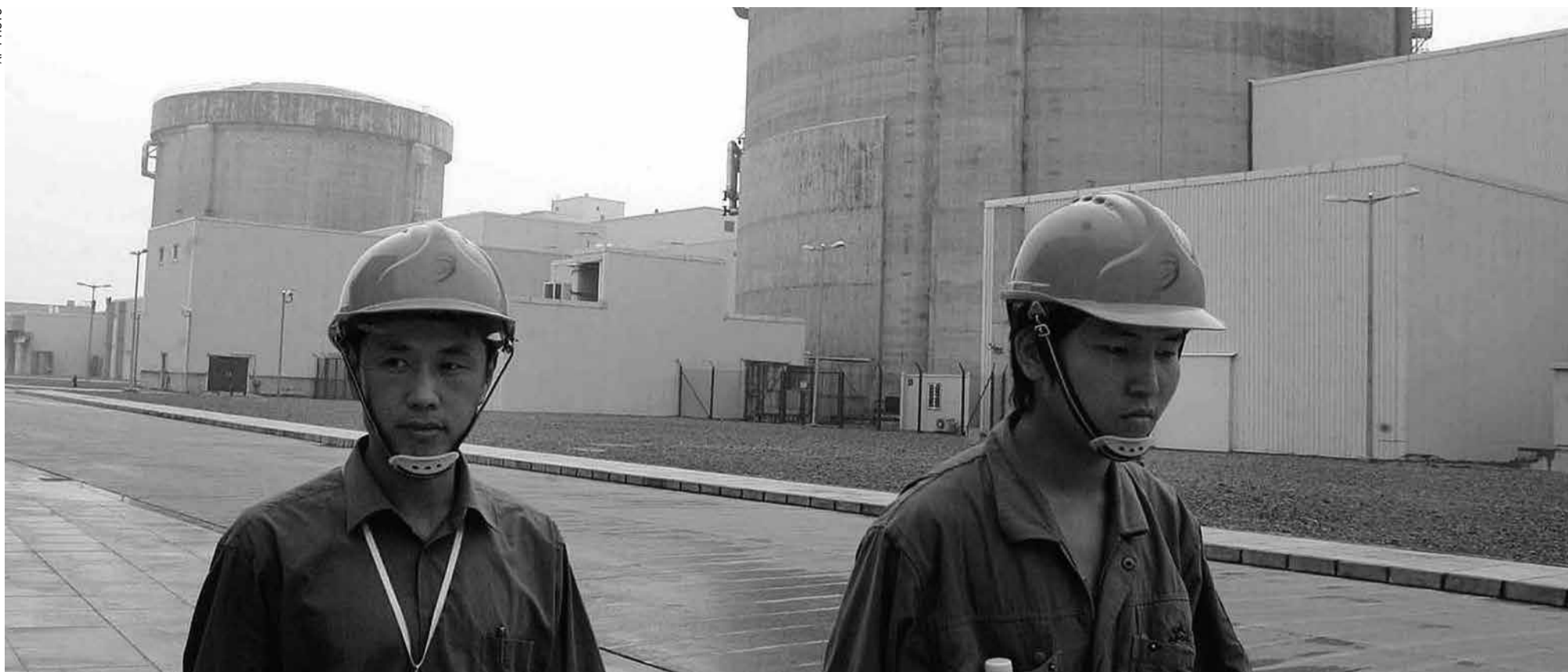
Workers walk past a part of Qinshan No. 2 Nuclear Power Plant