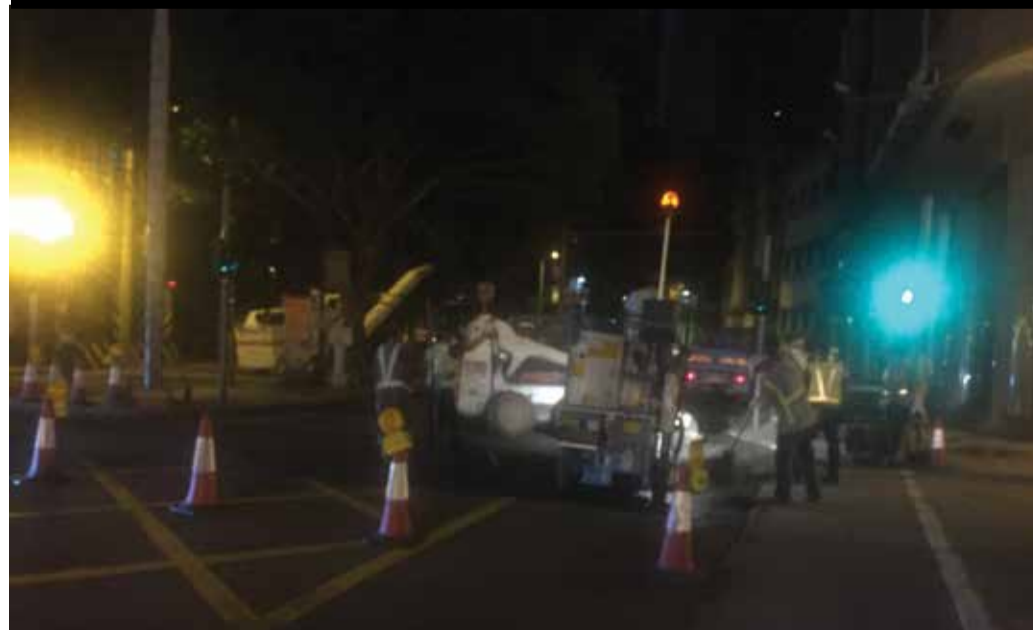
Night shift. The crucial crossroad intersecting San Ma Lo and Praia Grande at the heart of the city was interrupted for a couple of hours last night due to extensive pavement repair works. The intermittent traffic lights in conjunction with those of the road blocks and police vans resulted yet in another show in this... city of lights.