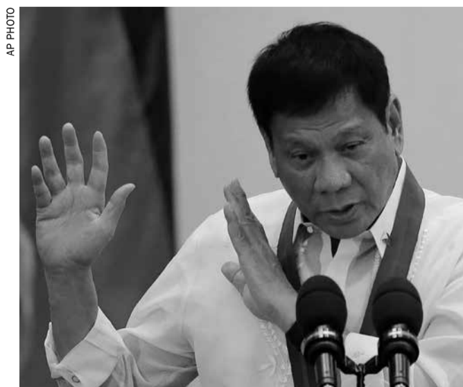
In this July 1, 2016, file photo, Philippine President Rodrigo Duterte gestures in suburban Quezon city, Philippines

Ramos, a key political backer of Duterte, met Chinese intermediaries recently to pave the way for the talks, to be held in Beijing.