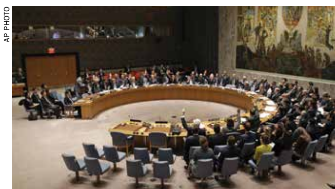
The UN Security Council votes on a resolution to toughen sanctions against North Korea earlier this year