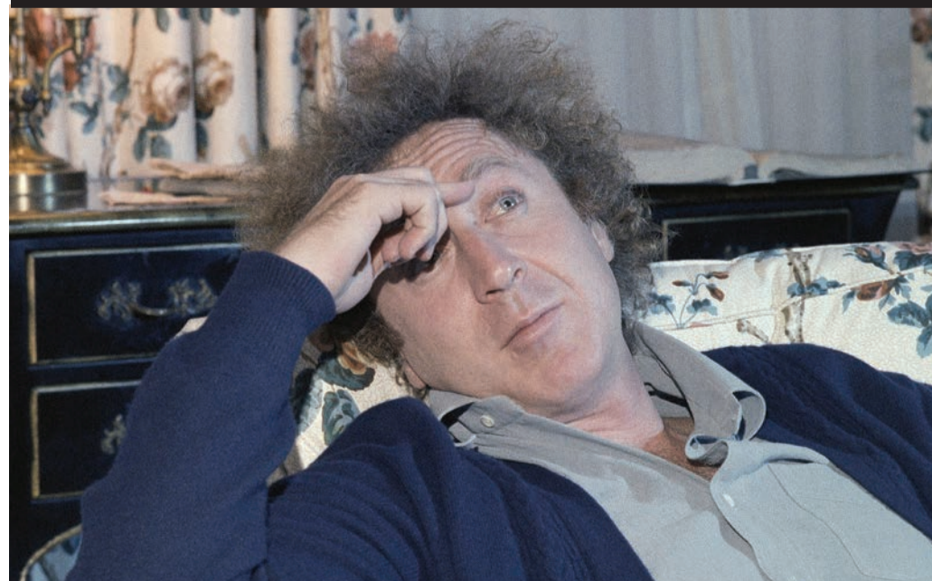
Actor Gene Wilder died Sunday (yesterday, Macau time) in Stamford, Connecticut, from complications of Alzheimer's disease at age 83 (see obituary on this page).