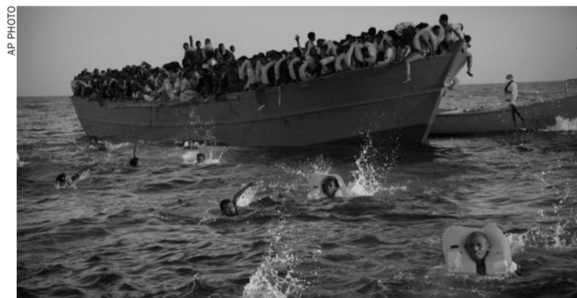
Migrants jump into the water from a crowded wooden boat as members of an NGO help them during a rescue operation on August 29

Their boats too weak and technically unequipped for a voyage across the stretch of the Mediterranean to the shores of Italy, the migrants had set off with a bit of gasoline in the overcrowded vessels, hoping to make it at least 15-20 miles out to sea and reach awaiting