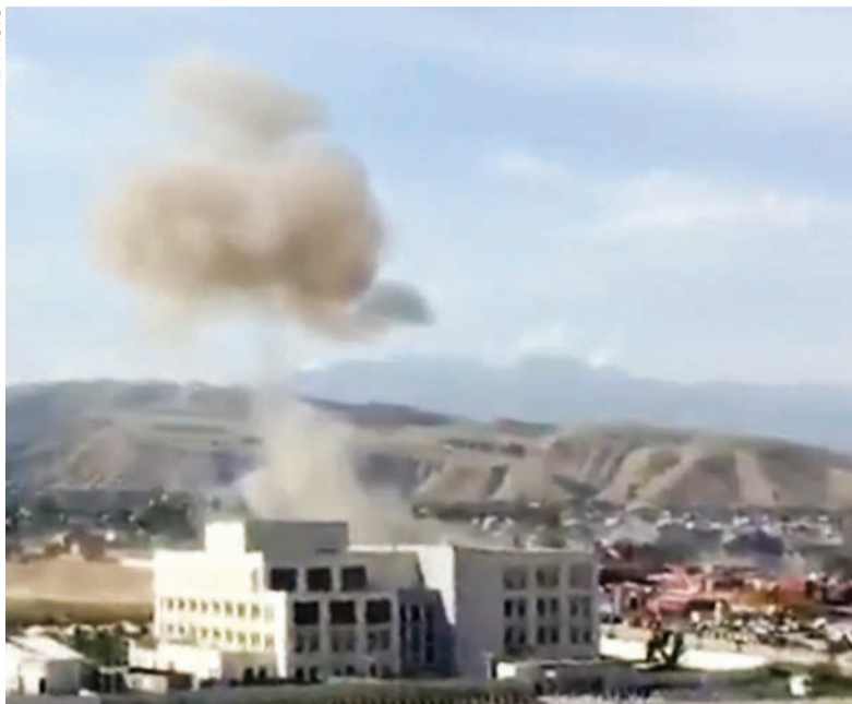
Smoke rises above the Chinese Embassy in Bishkek