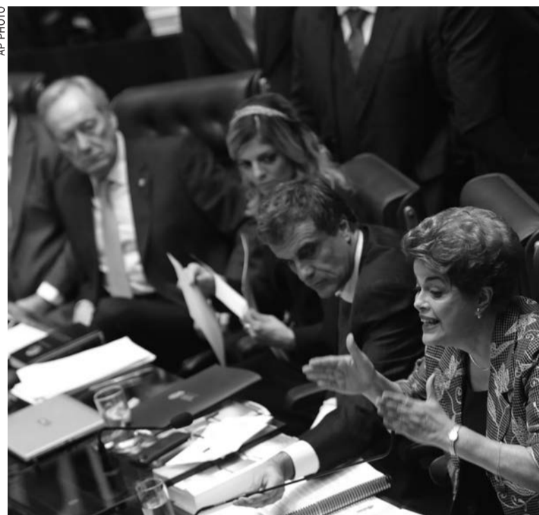
Brazil's suspended President Dilma Rousseff (far right) speaks at her impeachment trial, in Brasilia on Monday

"I need all of you, regardless of political parties," Rousseff