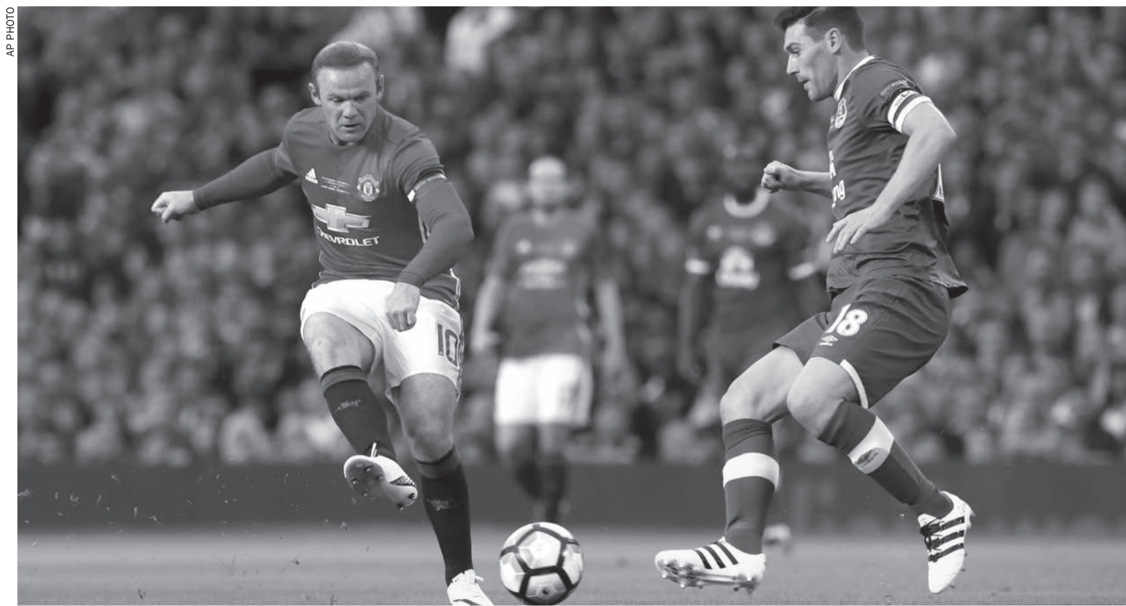
Everton's Gareth Barry (right), attempts to block Manchester United's Wayne Rooney during testimonial match for Rooney, at Old Trafford, Manchester, on August 3