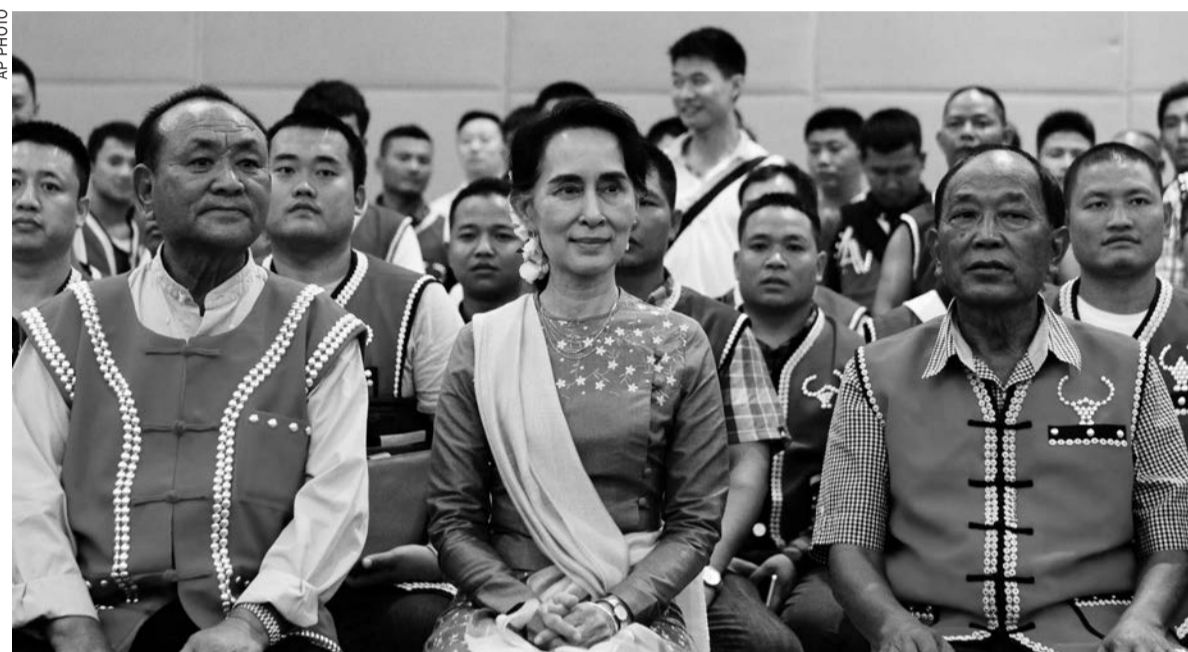
Myanmar's Foreign Minister Aung San Suu Kyi (center), and United Wa State Army (UWSA) pose for photographers after a meeting of armed ethnic groups

process that began in earnest when the military ceded some of its formal power to a nominally civilian government in 2011.