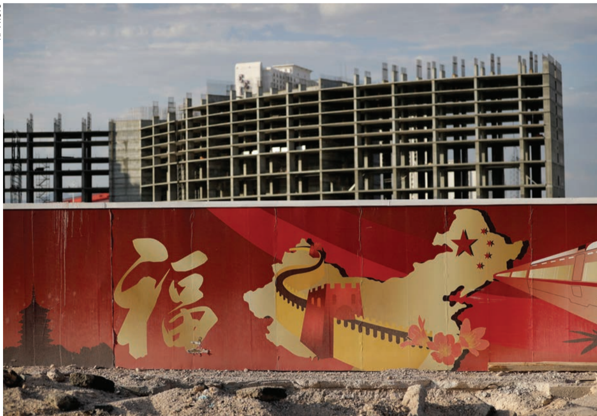
A wall with symbols of China partially blocks the view of the Resorts World property in Las Vegas

enclaves, including local Las Vegas, the reliable weekend hordes from California, and tourists from the Pacific Northwest and East Coast.