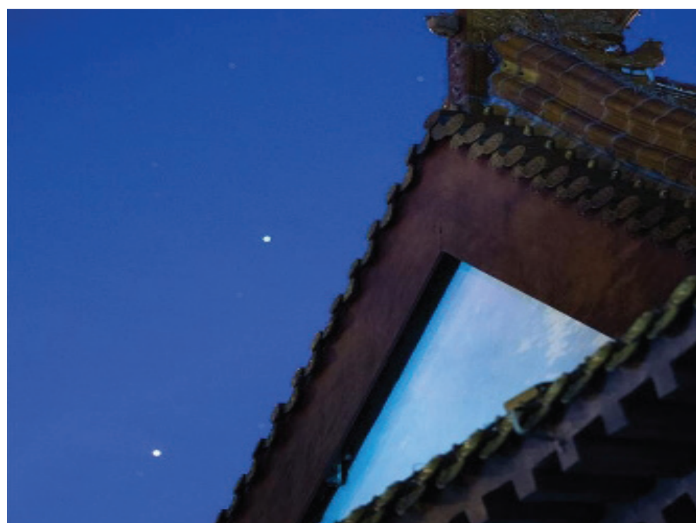
Photo taken on Aug. 24 showing the special astronomical phenomenon seen at the Forbidden City of the Ming Dynasty in Nanjing

Finally, on September 29, planet Mercury will sit itself at the greatest elongation west. This is the third and last time this year that Mercury can be seen from that position. Staff Reporter