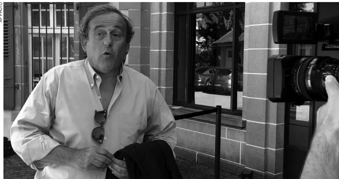
Michel Platini leaves the international Court of Arbitration for Sport after a hearing in Lausanne, Switzerland, on August 25

European football requires at a crucial moment for the global game."