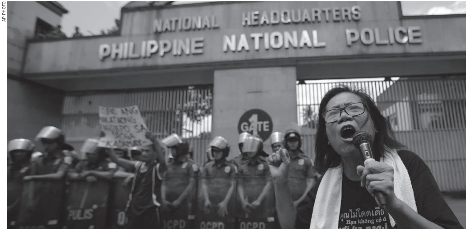
A Filipino activist shouts slogans calling for an end to extrajudicial killings related to Philippine President Rodrigo Duterte's "War on Drugs"