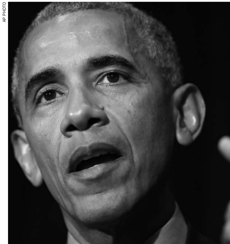
U.S. President Barack Obama

Obama's remarks came at the end of a grueling nine-day trip that took him to Laos and China following U.S. stops in Nevada, Hawaii and Midway Atoll in the Pacific Ocean. It's the last of 10 trips Obama paid as president to Asia, where Obama lived as a youngster with his mother in Indonesia.