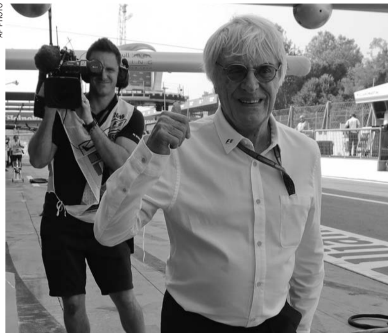
Ecclestone gives the thumb-up sign during the first practice session for Sunday's Italian Formula One Grand Prix at the Monza racetrack

Asked about challenging NASCAR's supremacy in the U.S., Ecclestone said: "They are the