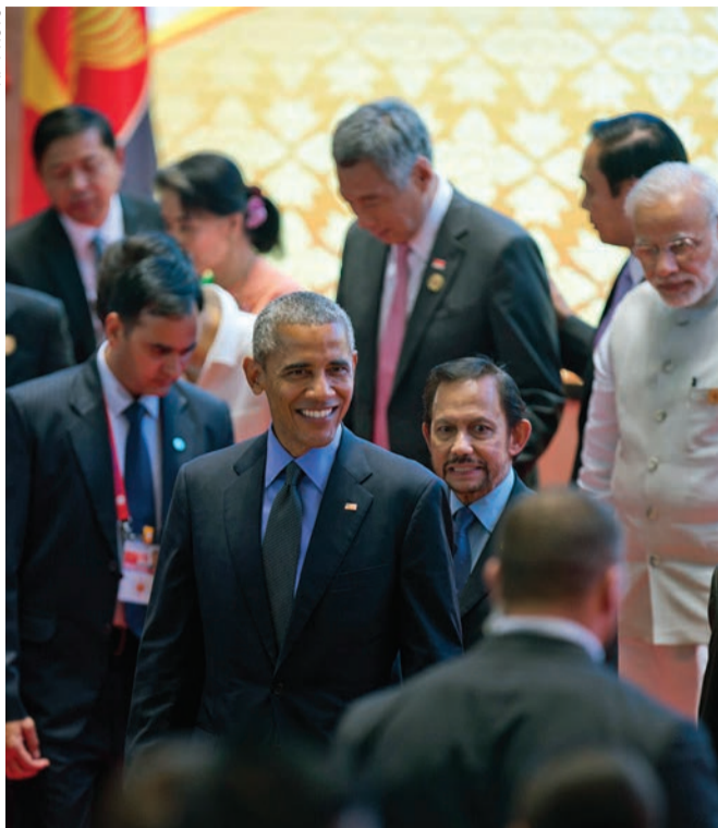
U.S. President Barack Obama (center), walks with leaders of ongoing 28th and 29th ASEAN Summits and other related summits at National Convention Center in Vientian