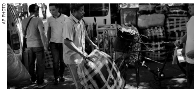
A vendor loads goods from a pick-up station near a clothing wholesale market in Beijing

The improvement in exports was a boost for Chinese leaders who are trying to protect millions