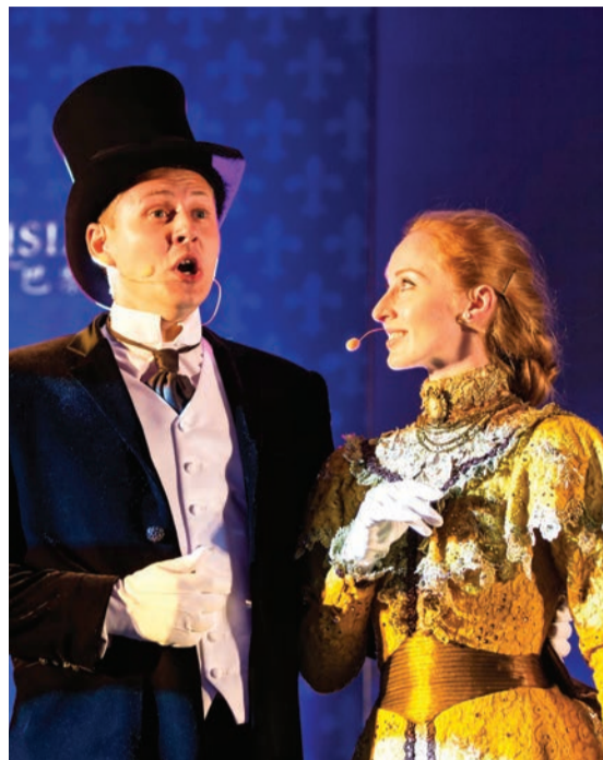
Entertainment act at yesterday's press conference