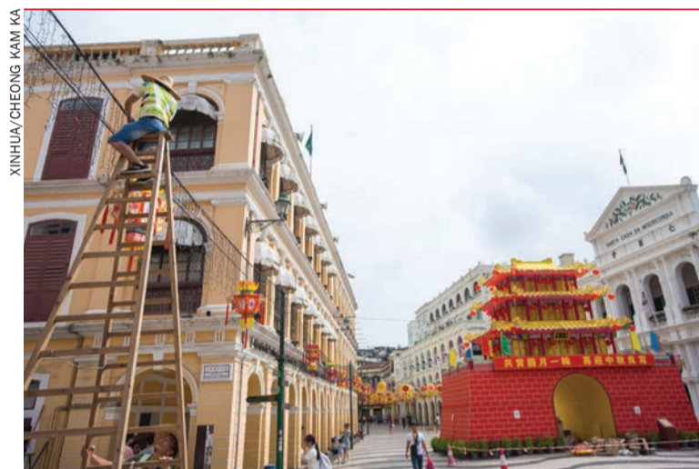
Workers arrange light decorations ahead of the Mid-Autumn Festival at the Senado Square.