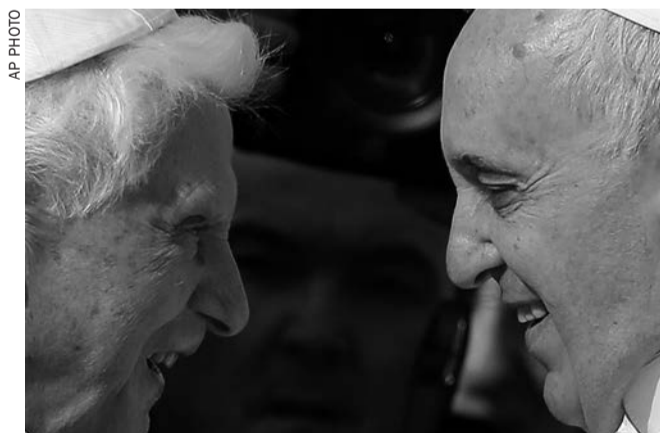
Pope Francis (right), greets Pope Emeritus Benedict XVI

"Indeed a group was pointed out to me, in the meantime we have dissolved it," Benedict said. "This