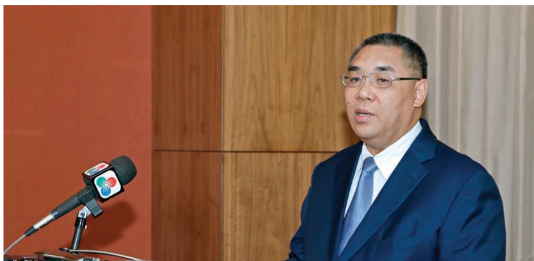
Chui Sai On briefs reporters in Lisbon on his six-day visit to the Portuguese Republic

Chui Sai On gave no details of the project, but its announcement comes less than a month before the 5th Macau Forum Ministerial Conference in Macau, which will bring