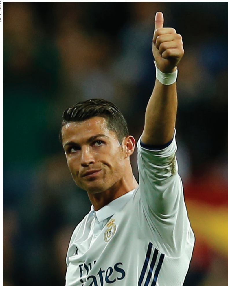
Real Madrid's Cristiano Ronaldo