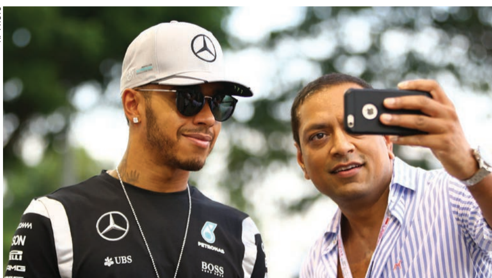
Mercedes driver Lewis Hamilton of Britain poses for a selfie with a fan as he arrives at the Marina Bay City Circuit

ful driver in Singapore, winning half of the previous eight editions. "This track was very good for us last year and we have improved the car since then, so it could be a reasonable track for us again.