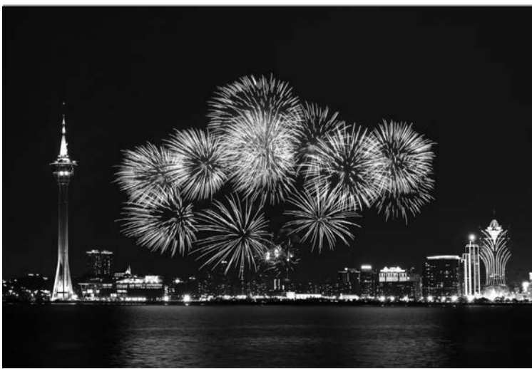
Included in the International Fireworks Competition, Korean team's performance was attended by thousands of people yesterday close to the Nam Van Lake and at Taipa's waterfront