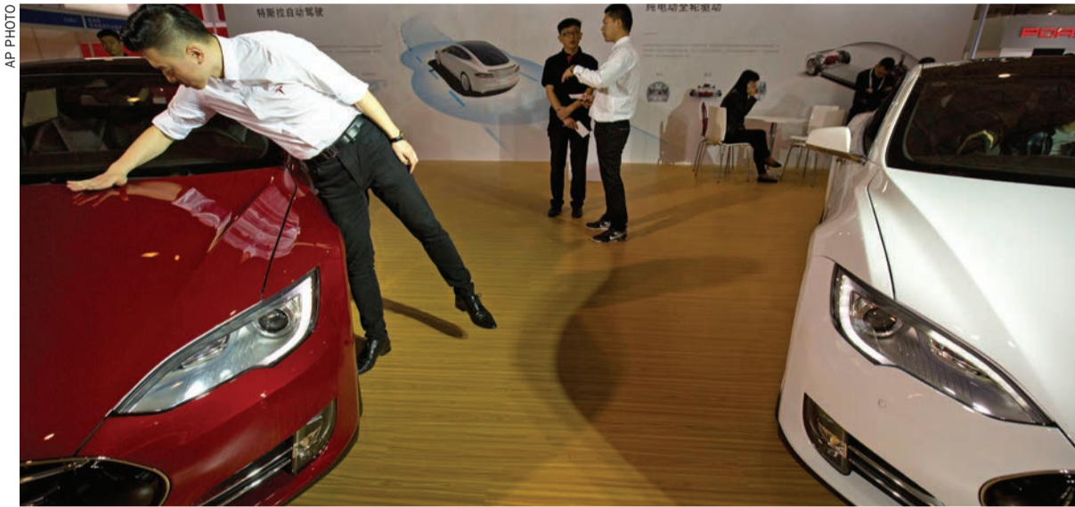
Staff member cleans the hood of a Tesla Model S electric car near a display advertising Tesla's self-driving features at the Beijing International Automotive Exhibition