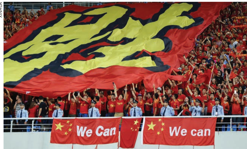
Supporters cheer for China

As for the campus, it took only ten months and a significant amount of money for real estate company Evergrande (who also co-owns local club Guangzhou Evergrande Taobao Football Club) to transform the 67.5 hectares of formerly rural land in Qingyuan, Guangdong province. The new football school has a total of 50 football pitches and a squad of Spanish coaches brought to China through a partnership with Spanish giant Real Madrid. The academy's first aim was to find new talent for the local club at Guangzhou Ever-