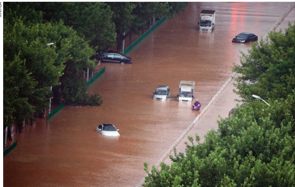
Cars are stranded on a waterlogged street in Quanzhou, Fujian province, yesterday

The film project has the backing of Yoko Ono, the widow of John Lennon, and Olivia Harrison, widow of George Harrison.