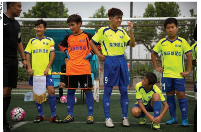
Players on a team from Yanbian, China