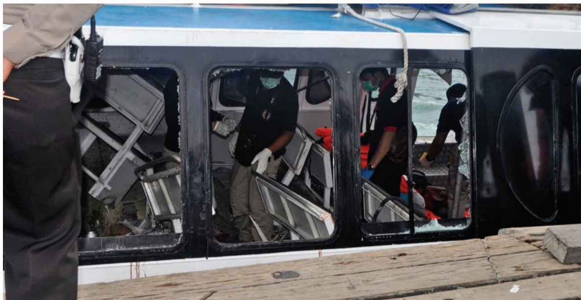
Police investigators examine the Gili Cat 2 boat following an explosion while it was enroute to nearby island of Lombok

Police have not yet determined the cause of the explosion, but a member of the forensics team investigating the scene said initial indications are it was an accident. The officer didn't want to be named because he is not an official police spokesman.