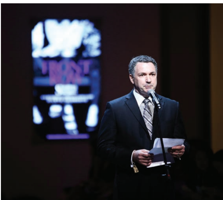
Shoppes at Parisian has added more than 170 stores to the existing 650 at Sands Shoppes Cotai Strip Macao after the opening of The Parisian Macao on September 13, 2016