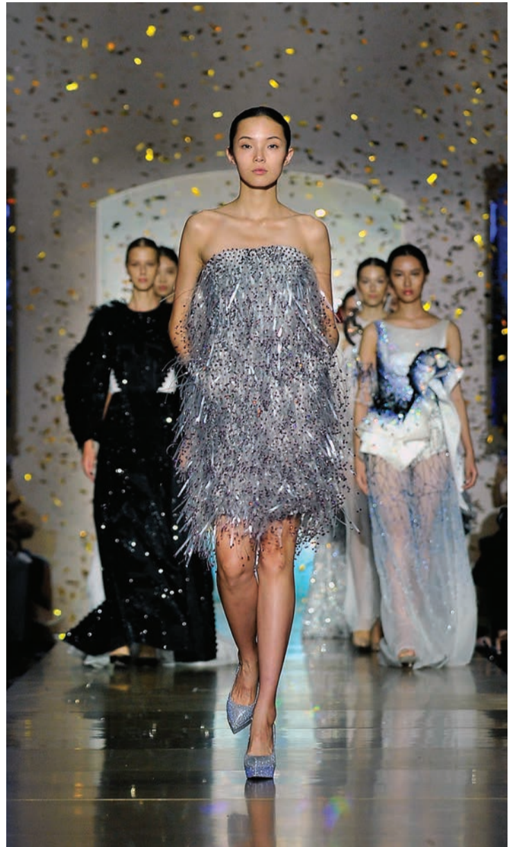
Exclusive designer runway show Front Row marked the start of three days of fashion events celebrating the official launch of The Parisian Macao's Shoppes at Parisian