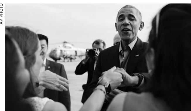
President Barack Obama greets people in the tarmac

Capturing Mosul, the last major city IS controls in Iraq, would constitute both a symbolic and strategic defeat to the militants. The U.S. and its partners hope a successful Mosul offensive will set the stage for eventually ousting the group from Raqqa, the largest IS-held city in Syria and the de facto capital of the group's self-declared caliphate.