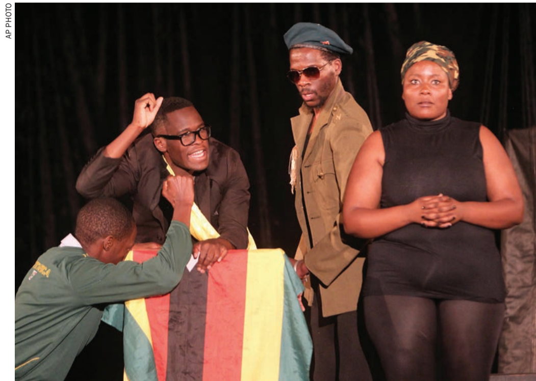
Zimbabwean actors are seen during a comedy scene from a show called State of The Nation