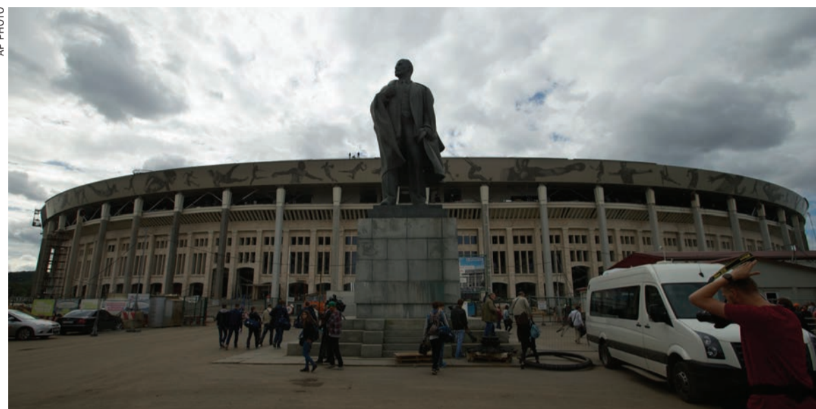
A statue of Soviet founder Vladimir Lenin in front of the Luzhniki stadium, which is undergoing a major rebuild to host the 2018 World Cup final, in Moscow