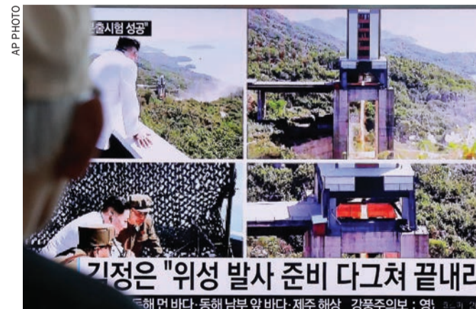
A man watches a TV news showing images that North Korea's Rodong Sinmun newspaper reports of the ground test of a high-powered engine of a carrier rocket and North Korean leader Kim Jong Un at the country's Sohae Space Center

The North was already slapped with the toughest U.N. sanctions in two decades following its fourth