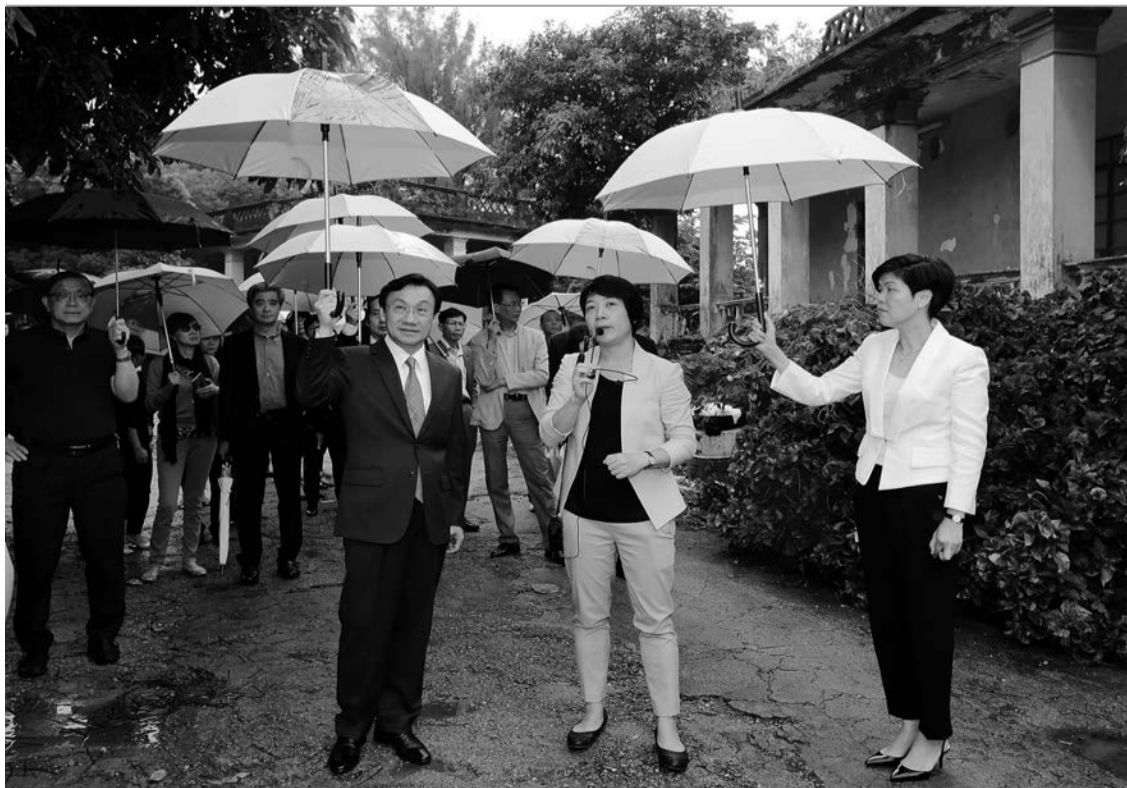
The Cultural Affairs Bureau (IC) has announced that at least MOP6 million will be diverted toward restoring five of the six former leper colony buildings in Coloane. The work, which is expected to start before the end of the year, will include a study over whether the site could become a tourist attraction in the future, to be conducted by the Macau Government Tourist Office. Several officials, including the Secretary for Social Affairs and Culture, Alexis Tam (front left) also visited the site yesterday to learn more about the state of the buildings.