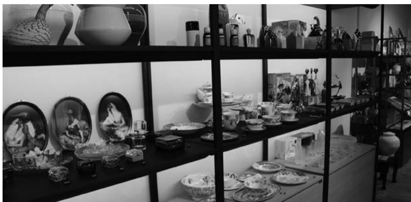
Signum's new shop