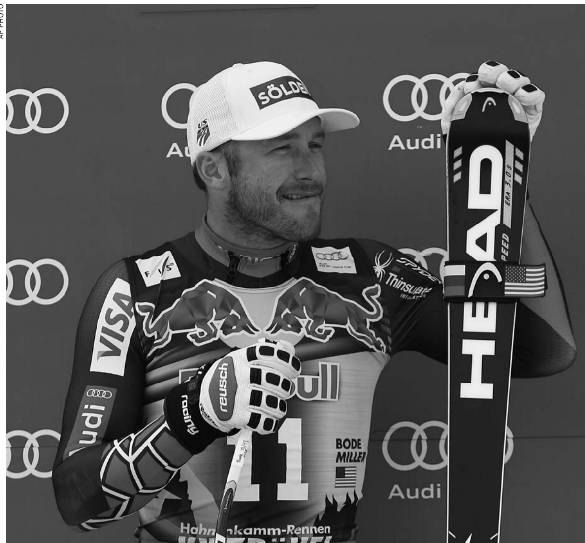
In this Jan. 25, 2014, file photo, third placed Bode Miller celebrates at the end of an alpine ski, men's World Cup downhill, in Kitzbuehel, Austria

A two-time overall champion, Miller has not competed on the World Cup circuit since March 2014. A few months later, he underwent back surgery before taking part in the 2015 world championships in Beaver Creek, where he severed his hamstring tendon in a nasty crash during the opening super-G race.