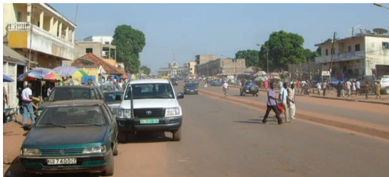
Bissau, capital city of Guinea-Bissau

from the BDC for initiatives in the energy sector and rice production, the staple food of the region's countries, but which they produce at a deficit.