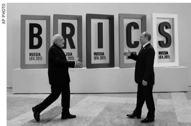
Indian Prime Minister Narendra Modi (left), and Russian President Vladimir Putin

The five BRICS countries — Brazil, Russia, India, China and South Africa — do not lack for heft. They represent nearly half the world's population and a quarter of its economy, at a combined USD16.6 trillion. But at a summit in the western Indian state of