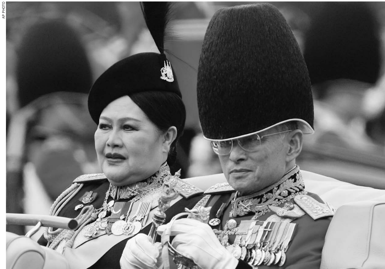
Thailand's King Bhumibol Adulyadej and Queen Sirikit review the honor guard during a ceremony ahead of his 78th birthday in Bangkok

Since army-staged coups in 2006 and 2014, political rivals had increasingly invoked the need to protect the palace as a pretext to gain or hold power, and some politicians have been sidelined by opponents who accused them of disrespecting the king, a grave crime in this Southeast Asian country. Although Bhumibol once said he is not above criticism, Thailand's lese majeste law — the world's harshest — has been routinely employed in recent years, with anyone charged with defaming the palace facing 15 years in jail. Thai Prime Minister Prayuth