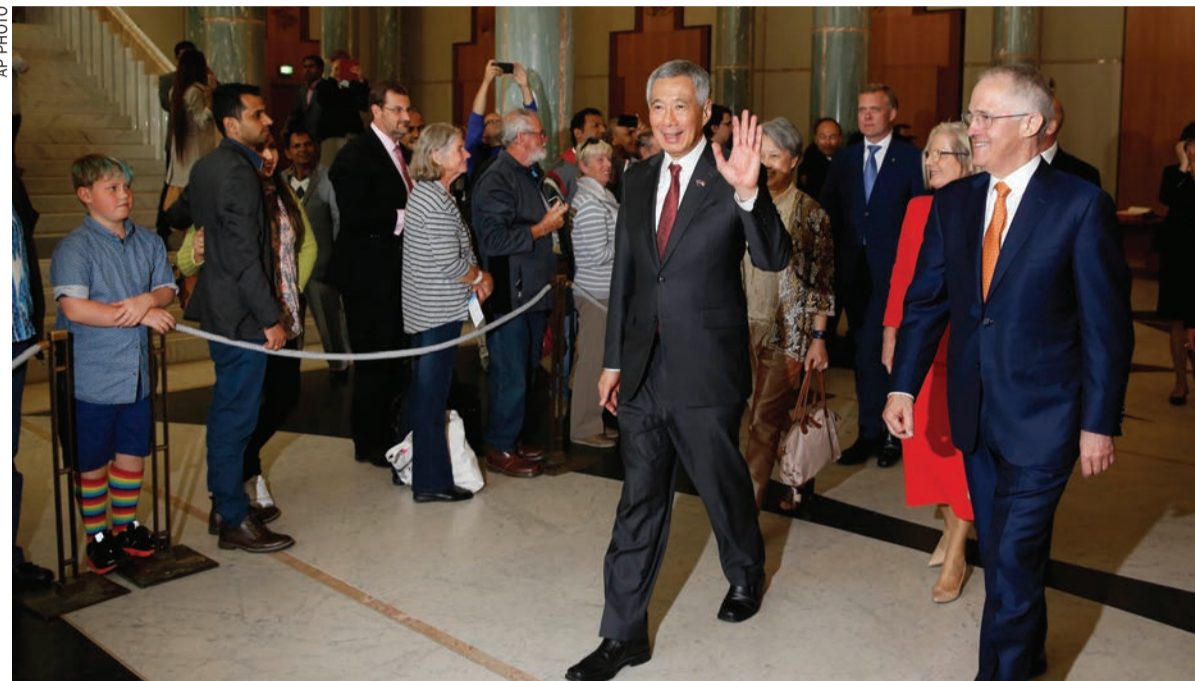
Singapore's Prime Minister Lee Hsien Loong (center), leaves Australian Parliament House in Canberra

Australian Prime Minister Malcolm Turnbull said he agreed with Lee and his view that the U.S. military presence in the Asia-Pacific region had underpinned the region's stability and prosperity for the past