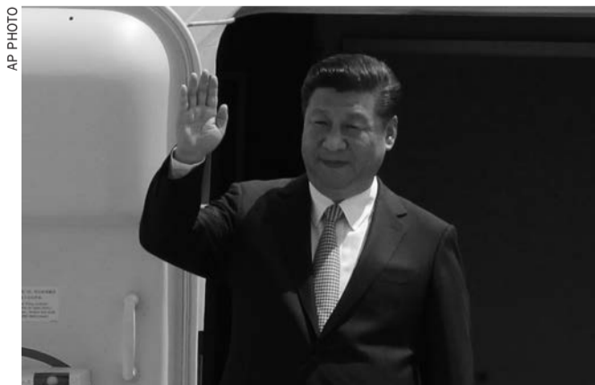
Chinese president Xi Jinping waves from a plane during the arrival at Phnom Penh International Airport

"China and Cambodia are devoted friends. On issues concerning each other's core interests and major concerns, our two countries have stood together and supported each other," he wrote. AP