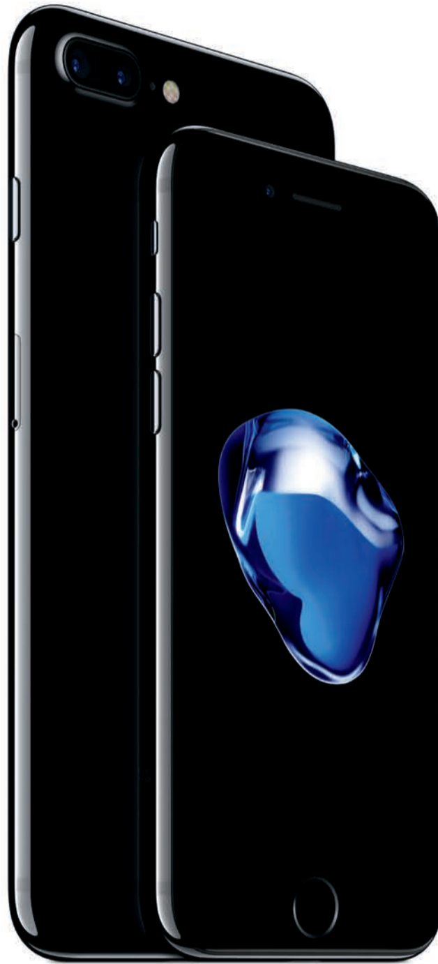
Apple iPhone 7

Advanced new camera systems. The best performance and battery life in an iPhone. Immersive stereo sound. The brightest, most colorful iPhone display. And splash and water resistant.* iPhone 7 dramatically improves the most important aspects of the iPhone experience.