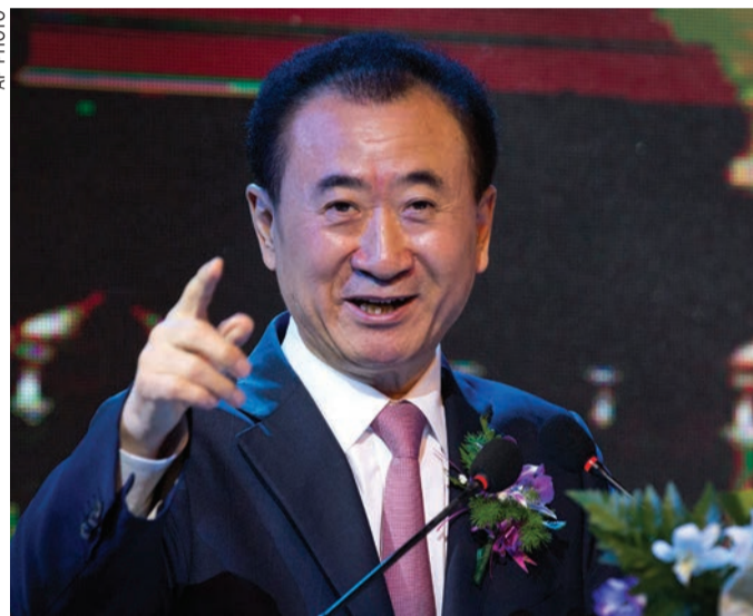
Wang Jianlin, chairman of Wanda Group