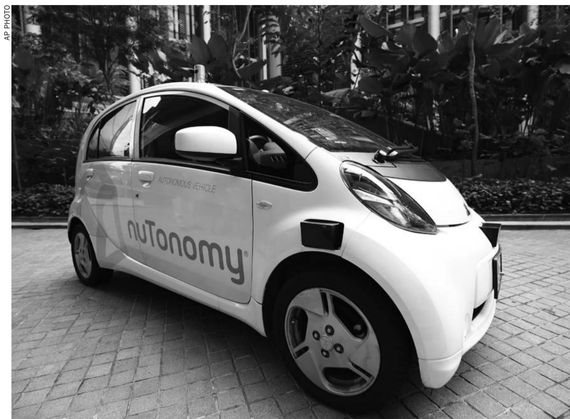
An autonomous vehicle undergoes a test drive in Singapore

The company's six cars - modified Renault Zoe and Mitsubishi i-MiEV electrics - have a safety driver in front who is prepared to take the wheel if necessary and a researcher