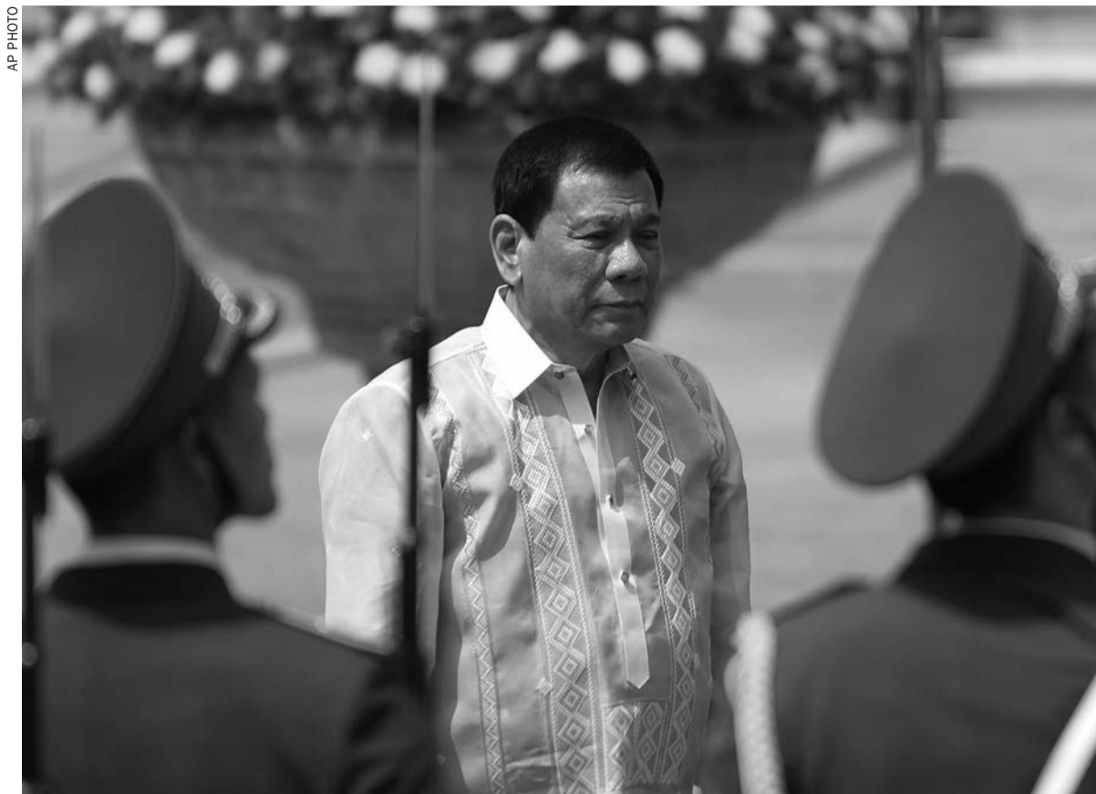
Philippine President Rodrigo Duterte