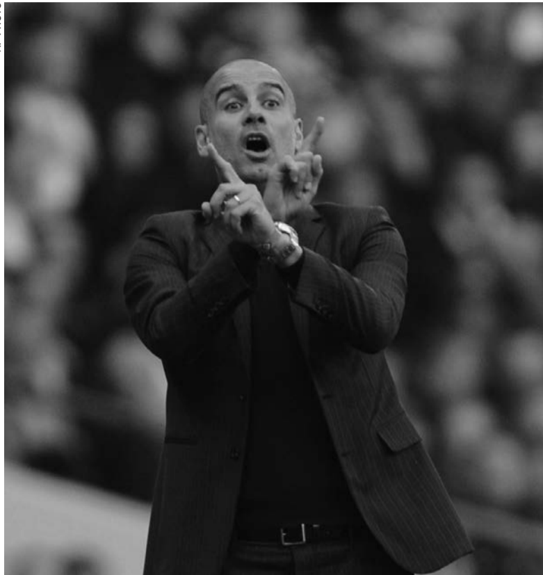
Manchester City manager Josep Guardiola

fender John Stones and winger Leroy Sane.