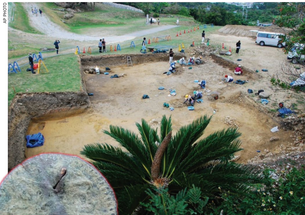
Excavation site where 10 coins including a few likely dating to the Roman Empire were found