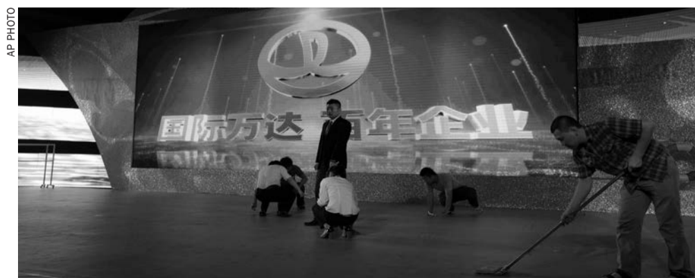
Chinese workers prepare the stage ahead of a ceremony for Dalian Wanda Group at a hotel in Beijing

The 408-acre Qingdao Movie Metropolis is due to open in the port city in August 2018. Not just a movie studio, it is slated to include four indoor theme parks and even international schools to encourage foreign filmmakers to live there