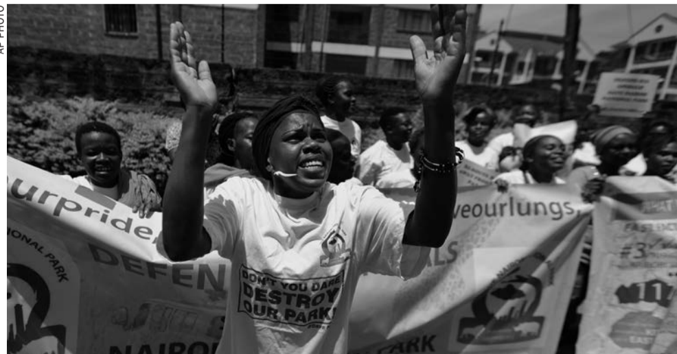
Environmental and wildlife campaigners gather to march to the Chinese embassy in the capital Nairobi

He said there are six other routes that are viable. AP