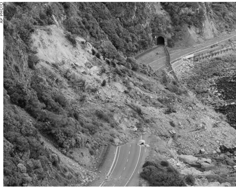
A landslide blocks State Highway One and the main trunk railway line north of Kaikoura