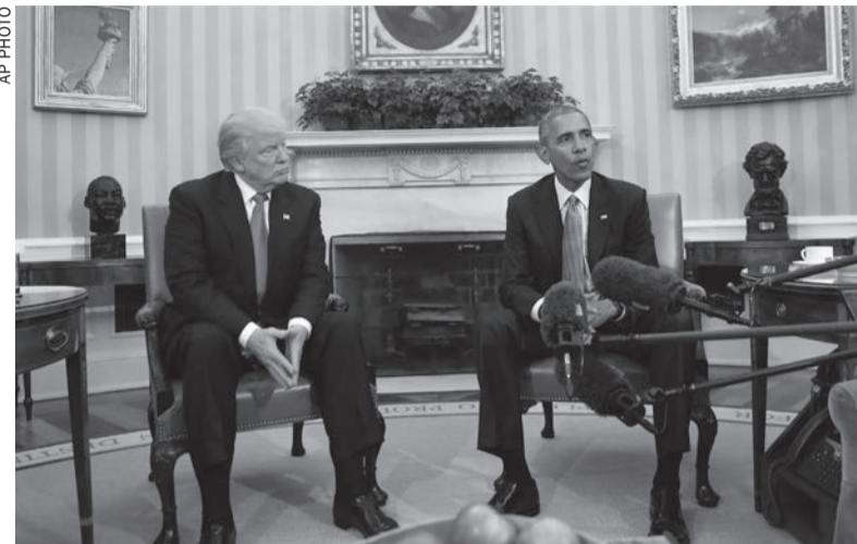
President Barack Obama meets with President-elect Donald Trump in the Oval Office

issues in Europe, Asia and the Mideast. And during a visit to Japan, Obama said he wasn't the only world leader worried about Trump.