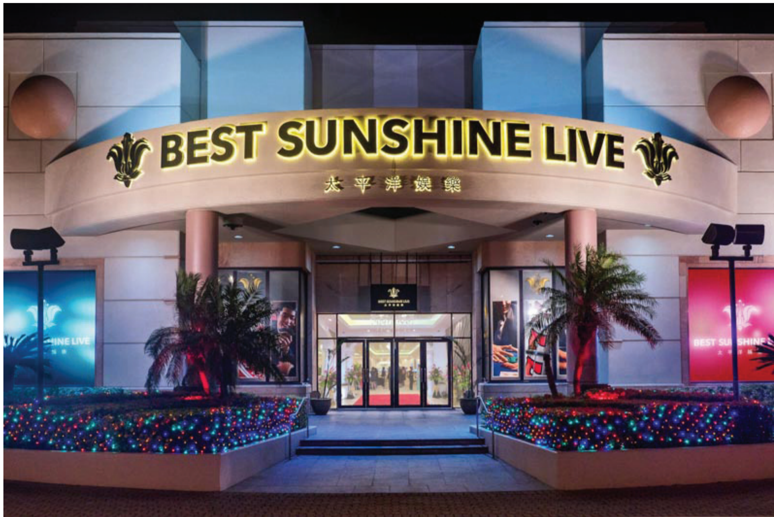
The awkwardly named Best Sunshine Live

of power is a dramatic change for Imperial Pacific, which is controlled by a mother-and-son duo from mainland China and for most of its existence was called First Natural Foods. In 2013 it recorded gross profit of just $1.25 million. The following year it embarked upon an unusual metamorphosis, announcing it would move from frozen food into the greater opportunities of gambling by paying $30 million to apply for a casino license on Saipan, the capital of the U.S. Commonwealth of the Northern Mariana Islands.