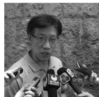
Au Kam San

L AWMAKER Au Kam San pointed out that Macau is more advanced in terms of its Legislative Assembly (AL) and Chief Executive (CE) elections than neighboring regions. He thus argued that it is feasible to adopt genuine universal suffrage for elections of both the AL and CE.