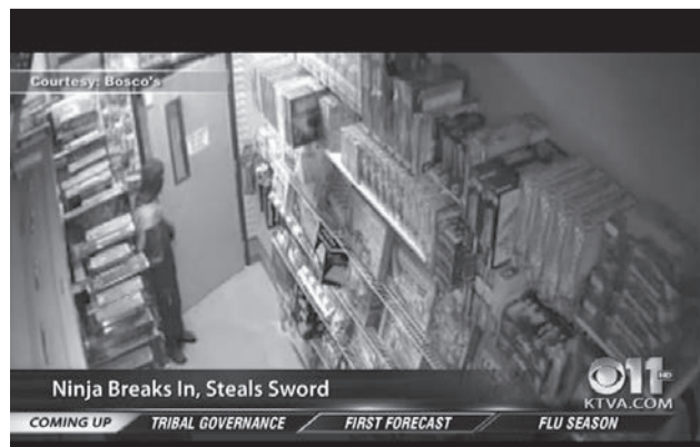
Ninja Breaks In, Steals Sword

Anyone with information is asked to call police.