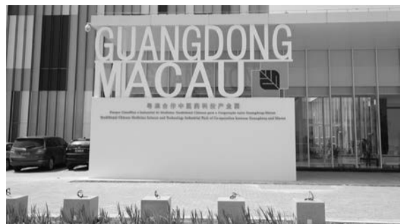
Guangdong-Macau Industrial Cooperation Park

T HE government will recommend another 50 investment projects for the Guangdong-Macau Industrial Cooperation Park in Hengqin to the Board of the New Hengqin Zone, which were received during the application period, according to the Macau Institute for Trade and Investment Promotion (IPIM).