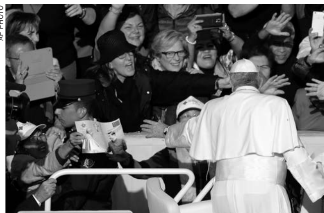
A worshipper presents Pope Francis with a photomontage of an imagined meeting between the pope and Chinese President Xi Jinping

tholic Church holds abortion to be such a serious sin, it had long put the matter of granting forgiveness for it in the hands of a bishop,