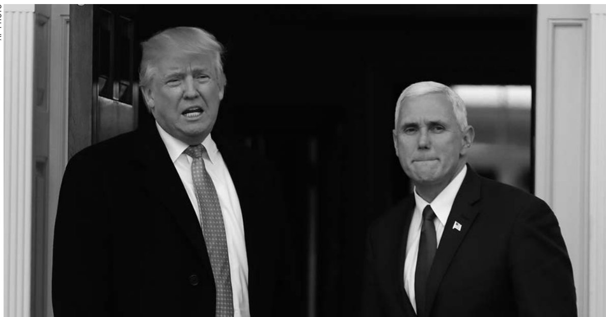
President-elect Donald Trump (left), talks to media alongside Vice President-elect Mike Pence

Night Live,” the hit musical “Hamilton,” and retiring Democratic leader Harry Reid, he wrote that, “General James ‘Mad Dog’ Mattis, who is being considered for secretary of defense, was very impressive yesterday. A true General’s General!”