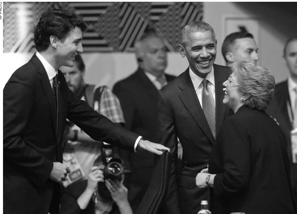
U.S. President Barack Obama (center), shares a laugh with Canada's Prime Minister Justin Trudeau (left), and Chile's President Michelle Bachelet at the opening session of the Asia-Pacific Economic Cooperation (APEC) summit in Lima

Referring to Britain’s vote to leave the European Union and Trump’s election win in the U.S., he said those results highlighted the backlash against globalization in former industrial regions in the U.S. and Britain that contrasts with support for trade in more-prosperous urban areas and developing countries.