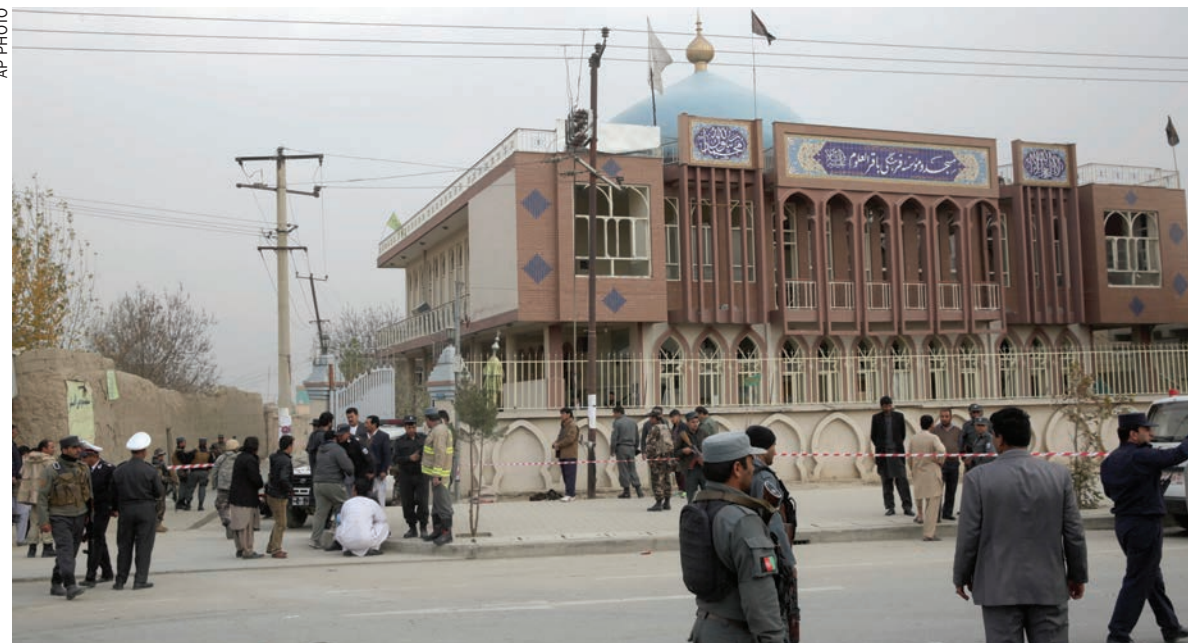
Afghan security forces and civilians walk around the Shiite Baqir-ul Ulom mosque in Kabul after a suicide attack inside it

No group has yet claimed responsibility but militant Sunni fundamentalists like the Taliban and the Islamic State group view Shiites as apostates and frequently attack Shiite mos-