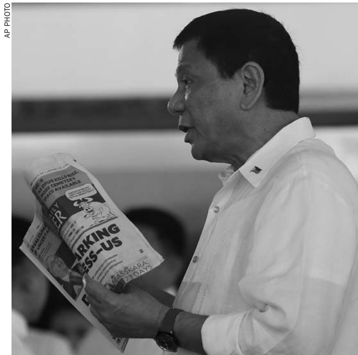
Philippine President Rodrigo Duterte

Xi did not say whether he agreed to Duterte's plan in