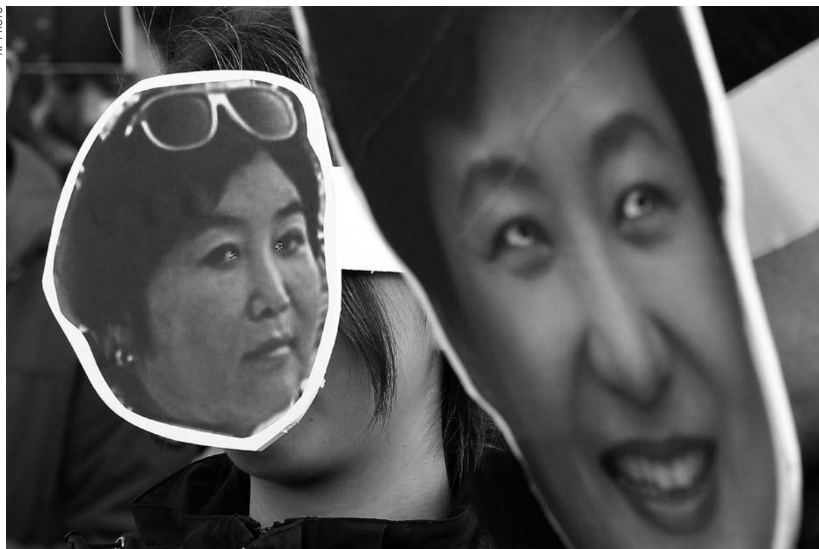
South Korean protesters wearing masks of South Korean President Park Geun-hye (right), and Choi Soon-sil