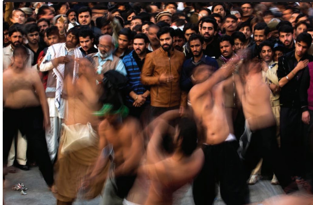
Pakistan. Shiite Muslims beat themselves with knives in chains to mourn, during a procession to mark the end of the forty-day mourning period following the anniversary of the 7th century martyrdom of Imam Hussein, in Rawalpindi, yesterday.