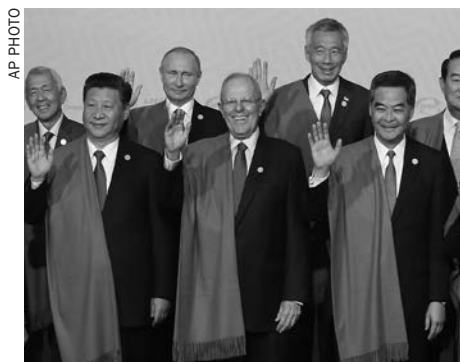
Xi Jinping (front left) with other world leaders at APEC Summit, in Peru

Xi has not publicly commented on the controversy and the official Xinhua News Agency quoted him only as telling Leung that Beijing "fully acknowledges" the work of his government, while urging him to "resolutely safeguard national unity and maintain social and political