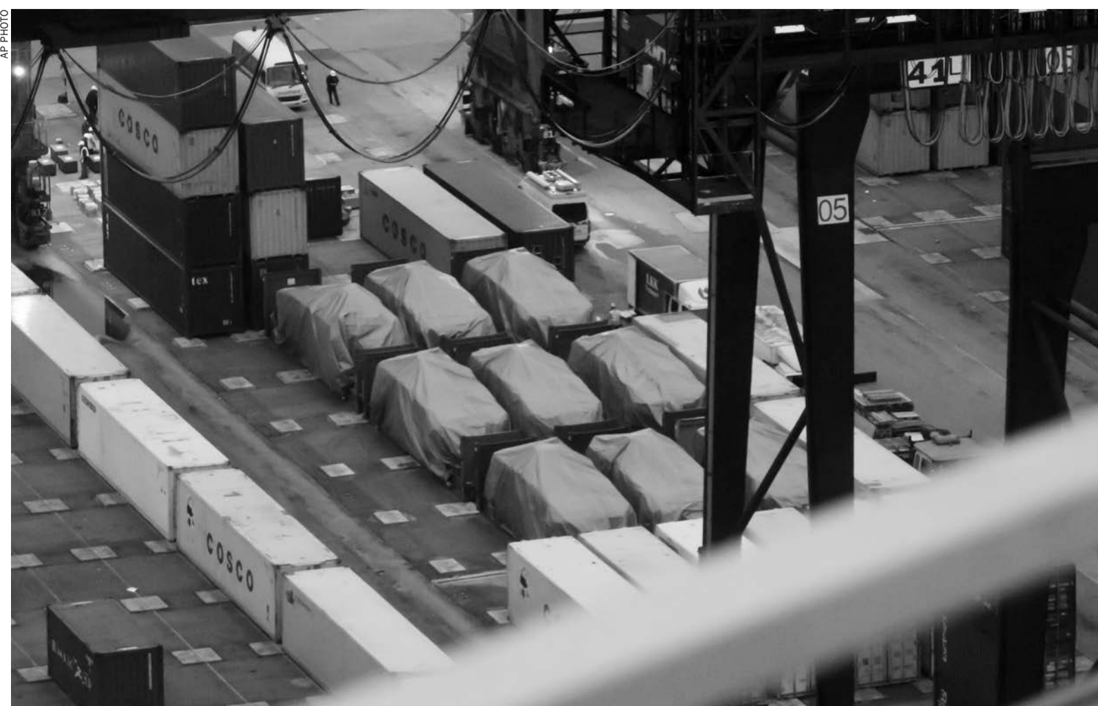
Nine eight-wheeled Singapore-made Terrex infantry carrier vehicles seized at a container terminal in Hong Kong.