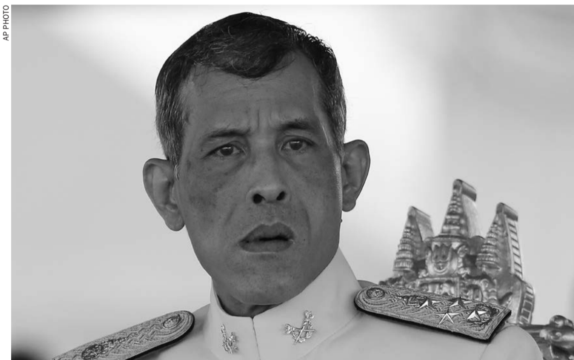
In this May 9, 2016, photo, Thailand's Crown Prince Vajiralongkorn is seated at the royal plowing ceremony in Bangkok