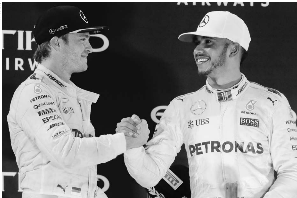
Nico Rosberg (left), cheers his teammate Mercedes driver Lewis Hamilton on the podium in Abu Dhabi

title-winning campaign was a steely resolve under Hamilton’s pressure, allied to high levels of consistency.