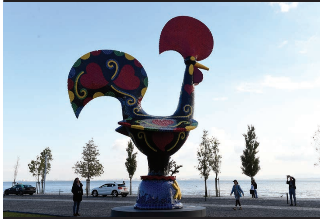
An installation artwork of a traditional Portuguese rooster in Lisbon, Portugal. Made of traditional black, red and yellow colors and equipped with 16,000 LED lights about 10 meters high and weighs about 3.5 tons, it attracts many visitors. The art work was created by renowned Portuguese artist Joana Vasconcelos and is on display in the center of Lisbon until the end of this month before it will be ferried to Beijing and Shanghai of China to celebrate the advent of lunar Chinese new year of the Rooster. In 2015, Ms Vasconcelos created an installation titled "Valkyrie Octopus," which was on display at the MGM Macau's Grande Praça for several months.