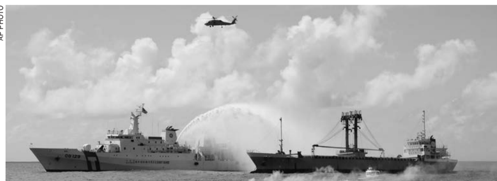
A Taiwan Coast Guard ship (left), and cargo ship take part in a search-and-rescue exercise off of Taiping island in the South China Sea

Eight vessels and three aircraft took part in the drill simulating a fire aboard a cargo ship that forced crew members to seek safety on Taiping in the Spratly island group.