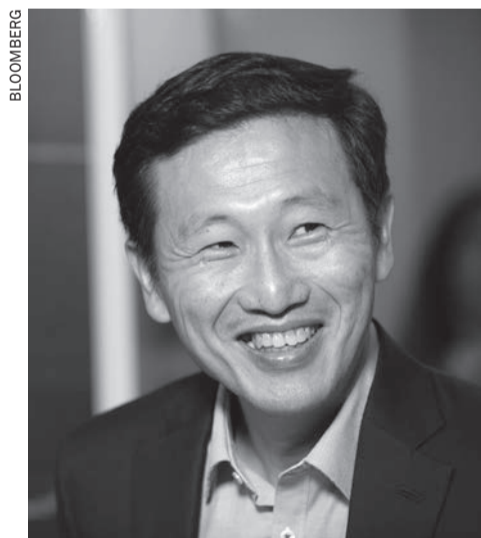
Ong Ye Kung

Going further than earlier trade deals, the TPP seeks to lower non-tariff bar-