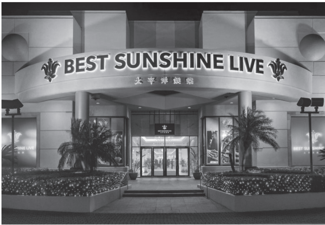
Imperial Pacific's Best Sunshine Live casino