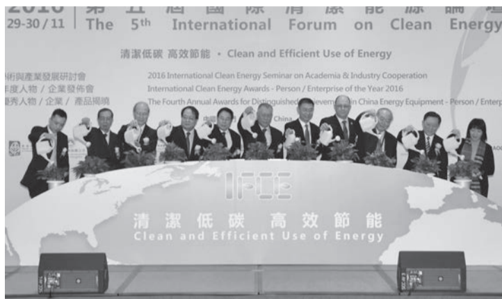
Officiating guests and delegates at the 5th International Forum on Clean Energy