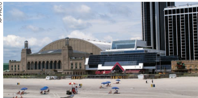
Boardwalk Hall (left) in Atlantic City