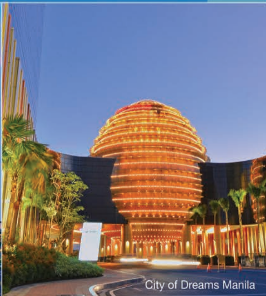
City of Dreams Manila