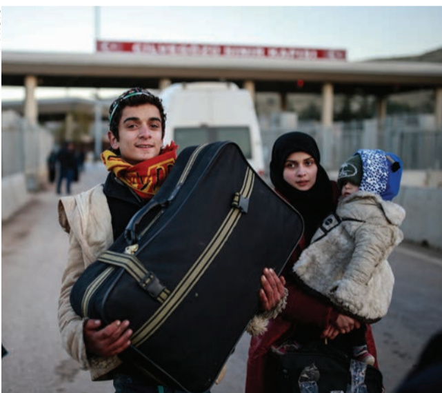
Syrian family carry their belongings after they crossed into Turkey

have so far been evacuated from the besieged city to an area under opposition control.