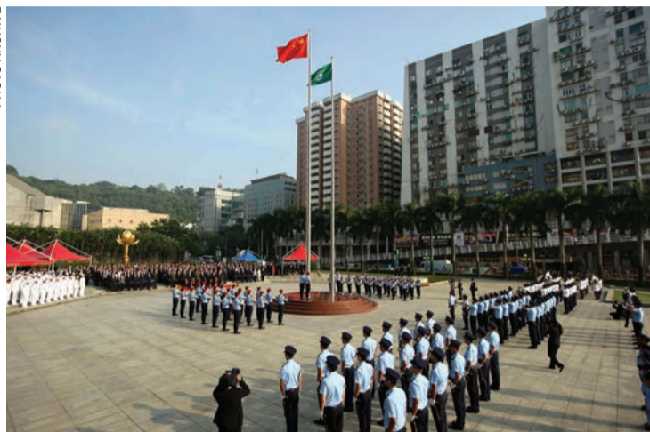
The Golden Lotus Square, Macau

Taipa, at 2 p.m. Macau Post is offering to the public a commemorative postmarking service. It will be located at a temporary counter at Macau Post's Senado Square headquarters in the city center. The franking service is available from 9 a.m. to 5.30 p.m. today.