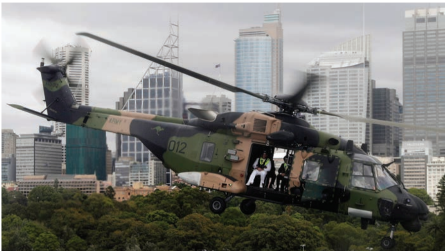
Australian Army helicopter flies French Defense Minister Jean-Yves Le Drian

Fears were raised in August that India's Scorpene subs could be compromised by the leak of sensitive data from DCNS. The Australian newspaper reported that the information was suspected to have been taken in 2011 by a DCNS subcontractor.