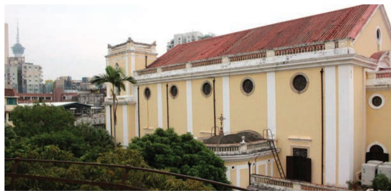
Simbang Gabi is mostly held at St Lawrence Church (pictured)

In St Joseph Seminary Chapel, the novena masses started on December 15 at 8.30 p.m. and will continue until this Friday.