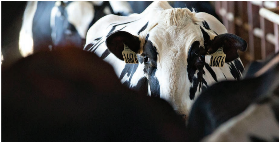
Dairy cows stand in barns at the Lake Breeze Dairy farm in Malone, Wisconsin, U.S