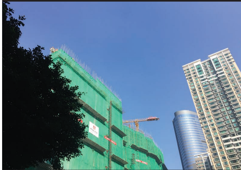
Odd blue. An unusual bright day in Taipa, blessed us yesterday with the rare sight of a navy-blue sky.