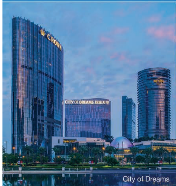
City of Dreams