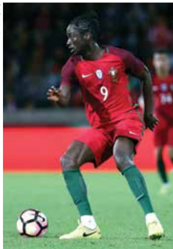
Eder scored the sole goal in the final of the European Championship

Young midfielder Sanches was talked about at that tournament as a possible heir to Ronaldo and subsequently earned a high-profile transfer from Benfica to Bayern Munich, where he hasn't featured regularly. Sanches was ins-