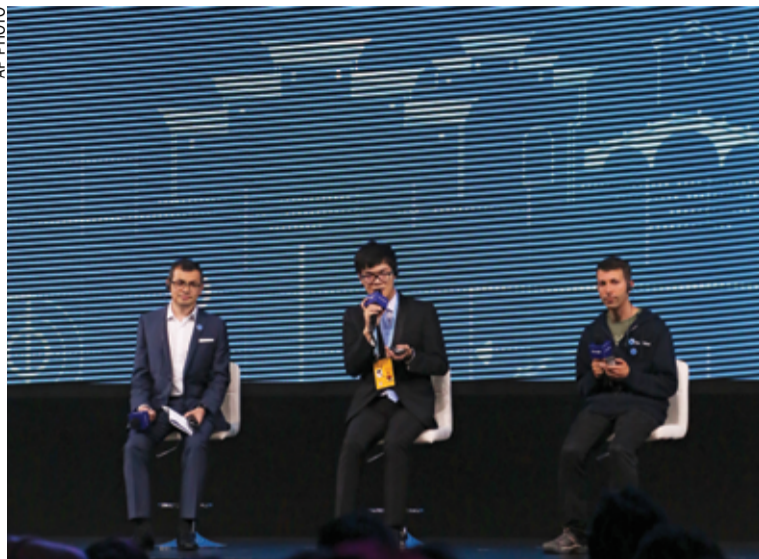
Go player Ke Jie (center) speaks at a press conference after a match against Google's AI program, AlphaGo