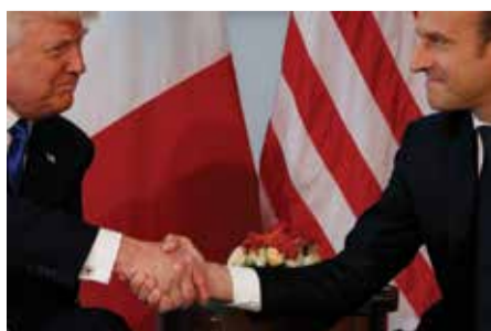
bed himself as "a germ freak" and called handshakes "barbaric."

U .S. President Donald Trump met his match in a handshake showdown with France's new president, Emmanuel Macron. At their first meeting, ahead of a NATO summit in Brussels, the two men locked hands for so long that knuckles started turning white. Trump finally seemed ready to pull away — but Macron evidently wasn't. The French leader held the shake for a few seconds more. Both men's jaws seemed to clench. Trump has descri-