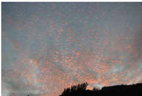
The sky seen from Cheoc Van Beach, Macau