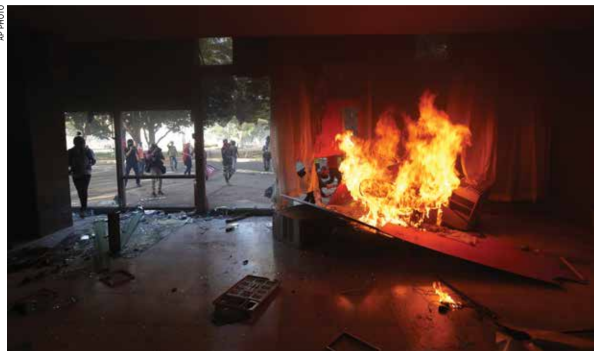
Demonstrators torch the Ministry of Agriculture during an anti-government protest in Brasilia

The troops were deployed early yesterday [Macau time] following a day of clashes between police and protesters demanding Temer's ouster amid allegations against him of corruption. Fires broke out in two ministries and several were evacuated. Protesters also set fires in the streets and vandalized government buildings. Images in national media, meanwhile, appeared to show police officers firing weapons, and the Secretariat of Public Security said it