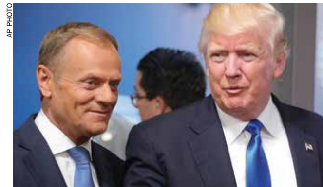
The Donalds: Tusk (left) and Trump

British officials are particularly angry that photos detailing evidence about the bomb used in the Manchester attack were published in The New