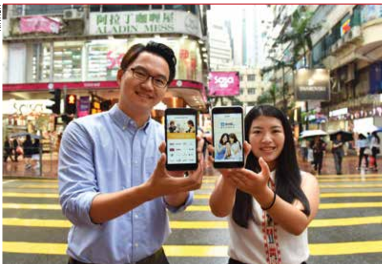
Staff workers show AlipayHK in Hong Kong. The online and mobile payment platform Alipay announced on Wednesday that it would launch AlipayHK, a version dedicated to local-currency payments in Hong Kong. AlipayHK is the first version of the Alipay app to handle non-renminbi transactions.