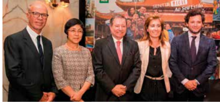
APAVT president (center) with the MGTO director, the Portuguese Secretary of State for Tourism (right), the President of Portugal Tourism Board and the coordinator of Macau Tourism Promotion & Information Center in Portugal