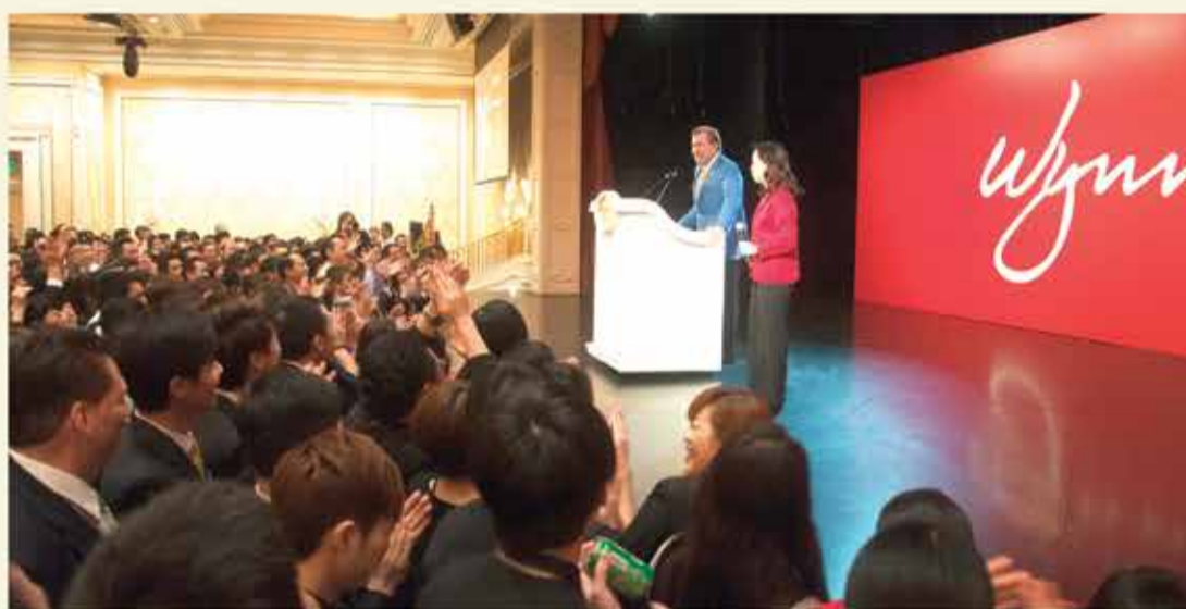
Wynn Macau announced the launch of its Employee Ownership Scheme in 2014