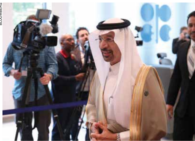
Khalid Bin Abdulaziz Al-Falih, Saudi Arabia's energy minister (center)

The extension prolongs a rare period of collaboration between OPEC and some of its largest rivals, including Russia. The last time both sides worked together was 15 years ago, and the agreement fell apart soon after it began. The current accord encompasses countries that pump roughly 60 percent of the world's oil, but excludes major producers such as the U.S., China,