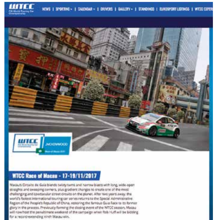
A screenshot of the WTCC website