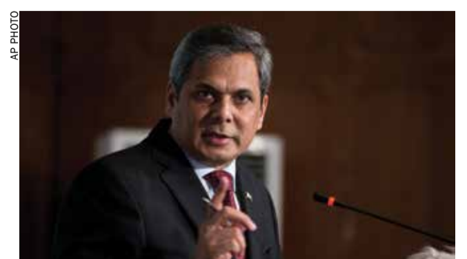
Pakistan's Foreign Ministry spokesman Nafees Zakaria briefs media at the Foreign Office in Islamabad

Gunmen attacked a highway construction site that is part of the economic initiative earlier this month, killing at least 10 Pakistani workers.