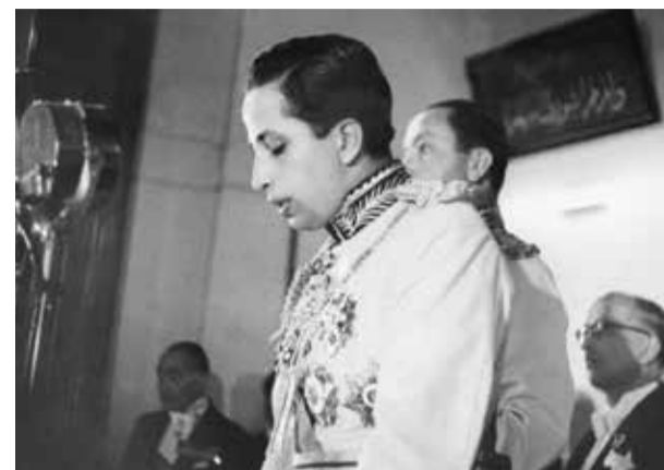
Faisal II of Iraq, aged 18, taking his oath of office before parliament in 1953