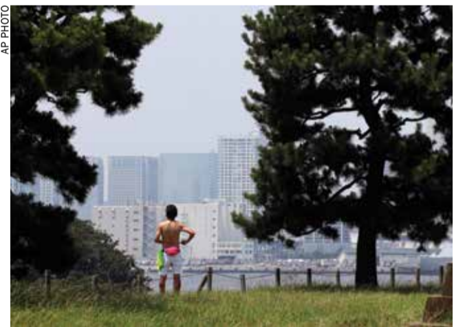
A man stands shirtless at a park of Daiba Bay area in Tokyo

The research institute has nearly 100 experts from Guangdong, Beijing, Shanghai, Hong Kong and Macau, and it is expected to provide intellectual support to the Greater Bay