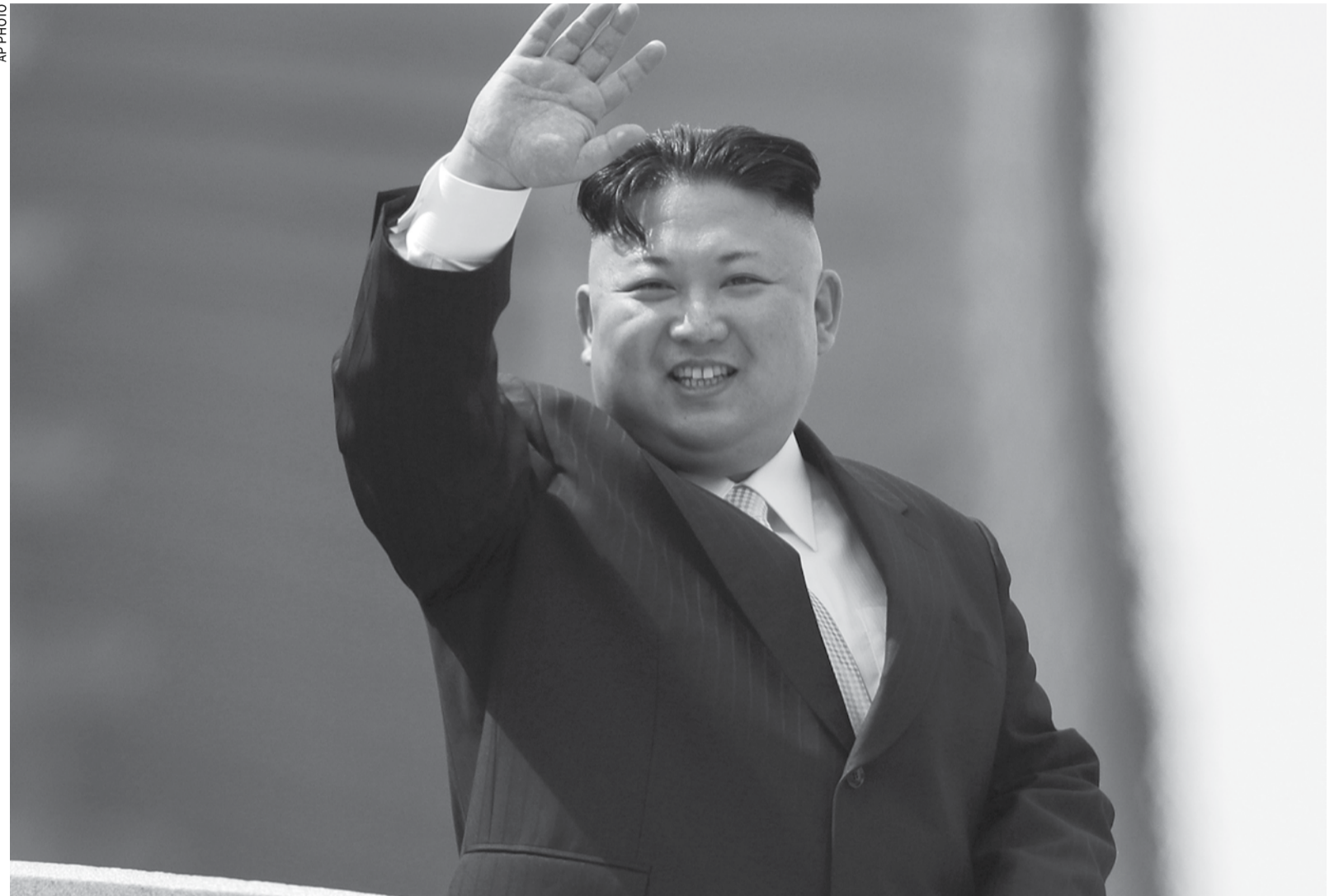
North Korean leader Kim Jong Un waves during a military parade to celebrate the 105th birth anniversary of Kim Il Sung in Pyongyang

North Korea's small yet gradual economic growth in recent years has also allowed Kim to focus on furthering his nuclear ambitions. His father, by comparison, resorted to outside handouts to feed many of his 24 million people after a devastating famine in the mid-1990s killed tens of thousands.