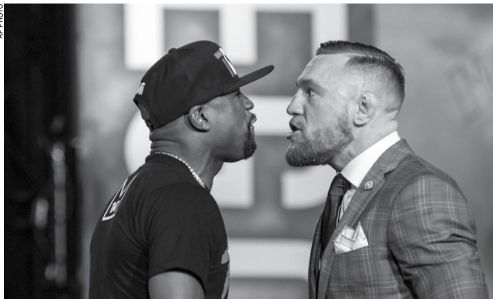
Floyd Mayweather (left) and Conor McGregor exchange harsh words during a promotional stop in Toronto

UFC star Conor McGregor played to a partisan Toronto audience and made fun of boxer Floyd Mayweather Jr.'s tax problems at the second stop of their four-city promotional tour.