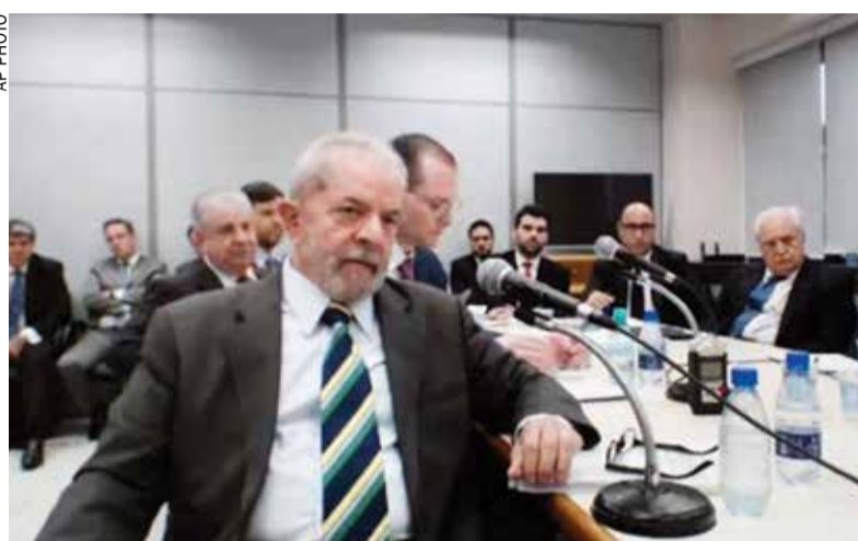
Brazil's former President Luiz Inacio Lula da Silva testifying in the Car Wash investigation in Curitiba

The probe initially focused on members of Silva's Workers' Party, but it has since brought