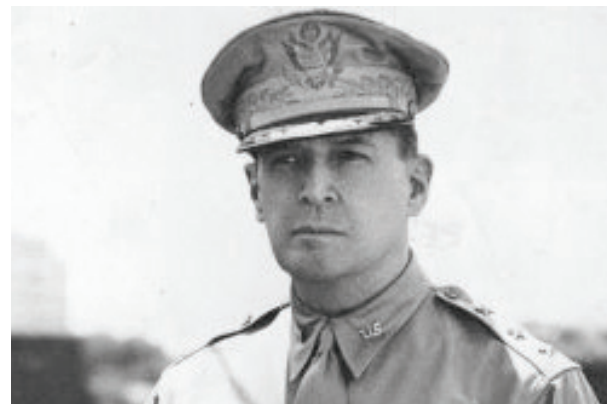
General Douglas MacArthur