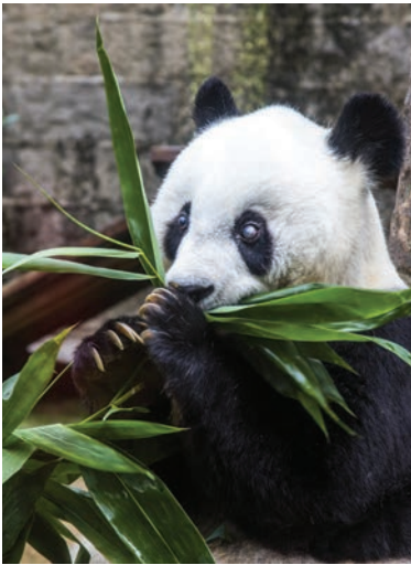
Basi, the giant panda, at the Fuzhou Giant Panda Research Center in Fuzhou (2015)