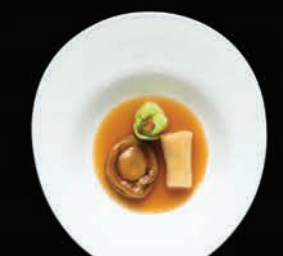
ZI YAT HEEN