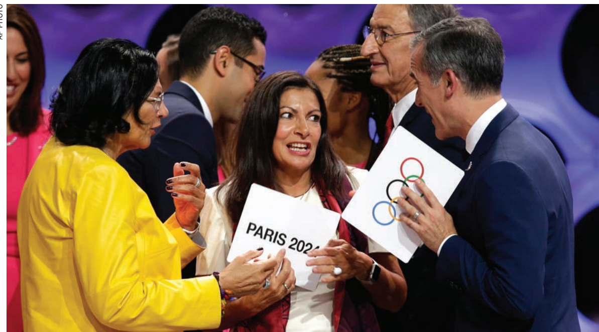
Paris Mayor Anne Hidalgo (center) speaks with Los Angeles Mayor Eric Garrett (right)

the 100th anniversary of its last turn. That milestone, plus the fact that Paris has been on the losing end of these bids for 1992, 2008 and 2012, would have made the French capital the sentimental favorite had only 2024 been up for grabs.