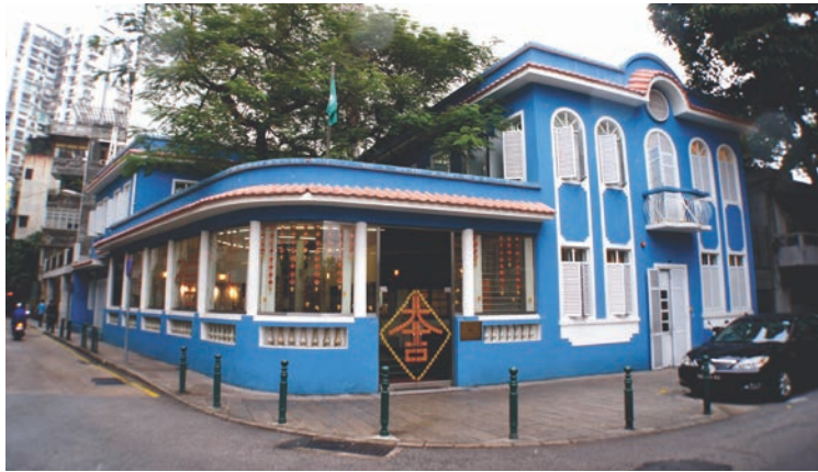
The Social Affairs Bureau headquarters

According to Yin's study, the government's public expenditure on medical care, social security and education have increased in past years.