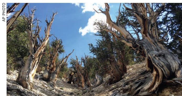
Gnarled bristlecone pine trees in the White Mountains in east of Bishop, California

Forests of the diminutive bristlecone pines are found in eastern California, Nevada and Utah. They thrive in desolate limestone soil that is inhospitable to most trees.