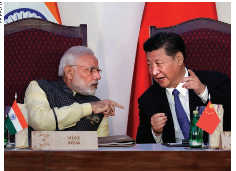
Narendra Modi (left) and Xi Jinping at a BRICS summit