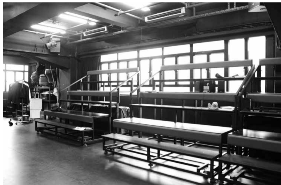
Some local theater troupes have its headquarters based in industrial buildings

T HE Legal Affairs Bureau (DSAL)'s latest proposal suggests that theaters and cinemas should only be permitted to operate in hotels or licensed commercial places. The suggestion has been met with fierce opposition from the art sector.