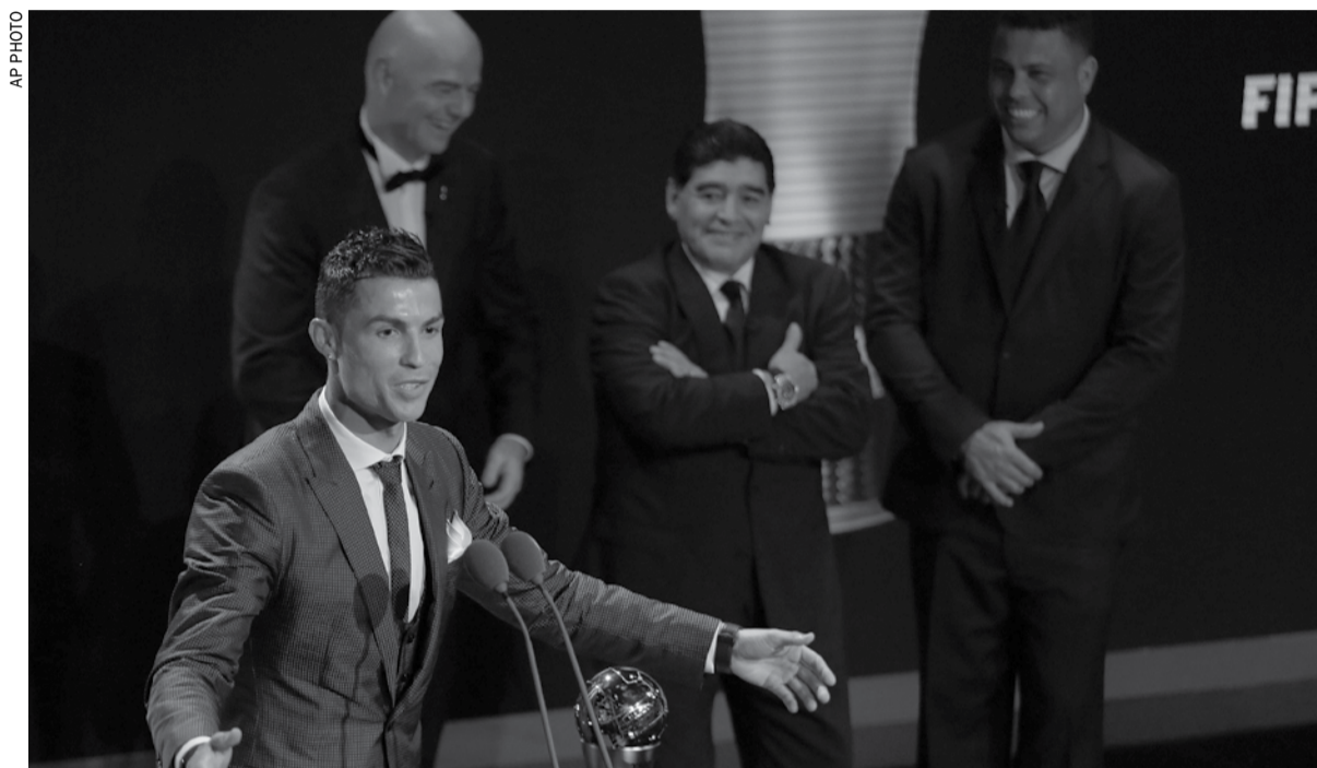
Soccer legends Diego Armando Maradona (rear center) Ronaldo (right) FIFA president Gianni Infantino (left) present the Best FIFA Men's player award to Cristiano Ronaldo

countries participated in the vote organized by world player's union FIFPro.