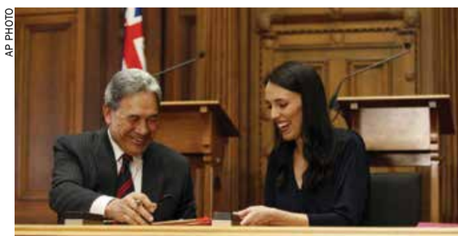
New Zealand First leader Winston Peters, (left) and Prime Minister-designate Jacinda Ardern sign a coalition agreement

Ardern also outlined a plan to spend 1 billion New Zealand dollars ($693 million) a year on the country's smaller towns and regions to improve rail and other infrastructure.