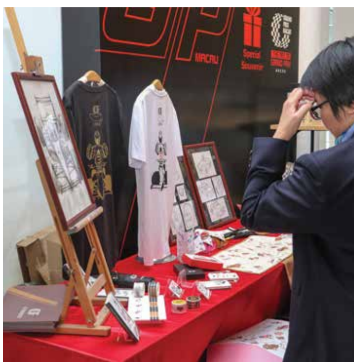
GP merchandise showcase