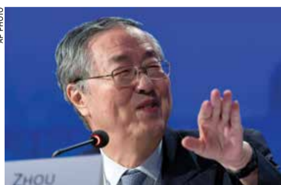
People's Bank of China Governor Zhou Xiaochuan

has propelled debt to the equivalent of 270 percent of annual economic output.