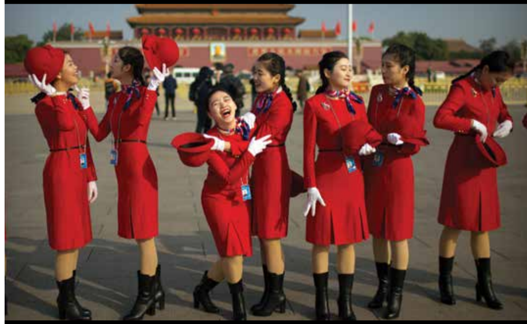
Red tape. Hospitality staff members laugh as they stand on Tiananmen Square before the closing ceremony of China's 19th Party Congress at the Great Hall of the People in Beijing yesterday.