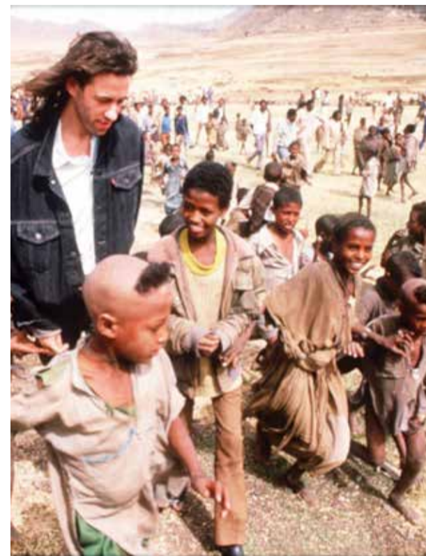
Singer and Live Aid organizer Bob Geldof visits Ethiopia during the 1984 famine