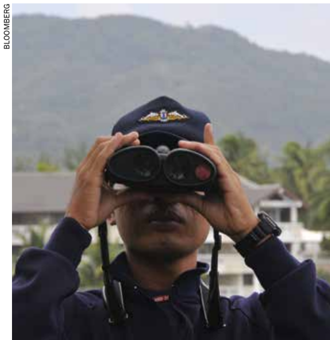
A member of the Royal Thai Navy stands guard at the conference hotel of the Asean summit in Phuket

"There will be five," Hishammuddin told reporters on the sidelines of Asean defense ministers meeting. "That is the way forward for Asean if we want to make sure that this region remains relevant in facing the challenges and not allow anybody to divide us." Bloomberg