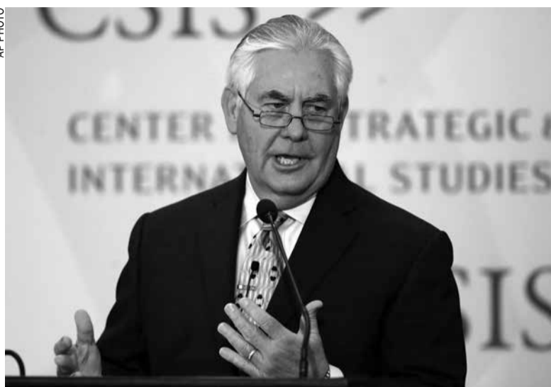
Secretary of State Rex Tillerson

gents on security forces in late August triggered what human rights groups have called a scorched-earth campaign against Rohingya villages. Amnesty International has reported that hundreds of Rohingya men, women and children have been systematically killed.