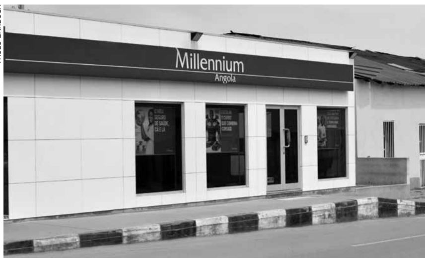
A bank branch in Malanje, Angola

The study reported that the weight of deposits in Angolan currency maintained the growth trend, to the detriment of foreign currency, now