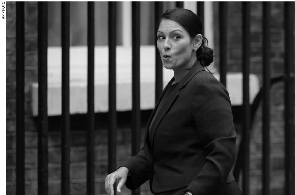
Britain's Secretary of State for International Development Priti Patel

Israel's Haaretz newspaper reported yesterday that Patel visited an Israeli military field