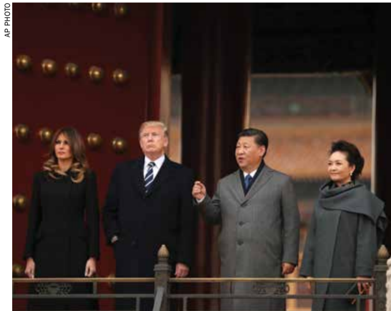
U.S. President Donald Trump, first lady Melania Trump, Chinese President Xi Jinping and his wife Peng Liyuan (right) stand together as they tour the Forbidden City

"I want to just say that President Xi — where we will be tomorrow, China — has been very