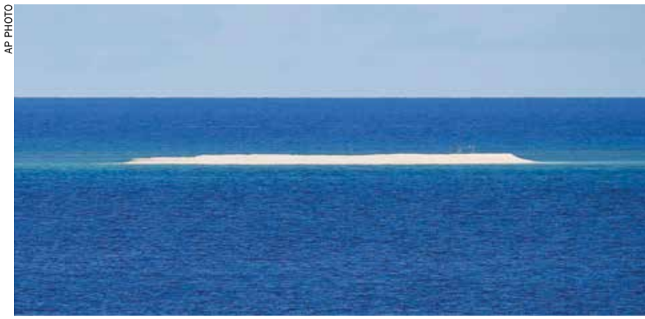
The Philippine-claimed Thitu Island off the disputed South China Sea in western Philippines

Duterte made the decision after Foreign Secretary Alan Peter Cayetano advised him of an agreement involving