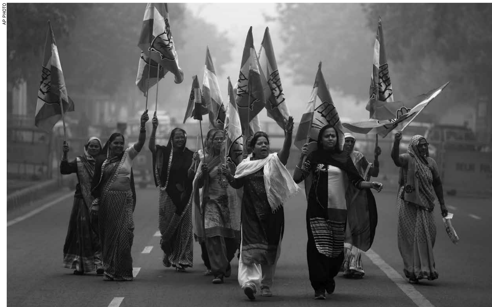
India's main opposition Congress party supporters shout slogans as they arrive to join a protest on the first anniversary of the demonetization announcement