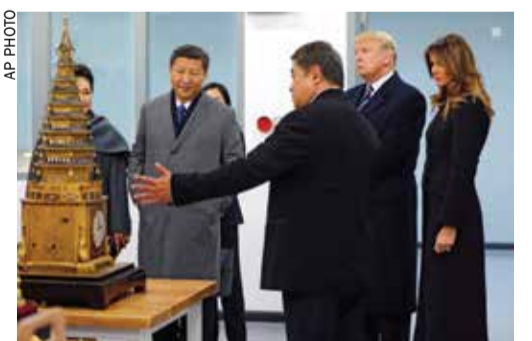
The presidential couples look at the 18th Century Clock with lifting tower as they tour the Conservation Scientific Laboratory of the Forbidden City in Beijing

The chairman of the American Chamber of Commerce in China, William Zarit, expressed hope ahead of Trump's arrival that the signing of business deals would