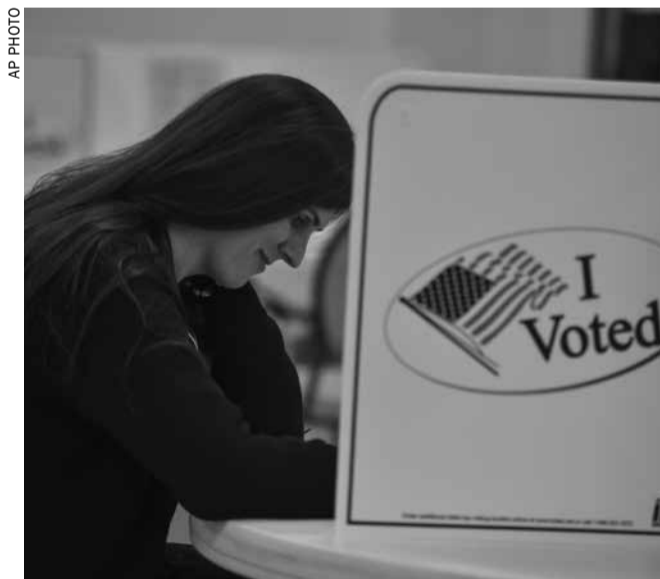
Danica Roem, who ran for the house of delegates against GOP incumbent Robert Marshall, casts her vote

Roem, who sings in a metal band in her spa-