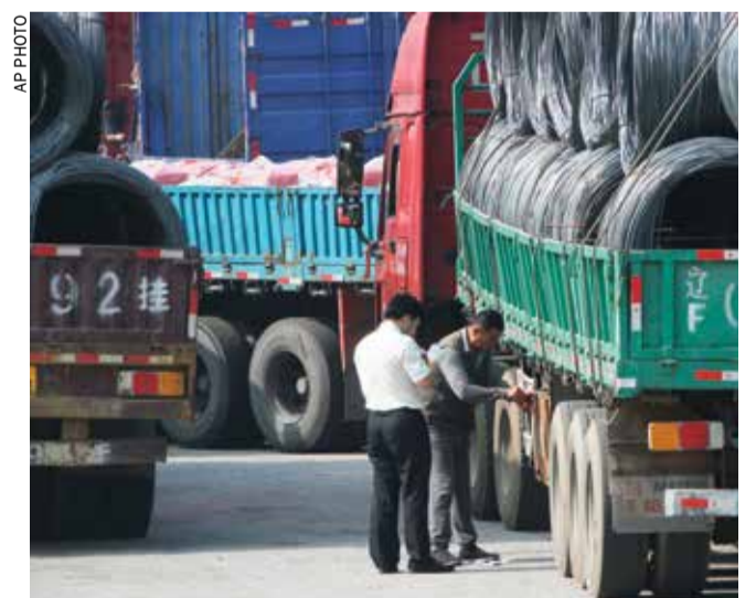
Chinese custom officials inspect trucks loaded with goods to and from North Korea in Dandong

chairman, said the bill will further restrict North Korea from developing nuclear weapons and the long-range missiles needed to deliver them.