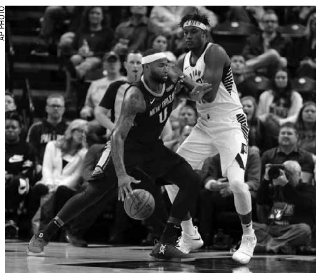
New Orleans Pelicans center DeMarcus Cousins (0) drives on Indiana Pacers center Myles Turner (33)