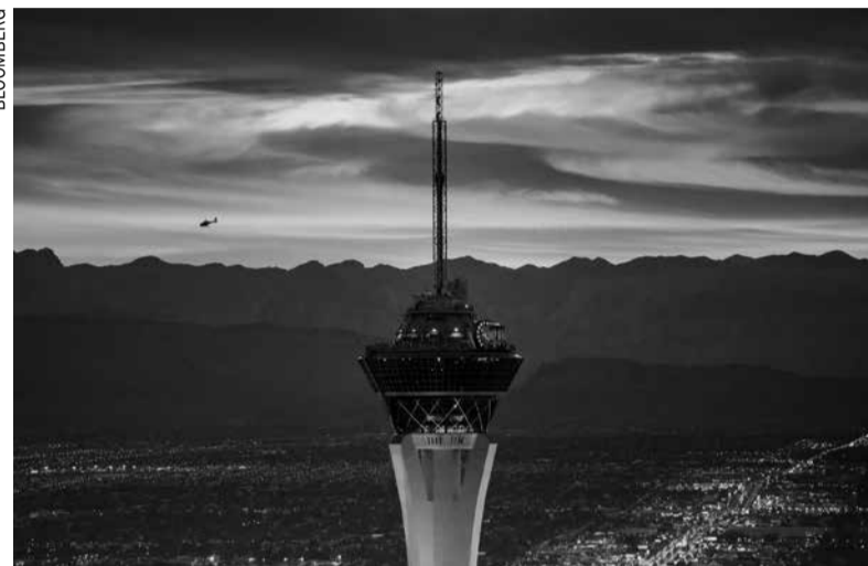
A helicopter flies past the Stratosphere Casino, Hotel &amp; Tower