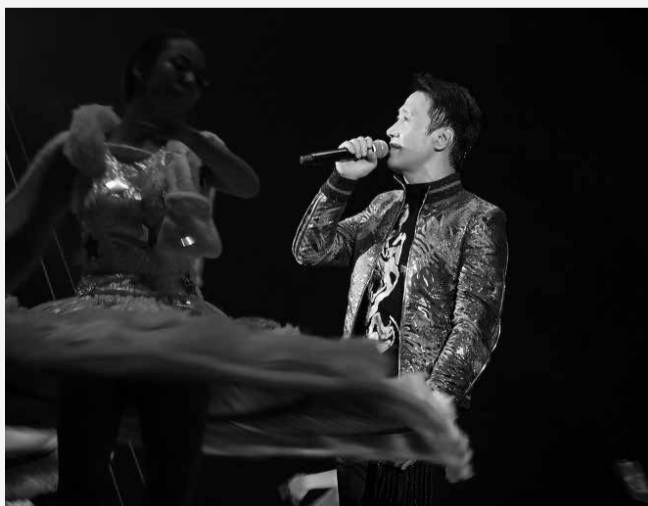
One of Hong Kong's stars, Leon Lai will be bringing his 'Leon Random