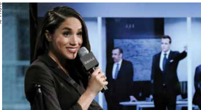
American actress Meghan Markle

“Personally, I love a great love story,” she said.