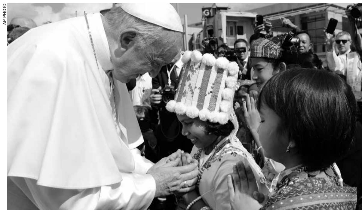
Pope Francis is greeted by young children in traditional clothes upon his arrival at Yangon's airport, Myanmar, yesterday

En route from Rome, Francis greeted journalists on the plane