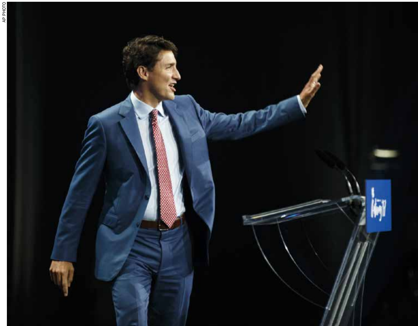
Canadian Prime Minister Justin Trudeau

Pakistan views China's push for the yuan as an infringement of its sovereignty. The reality is that this is about good risk control. Professions of brotherly love are all very well, but Beijing needs to avoid another Venezuela.