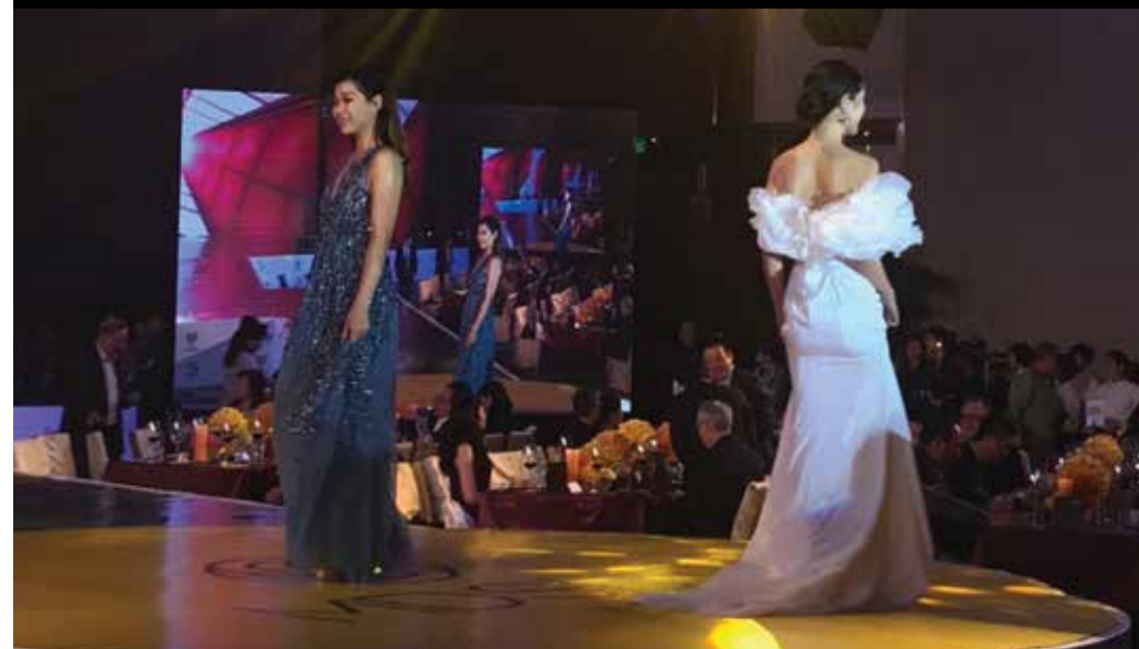
Cotai in fashion. A semi-final of the Fashion Super Model International Contest took place in Cotai this weekend. Organized by the Macau Association for the Cultural Interchange (AICM), the contest, founded in 2008, was staged in Macau for the first time ever.