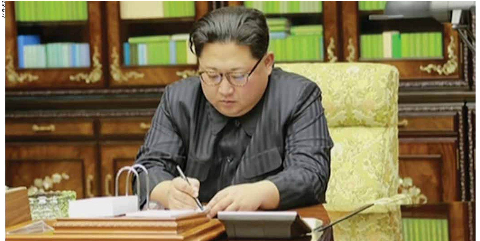
This image made from video shows an image of Kim Jong Un signing what is said to be a document on Nov. 28, 2017, authorizing a missile test