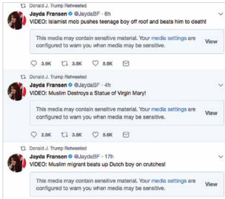
This screenshot from President Donald Trump's Twitter account shows three retweets that he posted yesterday

One of the retweeted videos from 2013 showed a radical Islamist in Egypt throwing a 9-year-old boy off a roof. The video was filmed in Egypt days after the overthrow of Islamist President Mohammed Morsi by Egypt's military. The perpetrators of the roof violence were later sentenced to death for killing the boy and another man.