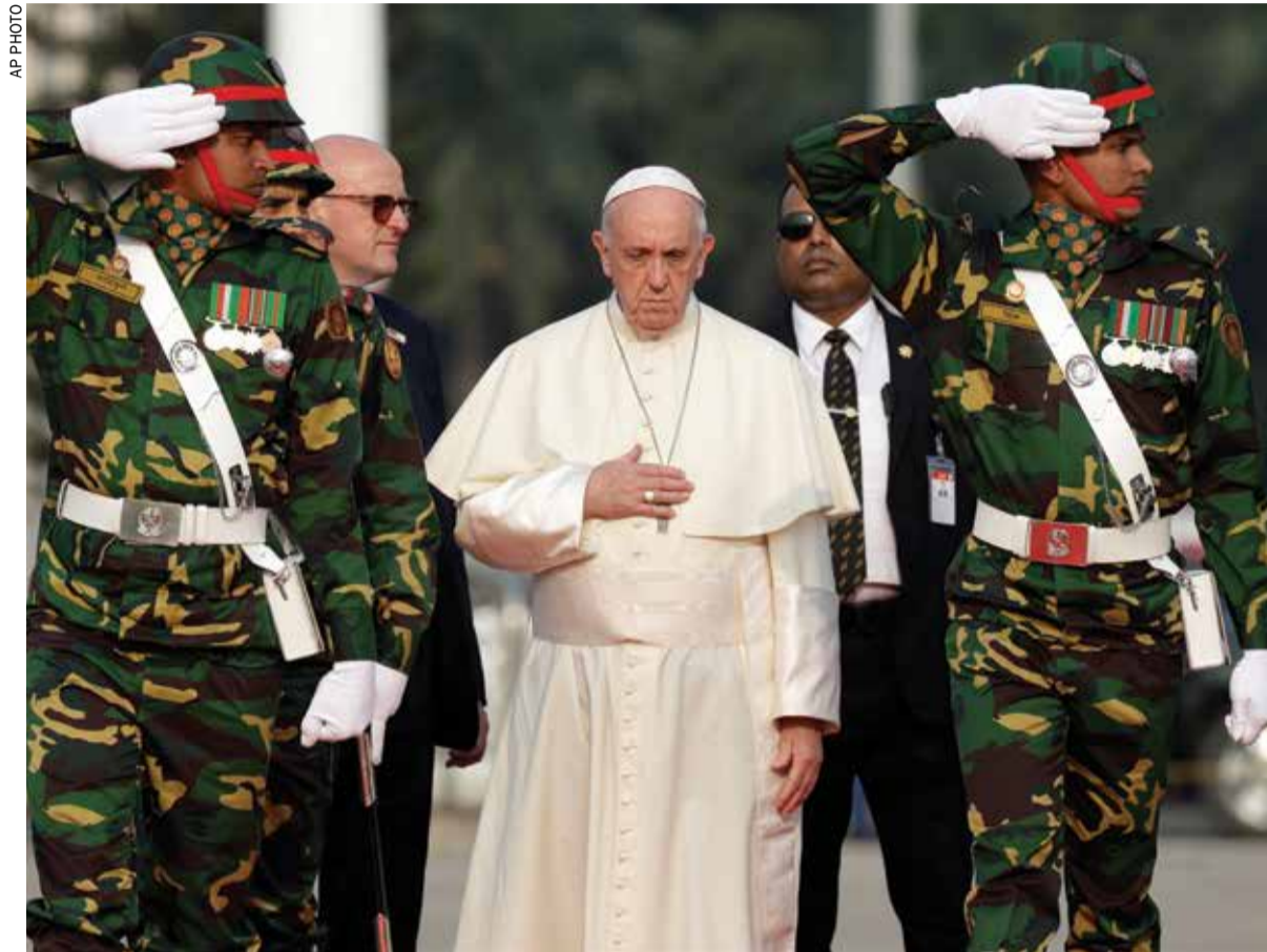
Pope Francis reviews a honor guard as he arrives at Dhaka's international airport in Bangladesh

The country's leading English-language newspaper, The Daily Star, said in an editorial it felt "slightly let down" the pope didn't mention the crisis specifically while in Myanmar.