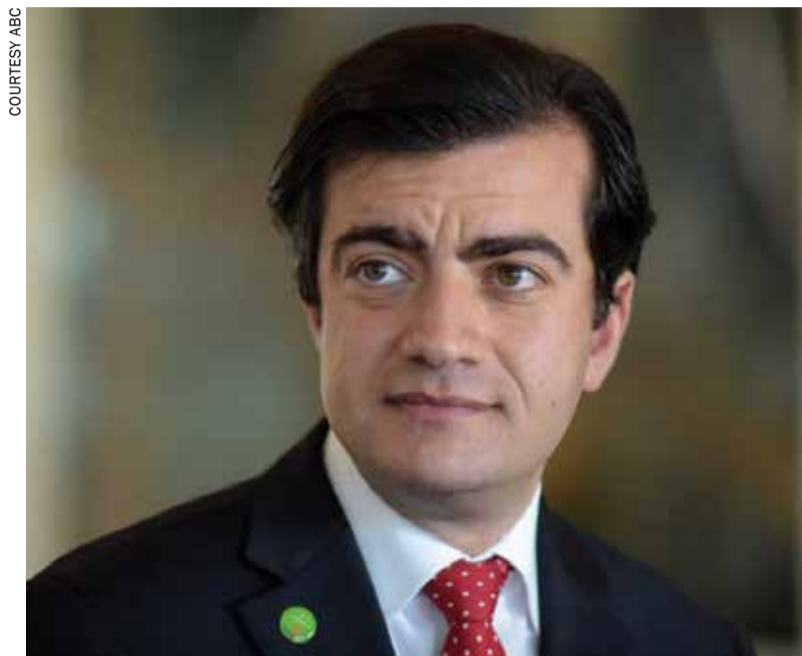
Australian Senator Sam Dastyari had been deputy whip in the Labor Party