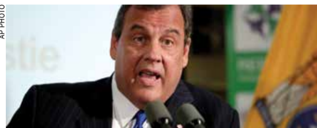
Christie speaks during a news conference

New Jersey then took a less direct approach by exempting racetracks and Atlantic City casinos from its gambling prohibition but not explicitly authorizing wagering or setting up a new regulatory system. A Philadelphia-based federal appeals court voted 10-2 to strike down that law as well, siding with the leagues and the federal government, then controlled by the Obama administration. Bloomberg