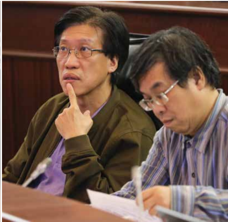
Au Kam San (left) and Ng Kuok Cheong