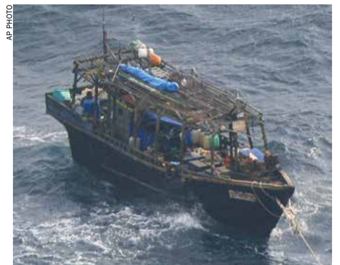
A wooden boat is seen off Matsumae town, Hokkaido, northern Japan

In Akita on Monday, officials found eight bodies inside a ragged wooden boat believed to be