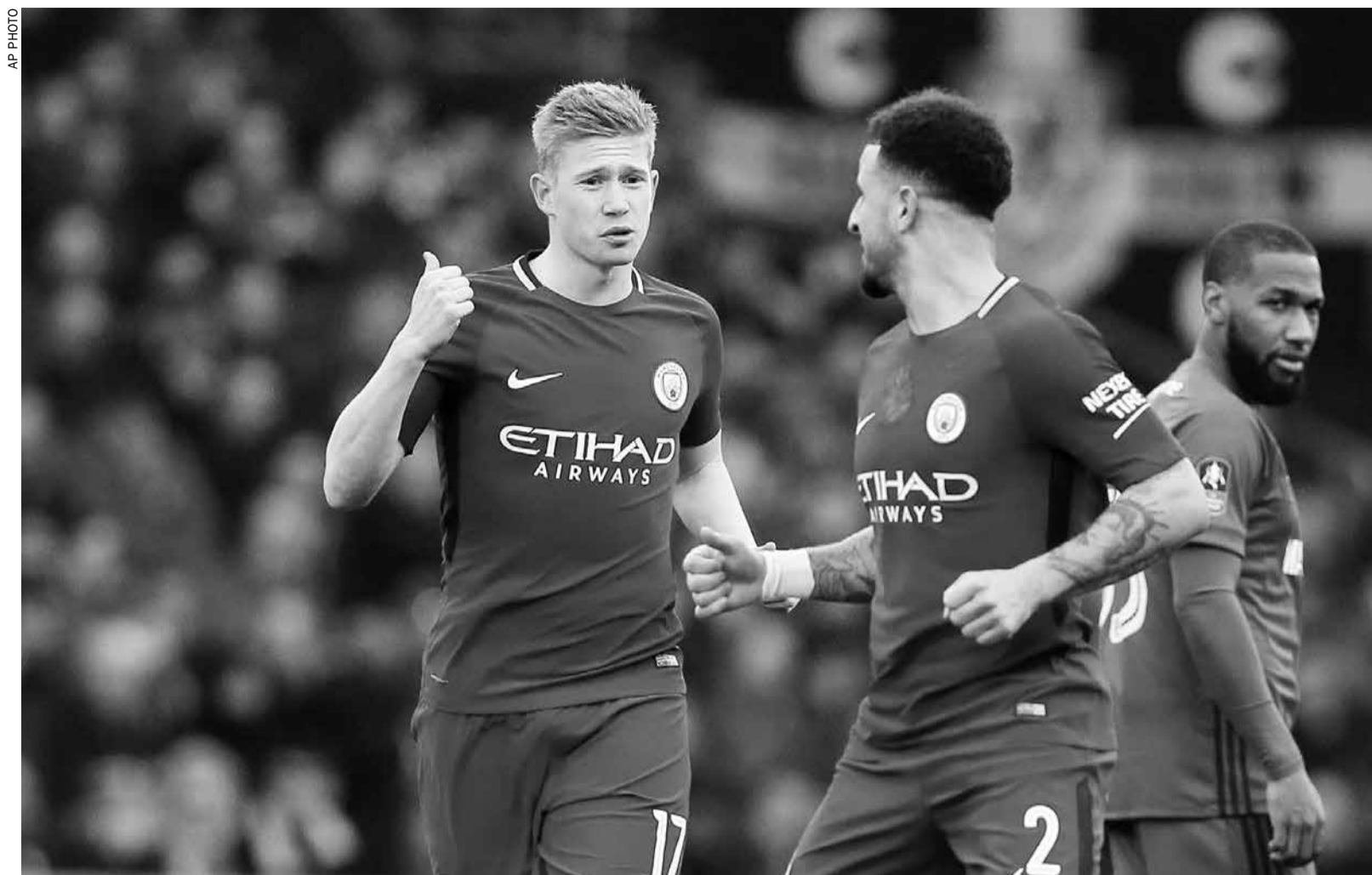
Manchester City's Kevin De Bruyne (left) gestures to teammate Kyle Walker after scoring