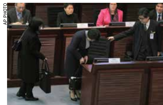
Hong Kong Secretary of Justice Teresa Cheng (center) bows before a question-and-answer session at the LegCo yesterday