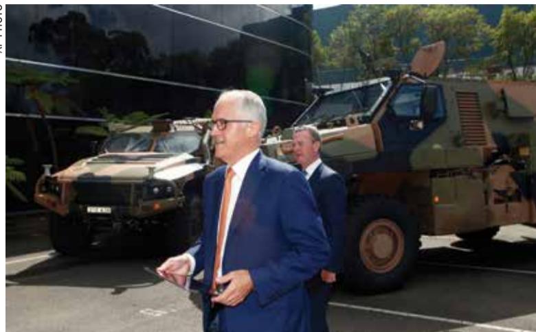
Australia Prime Minister Malcolm Turnbull walks in front of military trucks

Turnbull said the strategy was about creating hi-tech Australian jobs and not a response to any national threat, such as increasing tensions and the Chinese military build-up in the South China Sea over competing territorial claims.