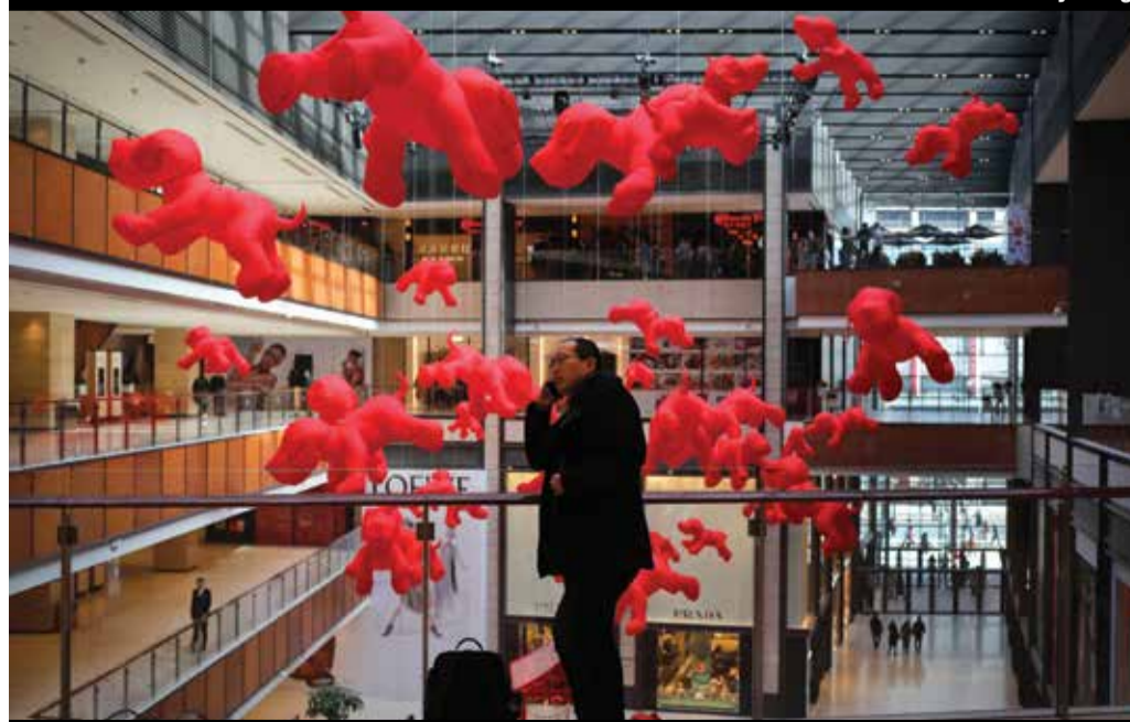
The Year of the Dog. Inflatable dog figures on display at a newly opened shopping mall in Beijing as CNY celebrations near.