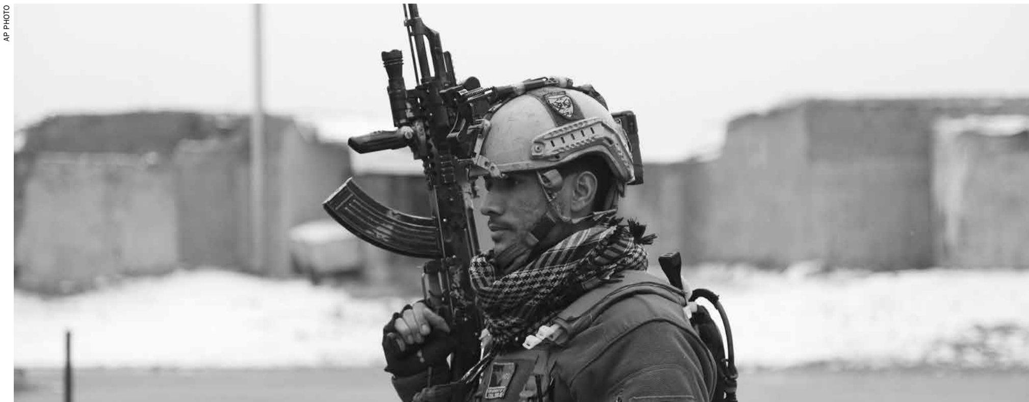
A member of Afghan security personnel arrives at the site of an attack at a military academy in Kabul

I SLAMIC State militants attacked Afghan soldiers guarding a military academy in the capital of Kabul yesterday, killing at least 11 troops and wounding 16.