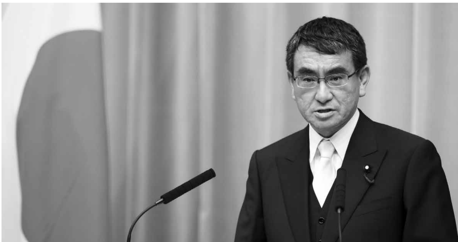
Taro Kono, newly-appointed foreign minister of Japan