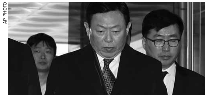
Shin Dong-bin (center), a son of Lotte's founder

Lee's release fueled a public outcry and anger toward the perceived soft treatment of business elites