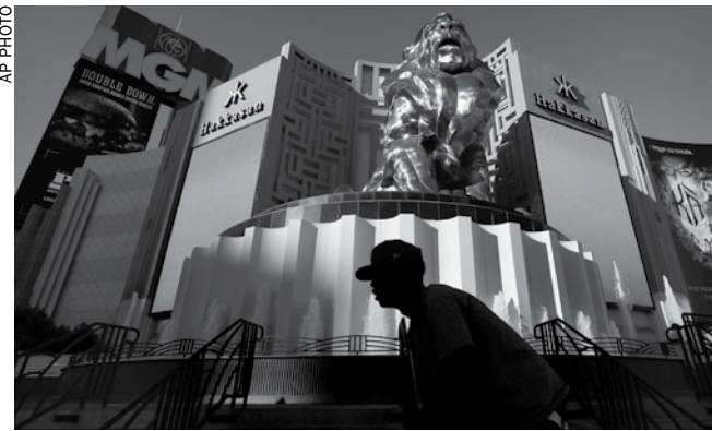
MGM Resorts International reported fourth-quarter net income of USD1.4 billion

The reporting period started on October 1, the same day a high-stakes gambler killed 58 people and injured hundreds more after he shattered the windows of his suite on the 32nd floor of the Mandalay Bay and unleashed gunfire on a coun-