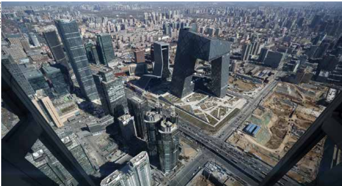
The central business district of Beijing