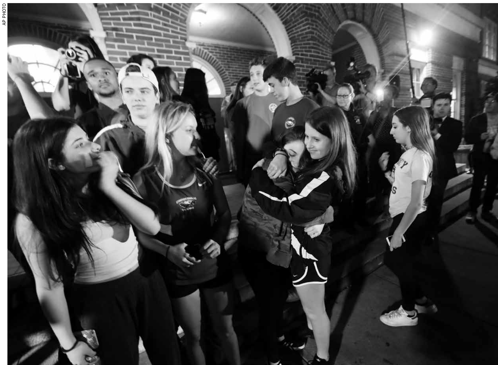
Student survivors from Marjory Stoneman Douglas High School, where 17 students and faculty were killed in a mass shooting