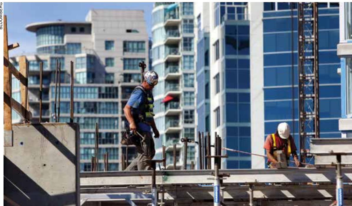
Downtown Vancouver, Canada