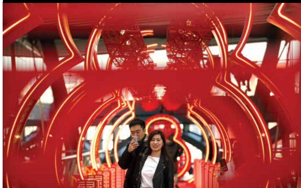
CNY selfie. A man takes a smartphone photo of a woman at a display to celebrate the Lunar New Year at an upscale shopping mall in Beijing yesterday.