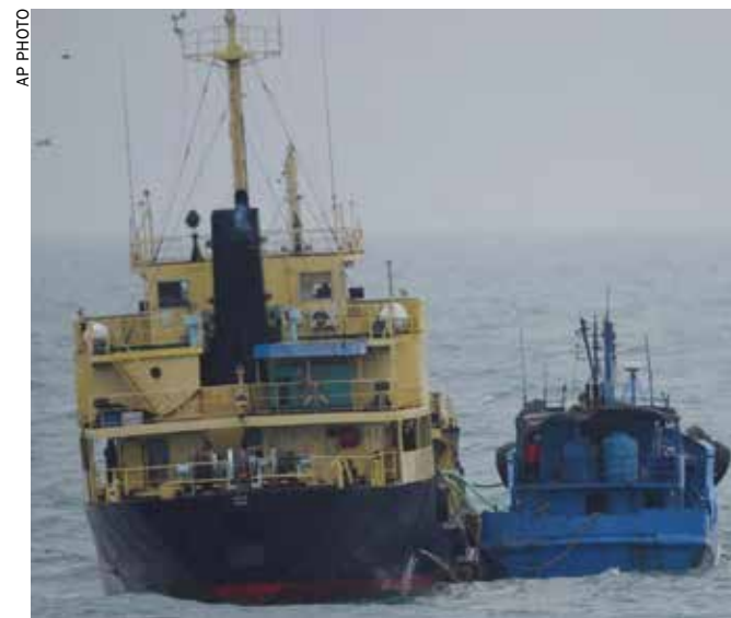
North Korean-flagged tanker Yu Jong 2 (left) and Min Ning De You 078 lying alongside in the East China Sea

The Foreign Ministry said Japan had notified the U.N. Security Council of the transfer. AP