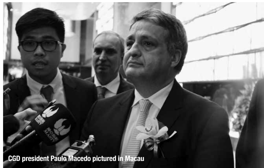
CGD president Paulo Macedo pictured in Macau