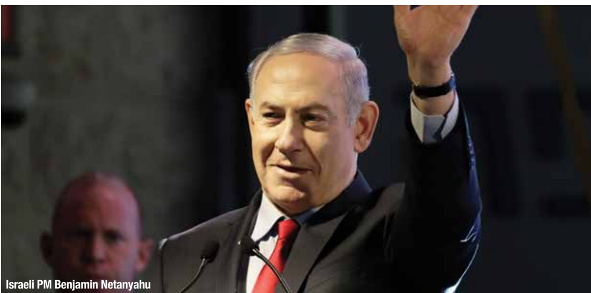
Israeli PM Benjamin Netanyahu

isn't the end. It isn't even the beginning of the end. But it cannot have a different end."