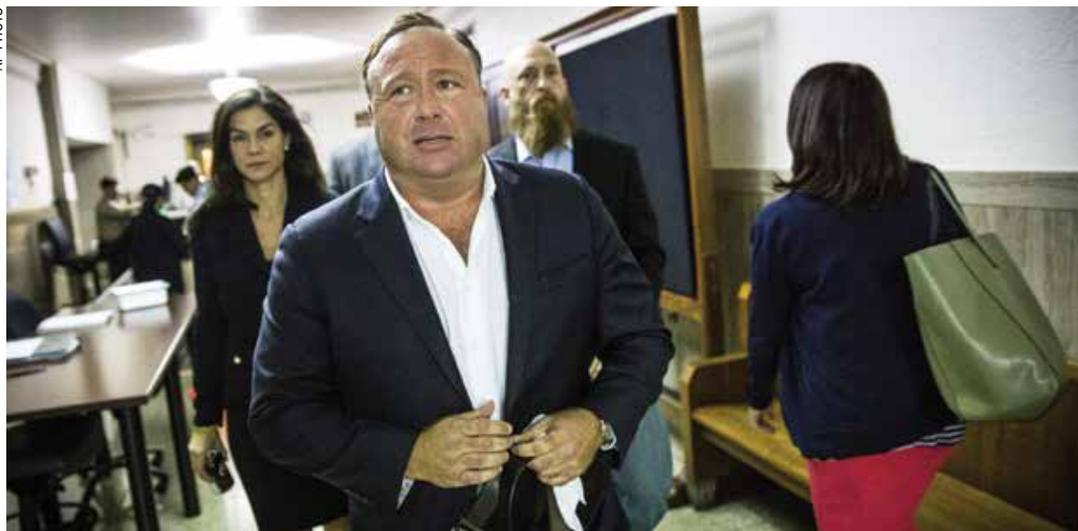
Infowars host Alex Jones

dation platform Taboola said it had disabled use of its technology to serve ads to Infowars via a third party distributor. Use of its technology to serve ads to Infowars was an "oversight" that