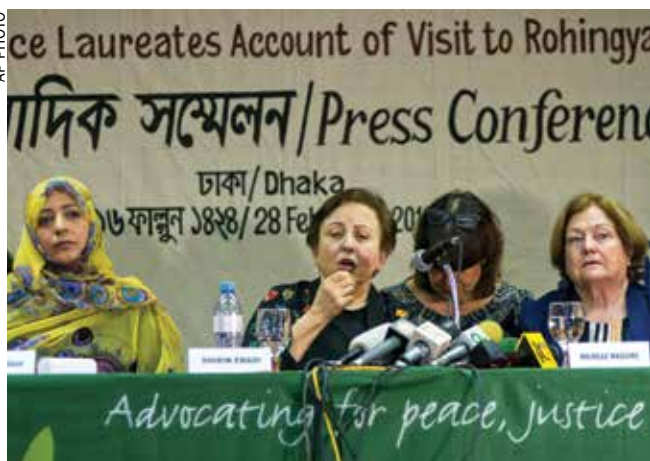
Nobel Peace laureates (from left) Yemen's Tawakkol Karman, Iran's Shirin Ebadi and Ireland's Mairead Maguire address a press conference after their visit to the Rohingya refugee camps in Dhaka

Her two colleagues — Northern Ireland's Mairead Maguire and Iran's Shirin Ebadi —