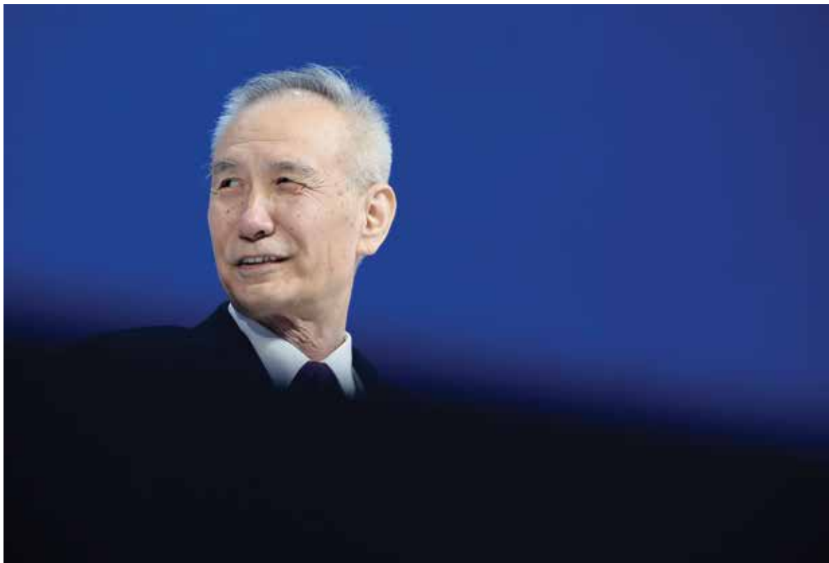
Rising star: Liu He, Xi's top economic policy adviser

the nation's ticking time bomb of debt - which stands at around 260 percent of output and growing - without derailing the economic expansion.