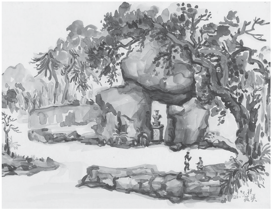
Pan Xiaoying (Poon Siu Yen)/ Jardim de Camões/1977