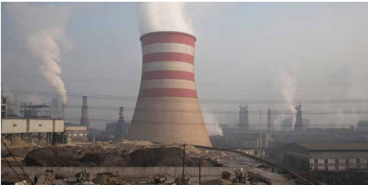
Smoke and steam spew from the sprawling complex that is a part of the Jiujiang steel and rolling mills in Qiana, Hebei province