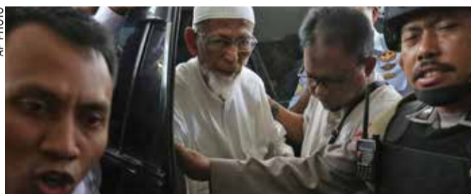
Ailing radical cleric Abu Bakar Bashir (center) arrives for medical treatment at an hospital in Jakarta

Defense Minister Ryamizard Ryacudu said on Thursday that the government plans to place Bashir under house arrest so he can be cared for by his family or transfer him to a prison near his hometown, Solo in Central Java, according to local media.