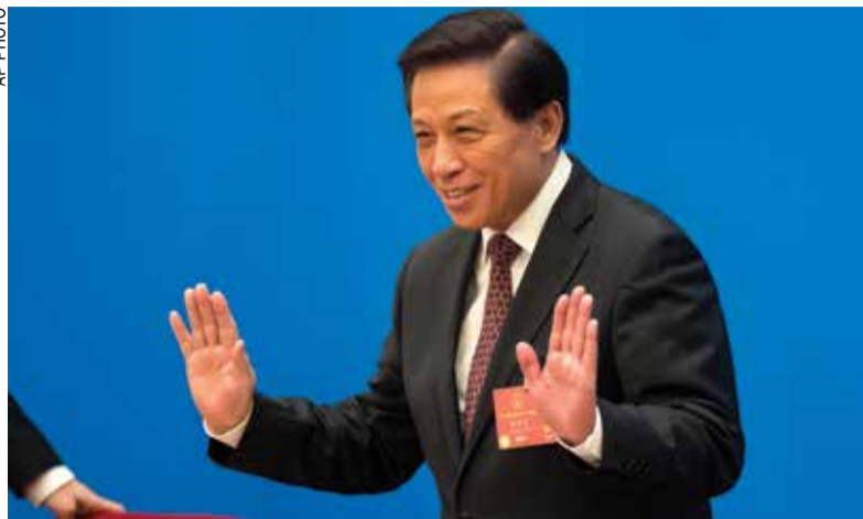
Zhang Yesui, a spokesman for the National People's Congress, arrives for a press conference on the eve of the annual legislature opening session