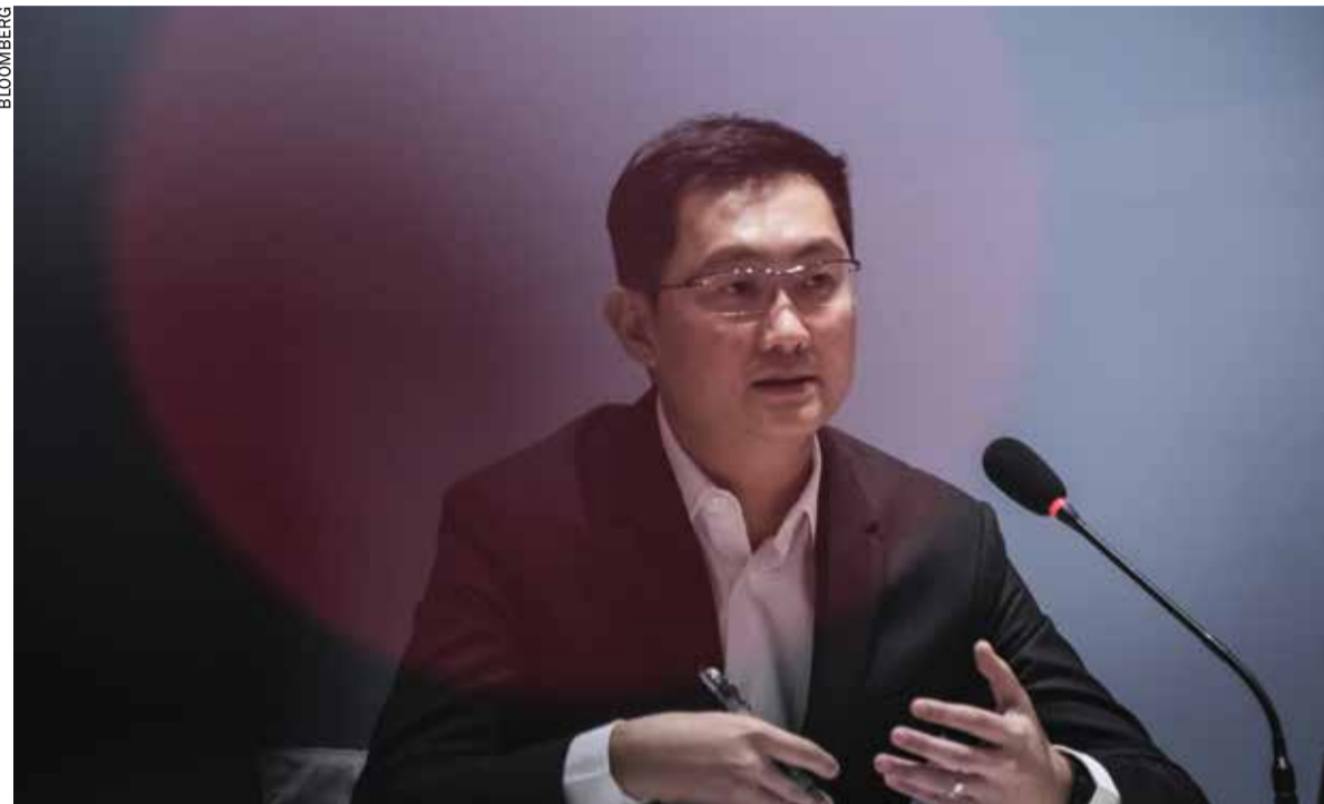
Tencent Chairman Ma Huateng

Kong, Macau and Guangdong province can be more like the multi-city San Francisco Bay technology hub in the U.S. if it gets easier to move around. Hong Kong and Macau have retained their own immigration policies since the British and Portuguese handovers in 1997 and 1999, respectively, and have busy border crossings with the mainland.