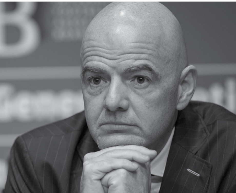
Fifa's president, Gianni Infantino, speaks during the press conference