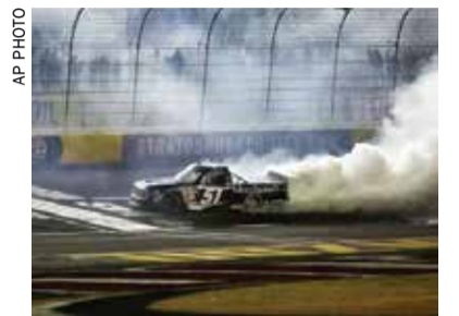
Kyle Busch celebrates after winning the NASCAR Truck Series auto race at Las Vegas Motor Speedway

"Hopefully we have a strong race, and if not, you know what you need to go back and work on to be better when you come back later in the year to benefit your playoff run," Larson added. "Not that this race when it was just a stand-alone event wasn't important, but anytime you can race at a track that you