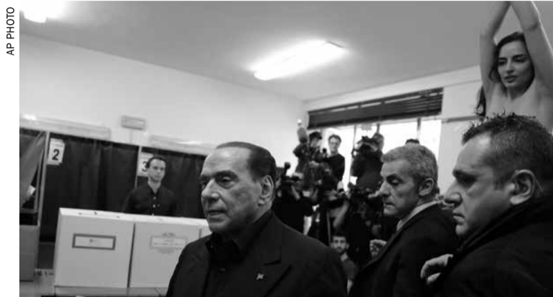
Italian former premier and leader of Forza Italia (Go Italy) party Silvio Berlusconi (left) arrives at a polling station as a bare-breasted woman protests in background

A hung parliament would trigger an extended period of horse-trading among the parties. Five Star leader Luigi Di Maio, 31, has vowed not to seek a coalition deal,