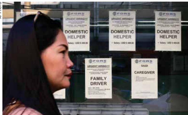
A woman passes help wanted signs outside a recruitment agency for jobs abroad, in Manila