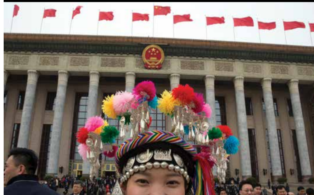
An ethnic minority delegate leaves from the Great Hall of the People on the eve of the annual legislature's opening session in Beijing.